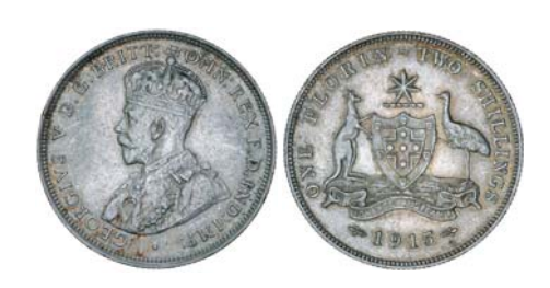
1517* George V, 1915. Toned, extremely fine.