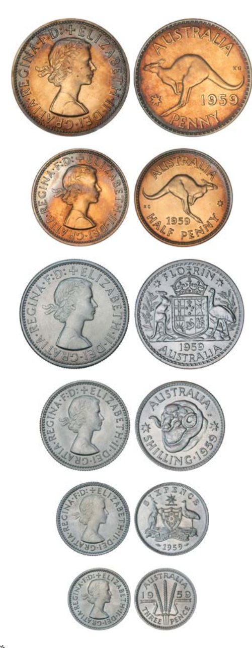
1461* Elizabeth II, Melbourne Mint proof set, 1959. FDC. (6) $1,650