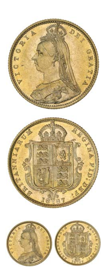
1402* Queen Victoria, Jubilee head, 1887 Melbourne (McD.33c). Choice uncirculated and rare in this condition, one of the finest known. $6,000