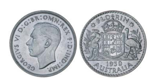
1555* George VI, 1939. Nearly uncirculated and very scarce thus.