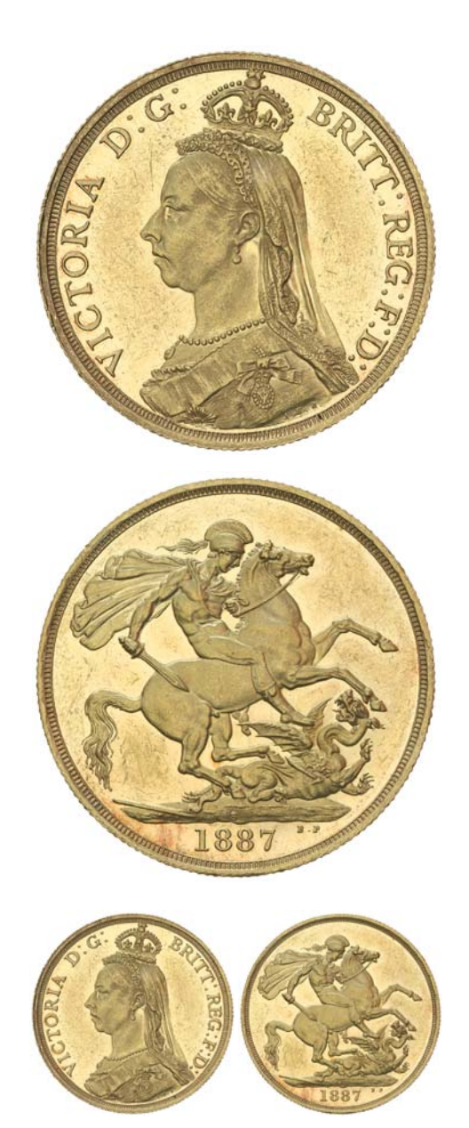
1436* Queen Victoria, Sydney Mint pattern or specimen two pounds, 1887. Fields scuffed on both sides, underlying brilliance, otherwise nearly uncirculated and extremely

Ex Spink Australia Sale 1 (lot 530, AHF Baldwin Collection) and Strathburn Collection, Spink Australia Sale 29 (lot 3096).