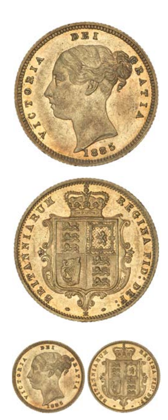
1399* Queen Victoria, 1885 Melbourne. Toned with mint bloom, good extremely fine/nearly uncirculated and rare.