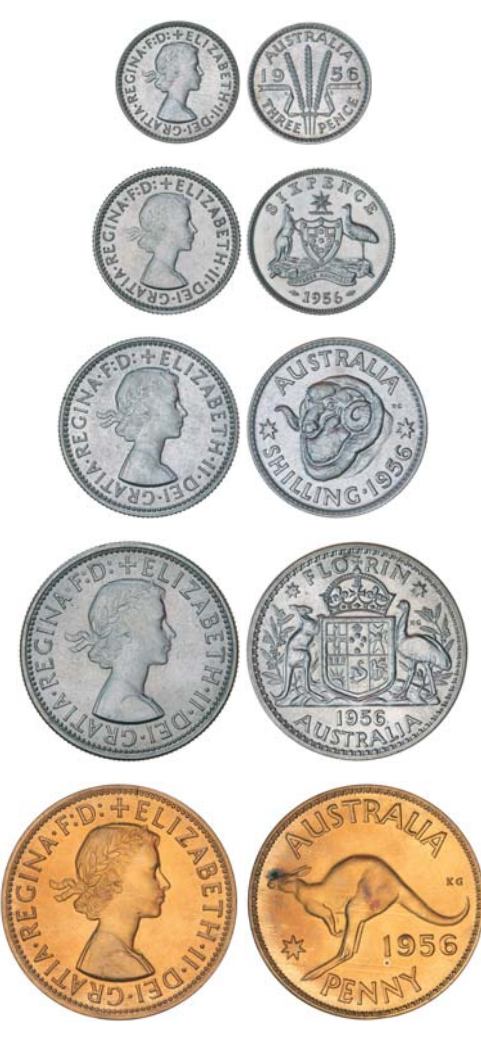
1447* Elizabeth II, Melbourne Mint proof set, 1956. FDC. (5) $1,400