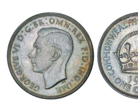
1506* George VI, 1938. Toned, uncirculated.