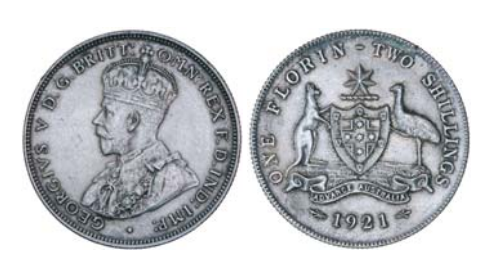
George V, 1921. Toned, reverse with edge knock at 2 o'clock, uncirculated. $2,000