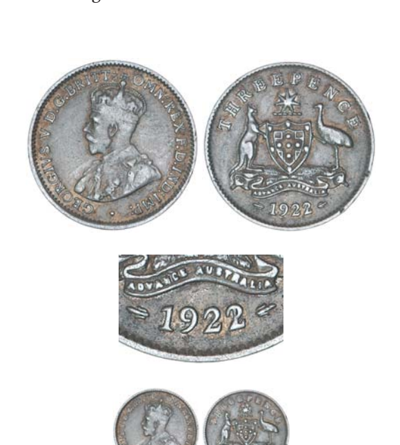
1606* George V, 1922/1 overdate. Good fine/nearly very fine and rare, especially in this condition, possibly the ninth or tenth finest known. $8,000