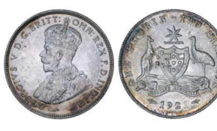
1524* George V, 1921. Lustrous, uncirculated.