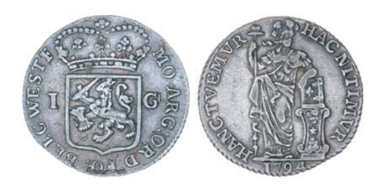
1295* Netherlands, Westfriesland, one gulden, 1794 (KM.97.5). Toned, nearly very fine.