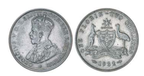
1537* George V, 1932. Nearly extremely fine.