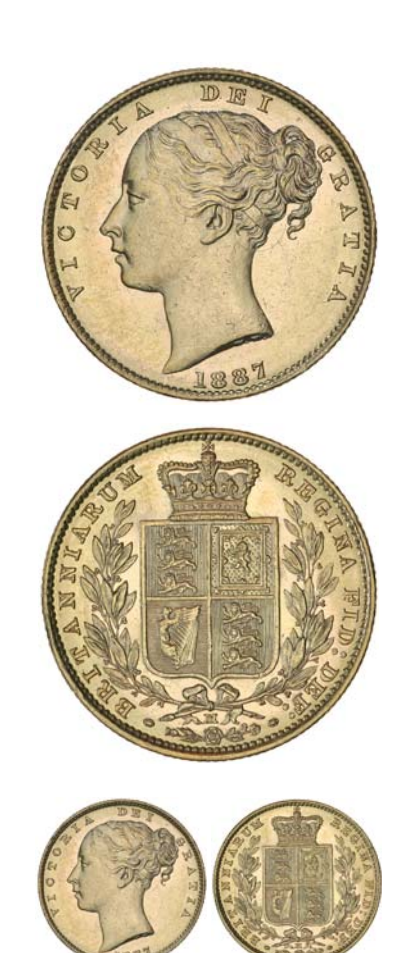
1350* Queen Victoria, 1887 Melbourne. Nearly uncirculated and very rare in this condition.