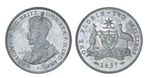
1548* George V, 1935. Uncirculated/choice uncirculated.