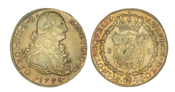
1296* Peru, Charles IIII, eight escudos, 1798IJ Lima (KM.101). Old red toning, good very fine.