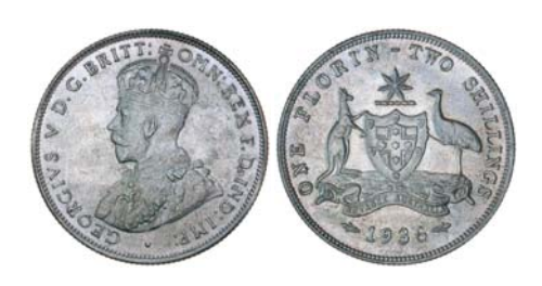
1552* George V, 1936. Uncirculated.