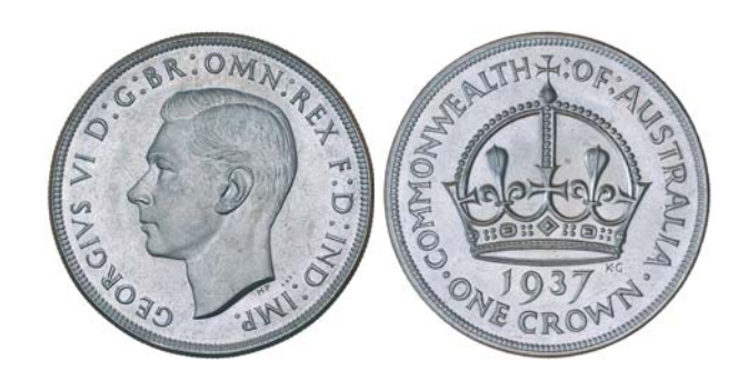
1503* George VI, 1937. Nearly uncirculated/uncirculated.