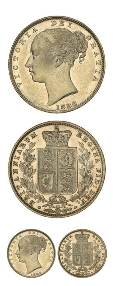
1349* Queen Victoria, 1886 Melbourne. Obverse minor contact marks, nearly extremely fine/good extremely fine and very rare.