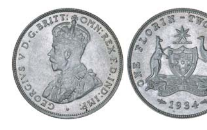
1540* George V, 1934. Uncirculated .