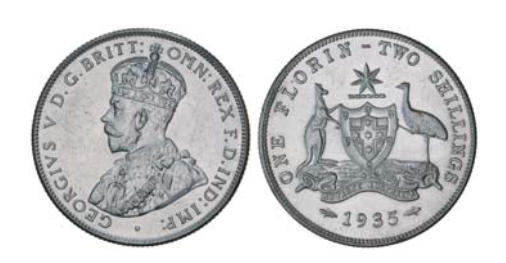
1549* George V, 1935. Cleaned, proof-like, brilliant, nearly uncirculated. $1,250