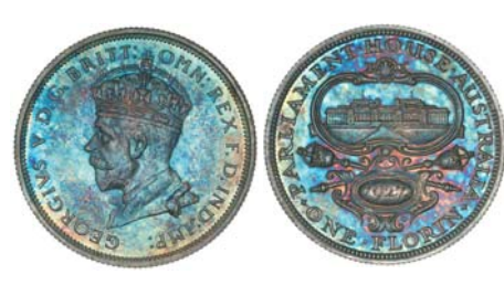
1438* George V, Melbourne Mint proof or specimen Canberra florin, 1927. Attractive dark iridescent tone both sides, nearly FDC and very rare.