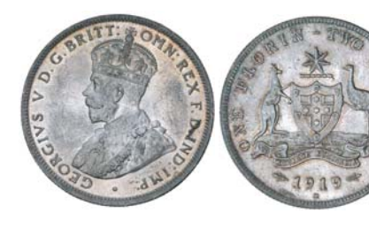
1523* George V, 1919M. Choice uncirculated.