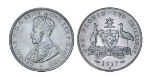
1520* George V, 1917M. Frosty mint bloom, uncirculated. $1,400