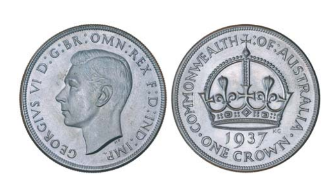
1502* George VI, 1937. Uncirculated.