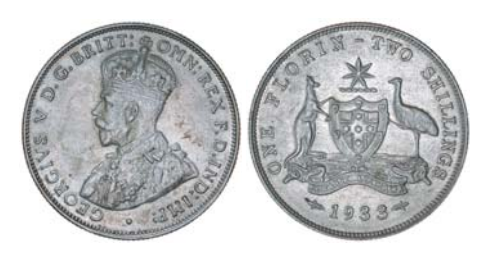
1539* George V, 1933. Good extremely fine.