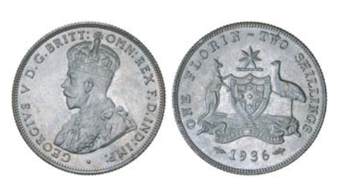
1551* George V, 1936. Uncirculated .