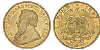
3776* South Africa, ZAR, pond, 1897 (KM.10.2). Weak on eagle's breast, otherwise nearly extremely fine.