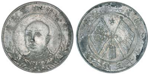
3888* China , Republic, Yunnan Province, silver fifty cents, undated (1917) obv. General T'ang Chi-yao facing, (KM.Y.479.1). Toned, extremely fine.