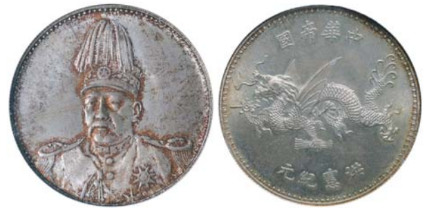
3895* China , Republic, silver dollar, not dated (1916), a commemorative issue to celebrate the inauguration of the Hung-hsien Regime, obv. bust of Hung-hsien in military uniform with plumed hat facing, rev. Winged dragon with bunch of arrows in left claw, and sceptre in the right claw, (KM.Y.332, Kann 663). Reddish brown toning on the obverse and light golden tone on the reverse, uncirculated and rare.