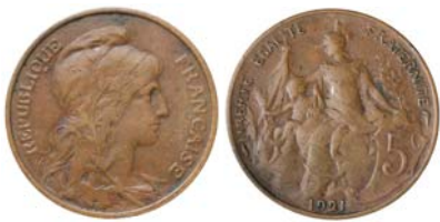
3919* France, Republic, bronze five centimes, 1921 (KM.842). The key date, fine and very rare. $1,000