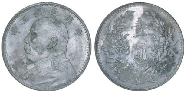
3891* China , Republic, general issue, Yuan Shih-kai silver dollar, year 3, (KM.Y.329). Minor surface marks, brilliant, about uncirculated.