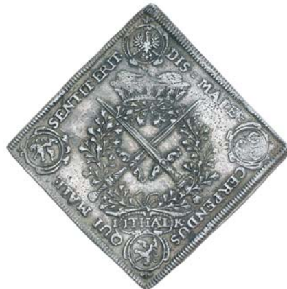
3924* Germany, Saxony, silver klippe thaler, 1693, issue of Johann Georg IV (1691-94) (KM.642; Dav.7649). Good very fine and rare. $700