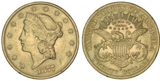
3839* USA, twenty dollars or double eagle, 1877S, Liberty head. Obverse surface marks, otherwise nearly extremely fine. $1,600