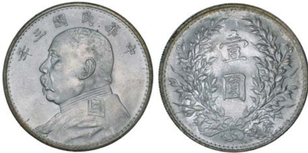
3894 China , Republic, general issue, Yuan Shih-kai silver dollars, Yr 3 (1914) (KM.329) (7), Yr 9 (1920) (KM.329.6). One cleaned, fine - very fine. (8)