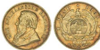
3773* South Africa, ZAR, pond, 1894 (KM.10.2). Toned, good very fine.