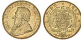
3777* South Africa, ZAR, pond, 1898 (KM.10.2). Nearly uncirculated.