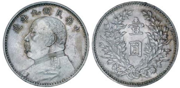
3892* China , Republic, general issue, Yuan Shih-kai silver dollar, year 9, (KM.Y.329.6). Minor surface marks, lightly toned, otherwise extremely fine or better.