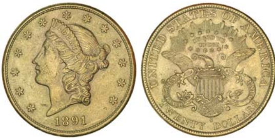
3840* USA, twenty dollars or double eagle, 1891S, Liberty head. Obverse surface marks, otherwise nearly extremely fine. $1,600