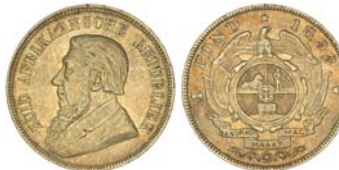
3772* South Africa, ZAR, pond, 1893 (KM.10.2). Very fine.