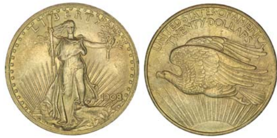
3843* USA, twenty dollars or double eagle, 1908, St. Gaudens, without motto. Nearly uncirculated. $1,700