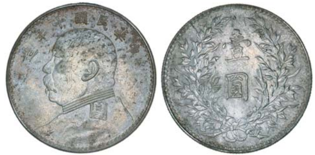
3893* China , Republic, general issue, Yuan Shih-kai silver dollar, year 10, (KM.Y.329.6). Minor surface marks, lightly toned, otherwise extremely fine or better.