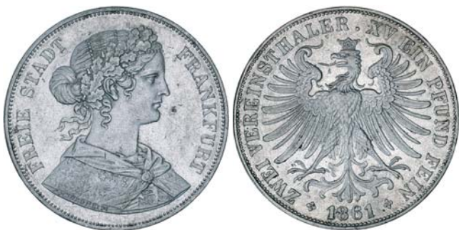
3921* Germany, Frankfurt am Main, two thaler, 1861 (KM.365). Nearly extremely fine/extremely fine. $100