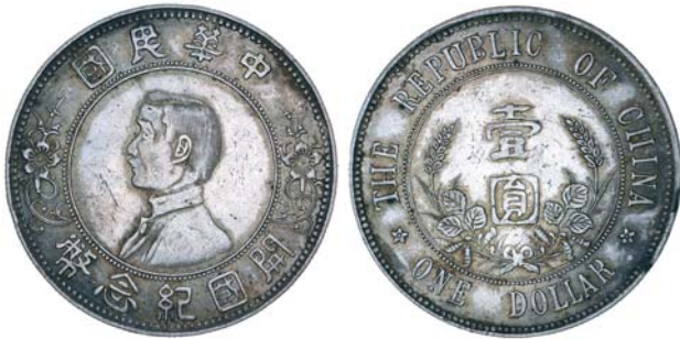
3889* China , Republic, general issue, Sun Yat-sen silver dollar, (1912), The Republic of China, One Dollar, (KM.Y.319). Toned, minor marks, otherwise good very fine, scarce.