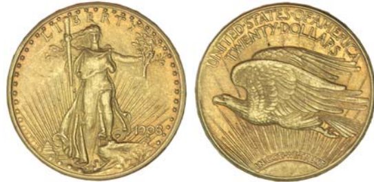
3844* USA, twenty dollars or double eagle, 1908, St. Gaudens, with motto. Nearly extremely fine. $1,600