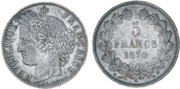
3918* France, Third Republic, five francs, 1870K (KM.818.3). Very fine and rare. $1,500

The engraver's initials A.E. instead of E.A. in error.