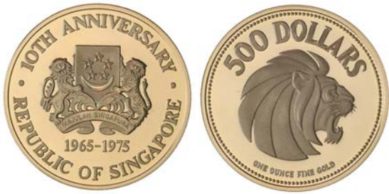
3768* Singapore, proof five hundred dollars, 1975 10th Anniversary of Independence (KM.14). FDC.