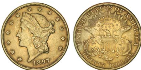
3842* USA, twenty dollars or double eagle, 1897S, Liberty head. Toned, good very fine. $1,600