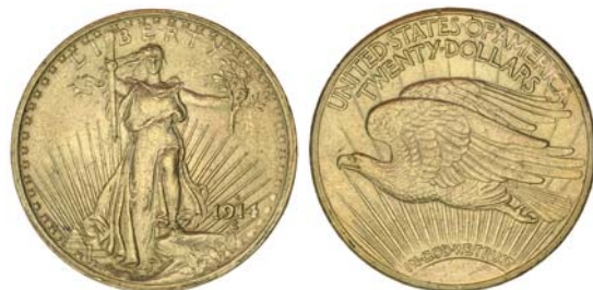
3845* USA, twenty dollars or double eagle, 1914S, St. Gaudens. Nearly uncirculated. $1,700