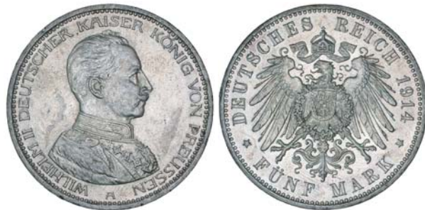
3923* Germany, Prussia, Wilhelm II, five mark, 1914A (KM.536). Good extremely fine/uncirculated. $80

The engraver's initials A.E. instead of E.A. in error.