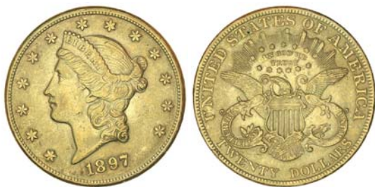
3841* USA, twenty dollars or double eagle, 1897, Liberty head. Good very fine. $1,500