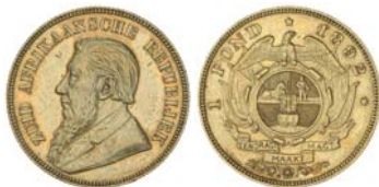
3770* South Africa, ZAR, pond 1892, double shaft (KM.10.1). Extremely fine and rare in this condition.