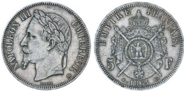
3917* France, Napoleon III, five francs, 1865BB (KM.799.2). Toned, good very fine and very scarce. $900