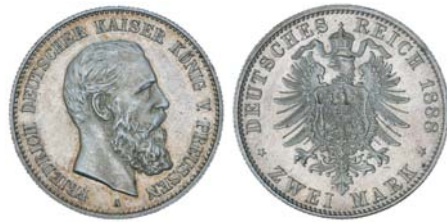
3922* Germany, Prussia, Friedrich III, proof-like two mark, 1888A (KM.510). Uncirculated. $70