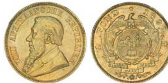
3771* South Africa, ZAR, pond 1892, single shaft (KM.10.2). Has been removed from a mount, otherwise very fine and rare.