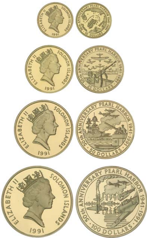
3769* Solomon Islands, Elizabeth II, four coin proof set 100, 50, 25 and 10 dollars 1991 (50th Anniversary of Pearl Harbour) (KM.PS8). In case of issue with certificate 461, FDC.