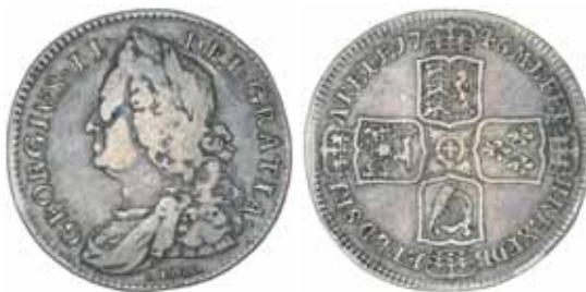
1779* George II , halfcrown, old head, 1746 Lima (S.3695A). Fine/good fine.

Ex Noble Numismatics Sale 82 (lot 1739) and previously from Spink Australia November 21, 1983.