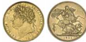
1644* George IV , laureate head, sovereign, 1821 (S.3800). Some minor edge nicks, otherwise good very fine.