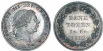
1825* George III , Bank of England, silver token, proof eighteenpence, laureate head, 1812 (S.3772; ESC 973). Milky grey and iridescent tone on brilliant fields, FDC and scarce.