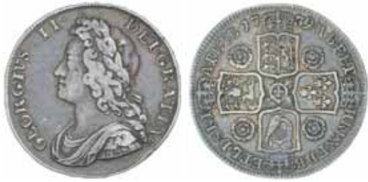
1777* George II , halfcrown, young head, 1739 roses (S.3693). Toned, fine/good fine.