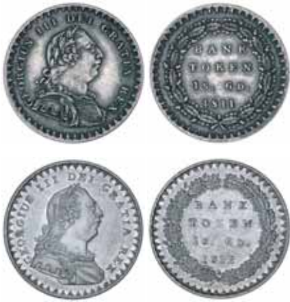
1823* George III , Bank of England, silver token, eighteenpence, draped and laureate bust, 1811 and 1812 (S.3771). Toned nearly extremely fine; extremely fine. (2)