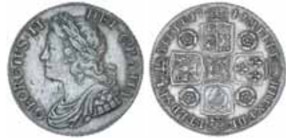
1782* George II , shilling, young head, 1741 roses (S.3701). Good very fine.