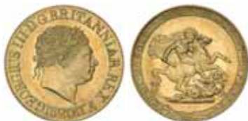
1641* George III , new coinage, sovereign, 1820, open '2' (S.3785C). Good extremely fine.