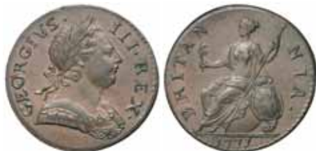
1826* George III , first issue, copper halfpenny, 1771 (S.3774). Well struck with attractive patina, nearly extremely fine/good extremely fine.

Ex Noble Numismatics Sale 83 (lot 1790).