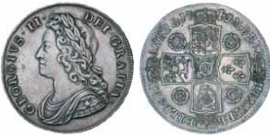
1778* George II , halfcrown, young head, 1741 roses (S.3693). Attractive toning, nearly extremely fine.