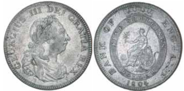
1820* George III , Bank of England, silver dollar or five shillings, 1804 (S.3768) leaf to centre of E. Nearly very fine.