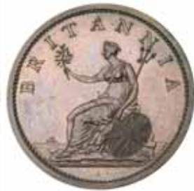
1835* George III , fourth issue, bronzed proof penny, 1806 (S.3750; Peck 1326). Nearly FDC.