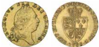
1639* George III , fifth bust or spade type, guinea, 1798 (S.3729). Removed from a mount, some surface marking, otherwise very fine.