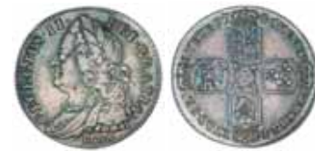
1786* George II , sixpence, old head, 1746 Lima (S.3710A). Toned, good very fine.