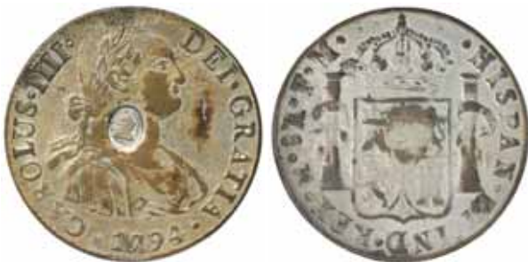
1818* George III , contemporary forgery of emergency issue George III oval countermark on Charles III Mexico eight reales, 1794FM, made of zinc washed copper. Very fine, rare and interesting.