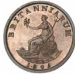
1834* George III , bronzed copper pattern halfpenny, 1805 (restrike Soho Mint issue) (Peck 1309). Nearly FDC and very scarce.