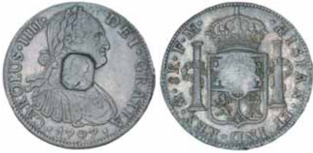
1816* George III , emergency issue, silver dollar (current for 4s 9d) with octagonal countermark on Charles III 1797 Mexico eight reales (S.3766). Toned, good very fine.