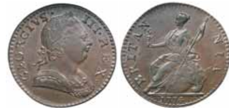
1829* George III , first issue, copper halfpenny, 1774 (S.3774). Brown with traces of red, softly struck on high points, nearly extremely fine/good extremely fine.