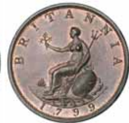
1833* George III , third issue, halfpenny, 1799 (S.3778; Peck 1258) five incuse gun ports. Brown and red, nearly uncirculated.