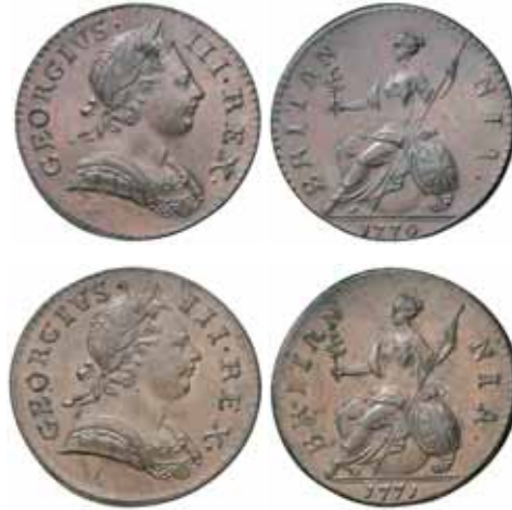
1827* George III , first issue, copper halfpennies, 1770 and 1771, ball below spear blade (S.3774). Nearly extremely fine. (2)