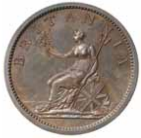
1836* George III , copper proof penny, fourth issue, 1806, plain edge (Peck 1350; S.3780) restruck by Soho Mint, Birmingham. Nearly FDC.