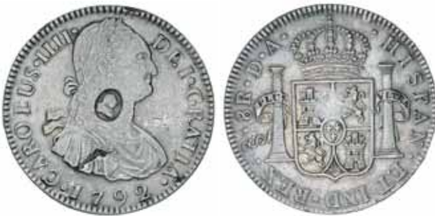
1817* George III , emergency issue, oval countermark dollar (S.3765A) false (?) countermark on silver plated 1792 eight reales of Chile, Santiago Mint, a contemporary counterfeit produced in Birmingham (?). Surface flaws, edge nicks, otherwise very fine and interesting.