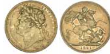
1643* George IV , laureate head, sovereign, 1821 (S.3800). Good fine.