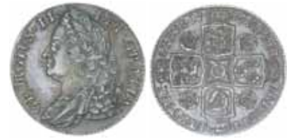
1784* George II , shilling, old head, 1745 roses (S.3702). Grey toned, extremely fine.