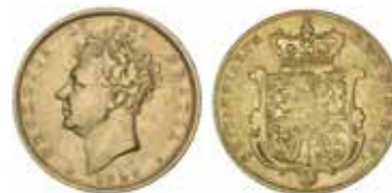
1646* George IV , bare head, sovereign, 1826 (S.3801). Fine.