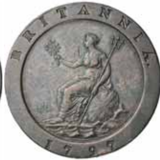
1832* George III , copper cartwheel twopence, 1797 (S.3776). Good very fine.