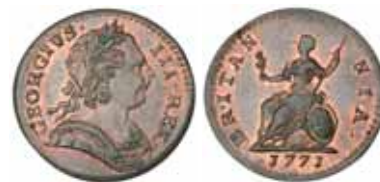
1830* George III , farthing, first issue, 1771, reverse A (S.3775; Peck 909) short 7 over longer 7 (as Cooke 365). Red and brown uncirculated and rare in this condition.