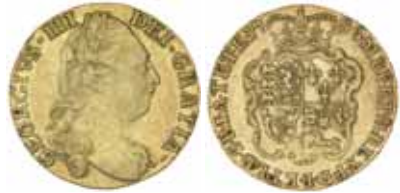
1638* George III , fourth bust, guinea, 1786 (S.3728). Nearly very fine.