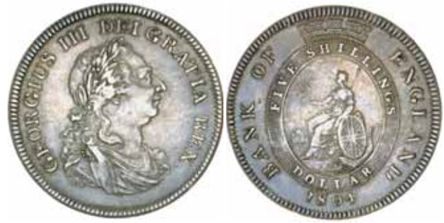
1819* George III , Bank of England, silver dollar or five shillings, 1804 (S.3768) top leaf to centre of E. Toned, good very fine.