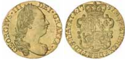
1637* George III , fourth bust, guinea, 1781 (S.3728). Extremely fine.