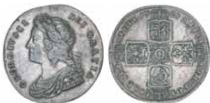
1781* George II , shilling, young head, 1728 (S.3699). Nearly very fine.