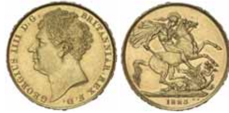
1642* George IV , bare head, two pounds, 1823 (S.3798). Nearly extremely fine.