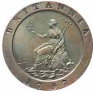
1831* George III , copper cartwheel twopence, 1797 (S.3776). Uncirculated with golden red and trace of blue patination, very scarce in this condition.