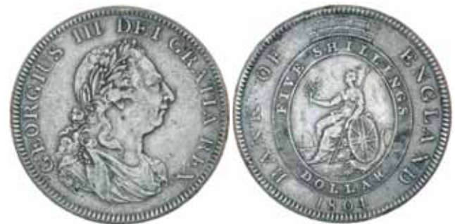
1821* George III , Bank of England, silver dollar or five shillings, 1804 (S.3768) overstruck on eight reales. Lightly toned, nearly very fine.