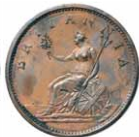
1837* George III , fourth issue, penny, 1807 (S.3780). Patchy stained tone, some mint bloom, good extremely fine.