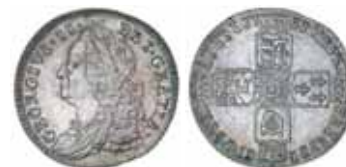
1788* George II , sixpence, old head, 1758/7 and D of DEI with stop (S.3711; ESC.1624A). Light blue and iridescent tone, nearly uncirculated and rare.