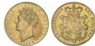
1647* George IV , bare head, half sovereign, 1828 (S.3804). Good very fine.