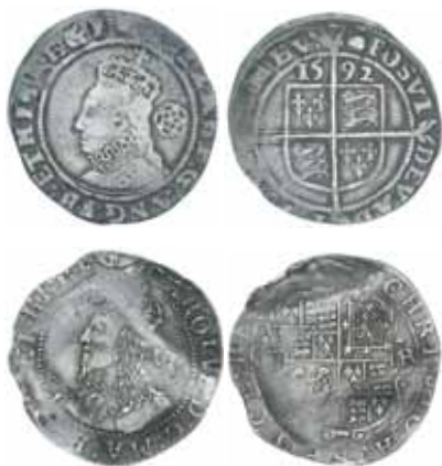
lot 1704 part