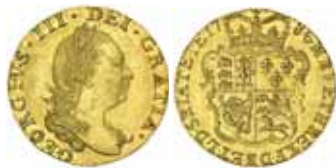
1640* George III , fourth bust, half guinea, 1786 (S.3734). Slight dent in left reverse field, otherwise extremely fine.