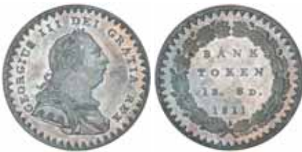
1824* George III , Bank of England, silver token, eighteen pence, 1811 (S.3771; ESC 969). Mint bloom, uncirculated.