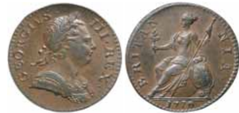
1828* George III , first issue, copper halfpenny, 1770 (S.3774). Date flawed, good very fine.