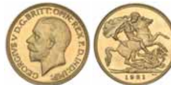
1441* George V, Melbourne Mint proof sovereign, small head, 1931M. FDC and excessively rare, the last sovereign struck in Australia. $60,000

Ex Museum Victoria duplicates, Spink Australia Sale 25 (lot 959) later private purchases from Winsor & Sons and Coinworks.