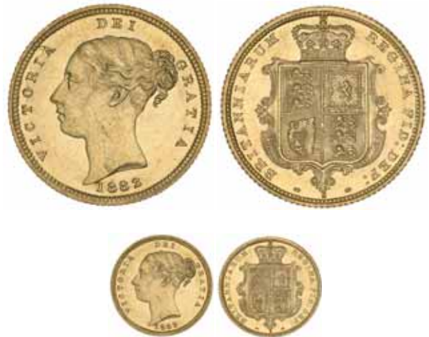
1413* Queen Victoria, 1882 Sydney. Hairline die breaks rim to A of Victoria and to second I, also vertically on cheek, minor obverse hairlines, otherwise full original mint bloom, choice uncirculated and extremely rare in this condition, one of the finest known. $24,000