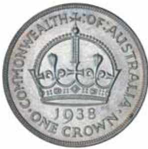
1484* George VI, 1938. Choice uncirculated and rare thus.