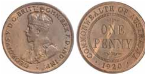
1558* George V , 1920 Indian die, dot above lower scroll. Well struck for this, red and brown uncirculated.