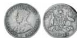
1544* George V, 1922/1 overdate. Overdate clear, reverse rim damage, otherwise very good and very rare.