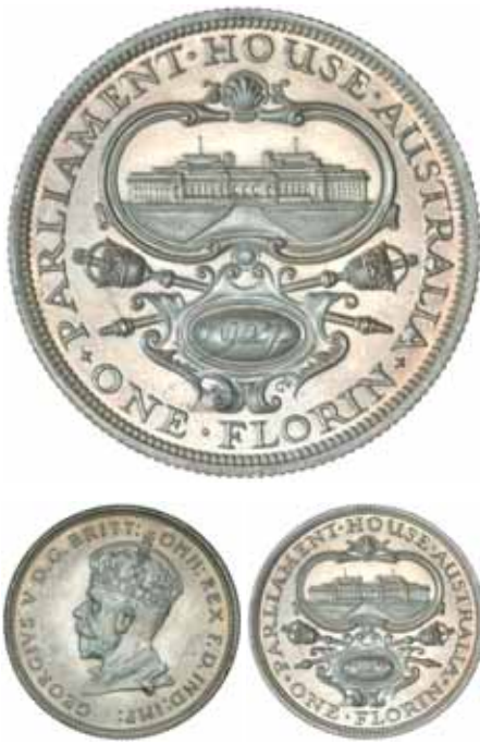
1449* George V , Melbourne Mint proof florin, 1927 Canberra commemorative. Practically FDC and very rare as a proof. $12,500

Ex Spink Australia privately in 1978 (from A.H.Baldwin stock).