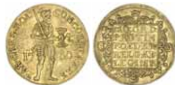
1289* Netherlands , Holland, gold ducat, 1780 (KM.12.3). Good very fine. $300