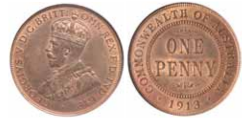
1552* George V, 1913. Nearly full original mint red reverse, uncirculated/choice uncirculated and rare in this condition, one of the finest known.