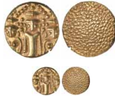
1279* India , Madras Presidency, gold pagoda (1740-1807), reverse grains (KM.304). Nearly extremely fine.