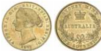
1319* Queen Victoria , second type, 1861. Good very fine.