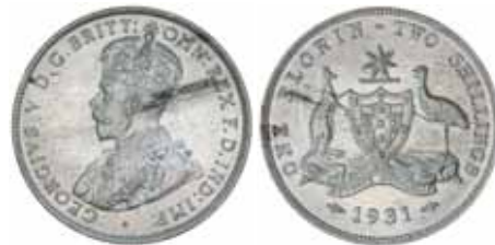
1500* George V, 1931. Full original mint bloom, slight carbon streak trace, otherwise choice uncirculated.