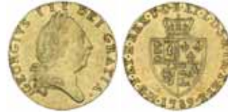
1269* Great Britain , George III, half guinea, fifth bust or spade type, 1789 (S.3735). Extremely fine. $500