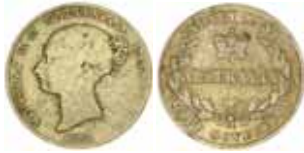
1331* Queen Victoria , first type, 1855. Evenly worn, very good and very rare.