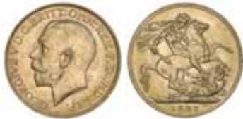
1407* George V, 1927 Perth. Good extremely fine/nearly uncirculated and scarce. $600