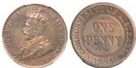
1450* George V , Melbourne Mint proof penny, 1935. Some toning, full underlying mint red, FDC and rare. $17,500

Ex Spink Australia privately in 1978 (from A.H.Baldwin stock).