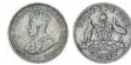
1542* George V, 1922/1 overdate. Old scratches, otherwise very good and very rare.