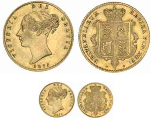
1411* Queen Victoria, 1871 Sydney. Good extremely fine and rare in this condition. $2,800