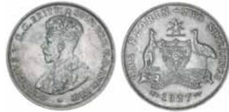
1498* George V, 1927. Attractive golden grey tone, uncirculated.