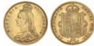
1419* Queen Victoria , Jubilee head, 1887 Sydney (McD.32). Good extremely fine. $750