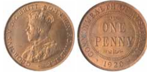
1557* George V , 1920 Indian die, dot above lower scroll. Well struck, dusty toning, red and brown uncirculated and rare in this condition.