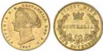
1317* Queen Victoria , second type, 1857. Nearly extremely fine.