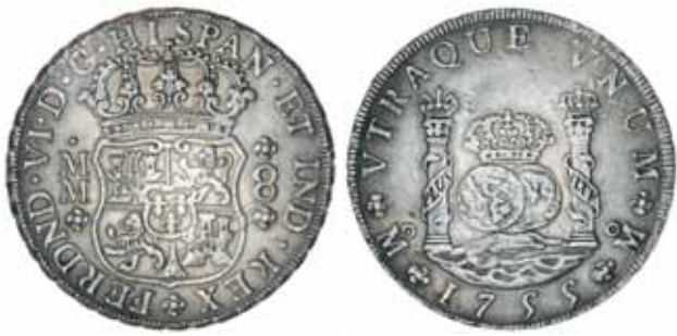
1283* Mexico , Ferdinand VI, eight reales 1755MM, Mexico City, pillar dollar type (KM.104.2). Nearly extremely fine. $250