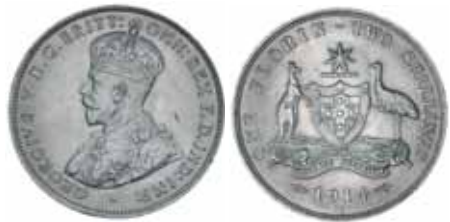
1489* George V, 1914H. Well struck, contact mark and hairline in right obverse field, has been rubbed, otherwise subdued mint bloom uncirculated and very rare in this condition. $7,500