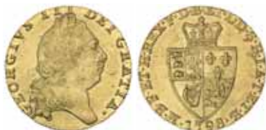
1267* Great Britain , George III, guinea, fifth bust or spade type, 1798 (S.3729). Nearly uncirculated. $900