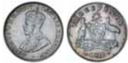
1536* George V, 1912. Toned, nearly uncirculated and rare.