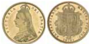
1421* Queen Victoria , 1891 Sydney, with JEB (McD.38). Choice brilliant bloom, nearly uncirculated and rare in this condition, one of the finest known. $1,500