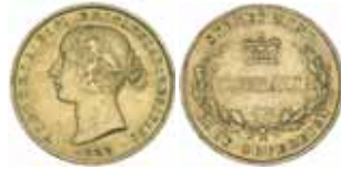
1336* Queen Victoria , second type, 1857. Good very fine.