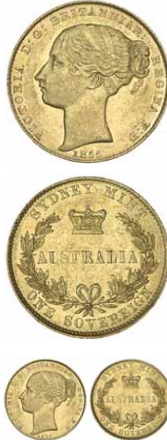
1313* Queen Victoria , first type, 1855, with filleted head of Victoria left by James Wyon. High rims, some mint bloom, good extremely fine and very rare as such, an outstanding type coin and Australia's first sovereign. $35,000

Private purchase from Sterling & Currency in 2008.