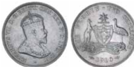
1487* Edward VII, 1910. Well struck, uncirculated.