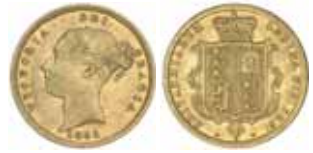
1415* Queen Victoria , 1883 Sydney (McD.25a). Good very fine. $500