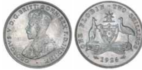
1497* George V, 1926. Nearly full original mint bloom, uncirculated and rare in this condition.