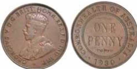
1567* George V , 1930 Indian die. Partial centre diamond, six clear pearls, old hairline scratch below edge, nearly very fine and rare.