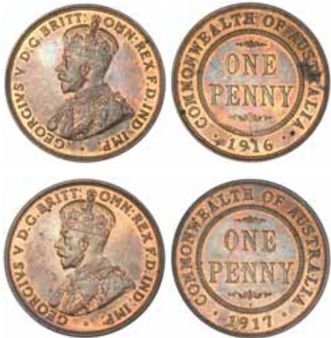
1555* George V , 1916I and 1917I. Brown and red, nearly uncirculated. (2)

Ex Noble Numismatics Sale 92 (lot 1668).