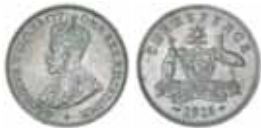
1537* George V, 1915. Dull tone, extremely fine and rare thus.