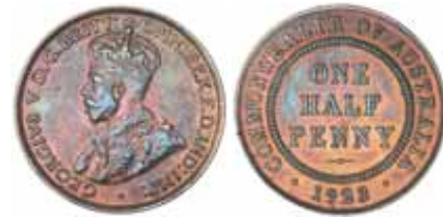
1584* George V, 1923. Peripheral die breaks both sides, eight pearls, has been cleaned and re-toning, otherwise nearly extremely fine and rare in this condition.