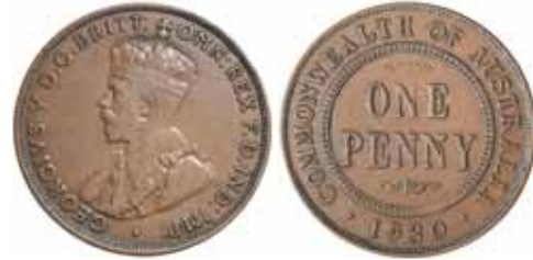
1568* George V , 1930 Indian die. Six pearls, partial centre diamond, glossy brown patina, good fine and rare.