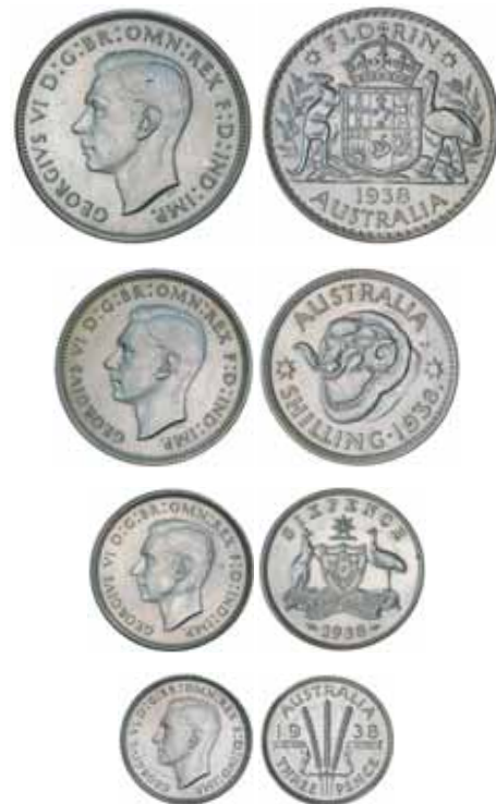
1452* George VI , Melbourne Mint proof set, florin, shilling, sixpence, threepence, penny and halfpenny, 1938. The bronze toned, a brilliant set, FDC and very rare. (6) $70,000