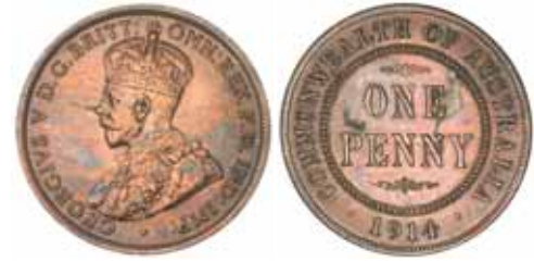
1551* George V, 1911 and 1914. Nearly uncirculated; good extremely fine. (2)