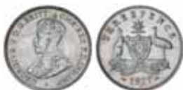
1539* George V, 1917M. Full mint bloom, choice uncirculated.