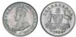
1548* George V, 1934. Uncirculated.