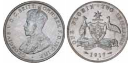
1491* George V, 1917M. Full original mint bloom, choice uncirculated. $1,200