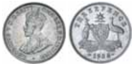
1547* George V, 1934/3 overdate. Good very fine.