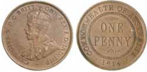
1554* George V , 1914. Brown with trace of faded red, good extremely fine.