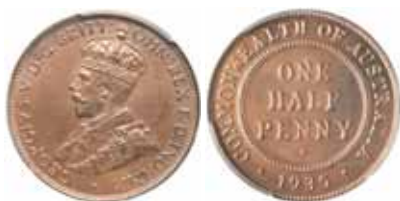
1451* George V , Melbourne Mint proof halfpenny, 1935. Full original mint red brilliance, FDC and rare. $22,500