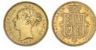
1418* Queen Victoria , young head, 1887 Sydney. Rubbed on obverse, good very fine/extremely fine. $500