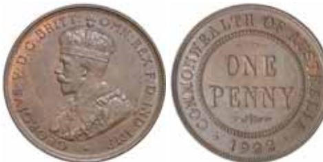
1560* George V , 1922, London die. Trace of red, full brown patina with underlying mint bloom, uncirculated.

Ex Noble Numismatics Sale 92 (lot 1671).