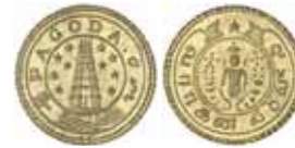
1280* India , Madras Presidency, gold pagoda (c1810) (KM.356). Good extremely fine.