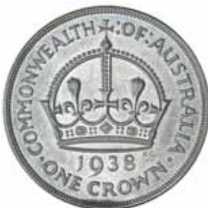
1485* George VI, 1938. Uncirculated.