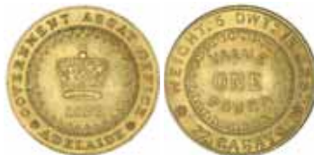
1311* Adelaide pound , 1852, second type with crenellated inner circle on the reverse. Later die state, considerable original mint bloom, nearly uncirculated and rare in this condition. $25,000

Private purchase from Monetarium in 2006.