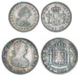
1285* Mexico , Charles III, half reale, 1774FM, Mexico City (KM.69.2); Charles III, reale, 1800FM, Mexico City (KM.81). Good extremely fine. (2) $120