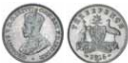
1538* George V, 1916M. Brilliant, nearly uncirculated.