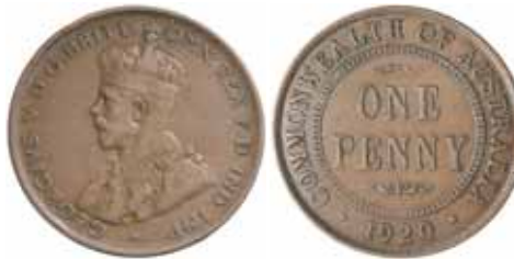
1559* George V , 1920 London die, dot above lower scroll. Fine and very rare.