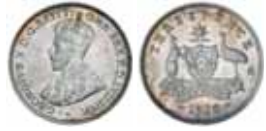
1546* George V, 1928. Toned, nearly uncirculated.