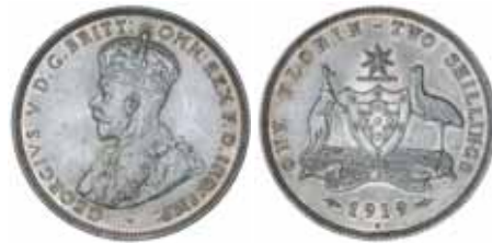
1493* George V, 1919M. Scuff behind head, otherwise nearly uncirculated. $1,000