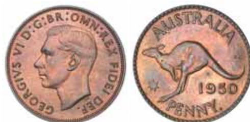
1453* George VI , Perth Mint proof penny, 1950. Light red brown and red toned, nearly FDC and very rare. $12,000