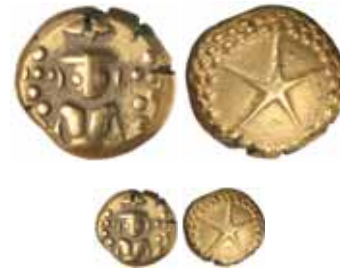
1278* India , Madras Presidency, gold star pagoda (1740-1807) (KM.303). Very fine.