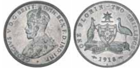
1492* George V, 1918M. Nearly uncirculated/uncirculated. $600