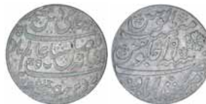
1282* India , Bengal Presidency, EIC, silver rupee (12.38g) Murshidabad type (1793) graining right (KM.98.1). Good very fine.