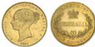
1332* Queen Victoria , first type, 1856. Scuff mark above nose, otherwise good extremely fine with underlying mint bloom, rare in this condition.