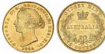
1318* Queen Victoria , second type, 1859. Considerable original mint bloom, uncirculated and rare in this condition, one of the finest known.