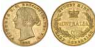
1335* Queen Victoria , second type, 1857, with wreathed head of Victoria left by L.C.Wyon. Toned, with underlying mint bloom, extremely fine and rare thus.