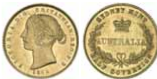
1338* Queen Victoria , second type, 1862. Choice uncirculated and very rare in this condition, one of the finest known.