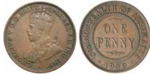
1570* George V , 1930 Indian die. Six pearls, brown patina, good fine and rare.

Ex Noble Numismatics Sale 92 (lot 1685).