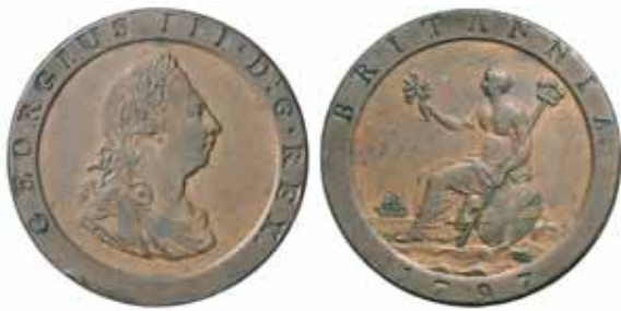
1273* Great Britain , George III, cartwheel penny, 1797 (S.3777). Red brown patina, good very fine.