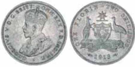
1488* George V, 1913. Lightly toned, good extremely fine with underlying mint bloom and rare in this condition. $1,600