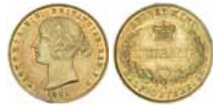
1337* Queen Victoria , second type, 1861. Good extremely fine and very rare in this condition, one of the finest known.