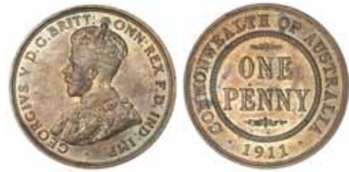
1550* George V, 1911. Mostly red, uncirculated.