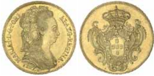
1263* Brazil , Maria, 6,400 reis or half 'Johanna', 1797R (KM.226.1). Good extremely fine. $1,000