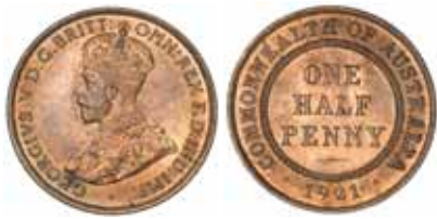
1580* George V, 1921. Mostly red, uncirculated.