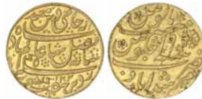
1281* India , Bengal Presidency, EIC mohur of the Murshidabad type (1793) (KM.103.1). Dull even tone, nearly extremely fine.