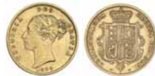
1412* Queen Victoria, 1879 Sydney. Good very fine. $500