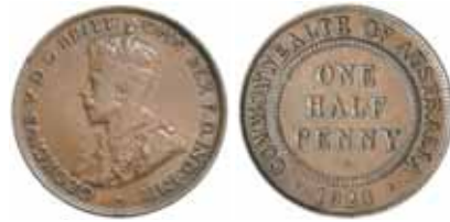
1583* George V, 1923. Brown patina, nearly very fine/very fine.