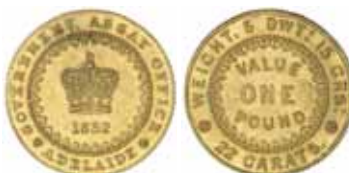
1312* Adelaide pound , 1852, second type with crenellated inner circle on the reverse. Early die state, surface marks, underlying brilliance, possibly has been mounted, extremely fine or better. $12,500