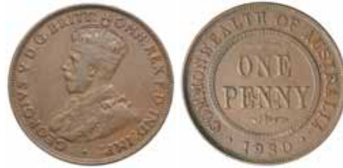
1569* George V , 1930, Indian die. Even brown patina, old contact marks in reverse field, overall an attractive fine and rare.