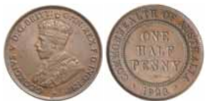
1582* George V, 1923. Diagnostic peripheral die break on reverse at 4 o'clock, glossy brown patina, nearly extremely fine and very rare in this condition.

Ex Noble Numismatics Sale 92 (lot 1724).