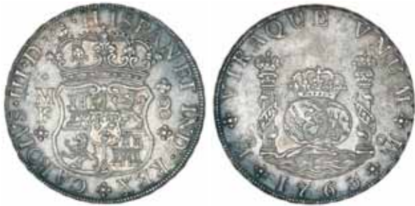
1284* Mexico , Charles III, pillar type, eight reales, Mexico City Mint, 1763MF (KM.105). Nearly extremely fine. $400

Ex Noble Numismatics Sale 75 (lot 1361).