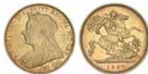
1423* Queen Victoria , 1896 Melbourne. Extremely fine. $550