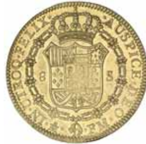
1288* Mexico , Charles III, eight escudos, 1797FM (KM.159). Underlying mint bloom, extremely fine/good extremely fine or nearly uncirculated. $1,500