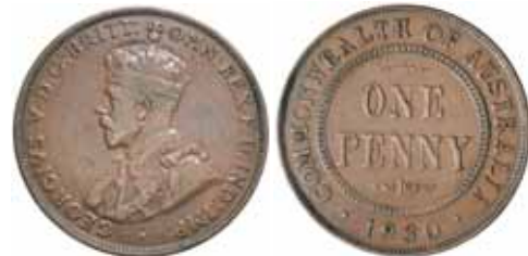
1571* George V , 1930 Indian die. Six pearls, good fine and rare.

Ex J.W.Winkley Collection, Noble Numismatics Sale 92 (lot 1686).