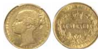
1314* Queen Victoria , first type, 1855. Nearly extremely fine and rare thus. $7,000

Private purchase from Sterling & Currency in 2008.