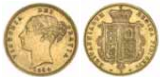
1416* Queen Victoria , 1884 Melbourne. Hairline marks in front of face and to rim, otherwise subdued mint bloom, nearly uncirculated and very rare in this condition. $15,000