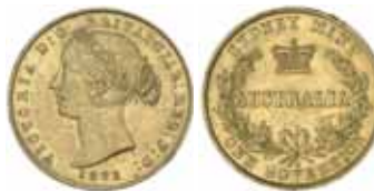
1320* Queen Victoria , second type, 1862. Surface marks, otherwise extremely fine and rare.