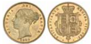
1417* Queen Victoria , 1886 Melbourne. Obverse contact marks, otherwise proof-like nearly uncirculated and rare in this condition. $3,500