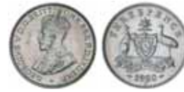
1540* George V, 1920M. Brilliance, specimen-like uncirculated.