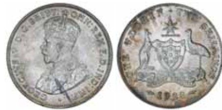
1499* George V, 1928. Full original frosty and pearl-like mint bloom, with some toning, choice uncirculated and rare thus.