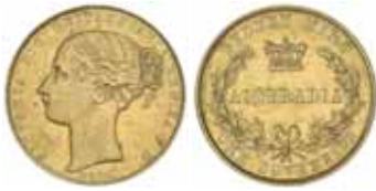
1315* Queen Victoria , first type, 1855. Minor surface marks, otherwise good very fine.