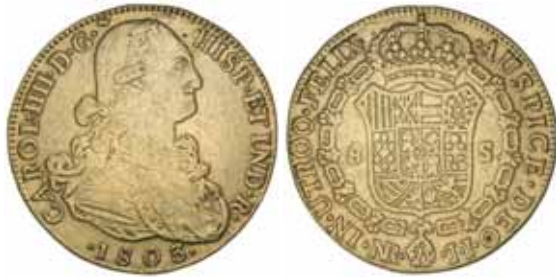
1264* Colombia , Charles III, eight escudos, Nuevo Reino Mint, 1803JJ (KM.62.1). Fine. $1,000