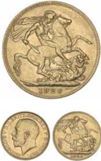
1406* George V, 1926 Perth. Extremely fine and very scarce. $1,200