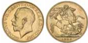
1408* George V, 1928 Perth. Nearly uncirculated. (2) $700