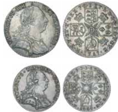
1270* Great Britain , George III, shilling and sixpence, 1787 (S.3746, 3749). Nearly extremely fine. (2) $150