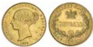
1333* Queen Victoria , first type, 1856. Good extremely fine and rare in this condition.