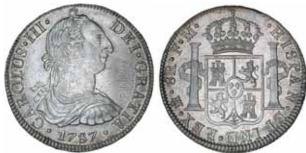
1286* Mexico , Charles III, eight reales, Mexico City Mint, 1787FM (KM.106.2a). Good extremely fine. $300

Ex Noble Numismatics Sale 92 (lot 2776).