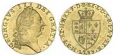
1265* Great Britain , George III, guinea, fifth bust or spade type, 1788 (S.3729). Nearly uncirculated. $1,000