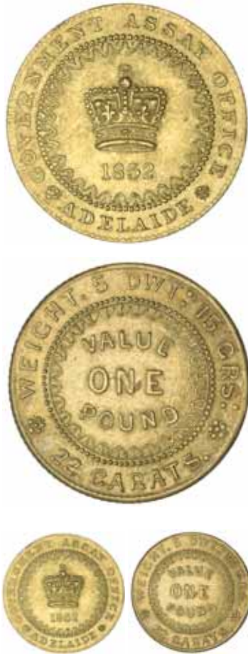
1310* Adelaide pound , second type, 1852, with crenellated inner circle on the reverse. Later die state, some original mint bloom, nearly uncirculated and rare in this condition. $35,000

Private purchase from Monetarium in 2006.