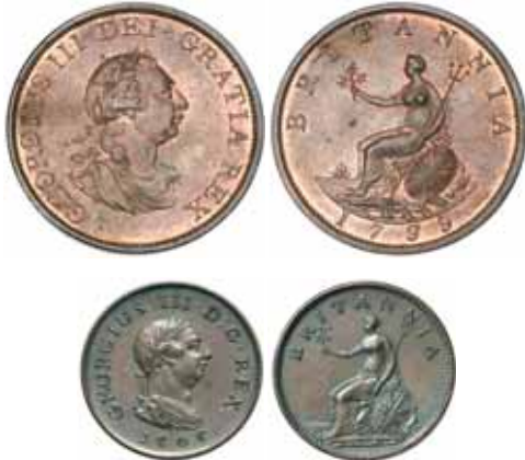
1274* Great Britain , George III, third issue, halfpenny, 1799 (S.3778); fourth issue, farthing, 1806 (S.3782) K on truncation. Brown and red, good extremely fine; brown, good extremely fine. (2)