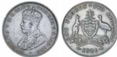
1494* George V, 1921. Well struck, deeply toned with a matte surface, good extremely fine and rare thus. $600