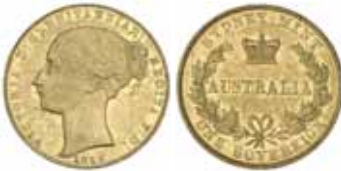
1316* Queen Victoria , first type, 1856. Surface marks, some mint bloom in devices and lettering, extremely fine or better and rare in this condition for this date.