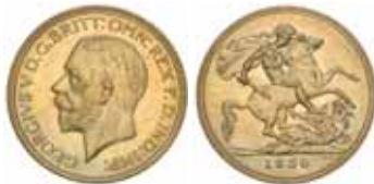
1409* George V, small head, 1930 Melbourne. Uncirculated and scarce. $500