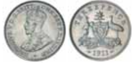
1534* George V, 1911. Uncirculated.