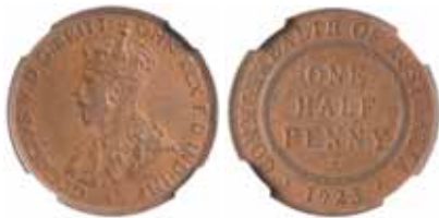
1581* George V, 1923. Peripheral die breaks both sides, even brown patina with undisturbed fields, nearly uncirculated and very rare in this condition.