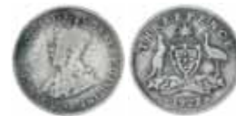
1543* George V, 1922/1 overdate. Good/very good and rare.