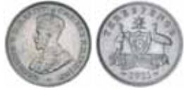
1535* George V, 1911. Good extremely fine/nearly uncirculated.