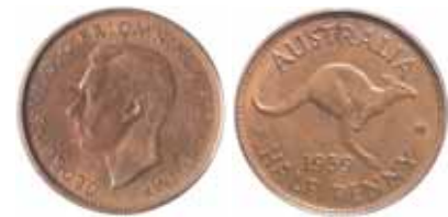
1586* George VI, 1939 kangaroo reverse. Red and brown toned, uncirculated and rare in this condition.