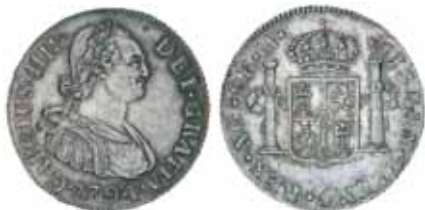
1277* Guatemala , Charles III, two reales, 1794M, Guatemala Mint (KM.51). Toned, nearly uncirculated.