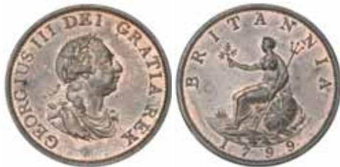
1276* Great Britain , George III, halfpenny, 1799 (S.3778) five incuse gun ports. Brown and red, nearly uncirculated.