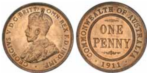
1549* George V, 1911. Full original mint red, choice uncirculated.