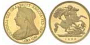
1440* Queen Victoria, Melbourne Mint proof or pattern half sovereign, 1898M. A brilliant and frosted proof, a minute contact mark in front of the forehead, otherwise FDC and excessively rare. $60,000

This date was not struck for circulation, Murdoch held two specimens, this is in all probability one of them. Ex Noble Numismatics Sale 89A (lot 406).