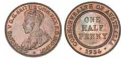
1585* George V, 1934. Red and brown uncirculated.