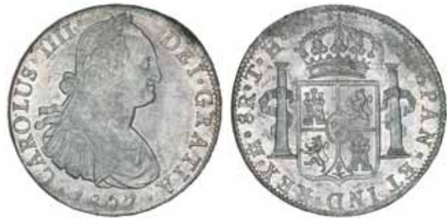
1287* Mexico , Charles III, eight reales, Mexico City Mint, 1807TH (KM.109). Nearly full original mint bloom, nearly uncirculated/uncirculated. $300

Ex Noble Numismatics Sale 75 (lot 1361).