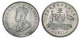
1533* George V, 1911. Choice uncirculated.