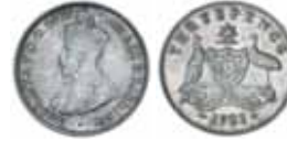
1541* George V, 1921. Extremely fine.