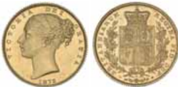
1439* Queen Victoria, Melbourne Mint presentation proof-like specimen sovereign, 1872. Minute obverse rim bruise at 11.30 o'clock, otherwise nearly FDC and excessively rare if not unique, of considerable historical interest. $30,000