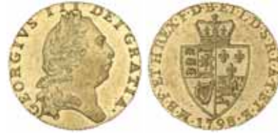
1268* Great Britain , George III, guinea, fifth bust or spade type, 1798 (S.3729). Extremely fine/good extremely fine, with considerable brilliance. $750