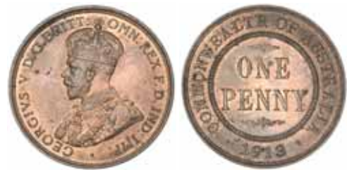
1553* George V, 1913. Brown and red, nearly uncirculated.

In a slab by PCGS as MS64RB. Ex Noble Numismatics Sale 92 (lot 1655).