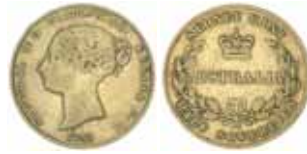
1334* Queen Victoria , first type, 1856. Nearly very fine.