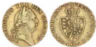
1266* Great Britain , George III, guinea, fifth bust or spade type, 1789 (S.3729). Good fine. $500