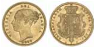
1414* Queen Victoria , 1883 Sydney (McD.25a). Extremely fine with some original mint bloom, rare thus. $1,600