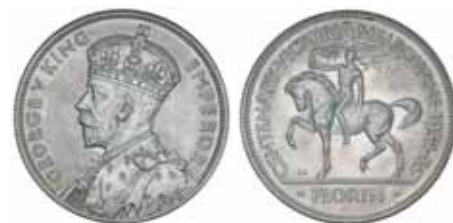
1501* George V, 1934-35 Melbourne Centenary. Well struck wreath, choice uncirculated.