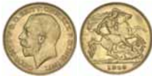
1438* George V, 1918 Perth. Extremely fine and rare. $3,500