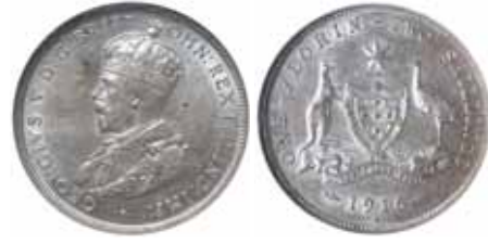
1490* George V, 1916M. Nearly uncirculated. $700 In a slab by NGC as MS61.