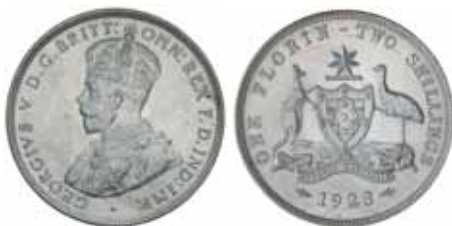
1496* George V, 1923. Reverse with die breaks in and around date, nearly uncirculated/uncirculated.