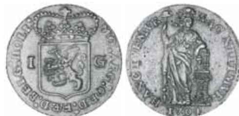
1290* Netherlands , Holland, gulden, 1794 (10.61g) (KM.73). Lightly toned, extremely fine. $100

Ex Noble Numismatics Sale 92 (lot 2776).