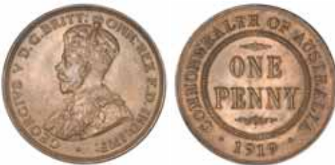
1556* George V , 1919 dot below. Lightly toned, red uncirculated.

Ex Noble Numismatics Sale 58 (lot 332) and Sale 92 (lot 1670).