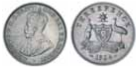
1545* George V, 1924. Cleaned and dipped, nearly extremely fine/brilliant nearly uncirculated.