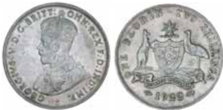
1495* George V, 1922. Peripheral toning, nearly uncirculated/uncirculated and rare in this condition.