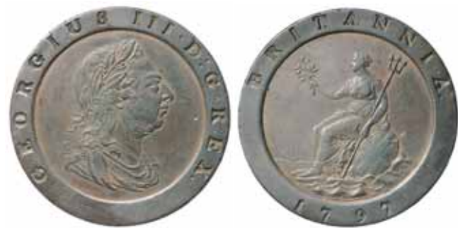
1271* Great Britain , George III, cartwheel twopence, 1797 (S.2776). Brown patina, nearly extremely fine. $200