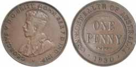
1566* George V , 1930 Indian die. Partial centre diamond, six clear pearls, glossy brown patina, nearly very fine and rare.

Private purchase from Jaggards 8/3/88 with copy of invoice.