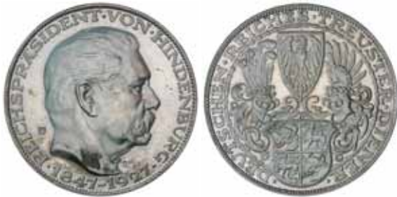
2196* Germany , Weimar Republic, pattern five marks, 1927D, by K.Goetz (Bruce X1, p167). Nearly FDC.