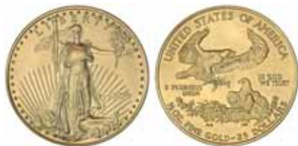
2115* USA, half ounce fine gold Liberty, 1999. Uncirculated.