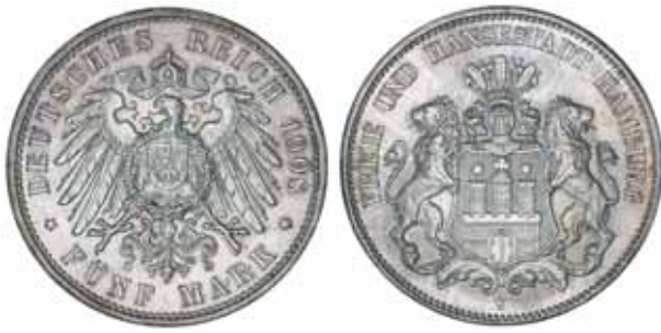
2193* Germany , Hamburg, five mark, 1908J (KM.293). Good extremely fine.