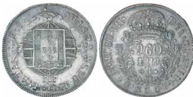
2130* Brazil , 960 reis, 1819R, overstruck on a Ferdinand VII Santiago (Chile) mint eight reales, 1811 (KM.326.1). Good very fine.