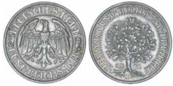
2197* Germany , Weimar Republic, five mark, 1931J (KM.56.6). Extremely fine.

Ex Noble Numismatics Sale 80 (lot 3619).