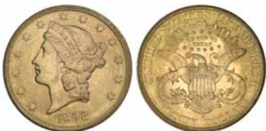
2108* USA, twenty dollars or double eagle, 1898S, Liberty head. Considerable mint bloom, uncirculated.