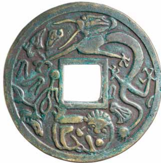
2165* China , Q'ing (Ch'ing) Dynasty, 'Kang Xi Tung Pao', Emperor Sheng Zu (1662-1722), large round charm with square hole, 81mm, (115 g), rev. stylised man, dragon and lion, (Thierry Amulets..., -; cf. Zhong guo hua qian No.1393 [not stylised figures and larger]). Very fine and very rare.