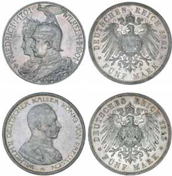
2194* Germany , Prussia, Wilhelm II, five mark, 1901A (KM.Y.129), 1913A (KM.536). Nearly uncirculated; extremely fine. (2)

Ex Noble Numismatics Sale 84 (lot 2267).