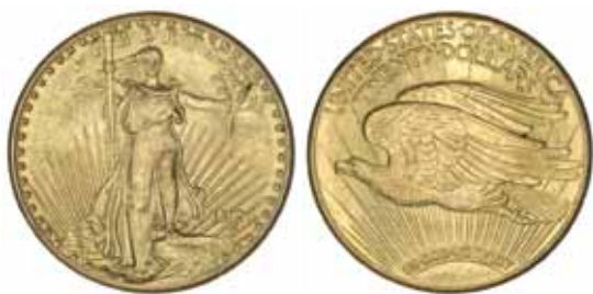
2114* USA, twenty dollars or double eagle, 1926, St.Gaudens. Nearly uncirculated.