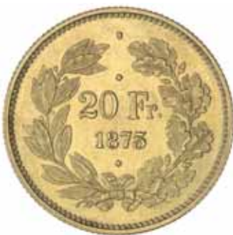
lot 2090 (enlarged)