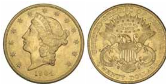
2110* USA, twenty dollars or double eagle, 1904, Liberty head. Scuffs on cheek, otherwise nearly uncirculated.