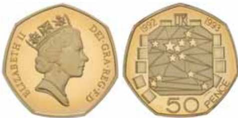
1950 Elizabeth II , proof gold fifty pence, 1993 UK's Presidency of Council of European Community Ministers and completion of Single Market (S.4352). In case of issue with certificate no 0588, FDC.