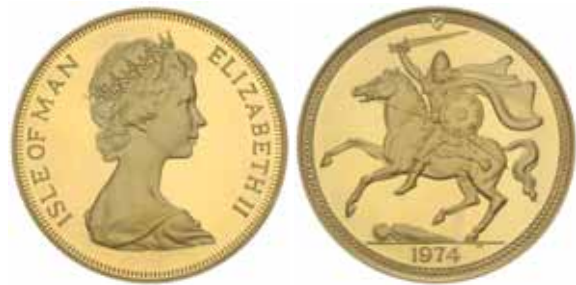
1953* Isle of Man , Elizabeth II, proof set five pounds to half sovereign, 1974 (KM.PS4). In plush case of issue with certificate 0501, FDC.