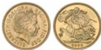
1951* Elizabeth II , sovereign, 2000 (S.4430). Uncirculated.