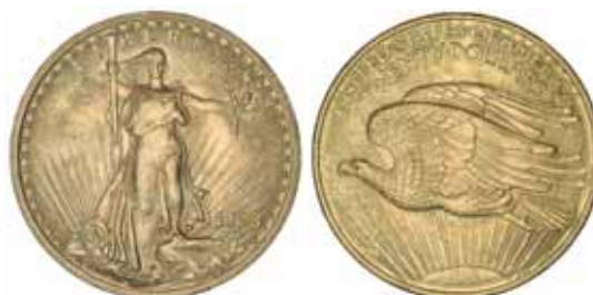
2111* USA, twenty dollars or double eagle, 1908, St.Gaudens, without motto. Nearly uncirculated.