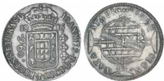
2129* Brazil , 960 reis, 1816B (KM.307.1). Good very fine.