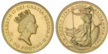
1949 Elizabeth II , Britannia pure gold half ounce coin, 1993 (S.4287). Uncirculated.