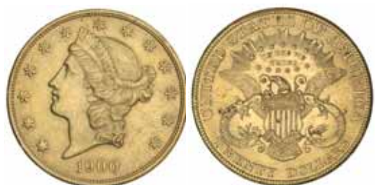
2109* USA, twenty dollars or double eagle, 1900, Liberty head. Good extremely fine.