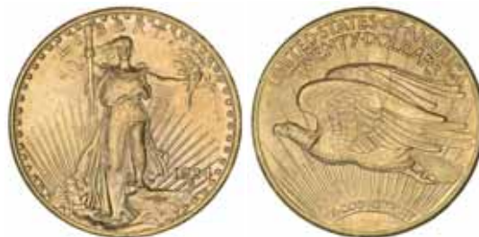
2113* USA, twenty dollars or double eagle, 1924, St.Gaudens. Nearly uncirculated.