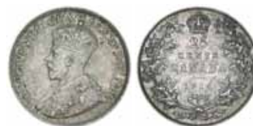
2133* Canada , George V, twenty five cents, 1916. Toned, good extremely fine.

Ex K.A.Hicks Collection (from Downie Sale 15/10/93, lot 1683). This is one of a few produced in the 1960s (see Faulkner p281, no L.1), at 16.01g it is 5g too light.