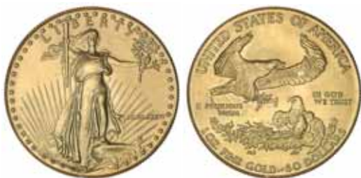
2116* USA, one ounce fine gold Liberty, 1986. Uncirculated.