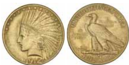
2105* USA, ten dollars or eagle, 1912, Indian head. Toned, good extremely fine.