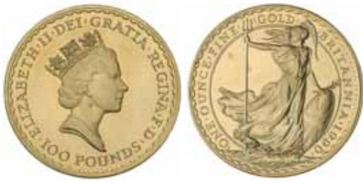
1948* Elizabeth II , Britannia one ounce gold one hundred pounds, 1990 (S.4282). FDC.