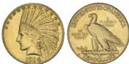
2106* USA, ten dollars or eagle, 1914S, Indian head. Lightly polished, otherwise extremely fine.