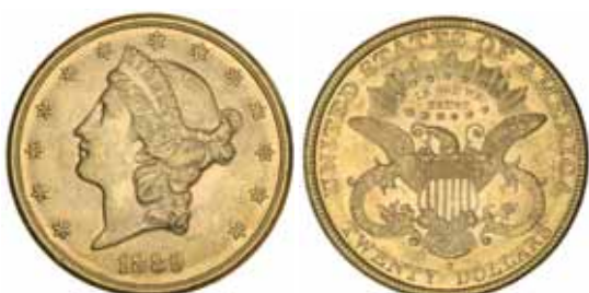
2107* USA, twenty dollars or double eagle, 1889S, Liberty head. Scuff marks on face of Liberty, otherwise good extremely fine.