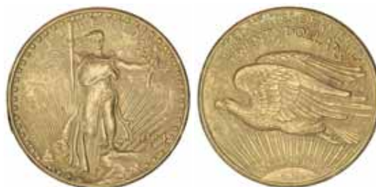
2112* USA, twenty dollars or double eagle, 1924, St.Gaudens. Good extremely fine.