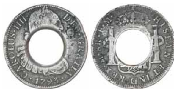
2132* Canada , Prince Edward Island, cast replica holey dollar or five shillings (1813), a Charles III Mexico City Mint eight reales, 1793F., centrally pierced with a large hole and countermarked with a radiate sun. Good fine.