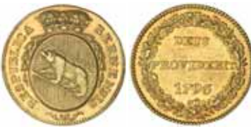
2089* Switzerland , Bern, duplone, 1796 (KM.152). Extremely fine.