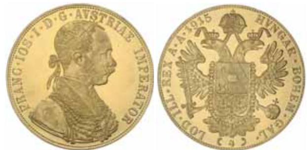
1956* Austria , Franz Joseph, four ducats, 1915 (restrike) (KM.2276). Uncirculated.