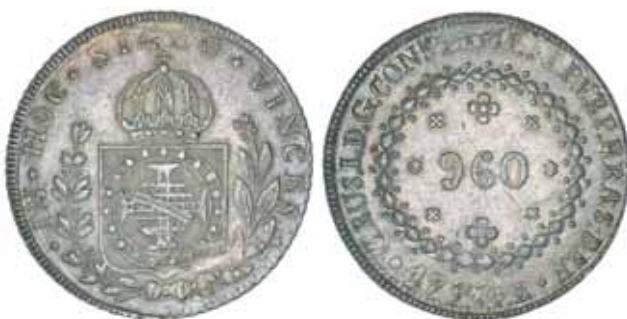
2131* Brazil , 960 reis, 1824R (KM.368.1). Toned, undertype 1787, nearly extremely fine.