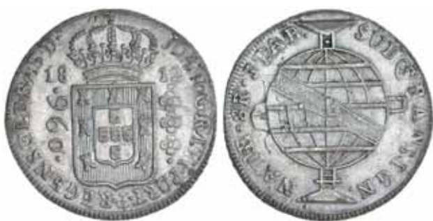
2128* Brazil , Empire, silver 960 reis, 1812B (Bahia mint), (KM.307.1) overstruck on Spanish America eight reales. Extremely fine.