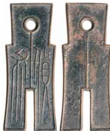
2136* China , Empire, Wang Mang, huo-pu 'The pu currency', spade money (18.84 g), height 60mm, width 24mm, (45 B.C. - 23 A.D.) Good very fine.