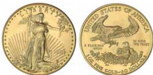
2117* USA, one ounce fine gold Liberty, 1994. Uncirculated.