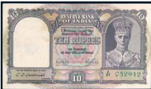
2608* India , Reserve Bank of India, George VI, ten rupees, signature C.D.Deshmukh, undated (issued 1944), A/21 052942 (P.24; Jhun.6.1). Staple holes and slight stain in watermark area, otherwise extremely fine.