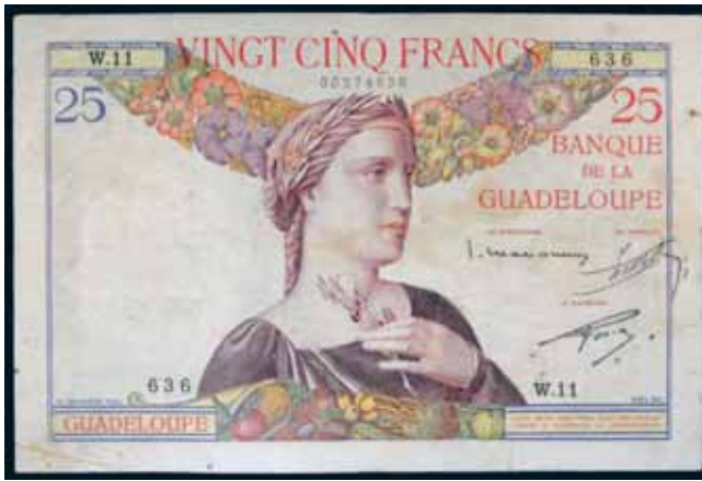
2595* Guadeloupe , Banque de la Guadeloupe, twenty five francs, undated (1934; 1944) W.11 636 (P.14). Tone spots, otherwise fine and scarce.