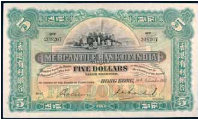
2574* China , The Mercantile Bank of India Limited, five dollars, Hong Kong, 29th November 1941, No 208267 (P.235d). Full bodied note, bright colour, very fine.