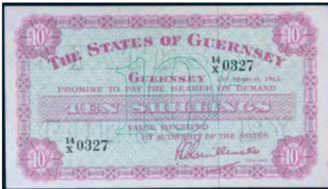
2596* Guernsey , The States of Guernsey, ten shillings, 14/X 0327 and one pound, 29W 3388, both dated 1st March 1962 (P.42b, 43b). Good very fine. (2)