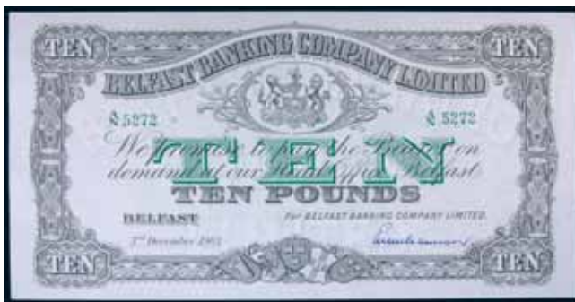
2626* Ireland , Northern Ireland, Belfast Banking Company Limited, ten pounds, Belfast, 3rd December 1963, A/N 5272 (P.128c). Nearly uncirculated.