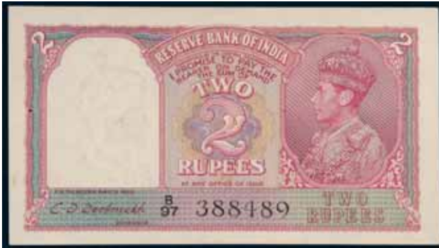
2606* India , Reserve Bank of India, two rupees, undated (1943) (P.17b) B/97 388489. Staple holes as usual at left top edge, otherwise uncirculated.