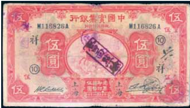
2575* China , National Industrial Bank of China, five yuan, Shanghai, 1931, M116826A (P.532a). Ink stamps front and back, good but scarce.