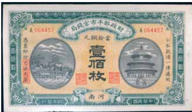
2576* China , Market Stabilization Currency Bureau, one hundred coppers, Honan, 1915, A 064457 (P.603e). Nearly uncirculated.