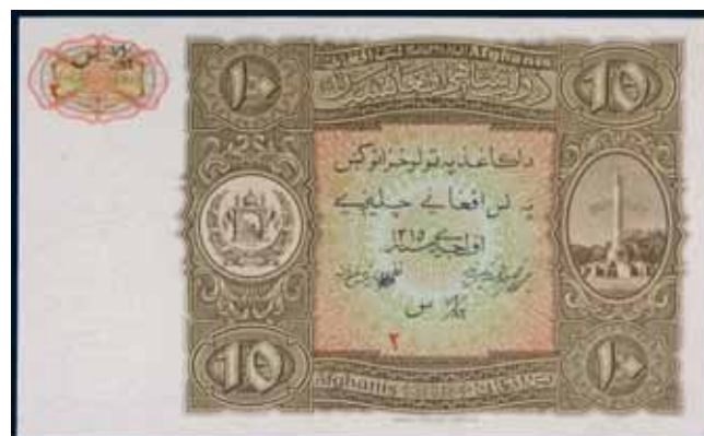
2544* Afghanistan, Ministry of Finance, ten afghanis, SH1515 (1936) (P.17). Uncirculated.