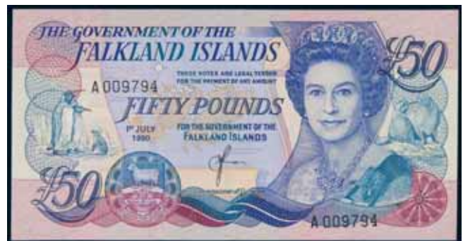
2581* Falkland Islands , The Government of the Falkland Islands, ten pounds, 1st September 1986, A159882/3 (P.14a) consecutive pair; twenty pounds, 1st October 1984, A151879 (P.15a); fifty pounds, 1st July 1990, A009794 (P.16a). Uncirculated. (4)

In a PMG holder as Choice uncirculated 64EPQ.