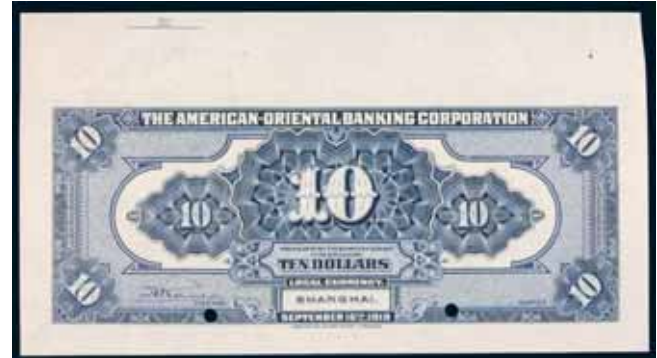
2563* China , The American Oriental Banking Corporation, Shanghai, 16.9.1919, five and ten dollar specimen notes, holed to cancel, all Return to Dept stamped Mar 5 1920 and May 4 1920 (P.S97, S.98). Virtually uncirculated and rare. (2)