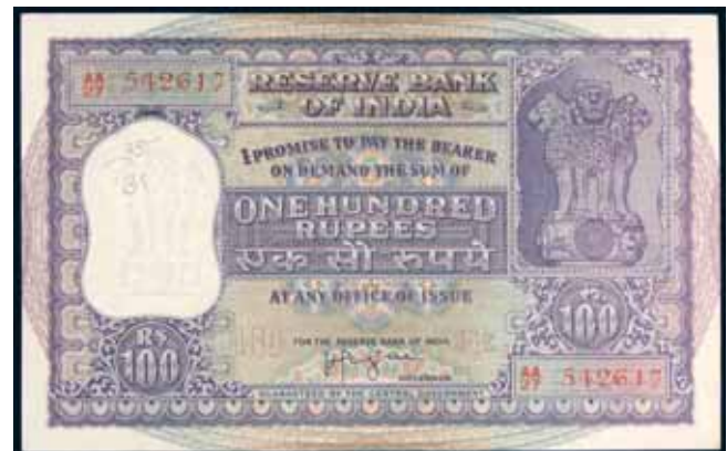
2611* India , Reserve Bank of India, one hundred rupees, undated (1957-62) AA/27 542617 (P.44) AA/63 453150/1 consecutive pair. The usual staple holes at left edge, centre fold, two numbers pencilled in watermark area, otherwise good extremely fine. (3)