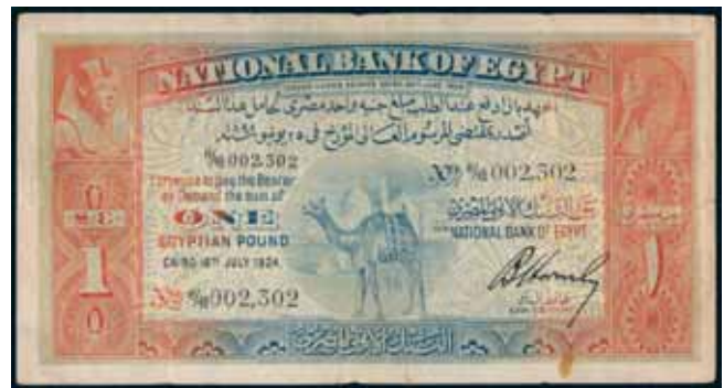
2579* Egypt , National Bank of Egypt, one Egyptian pound, Cairo, 16th July 1924, H/46 002,302 (P.18). Folds and creases, tone spot at bottom, otherwise fine and rare.