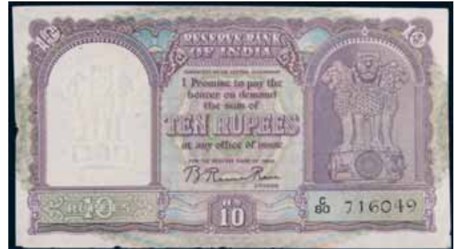
2609* India , Reserve Bank of India, ten rupees, signature B.Rama Rau (1950), C/80 716049 (P.37a; Jhun.4.1.2). Staple holes at left, uneven edges, flat, very fine.