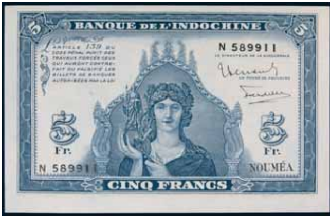
2647* New Caledonia , Banque de l'Indochine, five francs, undated (1944), N 589911 (P.48). Nearly uncirculated and rare thus.