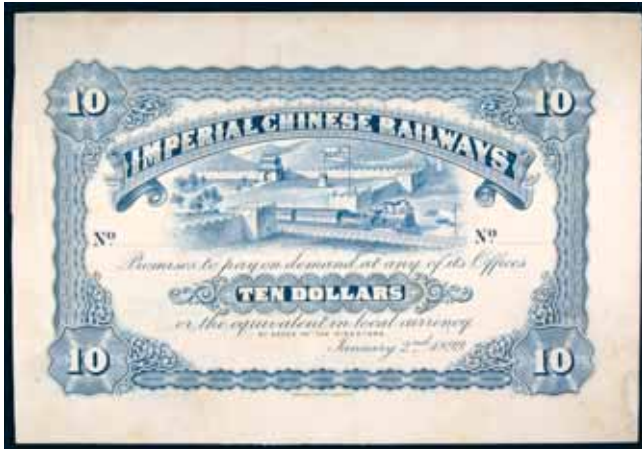
2562* China , Imperial Chinese Railways, ten dollars, January 2nd, 1899, proof on card or unissued remainder (P.A61r). Extremely fine and rare.