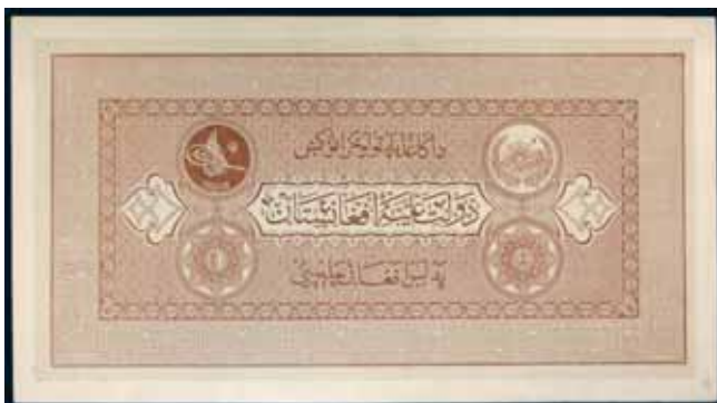
2542* Afghanistan, Treasury note, ten afghanis, undated (1926-28) (P.8). Nearly uncirculated.