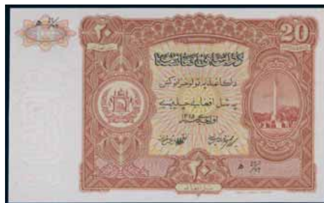
2545* Afghanistan, Ministry of Finance, twenty afghanis, SH1515 (1936) (P.18). Uncirculated.