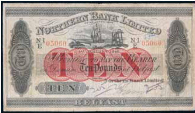
2625* Ireland , Northern Ireland, Northern Bank Limited, ten pounds, 1st January 1940, N-I/E 05060 (P.181a). Penned figures back and front, nearly fine.