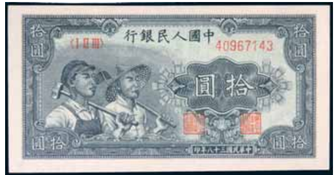
2577* China , People's Republic, People's Bank of China, ten yuan, 1949, without watermark, 40967143 (P.816a). Uncirculated.