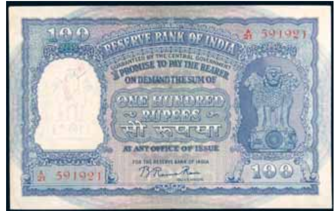
2610* India , Reserve Bank of India, one hundred rupees (1953) B.Rama Rau, red serials, A/21 591921 (P.42b; Jhun.7.2A). Two pin holes, name stamped on front, and penna numbers front and back, good very fine.