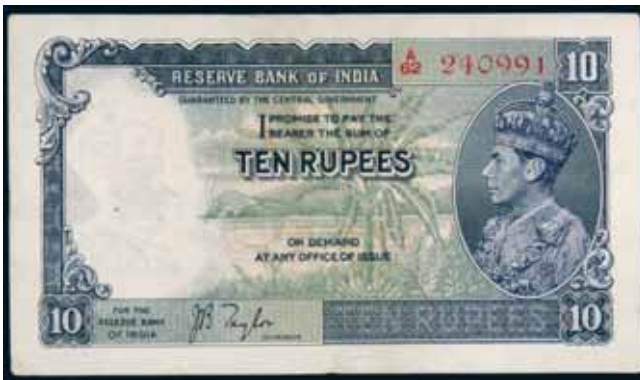
2607* India , Reserve Bank of India, ten rupees, undated (1937) A/62 240991 (P.19a). Staple holes and spindle hole at left, flattened, very fine.