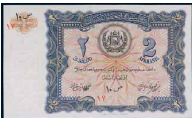
2543* Afghanistan, Ministry of Finance, two afghanis, SH1515 (1936) (P.15). Uncirculated.