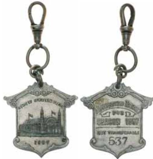
700* Sydney Skating Rink , admission ticket, 1907, season pass in cupro-nickel (35x22mm), obverse with skating rink building, reverse with impressed number 537, together with attached fob chain clip for wearing. Good very fine and rare.