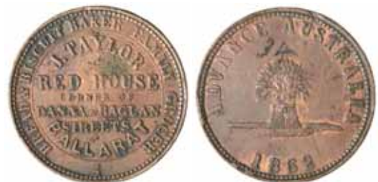
581* Taylor, J. , Ballarat penny, 1862 (A.569). Some old pitting from corrosion, cleaned and retoned, otherwise very fine.