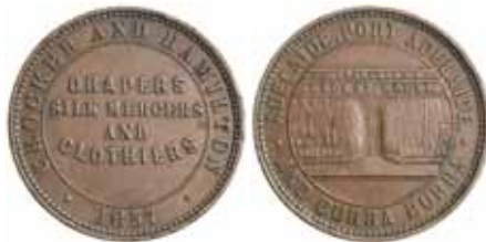
538* Crocker & Hamilton , Adelaide, Port Adelaide and Burra Burra halfpenny, 1857 (A.83). Very fine.