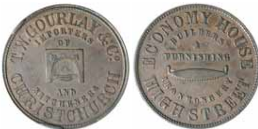
548* Gourlay , T.W. & Co., Christchurch penny, undated (A.151). Nearly extremely fine.