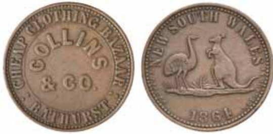
536* Collins & Co. , Bathurst penny, 1864 (A.72). Even brown patina, good very fine and scarce.