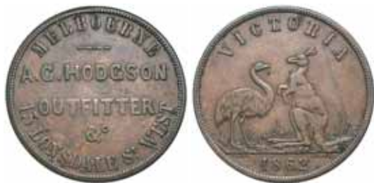
557* Hodgson, A.G. , Melbourne penny, 1862 (A.257). Very fine.

Ex Spink Australia Sale 38 (lot 603) and Noble Numismatics Sale 79 (lot 869).