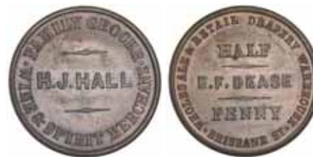
552* Hall , H.J., Christchurch mule halfpenny with E.F. Dease obverse as reverse (A.163). Full underlying mint bloom with blue red brown patina, uncirculated and rare.