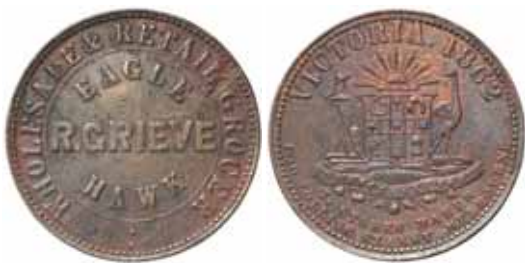
549* Grieve , R., Eagle Hawk penny, 1862 (A.153). Slightly pitted, very slightly off-centre strike, good very fine and scarce.

Ex Spink Australia in 1979 and the Strathburn Collection, Sale 29 (lot 2664).