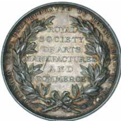
lot 662 part