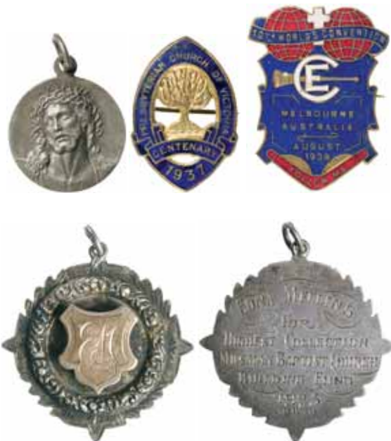
lot 718 part