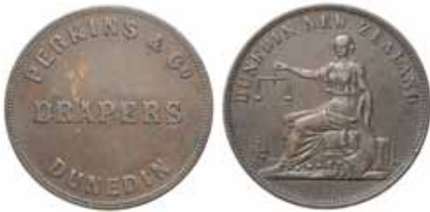
575* Perkins & Co. , Dunedin penny, undated (A.435). Glossy dark bronze patina, good very fine and scarce.