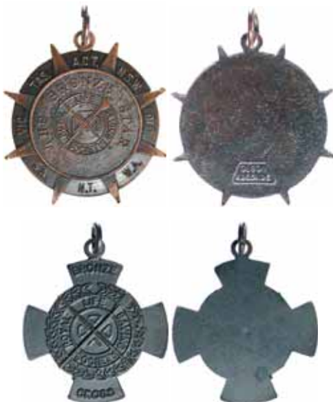
lot 699 part

N.B.S.P.S. is Neutral Bay State Public School.