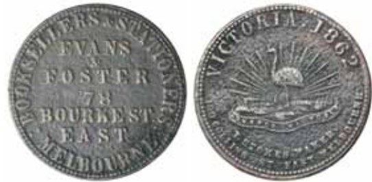
542* Evans & Foster , Melbourne penny, 1862 (A.119). Die axis at 180 degrees, pitted surface, otherwise very fine and scarce.