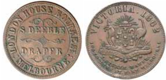
541* Deeble, S. , Melbourne penny, 1862 (A.106). Nearly extremely fine and rare in this condition.