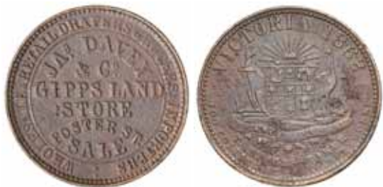
540* Davey, Jas. & Co. , Sale penny, 1862 (A.90). Porous and pitted surface, otherwise good very fine/nearly very fine and rare.