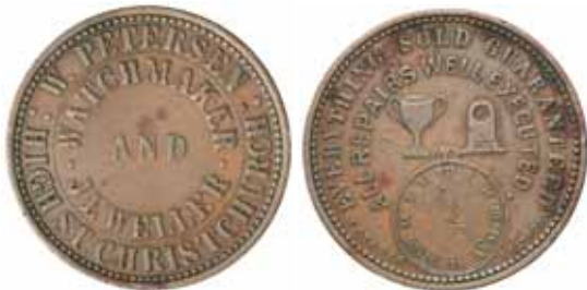
576* Petersen, W. , Christchurch penny, undated (A.437). Four dry spots on reverse, brown patina, good very fine and scarce thus.

Ex Australian Numismatic Company, 6th October 1987.