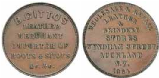
547* Gittos , B., Auckland penny, 1864 (A.149). Medium brown patina, nearly extremely fine.