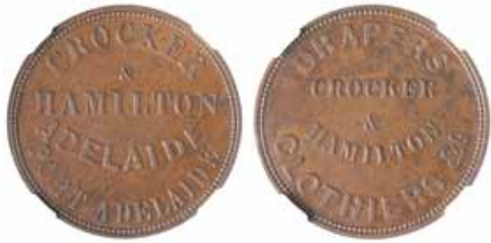
537* Crocker & Hamilton , Adelaide, Port Adelaide penny, undated (A.82). Good extremely fine.