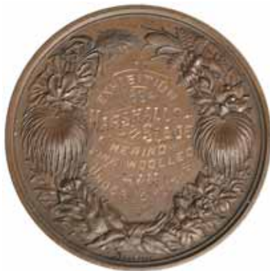
lot 693 part