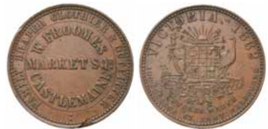
545* Froomes, W. , Castlemaine penny, 1862 (A.141). Planchet flaw at 5:30 on obverse rim, reverse pitting, otherwise good very fine.