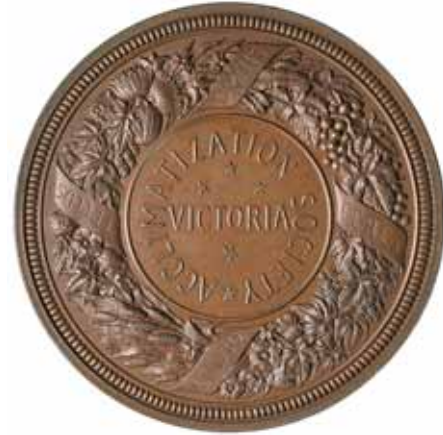
659* Melbourne Exhibition, Victoria, 1854 , in bronze (64mm) by J.S.Wyon, edge impressed 'Prize Medal 101 W.Gripe Specimens of Moulding' (C.1854/2). In fitted case (faded), some spotting on obverse, edge bruise, otherwise good extremely fine.