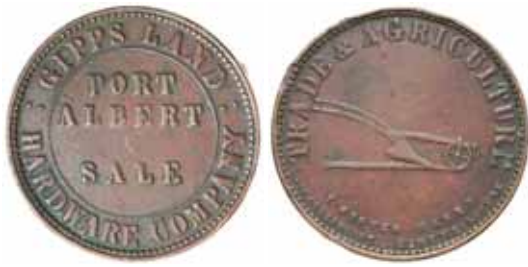
546* Gipps Land Hardware Company , Port Albert & Sale penny, undated (A.146). Very fine.