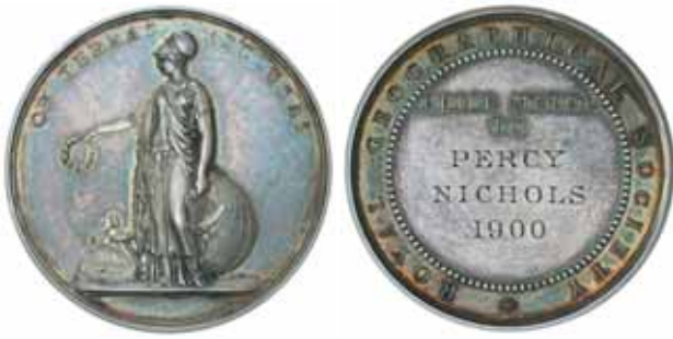
696* Royal Geographical Society , award medal in silver (39mm), inscribed for 'Percy/Nichols/1900' (Eimer 1652). Beautifully toned, uncirculated, in original Wyon case of issue.