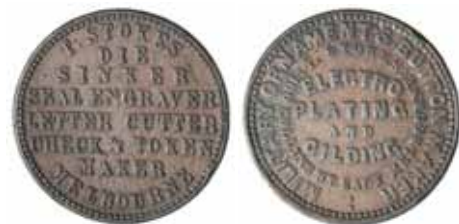
580* Stokes, T. , Melbourne halfpenny, undated (A.517). Thick flan, obverse rim nick at 4 o'clock, dark brown patina, very fine and rare.