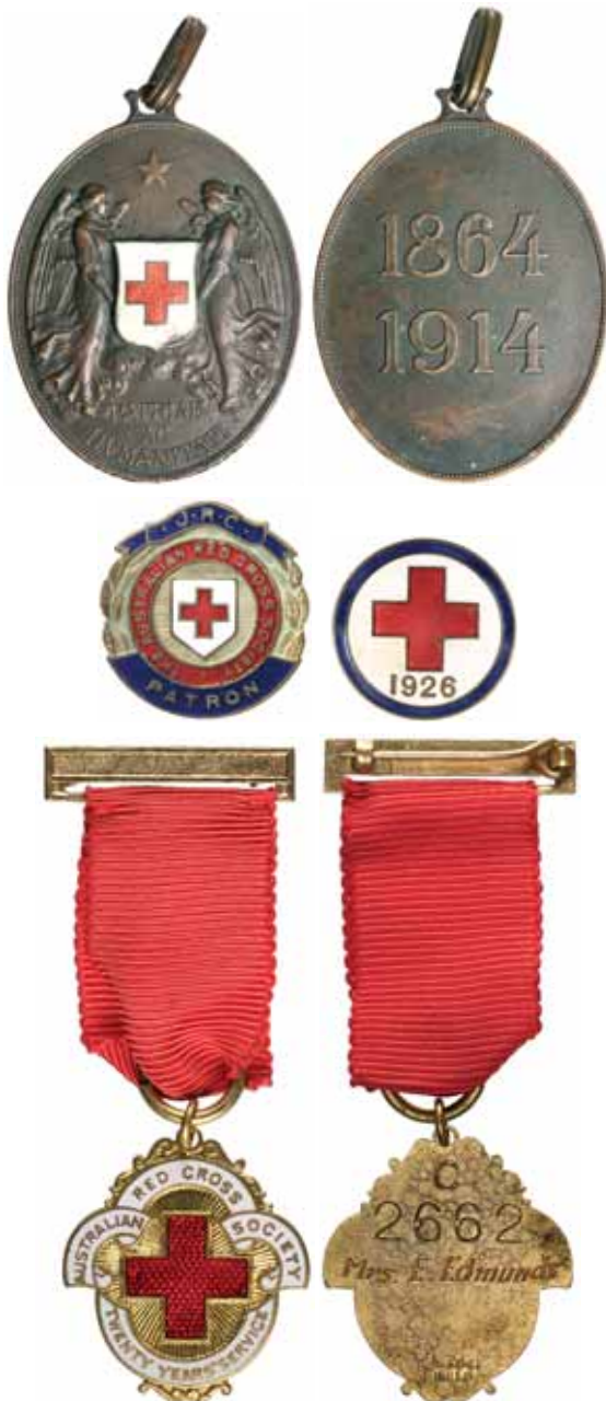
lot 776 part