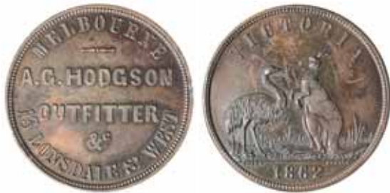
556* Hodgson, A.G. , Melbourne penny, 1862 (A.257). Dark grey brown tone, lacquered, otherwise nearly uncirculated.