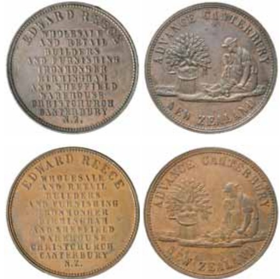
579 Reece, Edward , Christchurch pennies, undated (A.447, 449). Dark brown, good very fine; red brown, nearly extremely fine. (2)