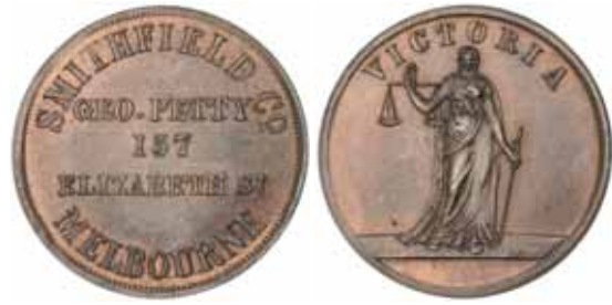
578* Petty, Geo. , Melbourne penny, undated (A.441). Die axis at 180 degrees, brown and red, uncirculated.