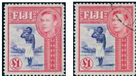
lot 3106 part