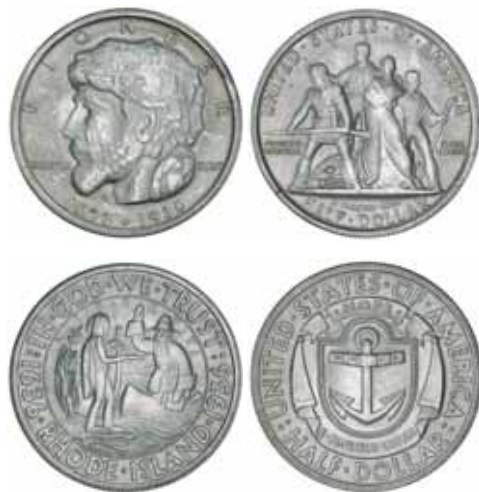
1849* USA , commemorative half dollars, Elgin Illinois Centennial, 1936; Providence, Rhode Island Tercentenary, 1936. Uncirculated. (2)

Ex Terry Naughton Collection, from Status Sale 260, 23/10/09, lot 8082.