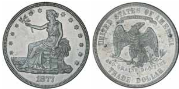
1828* USA, trade dollar, 1877. A few spots on reverse, otherwise uncirculated.