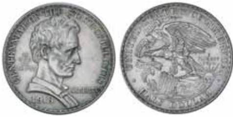
1837* USA , commemorative half dollar, 1918, Illinois Centennial, Abraham Lincoln. Lightly toned, nearly uncirculated. $150

Ex Terry Naughton Collection, from Status Sale 271, 22/10/10, lot 8348.