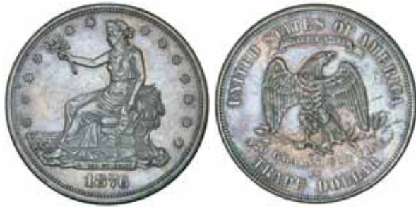
1827* USA, trade dollar, 1876CC. Extremely fine.