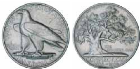
1844* USA , commemorative half dollar, Connecticut Tercentenary, 1935. Uncirculated.

Ex Terry Naughton Collection, first from Noble Numismatics Sale 87A (lot 3183), second from Status Sale 271, 22/10/10, lot 8373.