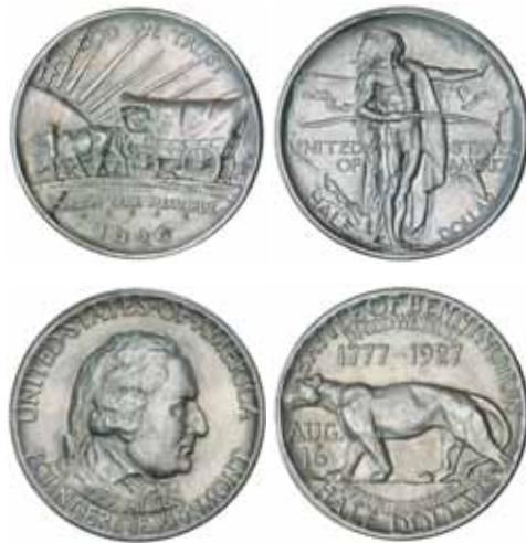
1842* USA , commemorative half dollars, Oregon Trail, 1926S; Vermont, Sesquicentennial, 1927. Nearly uncirculated. (2) $400

Ex Terry Naughton Collection, from Status Sale 250, 17/10/08, lot 9612.