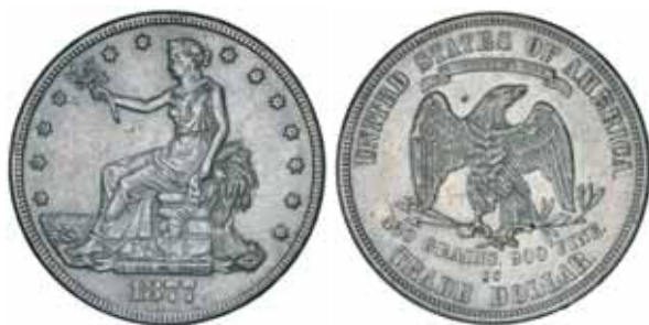
1829* USA, trade dollar, 1877CC. Extremely fine.