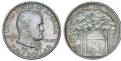
1840* USA , commemorative half dollar, Ulysses S. Grant, 1922, Grant Memorial. Lightly toned, uncirculated. $200

Ex Terry Naughton Collection, from Status Sale 271, 22/10/10, lot 8348.