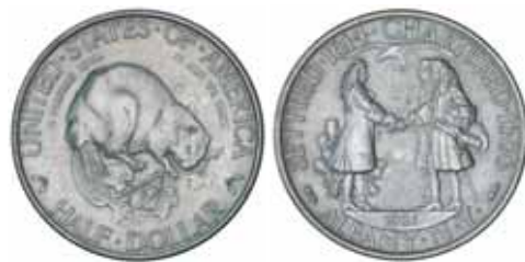
1846* USA , commemorative half dollar, Albany Charter, 250th Anniversary, 1936. Uncirculated.