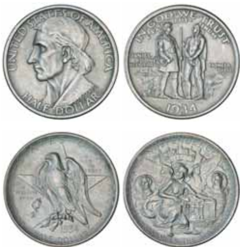
1843* USA , commemorative half dollars, Daniel Boone Bicentennial, 1934; Texas Independence Centennial, 1934. Uncirculated. (2)