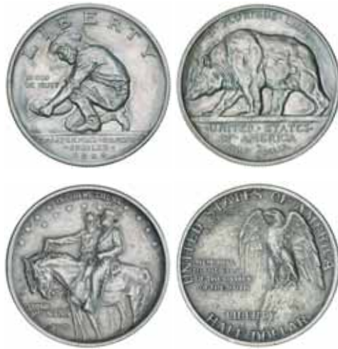
1841* USA , commemorative half dollars, Californian Jubilee, 1925S; Stone Mountain, 1925. Nearly uncirculated; extremely fine. (2) $200

Ex Terry Naughton Collection, first ex Noble Numismatics Sale 87A, lot 3176, second ex Status Sale 250, 17/10/08, lot 9617.