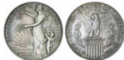
1836* USA, commemorative half dollar, 1915 Panama Pacific Exposition. Light golden tone, uncirculated and scarce.

Ex Terry Naughton Collection, the first ex Status Sale 301, 24/10/13, lot 7811, second from I.S.Wright 23/10/12.