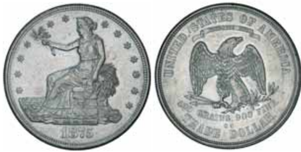
1826* USA, trade dollar, 1875CC. Extremely fine.