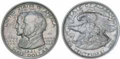
1839* USA , commemorative half dollar, Alabama Centennial 1921. Uncirculated and scarce. $300

Ex Terry Naughton Collection, first from Noble Numismatics Sale 87A, lot 3178.