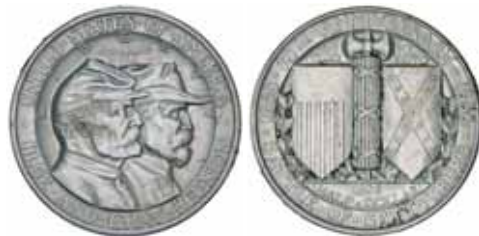
1847* USA , commemorative half dollar, Battle of Gettysburg, 75th Anniversary, 1936. Slight adhesion on edge, uncirculated and scarce.

Ex Terry Naughton Collection, from Status Sale 301, 24/10/13, lot 7832.