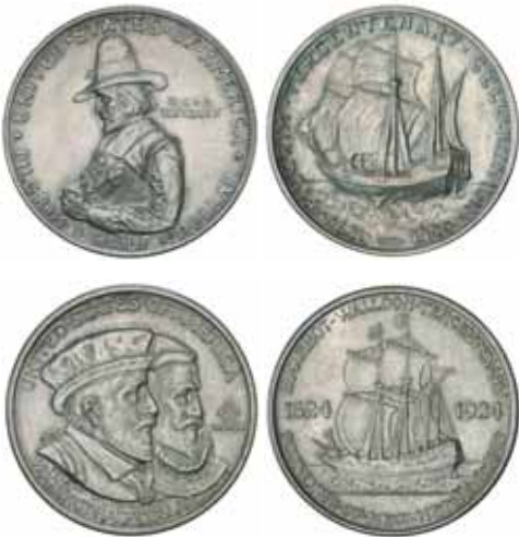
1838* USA , commemorative half dollars, Pilgrim Tercentenary, 1920, Mayflower; Huguenot-Walloon Tercentenary, 1924, Nieuw Nederland. Nearly uncirculated. (2) $300

Ex Terry Naughton Collection, from Status Sale 260, 23/10/09, lot 8062.