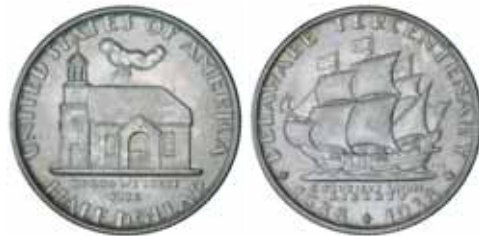
1848* USA , commemorative half dollar, Delaware Tercentenary, 1936. Uncirculated and scarce.

Ex Terry Naughton Collection, from Status Sale 250, 17/10/08, lot 9636.