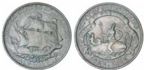
1845* USA , commemorative half dollar, 1935, City of Hudson, N.Y., Sesquicentenary. Uncirculated and rare.