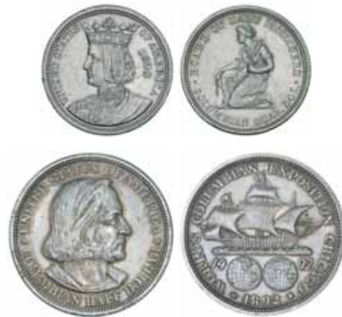
1835* USA, commemorative quarter dollar, 1893, Isabella; half dollar, 1892 Columbus. First cleaned, good extremely fine; second toned, extremely fine. (2)