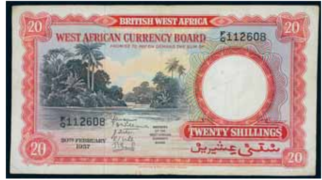
2205* British West Africa , West African Currency Board, twenty shillings, 20th February 1957, F/Q 112608 (P.10a). Small nick in bottom edge, very fine and scarce. $100