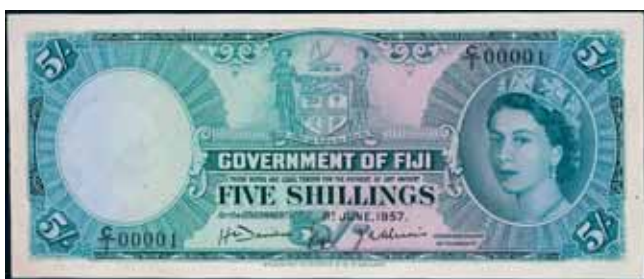
2284* Fiji , Government of Fiji, Elizabeth II, five shillings, 1st June, 1957, C/1 00001 (P.51a). Centre fold, nearly uncirculated and a very rare No 1 note.