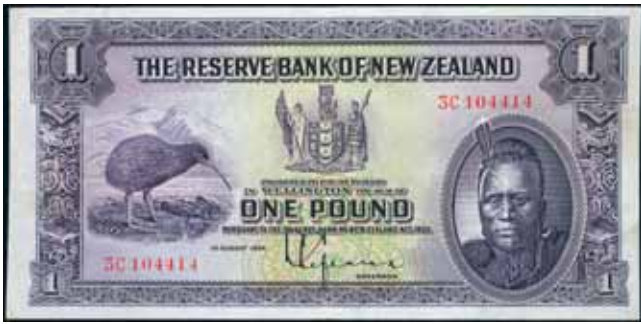
2111* Reserve Bank of New Zealand, L. Lefeaux, 1st August 1934, one pound, 3C 104414 (P.155). Original body, very fine. $250