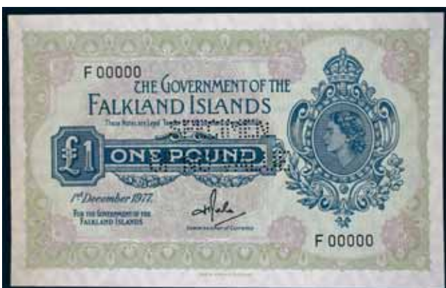
2263* Falkland Islands , The Government of the Falkland Islands, Elizabeth II, specimen one pound, 1st December 1977, F 00000, SPECIMEN/OF NO VALUE perforated at centre (P.8cs). Glue remnants at right on back, otherwise uncirculated.