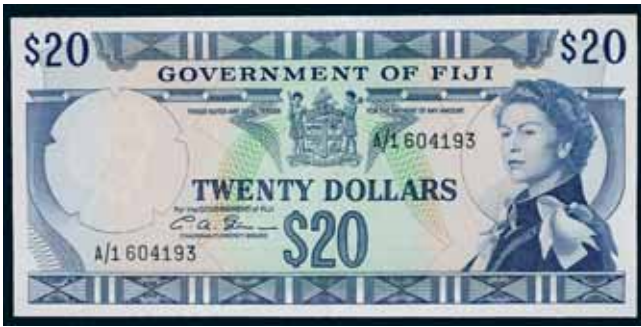
2302* Fiji , Government of Fiji, Elizabeth II, twenty dollars, undated (1971), A/1 604193 (P.69b). Nearly uncirculated and very rare thus.