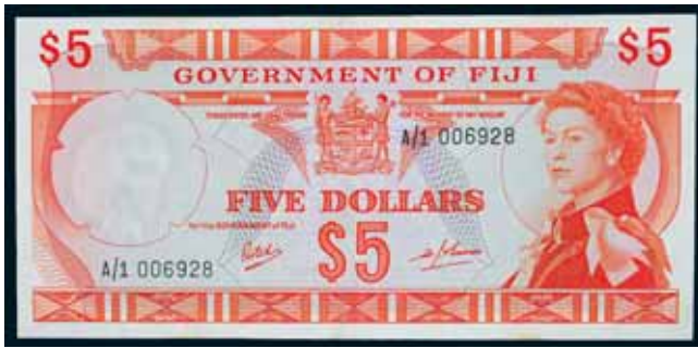
2294* Fiji , Government of Fiji, Elizabeth II, five dollars, undated (1969), A/1 006928 (P.61a). Nearly uncirculated. $100