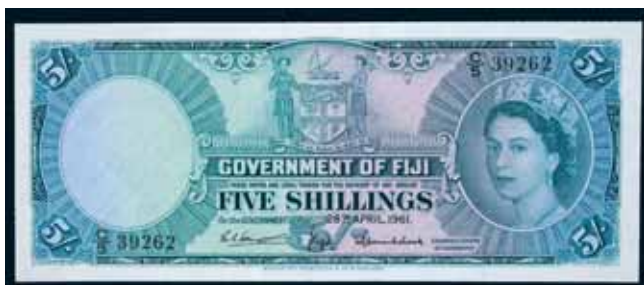
2285* Fiji , Government of Fiji, Elizabeth II, five shillings, 28th April, 1961, C/5 39262 (P.51b). Uncirculated.

Obtained by the owner as a bank teller working in Fiji. Believed to be the first issued five shillings note of Elizabeth II.