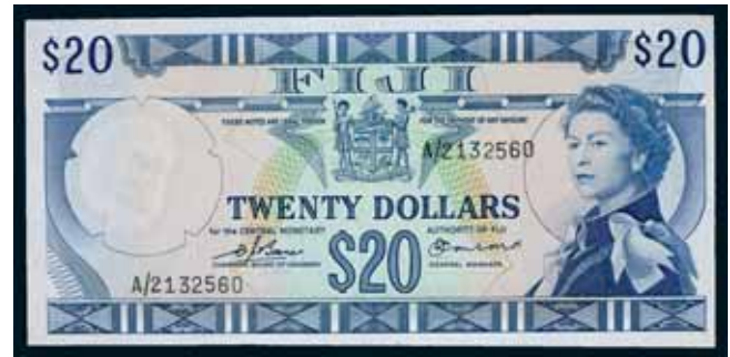
2313* Fiji , Central Monetary Authority of Fiji, Elizabeth II, twenty dollars, undated (1974), A/2 132560 (P.75b). Virtually uncirculated.