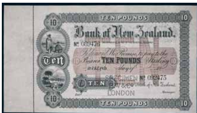
2093* Bank of New Zealand , third issue, specimen ten pounds, Auckland, undated 18., discordant serial numbers No. 089476 and 092475, imprint of Bradbury, Wilkinson & Co. Engravers & c. London, booklet edge with perforated sedge, SPECIMEN/BW &Co/LONDON perforated at bottom (P.S193s). Uncirculated.