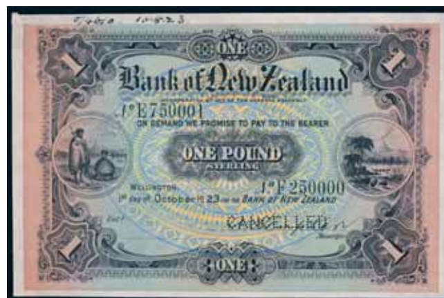
2096* Bank of New Zealand , seventh issue, specimen one pound, Wellington, 1st October 1923, without words on back, discordant serial numbers No. E 750001 and F 250000, imprint of Bradbury Wilkinson & Co, Engravers, London, CANCELLED perforated at Manager's signature, printer's instructions in pen top margin '5/4610 10.8.23' (P.S226s). Minor remnants of paper on back right corners where removed from booklet, otherwise nearly uncirculated and rare.