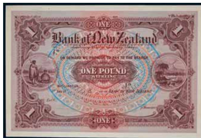
2095* Bank of New Zealand , seventh issue, uniface colour trial for one pound, Wellington, 1st ... 192..., no serial number or imprint, SPECIMEN perforated at signature reserves (P.S225ct). Good extremely fine.