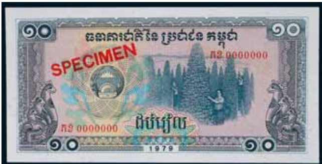
2210* Cambodia , State Bank of Democratic Kampuchea, 1979, set of specimen notes for 0.1, 0.2, 0.5, 1, 5, 10, 20 and 50 riels, all prefixed and with serial number 0000000, SPECIMEN stamped in red diagonally both sides (P.25s-32s). Nearly uncirculated - uncirculated, some with toning. (8)