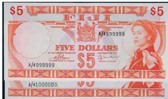
2308* Fiji , Central Monetary Authority of Fiji, Elizabeth II, five dollars, undated (1974), A/4 999001/2 consecutive pair and A/4 999999/1000000 consecutive pair (P.73c). Uncirculated and excessively rare, probably a unique combination. (4)