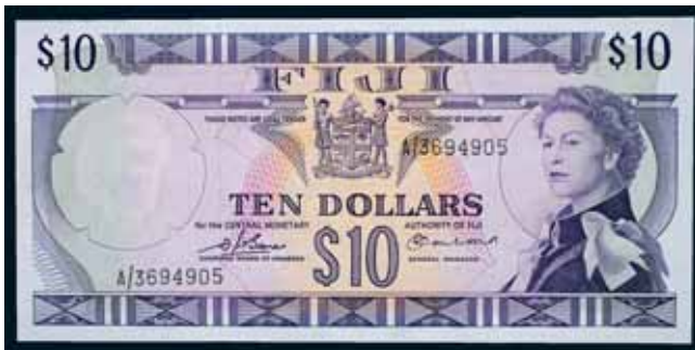
2310* Fiji , Central Monetary Authority of Fiji, Elizabeth II, ten dollars, undated (1974), A/3 694905 (P.74b). Uncirculated.