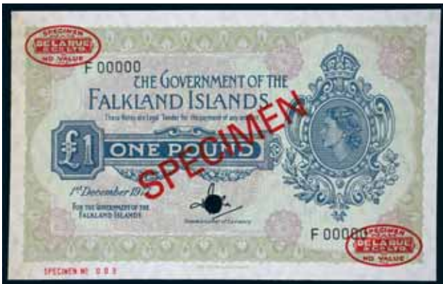
2262* Falkland Islands , The Government of the Falkland Islands, Elizabeth II, de la Rue specimen one pound, 1st December 1977, F 00000, SPECIMEN in red diagonally on front and back, de la Rue specimen lozenges in red top left and bottom right on front and back, single hole perforation at signature, SPECIMEN No. 003 in red at bottom left on front (P.8cs). Glue remnants on back at right, otherwise uncirculated.