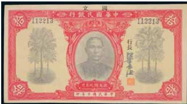
2240 China , Central Reserve Bank of China, five cents, 1940 (P.J2a); ten cents, 1940 (P.J3a) (6); twenty cents, 1940 (P.J4a) (7); fifty cents, 1940 (P.J6) and (P.J7a); one yuan, 1940 (P.J9c) (7); five yuan, 1940 (P.J10) (5); ten yuan, 1940 (P.J12); one yuan, 1943 (P.J19a) (2); one hundred yuan, 1943 (P.J21) (6), (P.J23) (9); five hundred yuan, 1943 (P.J24); two hundred yuan, 1944 (P.J30a) (2); also, Bank of China (P.63, 74, 79, 82). Fair - extremely fine. (55) $100