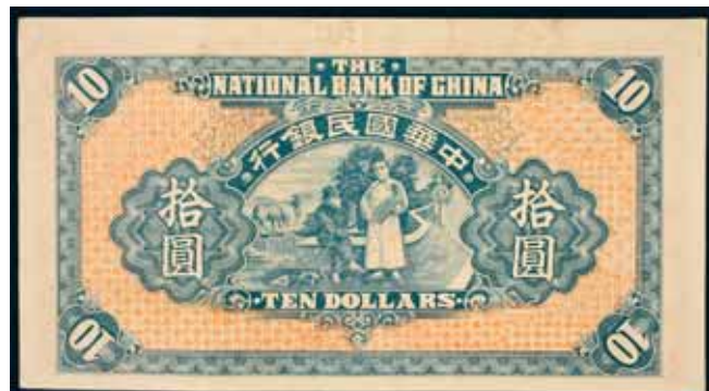
2236* China , National Bank of China, ten dollars, Canton, 1921, 112210 (P.516). Good extremely fine and very rare.