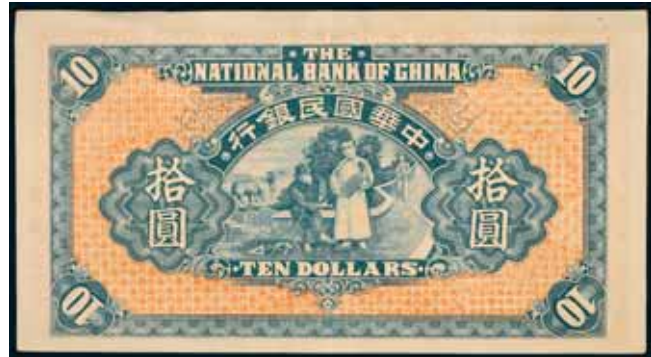
2235* China , National Bank of China, ten dollars, Canton, 1921, 112209 (P.516). Good extremely fine and very rare.