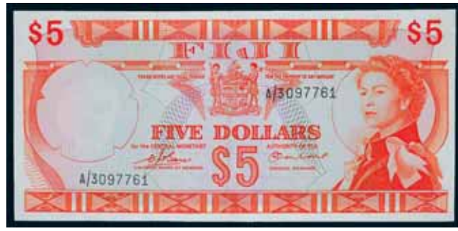
2306* Fiji , Central Monetary Authority of Fiji, Elizabeth II, five dollars, undated (1974), A/3 097761 (P.73b). Uncirculated.