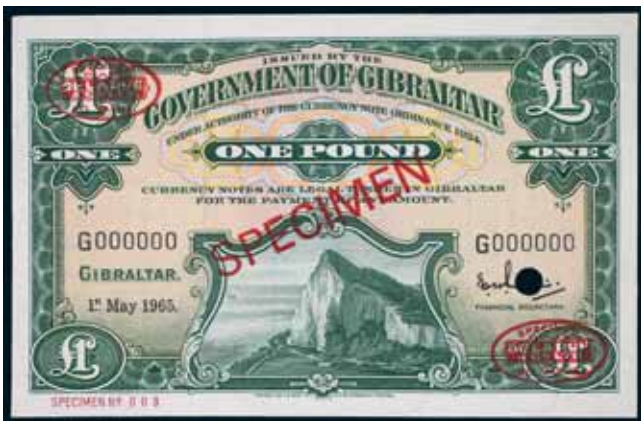
2348* Gibraltar , The Government of Gibraltar, del la Rue specimen one pound, 1st May 1965, G 000000, SPECIMEN in red diagonally front and back, de la Rue specimen lozenges in red top left and bottom right both sides, single punch hole cancellation at signature, SPECIMEN No. 003 at bottom left on front (P.18as). Uncirculated. $250