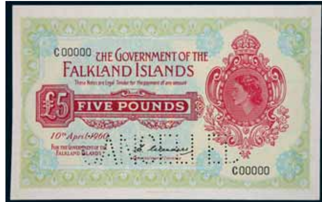
2264* Falkland Islands , The Government of the Falkland Islands, Elizabeth II, specimen five pounds, 10th April 1960, C 00000, CANCELLED perforated at signature (P.9as). Uncirculated and rare.