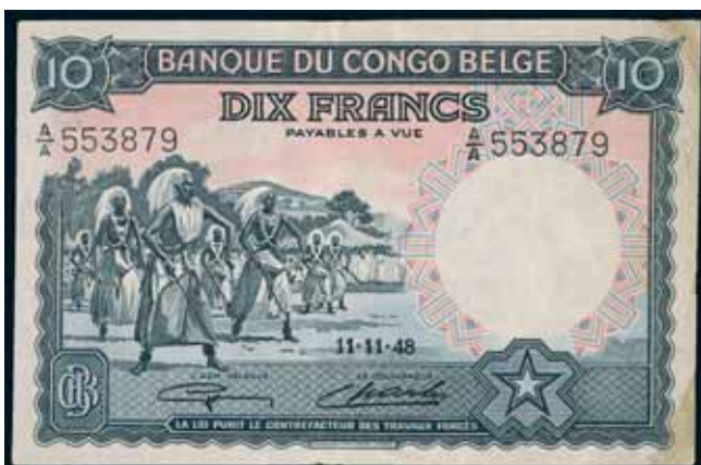
2188* Belgian Congo , Banque du Congo Belge, ten francs, 11.11.48, A/A 553879 (P.14E). Creases and folds, a little dirty on back, otherwise very fine. $100