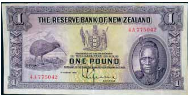
2113* Reserve Bank of New Zealand, L. Lefeaux, 1st August 1934, one pound, 4A 775042 (P.155). Dirty on back and tone spots top margin, a little faded, otherwise good very fine. $200