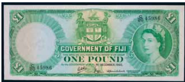
2286* Fiji , Government of Fiji, Elizabeth II, one pound, 1 December, 1965, C/20 45986 (P.53h). Virtually uncirculated.