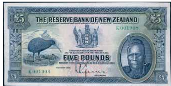
2117* Reserve Bank of New Zealand, L. Lefeaux, 1st August 1934, five pounds, K 001908 (P.156). Crisp original body, good very fine. $1,000