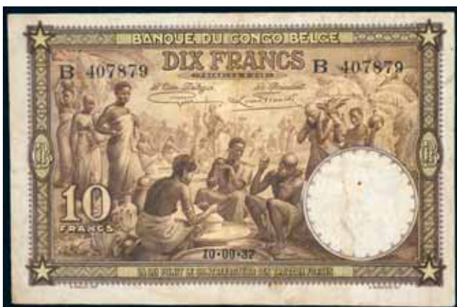
2186* Belgian Congo , Banque du Congo Belge, ten francs, 10.9.37, B 407879 (P.9). A little dirty, otherwise very fine and rare. $200