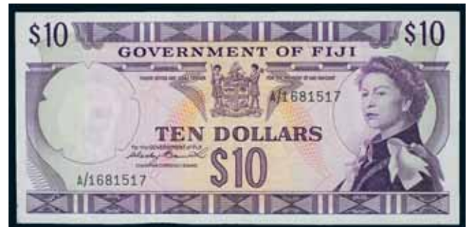
2299* Fiji , Government of Fiji, Elizabeth II, ten dollars, undated (1971), A/1 681517 (P.68a). Nearly uncirculated and rare thus. $200