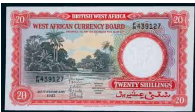
2204* British West Africa , West African Currency Board, twenty shillings, 20th February 1957, F/R 439127 (P.10a). Uncirculated. $250