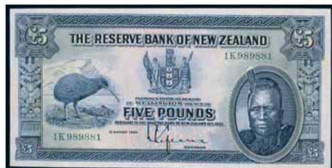
2118* Reserve Bank of New Zealand, L. Lefeaux, 1st August 1934, five pounds, 1K 989881 (P.156). Extremely fine. $750

Ex Noble Numismatics Sale 100 (lot 2818).