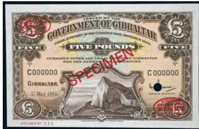
2351* Gibraltar , The Government of Gibraltar, del la Rue specimen five pounds, 1st May 1965, C 000000, SPECIMEN in red diagonally front and back, de la Rue specimen lozenges in red top left and bottom right both sides, single punch hole cancellation at signature, SPECIMEN No. 003 at bottom left on front (P.19as). Uncirculated. $300