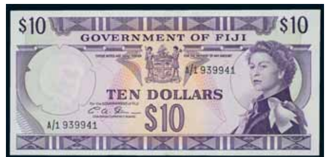
2301* Fiji , Government of Fiji, Elizabeth II, ten dollars, undated (1971), A/1 939941 (P.68b). Good extremely fine and rare thus. $150