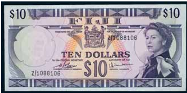
2312* Fiji , Central Monetary Authority of Fiji, Elizabeth II, ten dollars replacement note, undated (1974), Z/1 088106 (P.74cr). Uncirculated and rare thus.