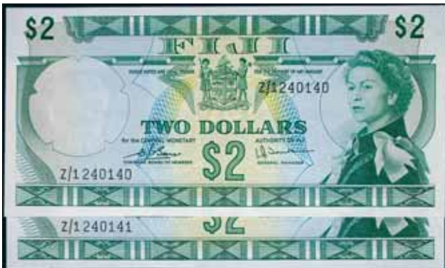
2304* Fiji , Central Monetary Authority of Fiji, Elizabeth II, two dollars replacement notes, undated (1974), Z/1 240140/1 consecutive pair (P.72c). Uncirculated and rare. (2)