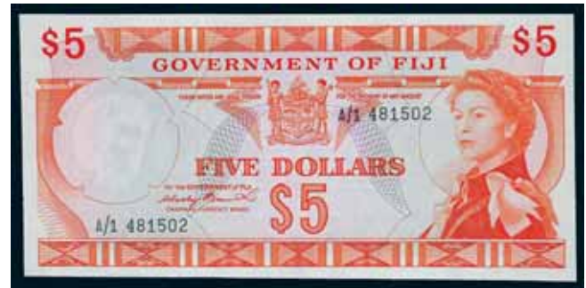
2298* Fiji , Government of Fiji, Elizabeth II, five dollars, undated (1971), A/1 481502 (P.67a). Uncirculated and scarce thus. $100