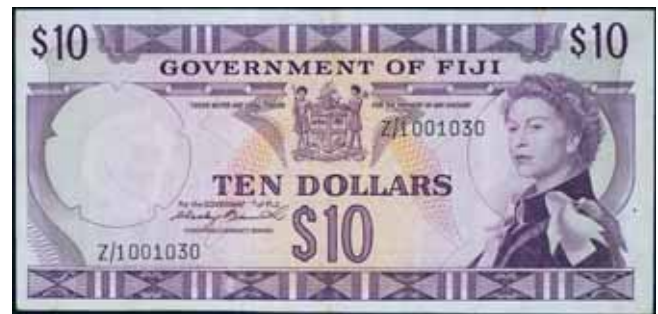
2300* Fiji , Government of Fiji, Elizabeth II, ten dollars replacement note, undated (1971 Currency Board issue), Z/1 001030 (P.68ar). Nearly extremely fine and very rare. $400