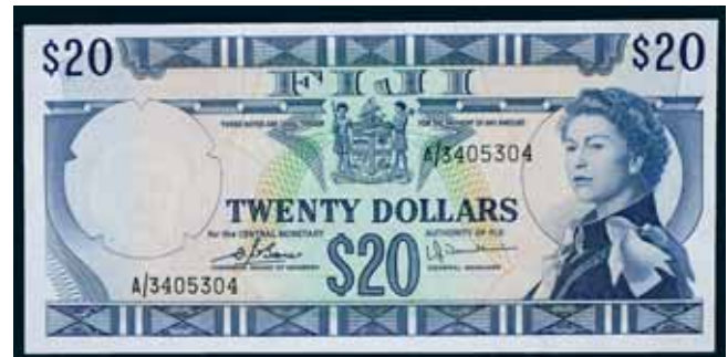
2314* Fiji , Central Monetary Authority of Fiji, Elizabeth II, twenty dollars, undated (1974), A/3 405304 (P.75c). Uncirculated.