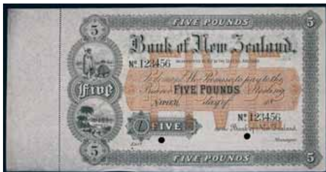
2092* Bank of New Zealand , specimen five pounds sterling, Napier, (18- printed), No. 123456, printed both sides, imprint of Bradbury Wilkinson & Co.Ld. Engravers & c. London, two punch hole cancellation at signature reserve (P.S192), with perforated sedge at left. Uncirculated.