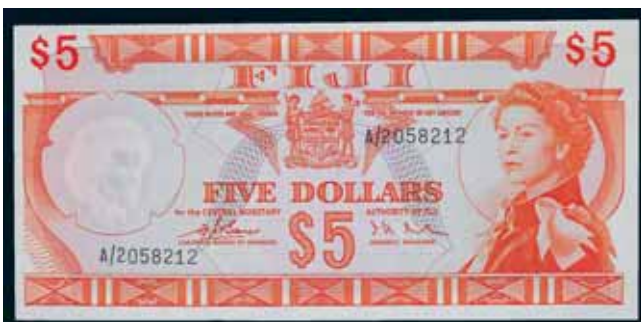
2305* Fiji , Central Monetary Authority of Fiji, Elizabeth II, five dollars, undated (1974), A/2 058212 (P.73a). Uncirculated and rare as such.