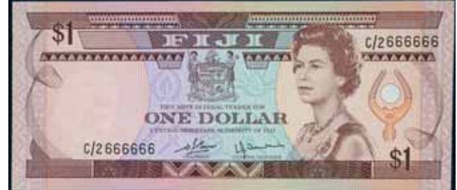
2315* Fiji , Central Monetary Authority of Fiji, Elizabeth II, one dollar, undated (1980), C/2 666666 (P.76a). Uncirculated, a rare solid number note.