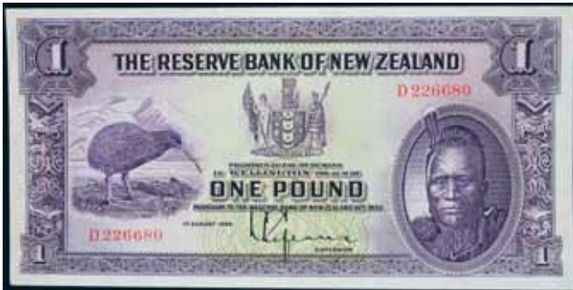
2112* Reserve Bank of New Zealand, L. Lefeaux, 1st August 1934, one pound, D 226680 (P.155). Flattened, very fine. $200