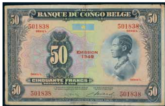
2191* Belgian Congo , Banque du Congo Belge, fifty francs, undated (1943-52), Series L, 501838, overprinted 'Emission/1949' (P.16g). Fine and scarce. $100