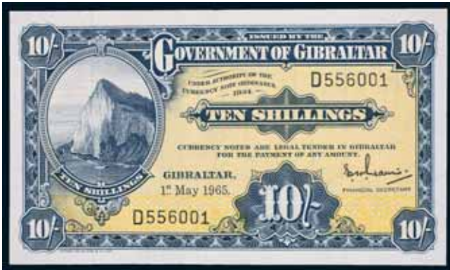
2347* Gibraltar , The Government of Gibraltar, ten shillings, 1st May 1965, D 556001 (P.17). Uncirculated. $150