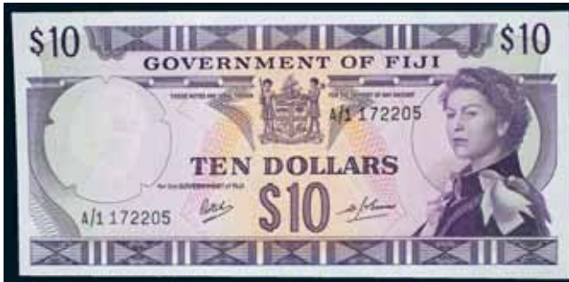
2295* Fiji , Government of Fiji, Elizabeth II, ten dollars, undated (1969), A/1 172205 (P.62a). Nearly uncirculated and rare thus. $250