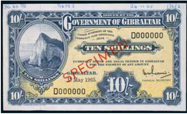
2346* Gibraltar , The Government of Gibraltar, specimen ten shillings, 1st May 1965, D 000000, SPECIMEN in red diagonally each side, printer's instructions 'SO 4638/96783/24-11-65/136/2' (P.17s). Nearly uncirculated. $250