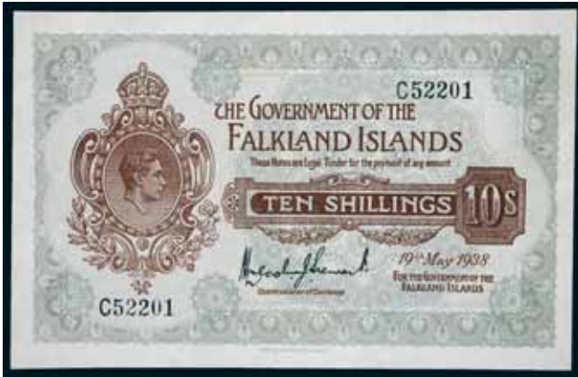
2261* Falkland Islands , The Government of the Falkland Islands, George VI, ten shillings, 19th May 1938, C 52201 (P.4). Uncirculated.