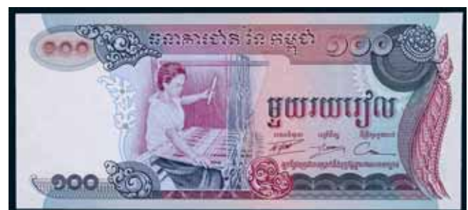
2208* Cambodia , Banque Nationale du Cambodge, printer's proof for one hundred riels, undated (1973), without serial numbers (P.15). Uncirculated. $150