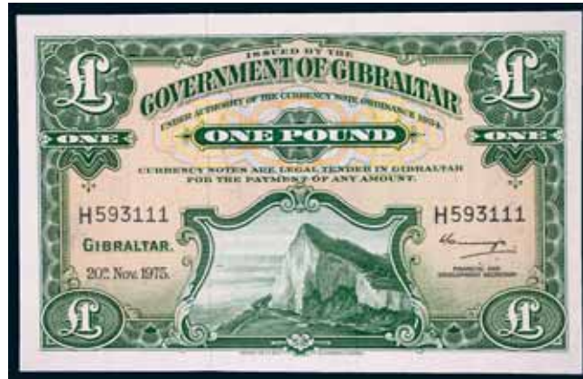
part 2350* Gibraltar , The Government of Gibraltar, one pound, 20th Nov. 1971, H 268471; another, 20th Nov. 1975, H 593111 (P.18b, c). Uncirculated, the second illustrated. (2) $150