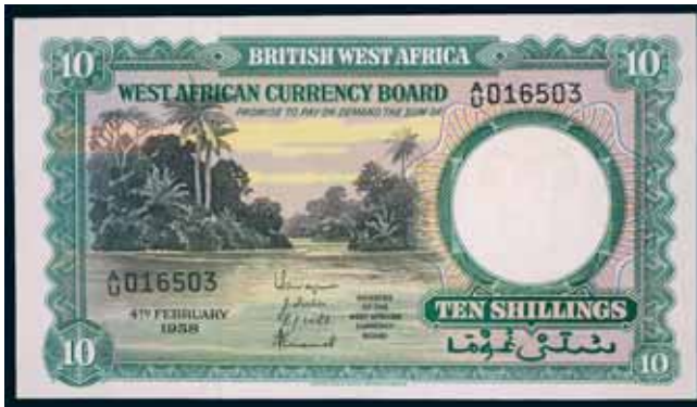
2203* British West Africa , West African Currency Board, ten shillings, 4th February 1958, A/U 016503 (P.9a). Uncirculated. $250