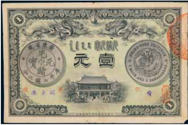
2231* China , Kwangtung Currency Bureau, one dollar, Guang Xu yr 31 (1905), serial number 813 (P.S2385). Creases and folds with small tear in top margin at centre fold, one small hole in body plus three pin holes, bottom right corner off, tone spots on back, otherwise fine and very rare.