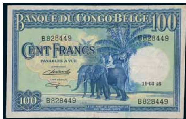
2192* Belgian Congo , Banque du Congo Belge, one hundred francs, 11.3.46, B 828449 (P.17c). Flattened of folds, a 3mm tear in top margin, otherwise good very fine and rare. $250