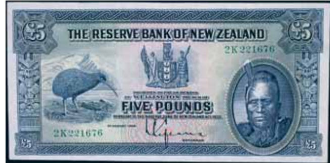
2116* Reserve Bank of New Zealand, L. Lefeaux, 1st August 1934, five pounds, 2K 221676 (P.156). Flattened, nearly extremely fine. $1,250