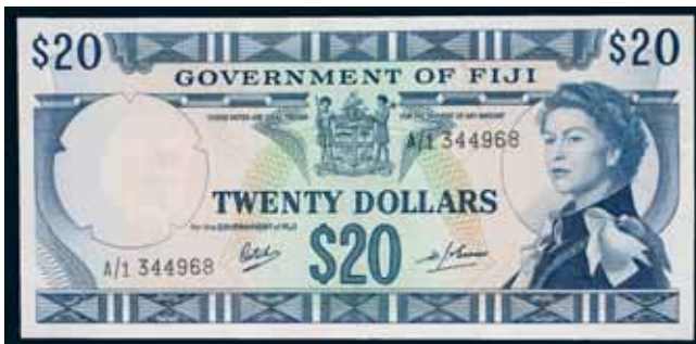
2296* Fiji , Government of Fiji, Elizabeth II, twenty dollars, undated (1969), A/1 344968 (P.63a). Virtually uncirculated and very rare thus. $500