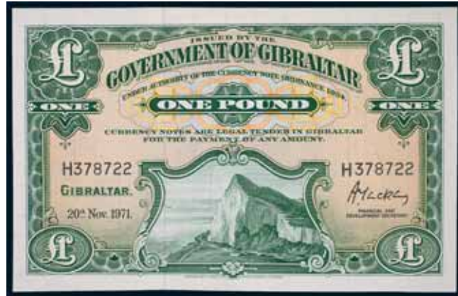
2349* Gibraltar , The Government of Gibraltar, one pound, 20th Nov. 1971, H 378722 (P.18b). Uncirculated. $80