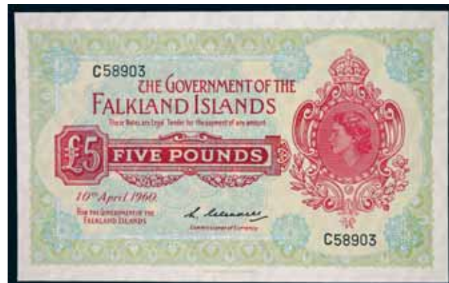
2265* Falkland Islands , The Government of the Falkland Islands, Elizabeth II, five pounds, 10th April 1960, C 58903 (P.9a). Uncirculated and rare.