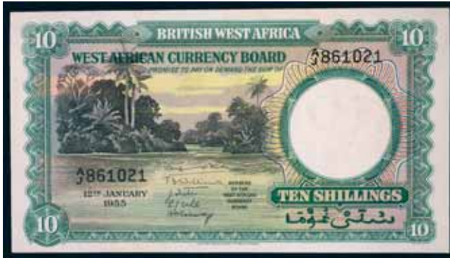
2202* British West Africa , West African Currency Board, ten shillings, 12th January 1955, A/J 861021 (P.9a). Uncirculated. $250