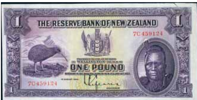
2114* Reserve Bank of New Zealand, L. Lefeaux, 1st August 1934, one pound, 7C 459124 (P.155). A 1cm tear in top margin, otherwise good very fine. $180