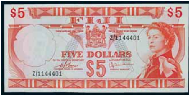
2309* Fiji , Central Monetary Authority of Fiji, Elizabeth II, five dollars replacement note, undated (1974), Z/1 144401 (P.73cr). Uncirculated and rare thus.