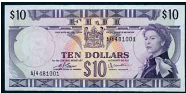
2311* Fiji , Central Monetary Authority of Fiji, Elizabeth II, ten dollars, undated (1974), A/4 481001 (P.74c). Uncirculated.