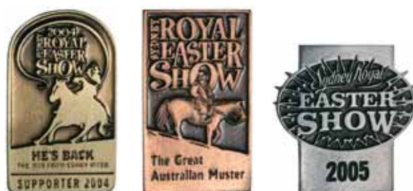
lot 3533 part