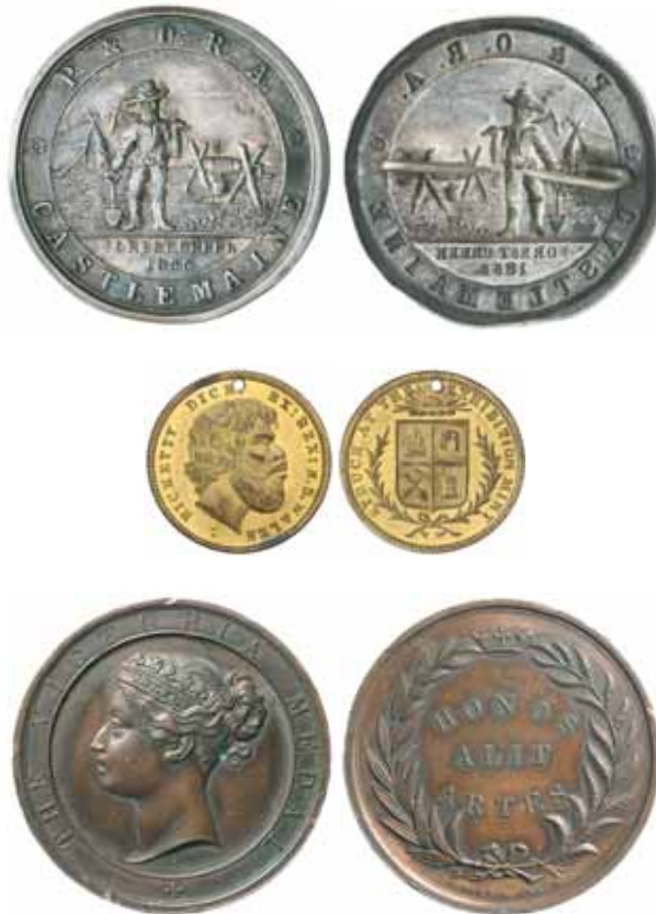
lot 3594 part