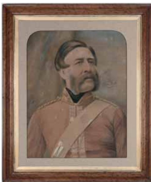
Henry Halloran c1860-65 (Portrait unattributed) (Ex State Library of New South Wales)