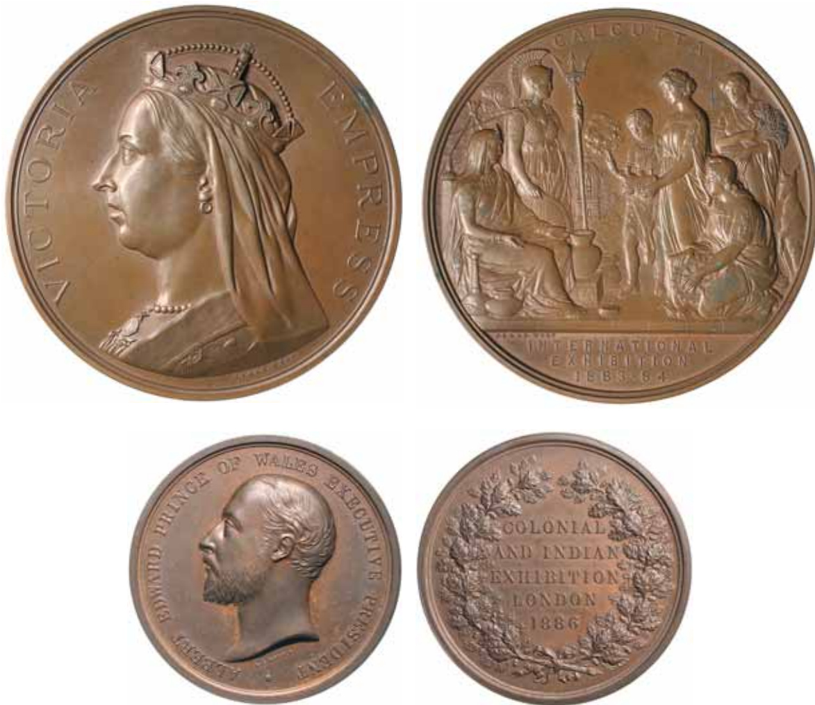
lot 3599 part

Sold with research including typed list.