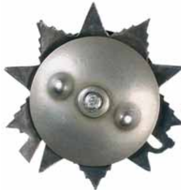
5212* Russia , USSR, Order of the Patriotic War Second Class, numbered on reverse, 536489. Nearly extremely fine.