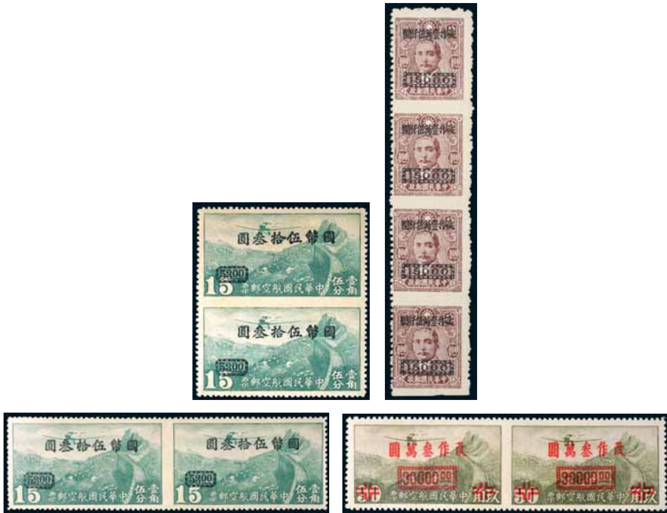
lot 5441 part