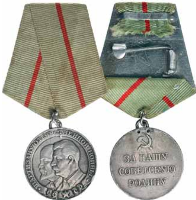
5217* Russia, USSR, Partisan Medal First Class in silver. Edge bumps, fine.