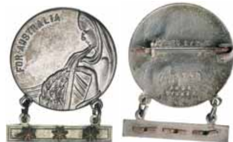
5245* Australia , WWII, Mothers and Widows badge with three stars, No.A17791. Extremely fine.