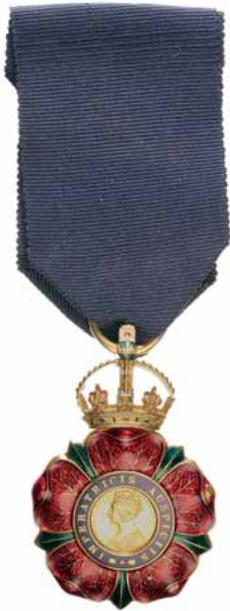
5118* The Most Eminent Order of the Indian Empire, Companion (CIE), breast badge. In Garrard & Co case, extremely fine. $1,200