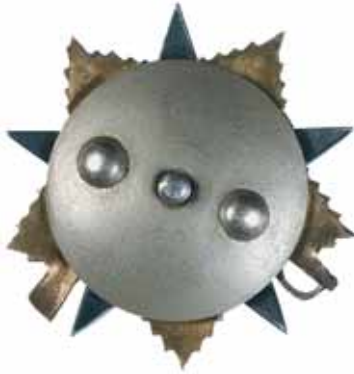
5211* Russia , USSR, Order of the Patriotic War First Class, numbered on reverse, 61249. Good very fine and an earlier issue.