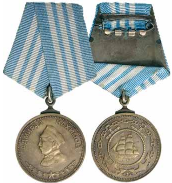
5219* Russia, USSR, Nakhimov Medal in brass, numbered on edge, 3011. Toned, good very fine and rare.