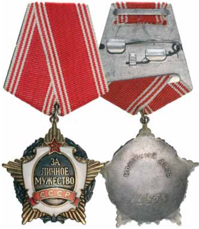
5216* Russia, USSR, Order of Personal Courage, (type 1) in silver and enamel, numbered 00953 on reverse, together with book no.926096 that accompanies the award with matching serial number 00953, date of award 7 November 1989 to (name in Russian text). Cased, uncirculated and rare.