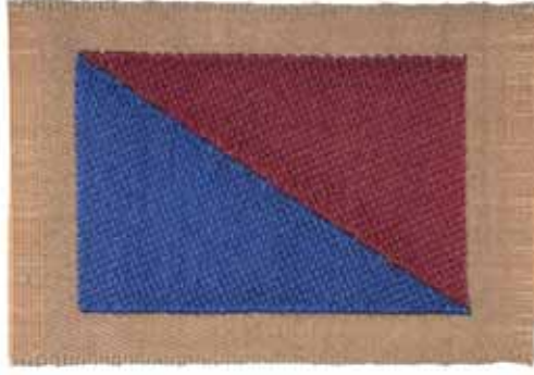
5240* Australia , WWI, 1st Australian Division Artillery, pair of original opposing woven cloth colour patches. Condition as issued, rare.