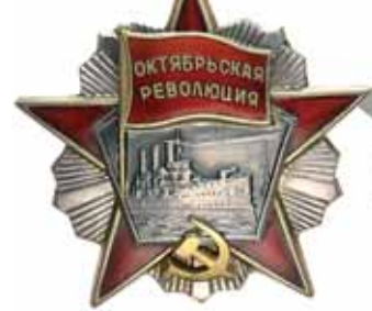
5214* Russia , USSR, Order of the October Revolution, numbered on reverse, 108282. Extremely fine.