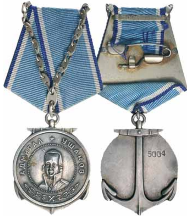
5218* Russia, USSR, Ushakov Medal in silver, numbered on reverse, 5004. Good very fine and scarce.