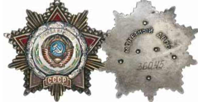
5215* Russia , USSR, Order of Friendship of Peoples, numbered on reverse, 36045. Good very fine.