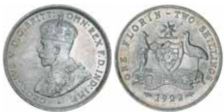
1329* George V, 1922. Nearly uncirculated and scarce thus.