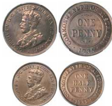
1293* George V , Melbourne Mint proof penny and halfpenny, 1935. Slight toning on the penny, both brilliant, the halfpenny full mint red, FDC and rare as such. (2)