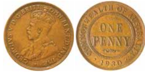
1430* George V , 1930 Indian die. Fine/good fine and rare. $20,000

Ex Noble Numismatics Sale 81 (lot 1546).