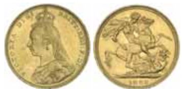
1248* Queen Victoria , 1889 Sydney (McD.178a). Subdued mint bloom, uncirculated.