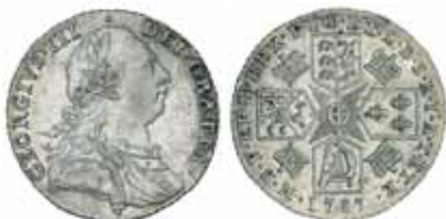
1173* Great Britain , George III, shilling, 1787 (S.3746) 1 over retrograde 1 variety. Nearly extremely fine.