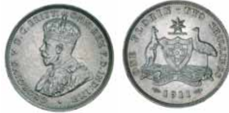
1312* George V , 1911. Mark behind King's neck, otherwise nearly uncirculated/uncirculated and rare.