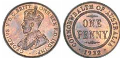
1433* George V , 1932. Some mint red, nearly uncirculated. $150

Ex Spink Australia Sale 14 (lot 965) and Noble Numismatics Sale 94 (lot 1692).