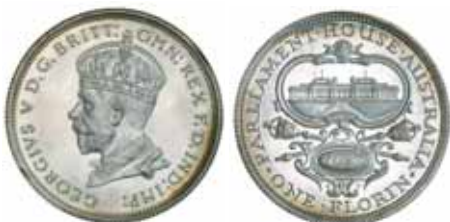
1291* George V , Melbourne Mint, proof florin 1927 Canberra. Nearly FDC.