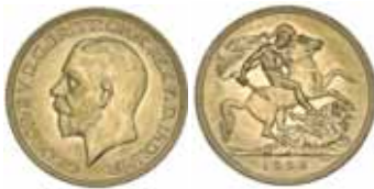
1266* George V , small head, 1929 Melbourne. Nearly uncirculated and rare.