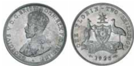
1333* George V, 1925. Considerable original mint bloom, uncirculated.