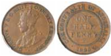
1449* George V, 1923. Even brown, good very fine. In a slab by PCGS as XF45. $1,500