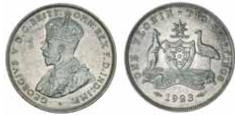
1330* George V, 1923. Lightly toned, subdued underlying original mint bloom, well struck uncirculated/choice uncirculated.

Ex 1921 Hoard, Noble Numismatics Sale 88A (lot 1611, illustrated on the front cover) and Sale 112 (lot 1846).