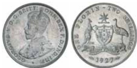
1336* George V , 1927. Full original frosted mint bloom, uncirculated.