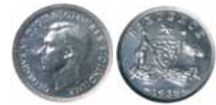
1297* George VI , Melbourne Mint proof sixpence, 1938. Brilliant, FDC and rare.

Private purchase from The Rare Coin Company.