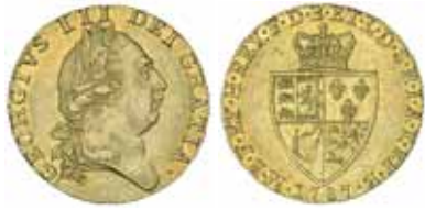
1169* Great Britain , George III, guinea, fifth bust or spade type, 1787 (S.3729). Nearly extremely fine.