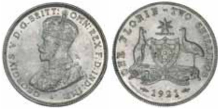
1326* George V, 1921. Considerable original mint bloom, uncirculated and rare in this condition, one of the finest in the 1921 Hoard.