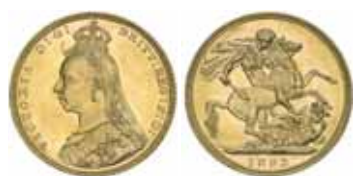
1251* Queen Victoria , Jubilee head, 1893 Melbourne. Nearly uncirculated/uncirculated.