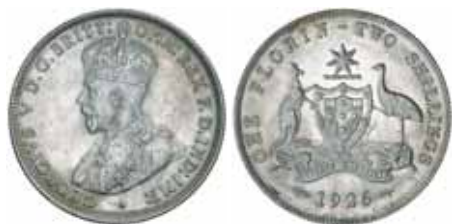
1335* George V , 1926. Nearly uncirculated/uncirculated and scarce thus.