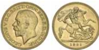
1267* George V , small head, 1931 Melbourne. Good extremely fine/nearly uncirculated, very scarce.