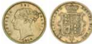
1270* Queen Victoria , 1882 Sydney. Nearly very fine and rare.