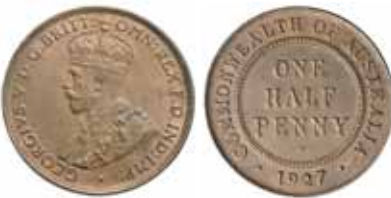
1453* George V, 1927 and 1929. Grey brown with some red and relatively unmarked, nearly uncirculated. (2) $250