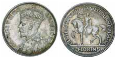
1349* George V , 1934-35 Melbourne Centenary. Deep olive tone, nearly uncirculated. $350

Ex S.J.Green Collection, from Australian Coin Auctions Sale 310 (lot 1381).