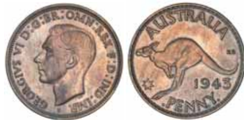
1298* George VI , Bombay Mint proof restrike penny, 1943. Struck from clashed reverse die, streaky tone, probably has been cleaned and re-toning, extremely fine and very rare.