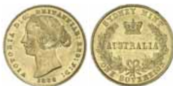
1201* Queen Victoria , second type, 1866. Frosty mint bloom, extremely fine.

Ex Noble Numismatics Sale 72 (lot 1254).