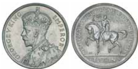
1348* George V , 1934-35 Melbourne Centenary. Well struck, nearly uncirculated. $450