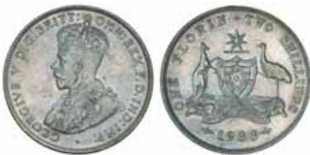
1342* George V , 1933. Light scratches above emu, otherwise light grey tone over subdued original mint bloom, uncirculated and rare in this condition. $2,250