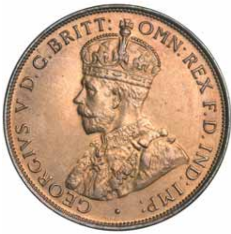
1294* George V , Melbourne Mint proof penny, 1935. Subdued nearly full mint red, fingerprint on reverse, nearly FDC and rare.