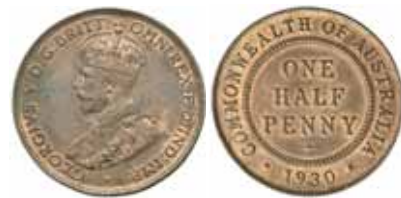
1454* George V, 1930. Much mint red, toning on obverse and small verdigris spot, otherwise nearly uncirculated. $120