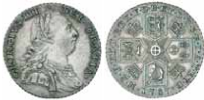
1171* Great Britain , George III, shilling 1787, without semees of hearts (S.3743). Blue grey toned, extremely fine/good extremely fine.