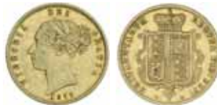
1269* Queen Victoria , 1879 Sydney. Very fine.