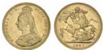
1247* Queen Victoria , Jubilee head, 1887 Sydney (McD.174). Good very fine and scarce thus.