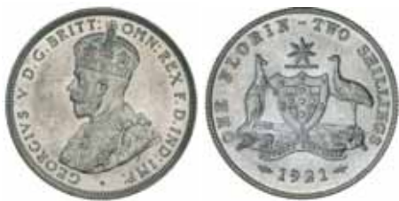
1327* George V, 1921. Full frosty original mint bloom, uncirculated or slightly better and rare in this condition.