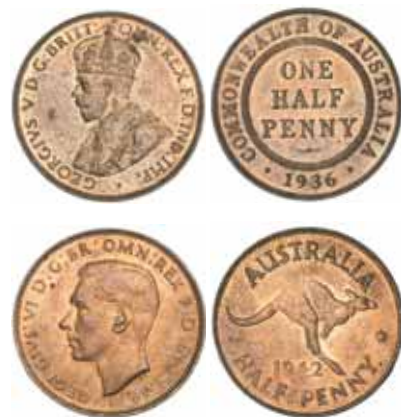
part 1457* George V, 1933 and 1936; George VI, 1938 and 1942I. Considerable mint red, nearly uncirculated - uncirculated. (4) $200