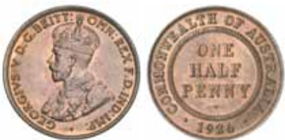
1452* George V, 1926. Much mint red, nearly uncirculated. $150