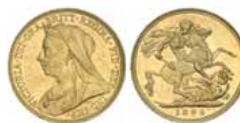
1253* Queen Victoria , 1894 and 1899 Sydney. Subdued original mint bloom, uncirculated. (2)

Ex Barry McGown Scott Collection, the 1894S, 1899S and 1901M from P.Brooks 17/12/98, the 1899P from Monetarium, five others described as from Australian Coin Auctions 18/10/05, 1898S from Sale 275 (lot 1162) (23/5/01).