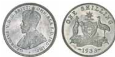
1368* George V, 1933. Full original frosty mint bloom, choice uncirculated and rare, especially in this condition.