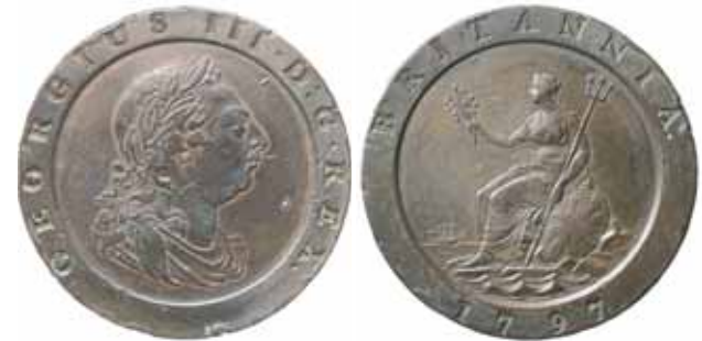
part 1177* Great Britain , George III, shilling and sixpence, 1787 (S.3743, 8); twopenny and penny, 1797 (S.3776, 7); halfpenny and farthing, 1799 (S.3778, 9); India, EIC, Bengal Presidency, silver rupee (1793) and Mexico, Charles IV, eight reales 1790FM countermarked H, portrait of Charles III. Nearly fine - extremely fine. (8)