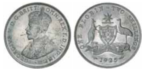
1332* George V, 1925. Slightly toning, full underlying mint bloom, uncirculated/choice uncirculated.