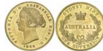
1203* Queen Victoria , second type, 1868. Full mint bloom, uncirculated.