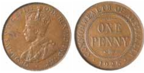
1428* George V , 1925 London die. Horizontal line on neck and blobs on E die state, extremely fine or better and rare thus. $2,500