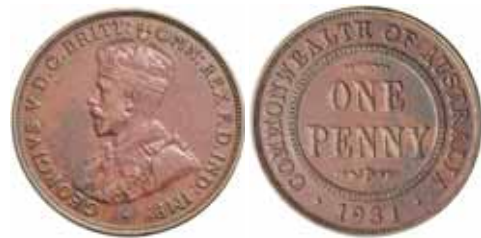
1432* George V , 1931, dropped 1 Indian die. Six pearls, reverse rim bruise at 12 o'clock, slight surface disturbance on right reverse, otherwise very fine and extremely rare. $2,000