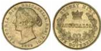
1199* Queen Victoria , second type, 1862. Good extremely fine and rare.