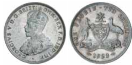
1331* George V, 1923. Attractive toning around the highlights on the reverse, minute hairline scratch under the kangaroo, otherwise choice uncirculated and rare in this condition.