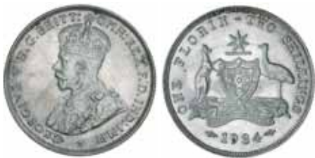
1343* George V , 1934. Full original mint bloom, light toning and dark edge toning, uncirculated. $750