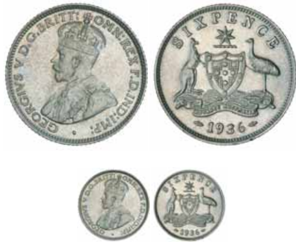
1295* George V , Melbourne Mint proof sixpence, 1936. Nearly FDC and extremely rare.