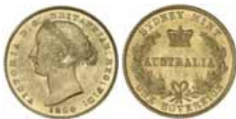
1200* Queen Victoria , second type, 1864. Full original mint bloom, choice uncirculated and rare in this condition, one of the finest known.