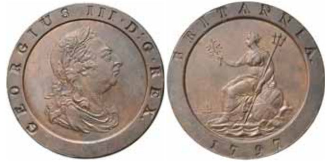
1175* Great Britain , George III, cartwheel twopenny, 1797 (S.3776). Extremely fine.