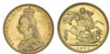
1250* Queen Victoria , 1892 Melbourne. Gem uncirculated and rare in this state.