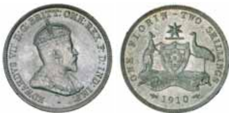
1310* Edward VII , 1910. Full frosted original mint bloom, minor contact marks on jaw, otherwise choice uncirculated.