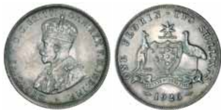
1334* George V , 1926. Matte mint bloom, hairline to right of star, otherwise uncirculated and rare.