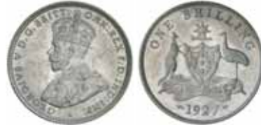
1367* George V, 1927. Frosted mint bloom, nearly uncirculated.