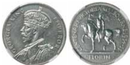
1292* George V , Melbourne Mint proof florin, 1934-35 Melbourne Centenary. Nearly FDC and very rare thus.