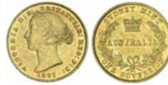
1202* Queen Victoria , second type, 1867. Good very fine/extremely fine.

Private purchase from Spink Australia in 1979.