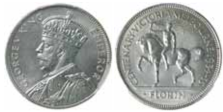
1346* George V , 1934-35 Melbourne Centenary. Uncirculated. $450