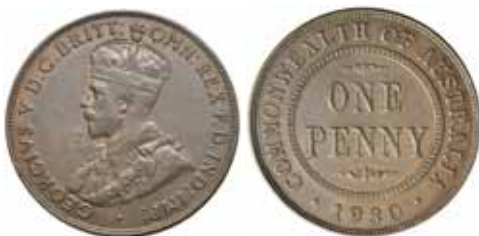
1429* George V , 1930, Indian die. Well struck, very fine and rare, especially in this condition. $25,000

Ex Spink Australia Sale 14 (lot 965) and Noble Numismatics Sale 94 (lot 1692).