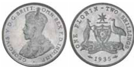
1350* George V , 1935. Specimen-like strike, unmarked choice or near gem uncirculated and rare thus. $1,200

Ex Noble Numismatics Sale 107A (lot 1504).