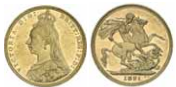
1249* Queen Victoria , 1891 Sydney. Surface marks, mint bloom, nearly uncirculated.