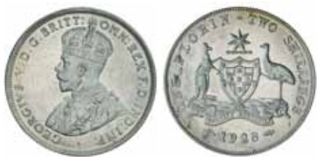
1338* George V , 1928. Full mint bloom with orange-peel appearance of fields, uncirculated.