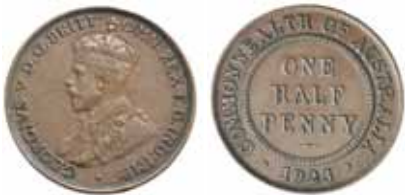
1450* George V, 1923. Six pearls and centre diamond, peripheral breaks either side, contact marks on the obverse, otherwise good very fine. $1,000