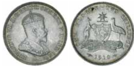
1311* Edward VII , 1910. Lightly toned, nearly uncirculated.