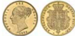
1268* Queen Victoria , 1875 Sydney. Good extremely fine and rare in this condition.