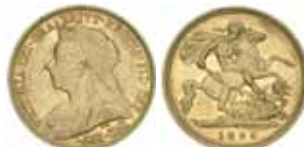
1271* Queen Victoria , 1896 Melbourne. Good very fine.