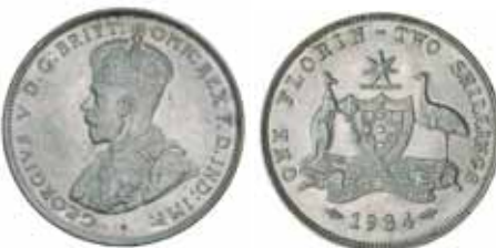
1344* George V , 1934. Lightly toned subdued mint bloom, uncirculated. $600