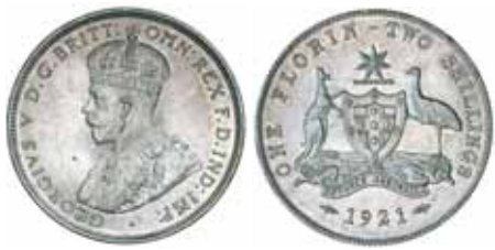
1328* George V, 1921. Well struck for this, uncirculated and rare thus.