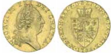
1170* Great Britain , George III, guinea, fifth bust or spade type, 1788 (S.3729). Good very fine.