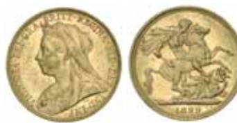
1254* Queen Victoria , 1899 Melbourne. Nearly uncirculated/uncirculated.