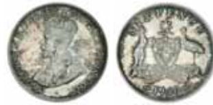
1296* George V , Melbourne Mint specimen or proof sixpence, 1936. Uneven patchy toning, otherwise nearly FDC and extremely rare.

Private purchase from The Rare Coin Company.