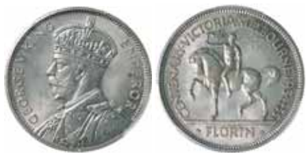
1345* George V , 1934-35 Melbourne Centenary. Full frosty mint bloom, uncirculated. $600

Ex Noble Numismatics Sale 107A (lot 1504).