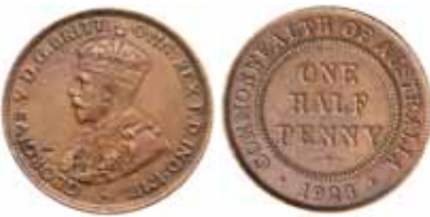
1451* George V, 1923. Porous surface (acid cleaned), otherwise nearly very fine. $1,000