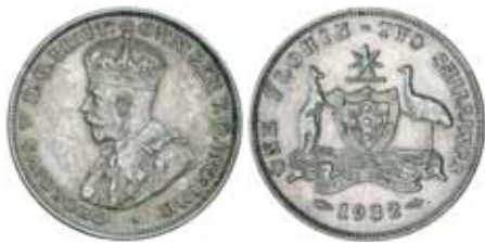
1341* George V , 1932. Toned with fractional wear only, nearly extremely fine and rare in this condition for the key date. $1,250