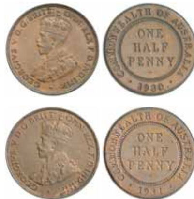
1455* George V, 1930 and 1931. Toned, good extremely fine; extremely fine. (2) $100