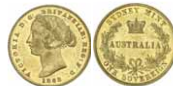
1204* Queen Victoria , second type, 1868. Nearly full original mint bloom, uncirculated.

Ex Noble Numismatics Sale 71 (lot 1301).