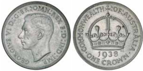
1309* George VI , 1938. Subdued mint bloom, contact mark on neck and cheek, otherwise uncirculated.