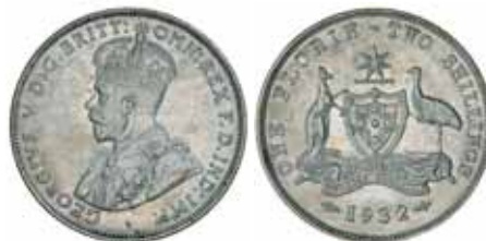
1340* George V , 1932. Some mint bloom, lightly toned, nearly uncirculated and rare in this condition.