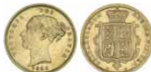
1272* Queen Victoria , 1886 Sydney. Good very fine/nearly extremely fine.