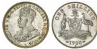
1366* George V, 1920M. Subdued original mint bloom, nearly uncirculated.