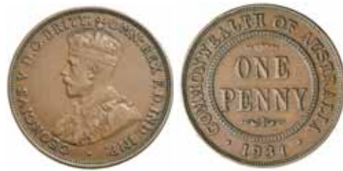
1431* George V , 1931, dropped 1 Indian die. Six pearls, even brown patina, nearly very fine and extremely rare, one of the finest known. $3,000