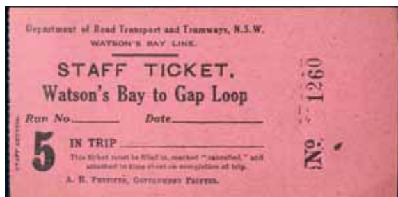
lot 2208 part