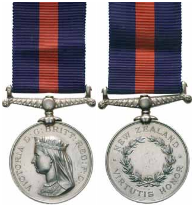
3499* New Zealand Medal 1869 , undated reverse. 3826. Pte. J.Boyd. 68/Foot. Engraved. Contact marks, otherwise good very fine.