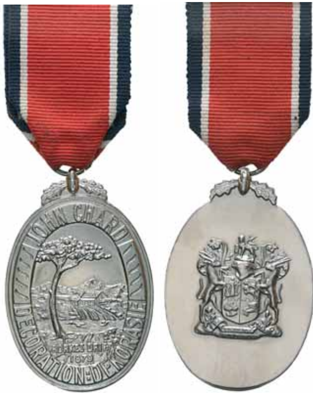
3618* John Chard Decoration , un-voided acorn on suspender and no rim on reverse, in chromed brass. Extremely fine.