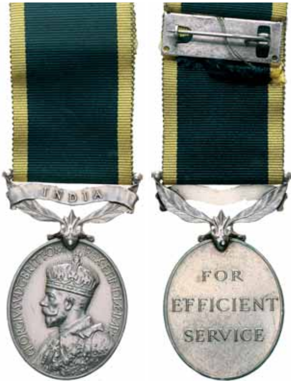
3527* Efficiency Medal, (GVR), with suspension for India. Sjt. C.Morris, 3 Fd. Bty. R.A., A.F.I. Impressed. Some contact marks, otherwise very fine.