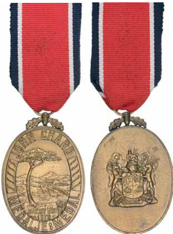
3619* John Chard Medal , voided acorn on suspender, in bronze, bottom edge impressed with number 1370. Good very fine.