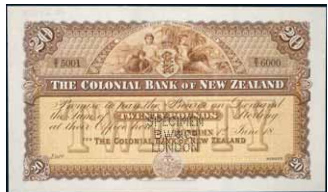
3779* The Colonial Bank of New Zealand , second issue, specimen twenty pounds, Dunedin, 1st June 18-, pencilled top left margin Oct 30 89, S/T 5001/6000 (P.S269Ae). Uncirculated and rare.