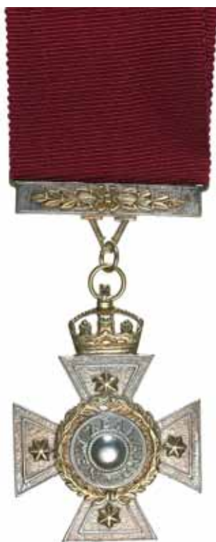
3491* New Zealand Cross, instituted 1869. A silver and gilt copy, on the reverse centre is marked in running script, Replica, but most of this has been erased. In fitted case, very fine.