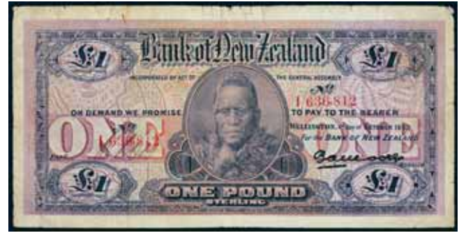
3777* Bank of New Zealand , uniform issue, one pound, Wellington 1st October 1932, I 636,812, straight bank name, imprint of Bradbury Wilkinson & Co Ltd, New Malden, Surrey (P.S234b; Clifford D921g). Small tears in margins, otherwise nearly fine.