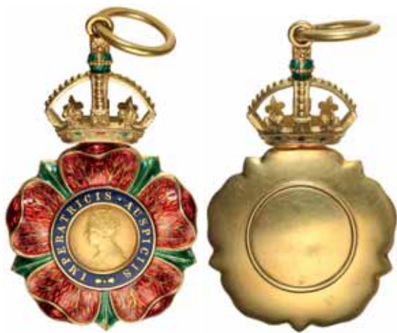
3490* The Most Eminent Order of the Indian Empire, Companion (CIE) neck badge, smaller version without INDIA on Lotus petals. No ribbon, otherwise extremely fine.