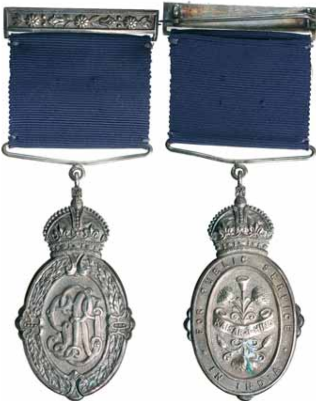
3496* Kaiser-I-Hind Medal , Second Class (GVIR), in silver, with brooch suspender. Unnamed as issued. Toned extremely fine.