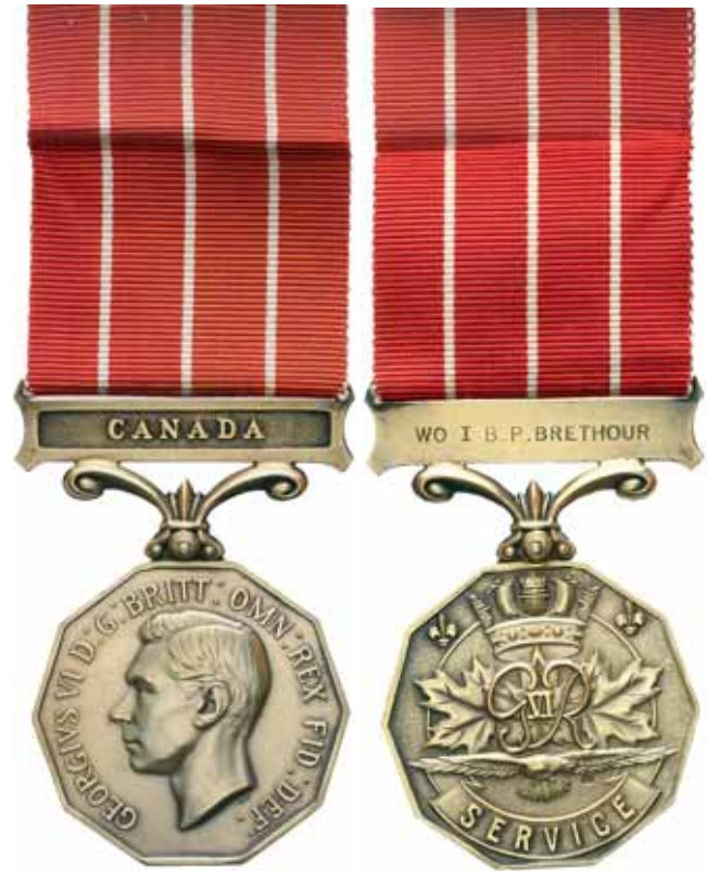
3533* Canadian Forces' Decoration, (GVIR), in silver-gilt with GVIR cypher superimposed on Maple leaves on reverse, Canada suspension bar and engraved on the reverse of this bar, WO I B.P.Brethour. Good very fine.