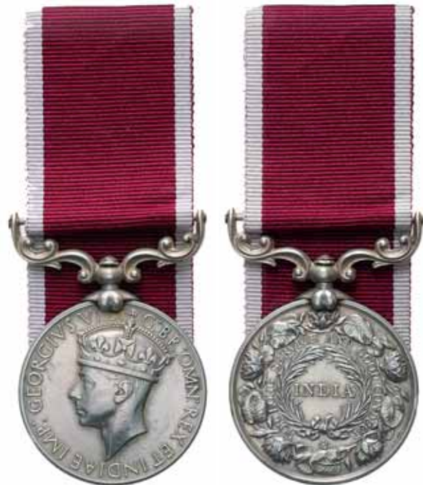
3530* Indian Army Long Service and Good Conduct Medal, (GVIR). 1164 Sowar Jagat Singh, 7 Lt. Cav. Impressed. Some contact marks and small edge bump on reverse, otherwise very fine.

3 Fd. Bty. R.A., A.F.I. (3 Field Battery, Royal Artillery, Auxiliary Force India).