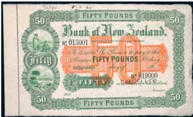
3775* Bank of New Zealand , third issue, specimen fifty pounds, Wellington, 19-, No. 015001/019000 (P.S195), inked in top margin 5/3743 8.6.20. Extremely fine and very rare.