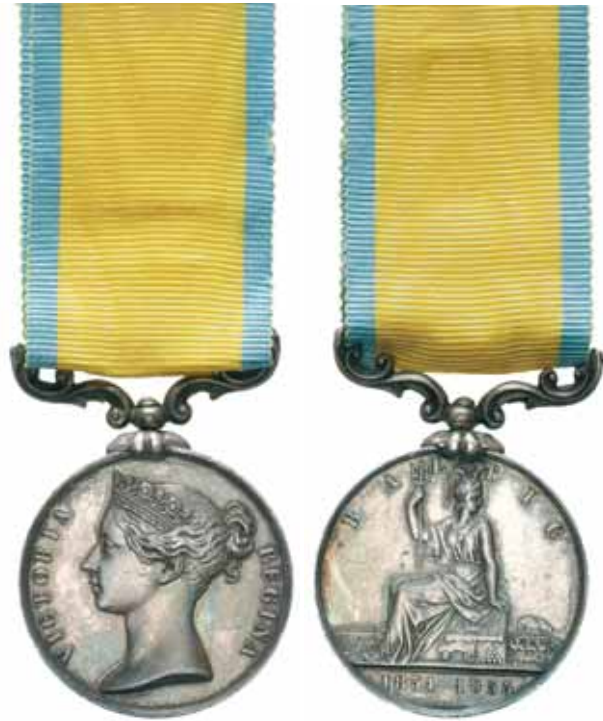
3497* Baltic Medal 1854-55 . Unnamed as issued. A few minor edge nicks, nicely toned, extremely fine.