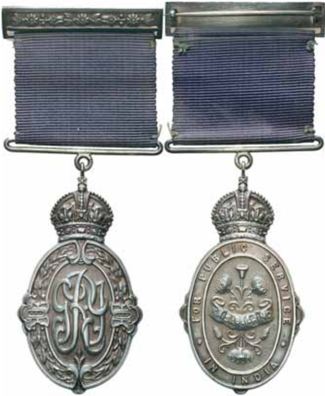
3495* Kaiser-I-Hind Medal , Second Class (GRI), type 2 in silver, with brooch suspender. Unnamed as issued. Ribbon faded, toned nearly extremely fine.