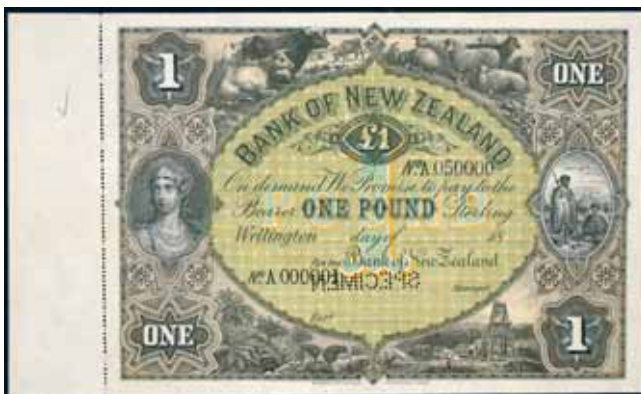
3776* Bank of New Zealand , fourth issue, specimen one pound, Wellington, 18-, No. A 050000/000001 (P.S202). Nearly uncirculated.