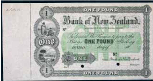
3774* Bank of New Zealand , second issue, specimen one pound, Dunedin, 18-, inked in broad left margin 3 July 72 (P.S191). Nearly uncirculated and rare.