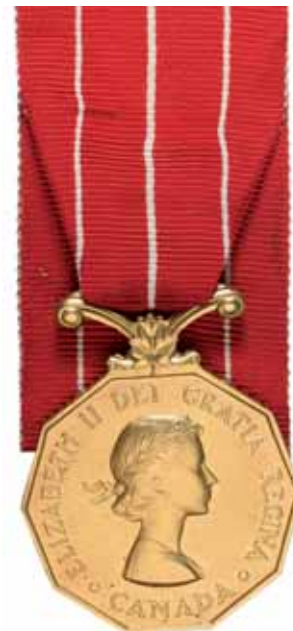
3534* Canadian Forces' Decoration, (EIIR), in gilded tombac brass, type without Canada suspension bar but with Canada below bust of Queen and with no cypher on Maple leaves, edge impressed, Sgt J.H.Ross. Nearly uncirculated.

Nig. R.R.W.A.F.F. (Nigeria Regiment Royal West Africa Frontier Force).