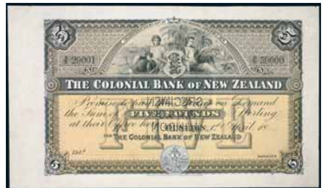
3778* The Colonial Bank of New Zealand , second issue, five pounds, Dunedin, 1st April 18-, S/X 29001/39000 (P.S268). Nearly uncirculated and very rare.