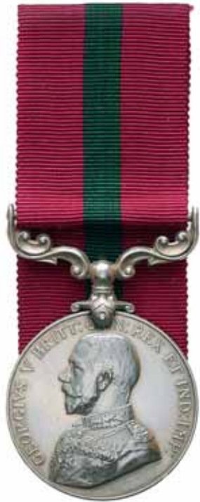
3532* Royal West Africa Frontier Force Long Service and Good Conduct Medal, (GVR type 2 with word Royal on reverse). 1313 Pte. Imoru Kele., Nig. R.R.W.A.F.F. Impressed. Contact marks, otherwise very fine.

With copy of published details of promotion.