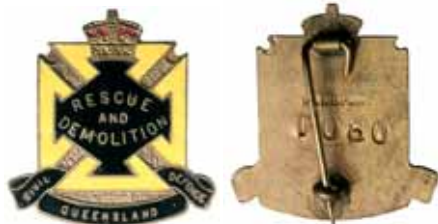
lot 3653 part