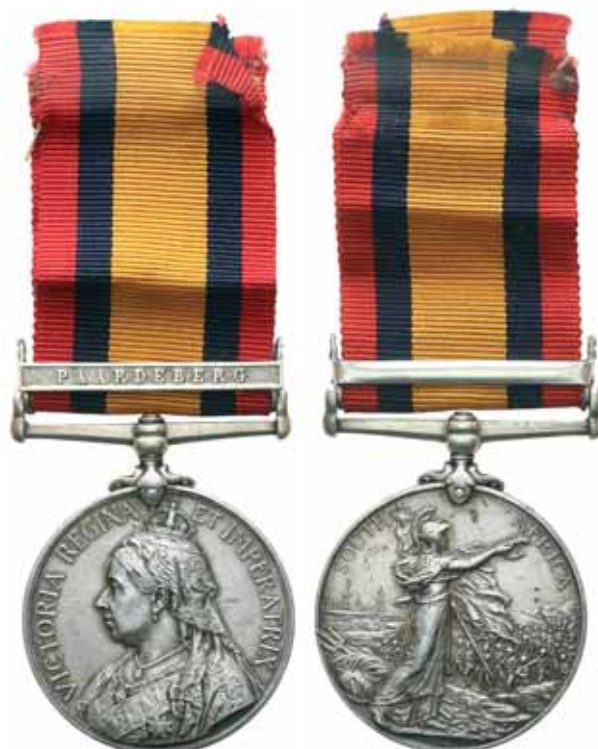
3573* Queen's South Africa Medal 1899 , type 3 reverse, - clasp - Paardeberg. 16170 Pte J.McBean. Rand Rifles. Impressed. Tiny edge nick on reverse and a few small marks in the fields, otherwise good very fine.