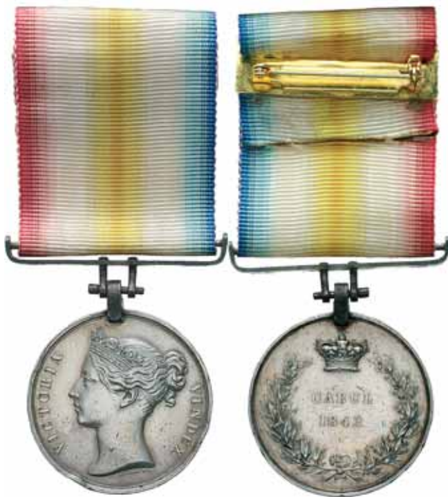
3541* Candahar, Ghuznee, Cabul Medal 1841-42 , with reverse Cabul. John O'Neill XIII PALI. Engraved and renamed. Swing mounted with modern brooch bar, edge nicks and contact marks, otherwise fine.