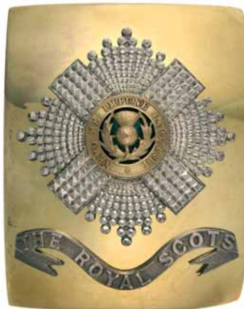
3795* Great Britain , Royal Scots, Officer's full dress cross belt plate, in silver, gilt and enamel (95x75mm). Good very fine.