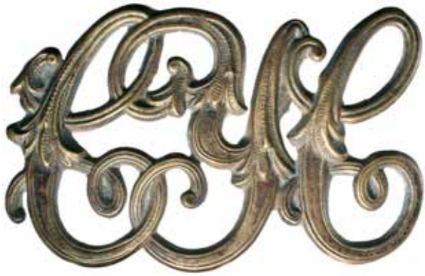
3792* New Zealand , WWI, 1st Mounted Rifles (Canterbury Yeomanry Cavalry) pouch badge in brass (O.5.10). Very fine.