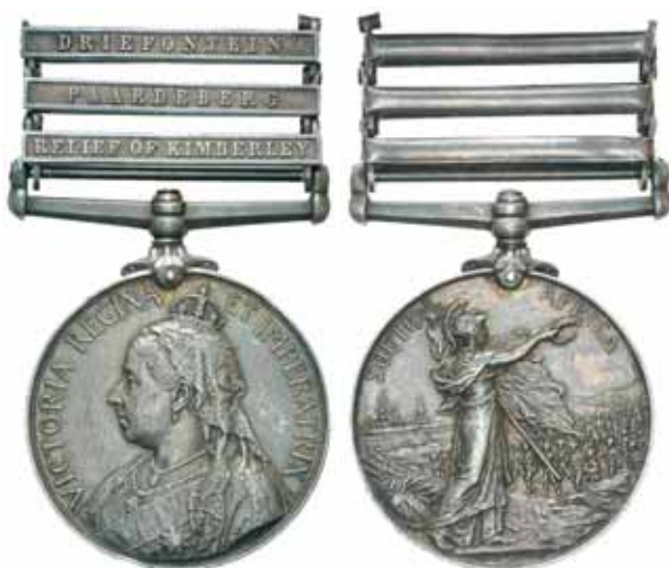
3572* Queen's South Africa Medal 1899 , (type 2 reverse with ghost dates), - three clasps - Relief of Kimberley, Paardeberg, Driefontein. 3686. Pte: C.Foster. 6/Drgn:Gds. Officially engraved. No ribbon, thin scratches on obverse field and on Queen's cheek, small edge bump, otherwise good fine.