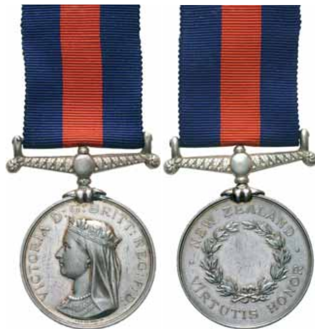
3547* New Zealand Medal 1869, undated reverse. 1403. J.Smith 65th Regt. Impressed. Contact marks, otherwise very fine.

Together with basic information sheet on medal.