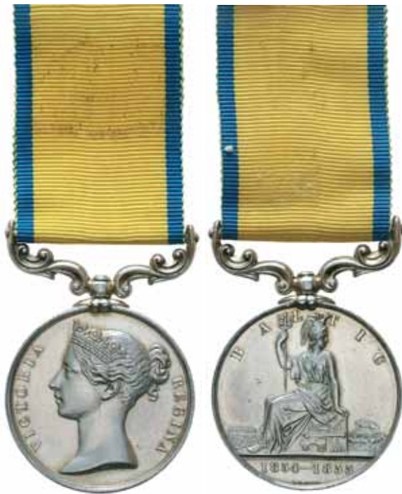
3544* Baltic Medal 1854-55. Unnamed as issued. Ribbon with adhesive tape residue, medal with small edge nicks and hairlines, otherwise extremely fine.