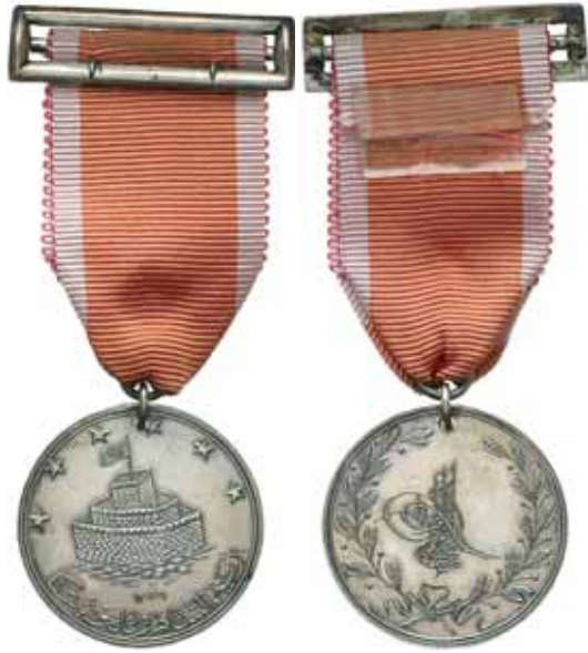
3540* St Jean D'Acre Medal 1840 , in silver for junior officers, with ribbon buckle bar. Ribbon faded, otherwise nearly uncirculated.