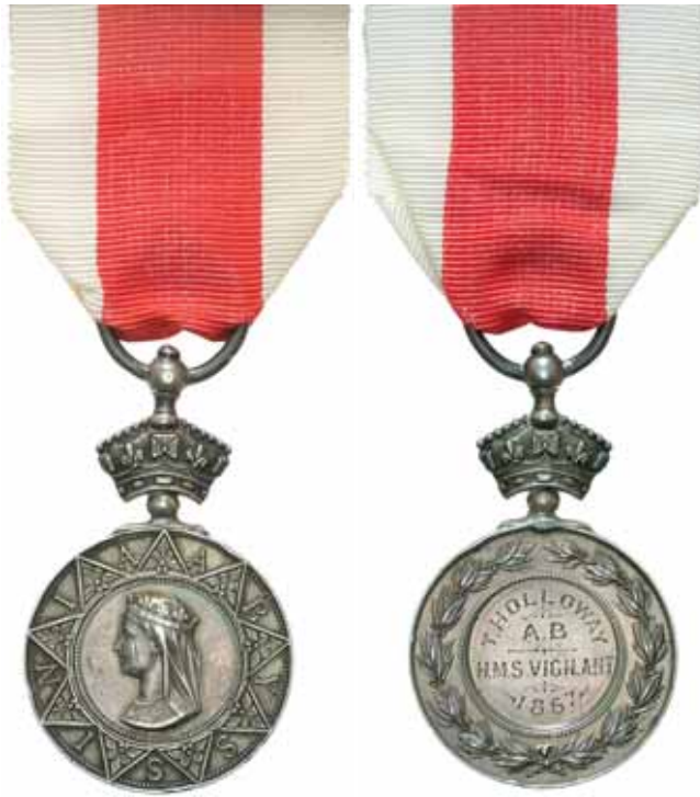
3548* Abyssinian War Medal 1867-68. T.Holloway A.B H.M.S.Vigilant 1867. Engraved. Some small edge bumps, otherwise very fine.