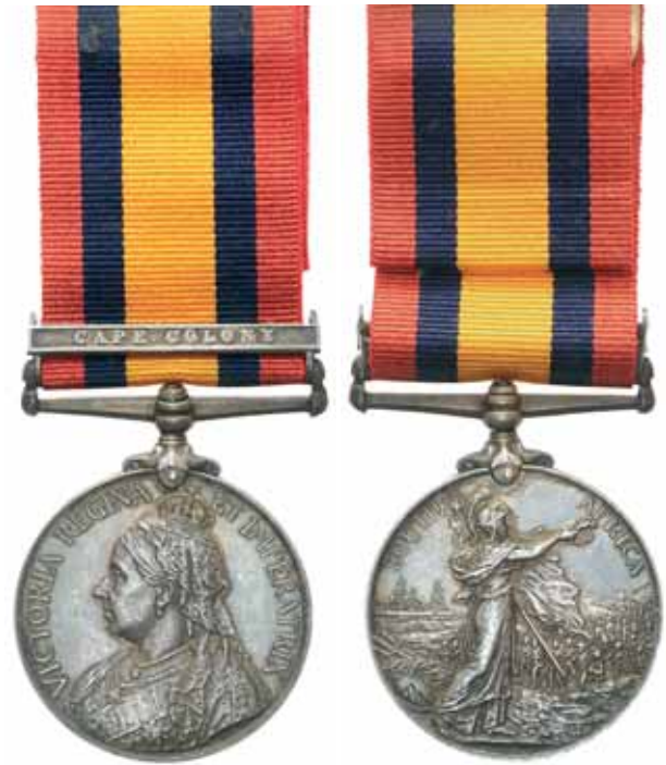
3652* Queen's South Africa Medal 1899 , - clasp - Cape Colony. 206 Pte C.L. Maddox Tasmanian I.B. Impressed. Very fine .