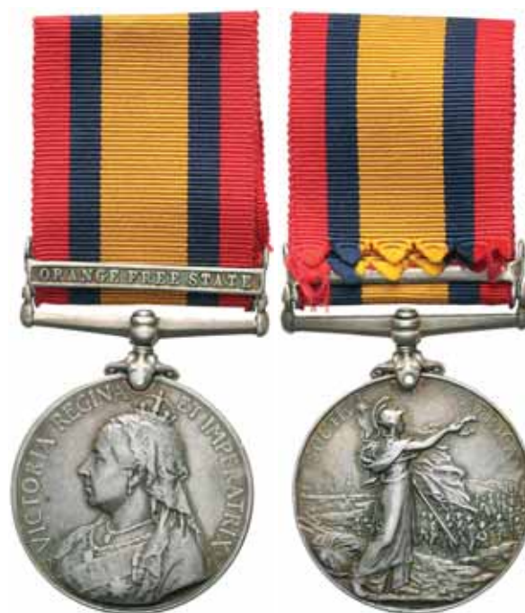
3574* Queen's South Africa Medal 1899 , (type 3 reverse), - clasp - Orange Free State. 36115 L.Corpl: G.F.W.Pilgrim. 31st Coy Imp:Yeo: Impressed. Good fine.