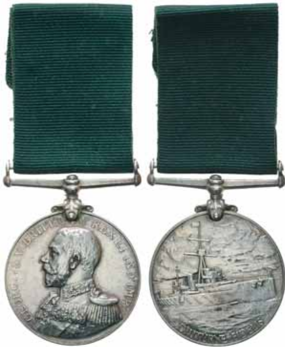
3673* Royal Naval Reserve Long Service and Good Conduct Medal , (GVR type 1). V.465. H.Thompson, Sto., R.N.R. Impressed. Good very fine.