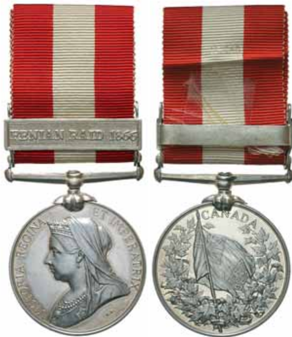
3549* Canada General Service Medal 1866-70, clasp - Fenian Raid 1866. CWM Specimen. Pantographed. Extremely fine.