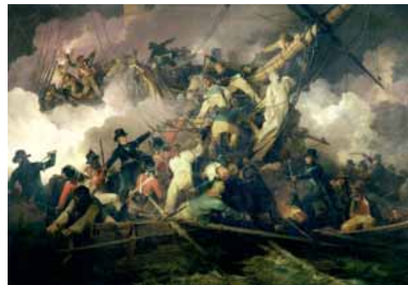
The Cutting-Out of the French Corvette 'La Chevette' 21st July 1801, painting by Philip James de Loutherbourg in British Museum & Art Gallery (Wikimedia Commons)