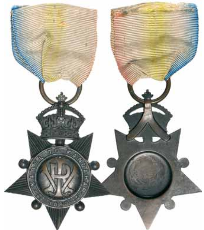
3551* Kabul to Kandahar Star 1878-80. Unnamed as issued. Ribbon dirty but with spare new ribbon, toned, good very fine.