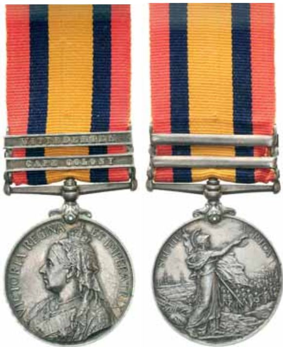
3563* Queen's South Africa Medal 1899 , (type 3 reverse), - two clasps - Cape Colony, Wittebergen. 9924 Pte H.S.Hodgkin, 4th Coy 1st Impl:Yeo: Impressed. A few small edge bumps, otherwise nicely toned and extremely fine.

39509 Pte Jas Fred Bullock, Cape Medical Staff Corps, joined 25Nov1901.