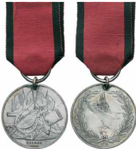
3545* Turkish Crimea Medal 1855-56, British issue. Unnamed. Extremely fine but with obverse striking metal flaw below the Toughra and flaw on reverse at inscription on cloth over canon.