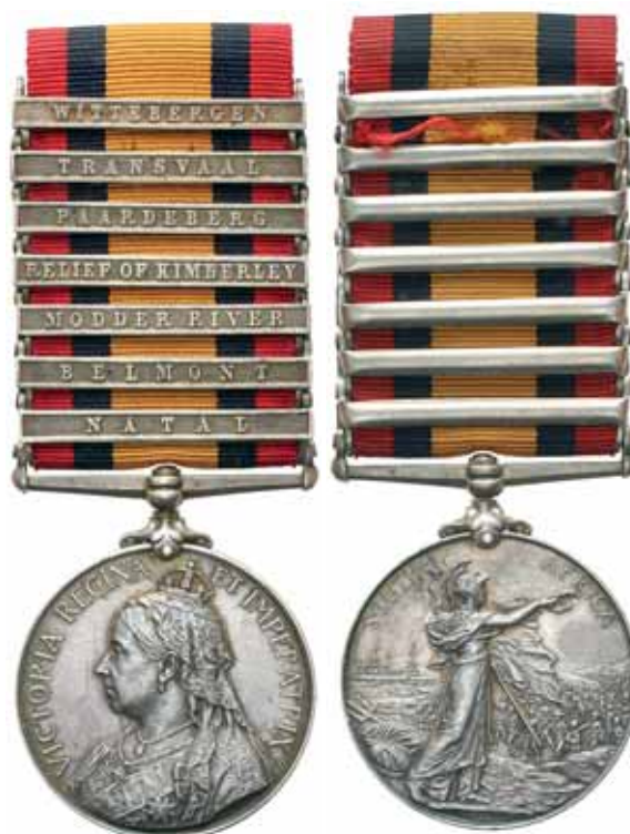
3570* Queen's South Africa Medal 1899 , (type 2 reverse), - seven clasps - Natal, Belmont, Modder River, Relief of Kimberley, Paardeberg, Transvaal, Wittebergen. 4232. Pte. A.F.Warren. 9/Lcrs. British Army engraved. Nicely toned, a few vertical scratches in front of Queen's head, otherwise extremely fine. $900