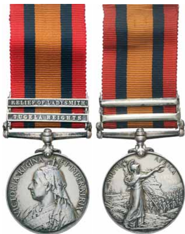
3569* Queen's South Africa Medal 1899 , - two clasps - Tugela heights, Relief of Ladysmith. 3271 Pte A.Gander Rl.W.Surrey Regt. Impressed. Fine. $750

2nd Royal West Surrey Regiment. KIA 18Feb1900 Ladysmith.