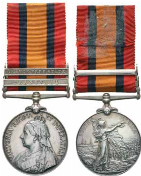
3575* Queen's South Africa Medal 1899 , (type 3 reverse), - two clasps - Transvaal, Orange Free State. 6827 Pte H. Warburton, Rifle Brigade. Impressed. Adhesive tape residue on back of ribbon, some contact marks and hairlines and edge bump and nicks on reverse of medal, otherwise good very fine. $150