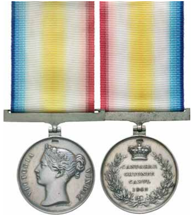
3542* Candahar, Ghuznee, Cabul Medal 1841-42 , with reverse Candahar, Ghuznee, Cabul. Private James Jefferies HM 40th Regt. Engraved. With lug backed mounting bar, replacement suspender, otherwise good very fine.