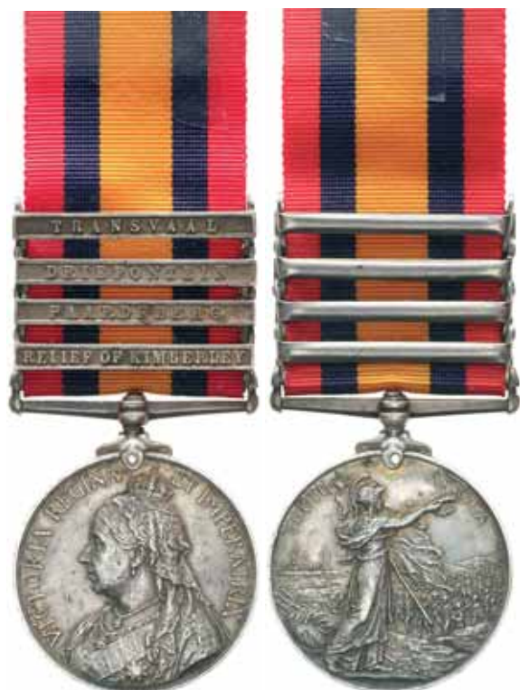
3571* Queen's South Africa Medal 1899 , (type 2 reverse), - four clasps - Relief of Kimberley, Paardeberg, Driefontein, Transvaal. 5105 Pte F.Fisher, 1st Essex Regt. Impressed. Toned, contact marks, otherwise very fine.