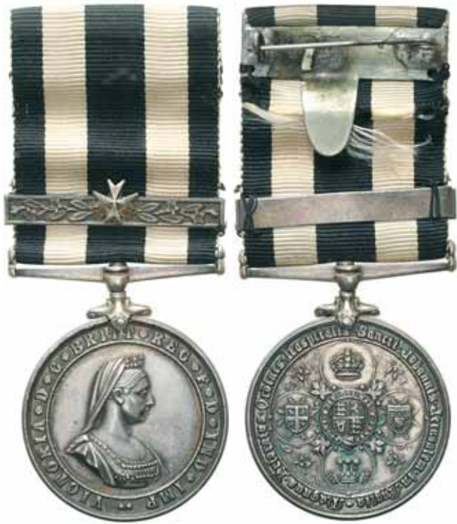
3600* Service Medal of the Order of St John , in silver with straight bar suspension and bar (second type) for additional 5 Years and attached is a Maltese Cross for another 5 Years Service. 6074. Pte. J.W.Bailey. Carshalton Div. No, 1 Dis. S.J.Ab. 1927. Engraved. Swing mounted with brooch bar (repaired at back), good very fine.