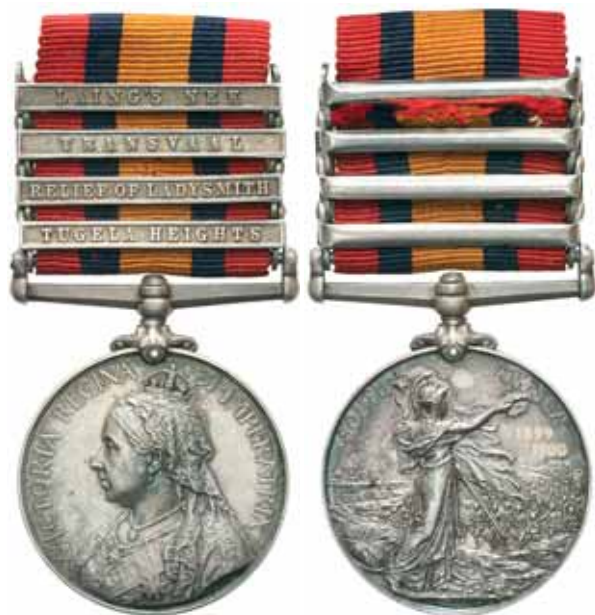
3568* Queen's South Africa Medal 1899 , (type 2 reverse with clear ghost dates), - four clasps - Tugela Heights, Relief of Ladysmith, Transvaal, Laing's Nek. 4908 Pte W.Johnston. Scottish Rifles. Impressed. Nicely toned, extremely fine. $250