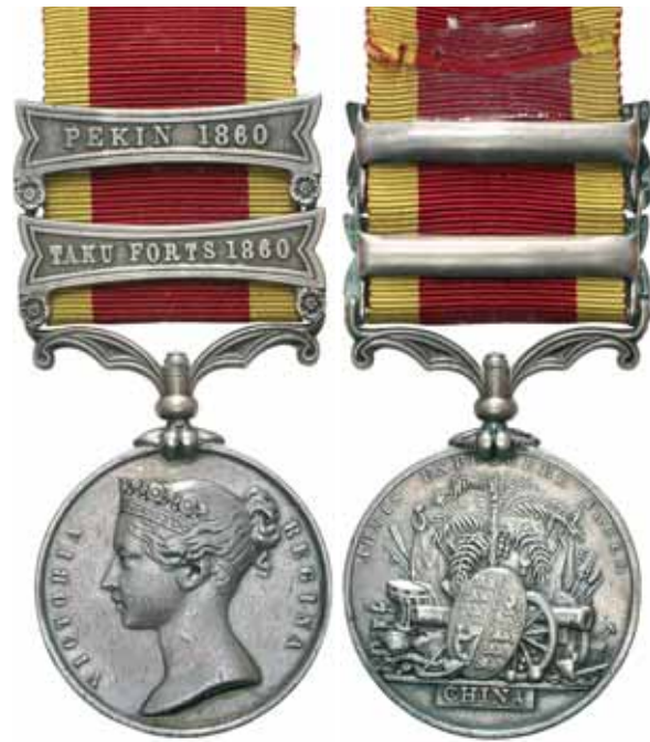
3546* Second China War Medal 1857-60, - two clasps - Taku Forts 1860, Pekin 1860. Chas Elgar, 1st Bn Mil. Train. Impressed and renamed. Contact marks and a few small edge nicks, otherwise very fine.