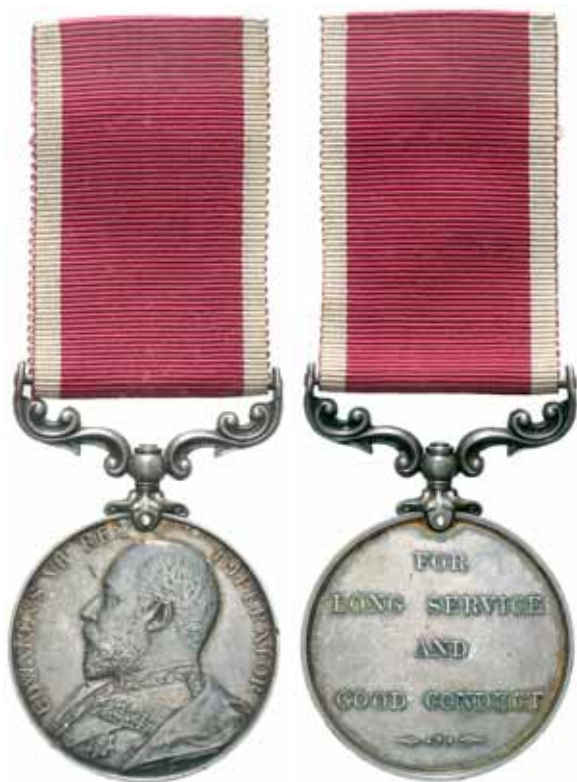
3595* Army Long Service and Good Conduct Medal, (EVIIR). 24914 Cpl T.Salter. R.E. Impressed. Small scratch in front of forehead, nicely toned, good very fine.