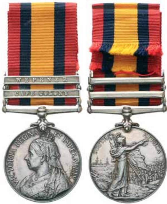
3562* Queen's South Africa Medal 1899 , (type 3 reverse), - two clasps - Cape Colony, Wepener. 5019 Cpl J.Bayes. Brabant's Horse. Impressed. Light hairlines, otherwise good very fine, Wepener clasp scarce to South African unit.