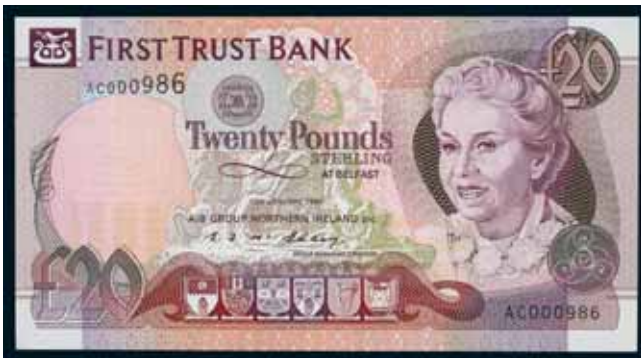
4001* Northern Ireland , First Trust Bank, twenty pounds, Belfast, 10th January 1994, AC 000986 (P.133a). Uncirculated.