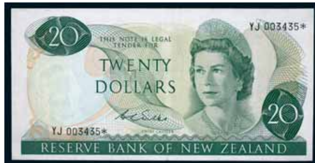
4107* Reserve Bank of New Zealand , D.L.Wilks (1968-75), twenty dollars star replacement note, YJ 003435* (P.167b). Extremely fine.