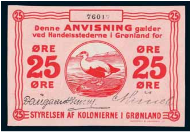
3965* Greenland , State Notes, Styrelsen Af Kolonierne I Grønland, twenty five ore, undated (1913) 76017 (P.11b). Uncirculated.