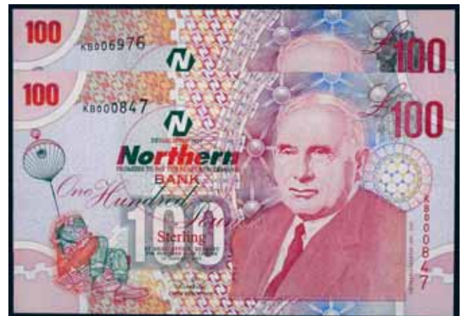
4011* Northern Ireland , Northern Bank, one hundred pounds, Belfast, 19 January 2005, KB 000847, 006976 (P.209a). Uncirculated. (2)