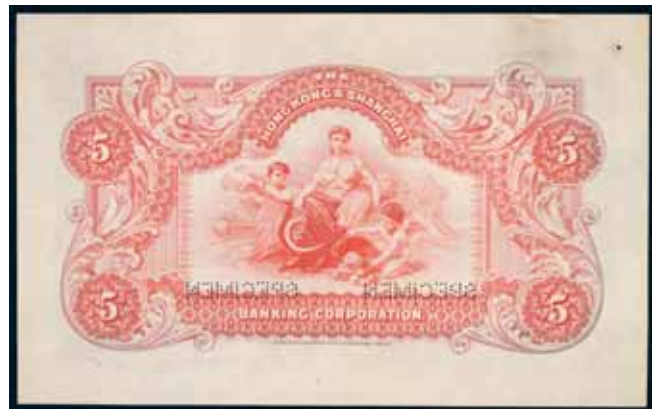
lot 3850 back

Ex W.J.Baker Collection from Spink Australia Sale 34 (lot 2679).