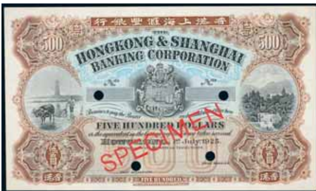
3967* Hong Kong , The Hong Kong and Shanghai Banking Corporation, specimen five hundred dollars, Hong Kong 18 July 1925 by Waterlow & Sons Ltd London four punch hole cancellation plus specimen o/p-red, imprint Bradbury Wilkinson & Co Ltd (P.170). Nearly uncirculated and very rare.

In a holder by PMG as 40 Extremely Fine.