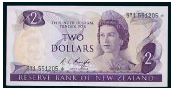
4112* Reserve Bank of New Zealand , R.L.Knight (1975-77), two dollars star replacement notes, 9Y1 551205* (P.164c). A mere hint of a centre bend, virtually uncirculated and rare as such.