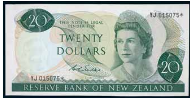
4106* Reserve Bank of New Zealand , D.L.Wilks (1968-75), twenty dollars star replacement note, YJ 015075* (P.167b). Good extremely fine.