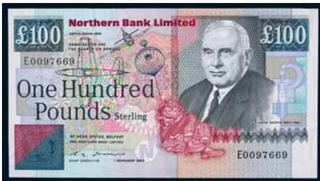
4007* Northern Ireland , Northern Bank Limited, one hundred pounds, Belfast, 1 November 1990, E 0097669 (P.197a). Uncirculated.