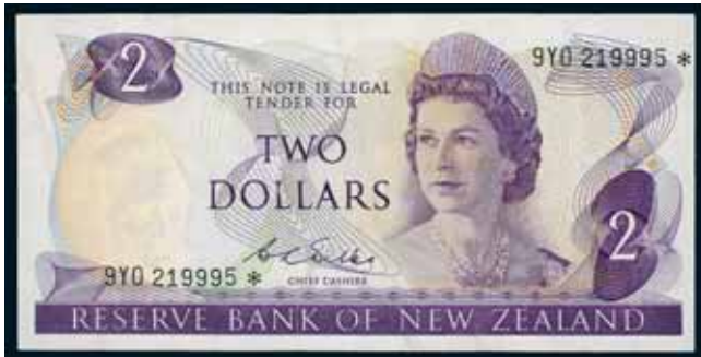
4093* Reserve Bank of New Zealand, D.L. Wilks (1967-68), two dollars star note, 9Y0 219995 (P.164b). Flattened, very fine.