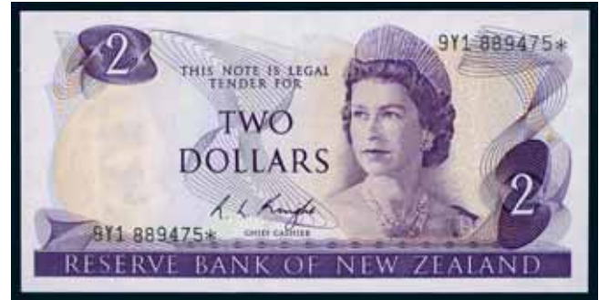
4111* Reserve Bank of New Zealand , R.L.Knight (1975-77), two dollars star replacement note, 9Y1 889475* (P.164c). Uncirculated and rare in this condition.