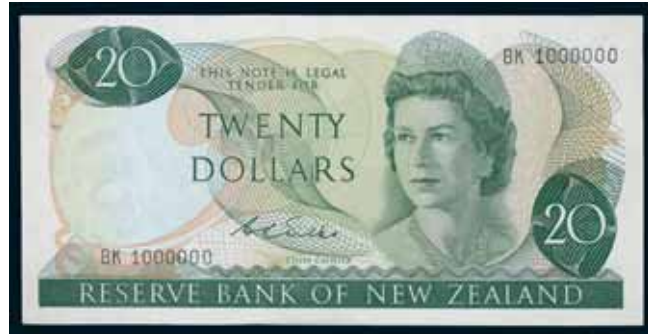
4105* Reserve Bank of New Zealand , D.L.Wilks (1968-75), twenty dollars, BK 1000000 (P.167b). Good very fine and a very rare one million serial number.