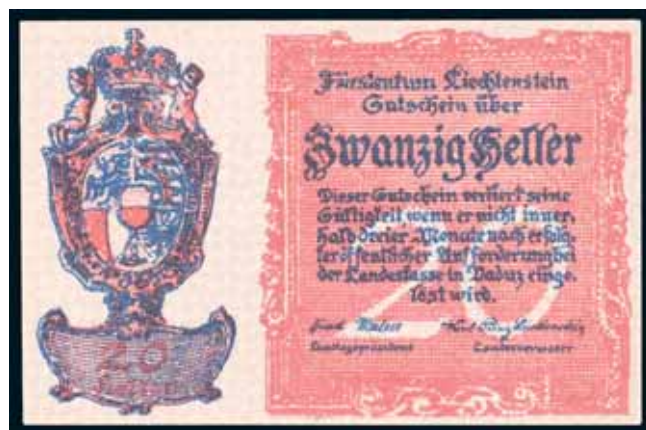
lot 4074 part