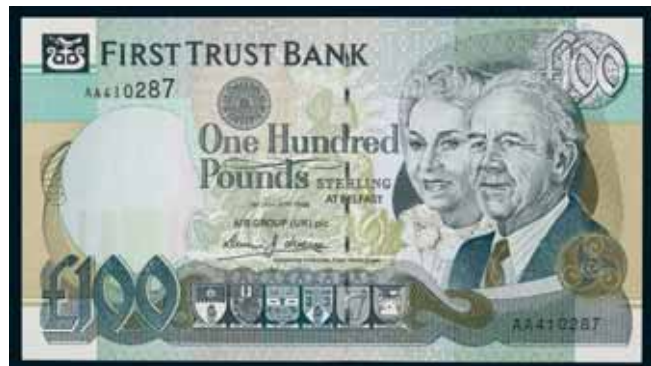
4004* Northern Ireland , First Trust Bank, one hundred pounds, Belfast, 1st January 1998, AA 410287 (P.139b). Uncirculated.