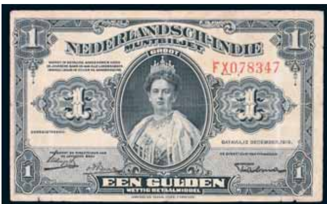
3991* Netherlands Indies , Government Muntbiljet issue, one gulden, Batavia, 12 December 1919, FX078347 (P.100a). Fold and a few small edge chips, otherwise fine and scarce. $100