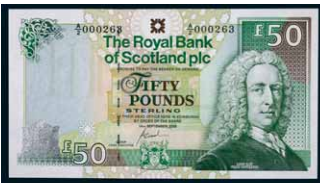
4029* Scotland , The Royal Bank of Scotland plc, fifty pounds, 14th September 2005, A/2 000263 (P.367); The Royal Bank of Scotland Limited, one pound, Edinburgh, 1 May 1979, B79 688152 (P.336a). Uncirculated, the first illustrated. (2) $120