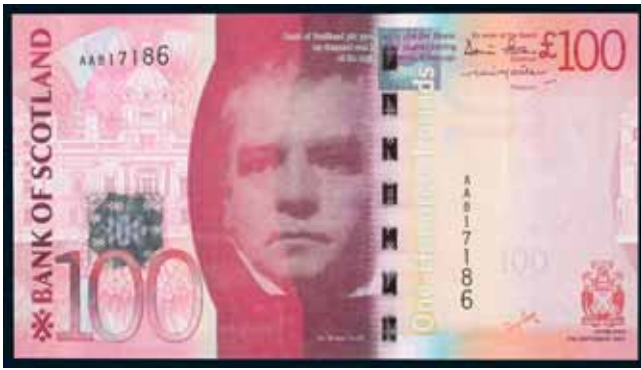
4027* Scotland , Bank of Scotland, one hundred pounds, Edinburgh, 17th September 2007, AA 817186 (P.128a). Uncirculated. $200