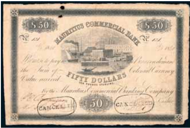
3989* Mauritius , Mauritius Commercial Bank, fifty dollars (ten pounds sterling) 5th May, 1840 (P.S126). Rubber stamped 'cancelled' twice. Rusted holes, otherwise very fine. (2) $150

Ex W.J.Baker Collection from Spink Australia Sale 23 (lot 30).