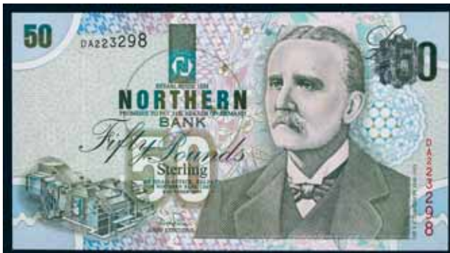
4008* Northern Ireland , Northern Bank, fifty pounds, Belfast, 8 October 1999, DA 223298 (P.200a). Uncirculated.