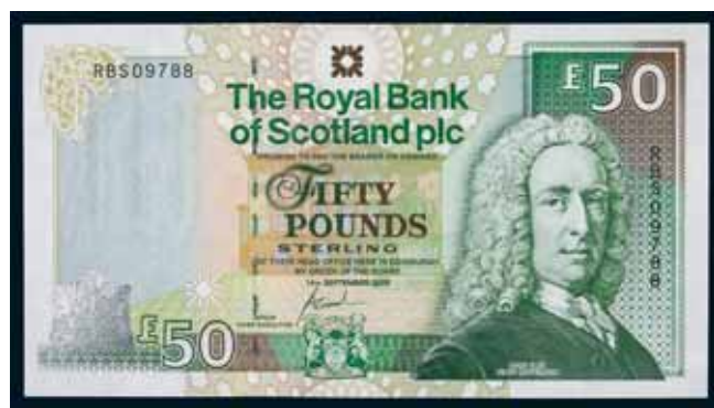
4031* Scotland , The Royal Bank of Scotland plc, fifty pounds, new bank headquarters commemorative, 14th September 2005, RBS 09788 (P.366). Uncirculated. $150