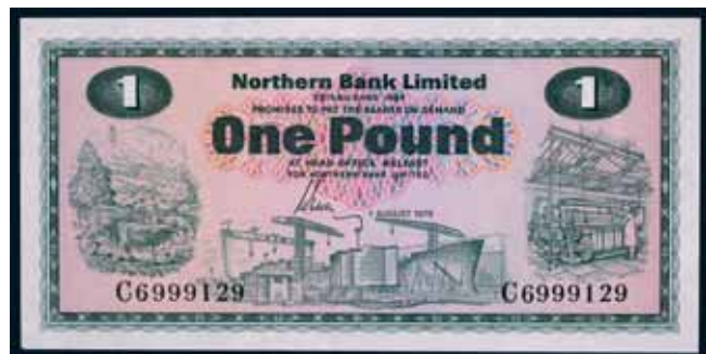
4005* Northern Ireland , Northern Bank Limited, one pound, Belfast, 1 August 1978, C 6999129 (P.187c); twenty pounds, 2 March 1987, F 1738919 (P.190c). Uncirculated. (2)