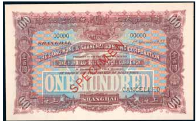
3853* China , The Hong Kong & Shanghai Banking Corporation, specimen one hundred dollars Shanghai 1st September 1923 00000 in part of Bradbury Wilkinson & Co London diagonal red specimen overprint plus perforated cancelled to right (P.S364). Uncirculated and rare.