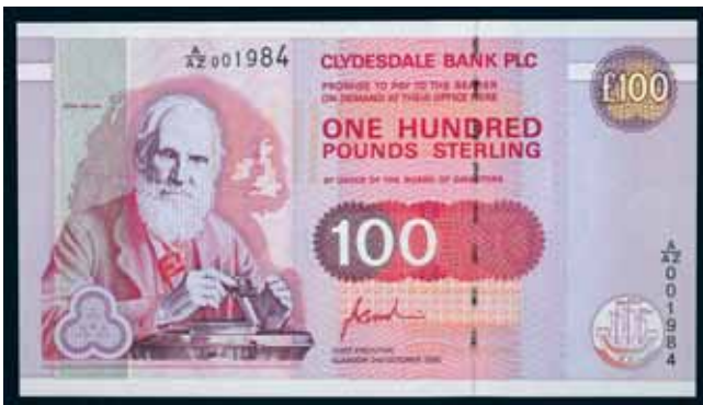
4028* Scotland , Clydesdale Bank Plc, one hundred pounds, Glasgow, 2nd October 1996, A/AZ 001984 (P.223). Uncirculated. $300