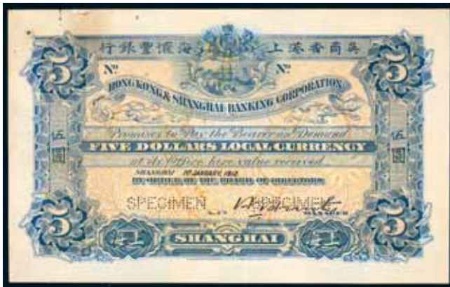
3850* China , The Hong Kong & Shanghai Banking Corporation, specimen five dollars, Shanghai 1st January, 1912, imprint Bradbury Wilkinson & Co London, perforated 'specimen' twice (P.S352). Punch hole and smudging, otherwise extremely fine or better.