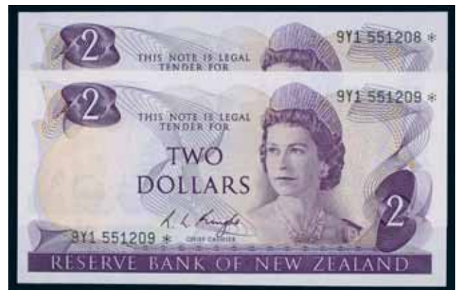
4113* Reserve Bank of New Zealand , R.L.Knight (1975-77), two dollars star replacement notes, 9Y1 551208*/9* consecutive pair (P.164c). A light centre bend, virtually uncirculated and rare in this condition. (2)