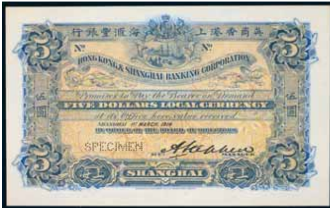
3851* China , The Hong Kong & Shanghai Banking Corporation, specimen five dollars, Shanghai 1st March 1914, imprint Bradbury Wilkinson & Co London perforation 'specimen' to left (P.S352a). Uncirculated and rare.