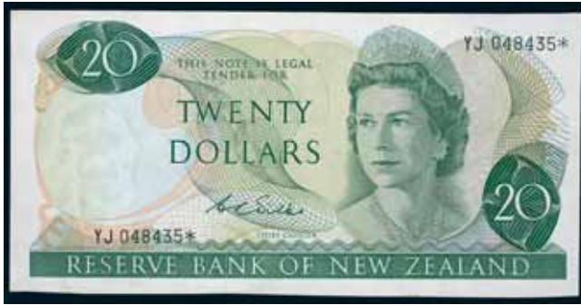
4108* Reserve Bank of New Zealand , D.L.Wilks (1968-75), twenty dollars star replacement note, YJ 048435* (P.167b). Flattened, very fine.