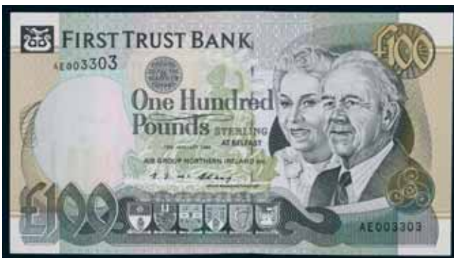
4002* Northern Ireland , First Trust Bank, one hundred pounds, Belfast, 10th January 1994, AE 003303 (P.135a). Uncirculated.