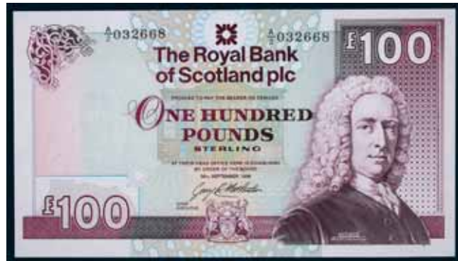
4030* Scotland , The Royal Bank of Scotland plc, one hundred pounds, 30th September 1998, A/2 032668 (P.350b). Uncirculated. $350