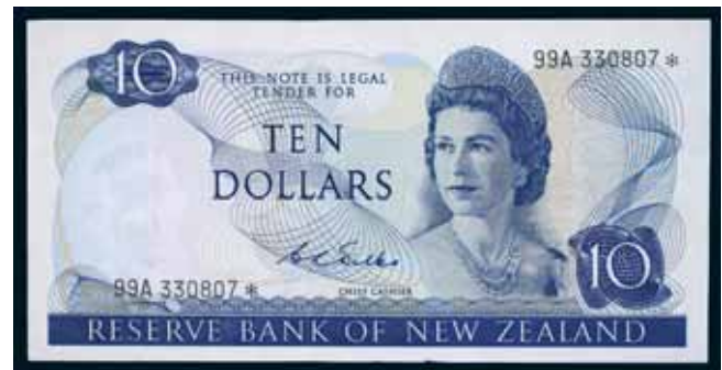
4098* Reserve Bank of New Zealand, D.L. Wilks (1968-75), ten dollars star replacement note, 99A 330807* (P.166b). Good extremely fine and scarce as such.