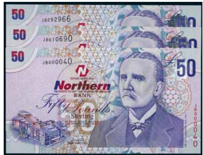
4010* Northern Ireland , Northern Bank, fifty pounds, Belfast, 19 January 2005, JB 000040, 010690, 292966 (P.208a). Uncirculated. (3)