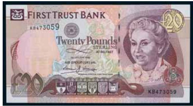
4003* Northern Ireland , First Trust Bank, twenty pounds, Belfast, 1st January 1998, KB 473059 (P.137a). Uncirculated.