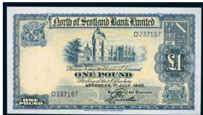
4032* Scotland , North of Scotland Bank, one pound, Aberdeen, 1st July 1945, D237157 (P.S644). Virtually uncirculated. $100