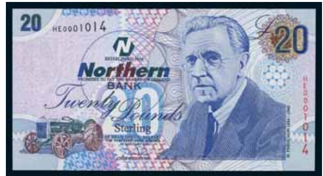
4009* Northern Ireland , Northern Bank, twenty pounds, Belfast, 19 January 2005, HE 0001014 (P.207a). Uncirculated.