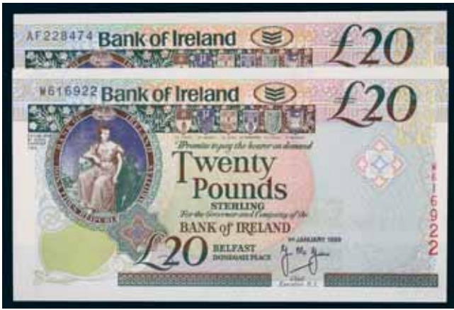
4000* Northern Ireland , Bank of Ireland, twenty pounds, Belfast, 1st January 1999, W 616922 and AF 228474 (P.76b). Uncirculated. (2)