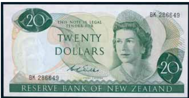
4104* Reserve Bank of New Zealand , D.L.Wilks (1968-75), twenty dollars, BK 286649 (P.167b). Light centre bend, nearly uncirculated.