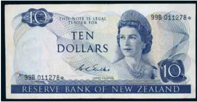
4101* Reserve Bank of New Zealand , D.L.Wilks (1968-75), ten dollars star replacement note, 99B 011278* (P.166b). Fine, a rare prefix.