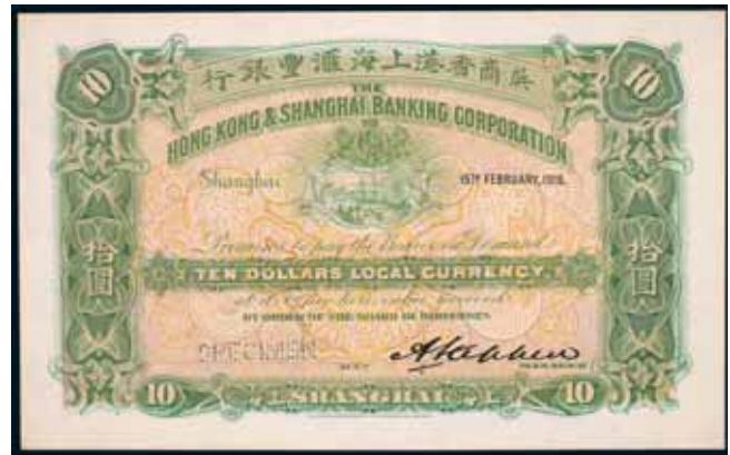
3852* China , The Hong Kong & Shanghai Banking Corporation, specimen ten dollars, Shanghai 15th February, 1916, imprint Bradbury Wilkinson & Co London, perforated specimen to left (P.S357a). Uncirculated and rare.