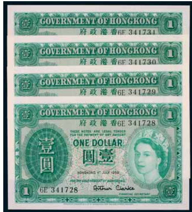
3968* Hong Kong , Government of Hong Kong, Elizabeth II, one dollar, 1st July 1959, 6E 341728/31 a run of four consecutive notes (P.324Ab). Uncirculated. (4)