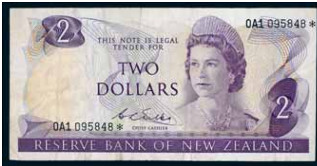
4092* Reserve Bank of New Zealand, D.L. Wilks (1968-75) two dollars star replacement note, 0A1 095848* (P.164b). A 5mm tear in bottom margin, otherwise fine and rare being of the first prefix type.