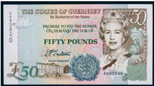
3966* Guernsey , The States of Guernsey, Elizabeth II, fifty pounds, undated (1994), A 093840 (P.59). Uncirculated.