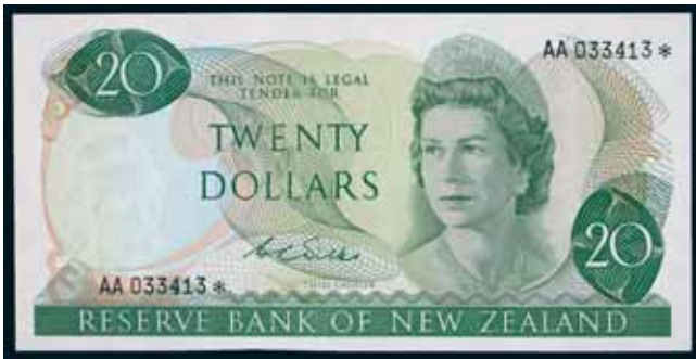
4103* Reserve Bank of New Zealand , D.L.Wilks (1968-75), twenty dollars star replacement note, AA 033413* first prefix (P.167b). Faint trace of a centre bend, virtually uncirculated and rare, especially in this condition.