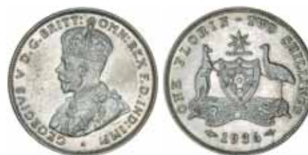
968* George V , 1936. Nearly uncirculated. $180