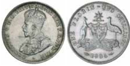
970* George V, 1936. Nearly uncirculated.