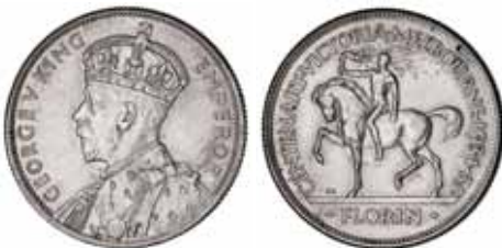
952* George V, 1934-35 Melbourne Centenary. Good extremely fine.