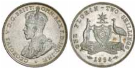
947* George V, 1934. Toned, nearly uncirculated.