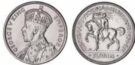
955* George V, 1934-35 Melbourne Centenary. Extremely fine.