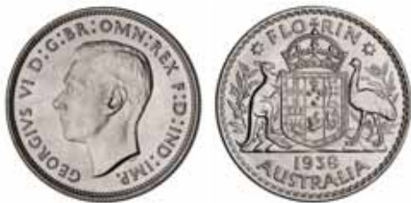
975* George VI, 1938. Nearly uncirculated.