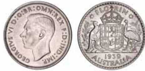
977* George VI, 1939. Nearly extremely fine.