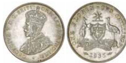
967* George V , 1935. Dusty, good extremely fine. $200