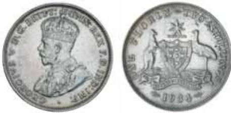
948* George V, 1934. Has been polished, otherwise extremely fine or better.