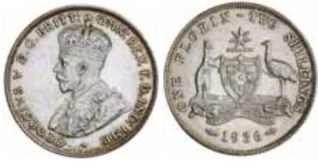
971* George V, 1936. Has been rubbed, otherwise well struck, good extremely fine.