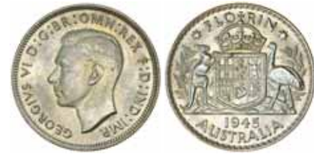
978* George VI, 1945. Uncirculated.