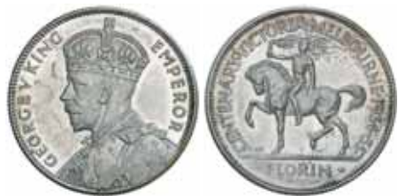
961* George V , 1934-35 Melbourne Centenary. Reverse with partial soft strike, good very fine. $250