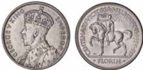
956 George V, 1934-35 Melbourne Centenary. Nearly extremely fine.