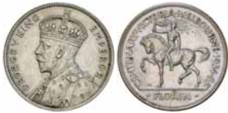
959* George V , 1934-35 Melbourne Centenary. Harshly brushed to clean, otherwise extremely fine/nearly extremely fine. $250