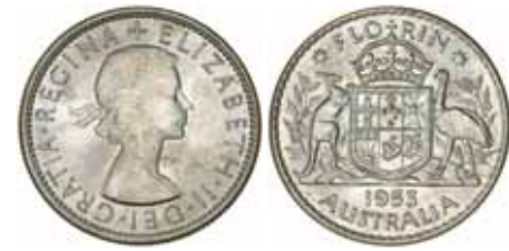
981* George VI - Elizabeth II, 1942 (3), 1944S (left of centre), 1953 (4). Uncirculated - choice uncirculated. (8)