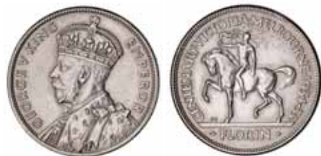
957* George V, 1934-35 Melbourne Centenary. Nearly extremely fine.