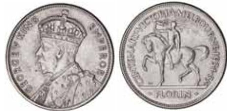
954* George V, 1934-35 Melbourne Centenary. Lightly toned, good extremely fine.

Private purchase from Spink Australia in 1984.