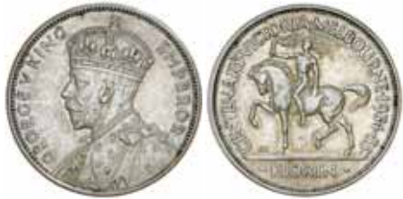
960* George V , 1934-35 Melbourne Centenary. Toned, nearly extremely fine/good very fine. $250