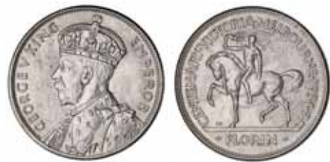
953* George V, 1934-35 Melbourne Centenary. Good extremely fine.