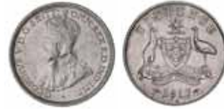
851* George V, 1917M. Light grey brown tone, uncirculated and rare in this condition.