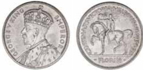
803* George V, 1934-35 Melbourne Centenary, together with Foy & Gibson Pty Ltd envelope. Envelope fine, coin extremely fine. $400