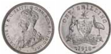
821* George V, 1918M. Frosty mint bloom, nearly uncirculated. $350