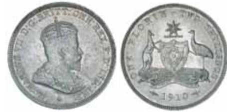
788* Edward VII, 1910. Toned slightly on the obverse, full underlying original mint bloom, uncirculated.