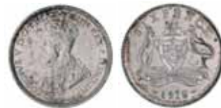
852* George V, 1918M. Golden peripheral toning highlights, nearly uncirculated and rare thus.