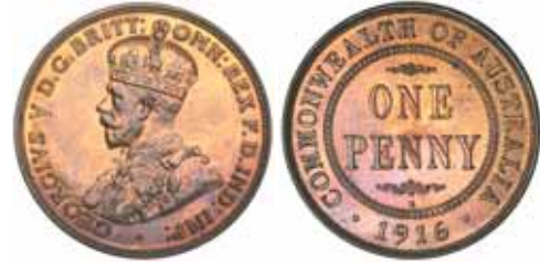
880* George V, 1916I. Red and brown, uncirculated.

Ex Noble Numismatics Sale 114A (lot 1333).