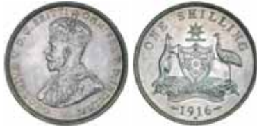
818* George V, 1916M. Frosty mint bloom, uncirculated. $300

Ex Noble Numismatics Sale 114 (lot 1278).