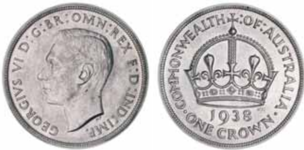
785* George VI, 1938. Frosty mint bloom on the reverse, minor scuff marks on obverse, nearly uncirculated.