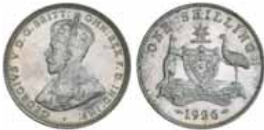
829* George V, 1926. Obverse contact marks, full mint bloom, uncirculated.