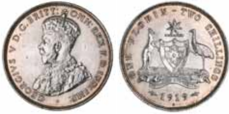
792* George V, 1919M. Obverse buffed behind head, otherwise well struck good extremely fine.