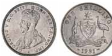
835* George V, 1931. Lightly toned, uncirculated.