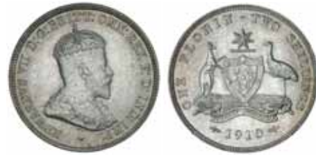
787* Edward VII, 1910. Cartwheeling mint bloom, uncirculated.