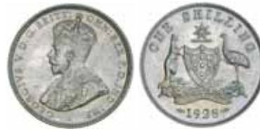
832* George V, 1928. Frosty mint bloom, uncirculated and rare in this condition.