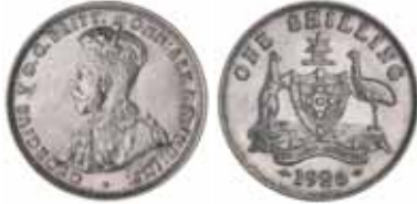
828* George V, 1926. Well struck with grey brown patina, uncirculated and scarce thus.