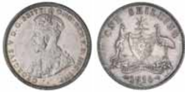
817* George V, 1916M. Some peripheral toning, uncirculated. $350