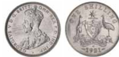
824* George V, 1921 star. Well struck with considerable original mint bloom, nearly uncirculated and rare in this condition. $1,250

Ex Noble Numismatics Sale 114 (lot 1280).