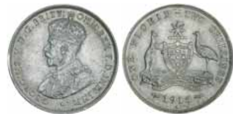
790* George V, 1915H. Good extremely fine.