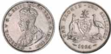
793* George V, 1924. Hairline die break through date, faint serif 4, nearly uncirculated.

Private purchase from the Rare Coin Company.