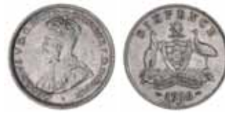
850* George V, 1916M. Nearly uncirculated and rare thus.