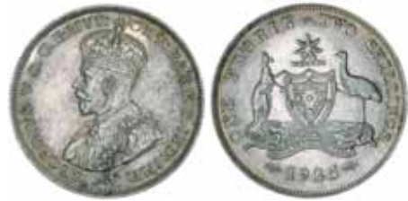
794* George V, 1925. Original subdued mint bloom on the reverse, nearly uncirculated.