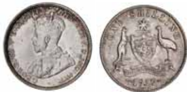
819* George V, 1917M. Peripheral toning, frosty mint bloom, reverse fully toned, uncirculated. $550