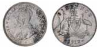
847* George V, 1912. Uneven tone over full original mint bloom, choice uncirculated and rare in this condition.

Ex E.L.M.Cummings Collection Noble Numismatics Sale 114B (lot 2696).