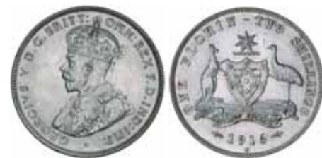
791* George V, 1916M. Full white silver mint bloom, uncirculated.