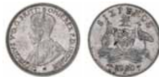
854* George V, 1920M. Uneven toning, good extremely fine.