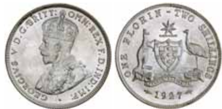
795* George V, 1927. Frosty mint bloom, uncirculated.