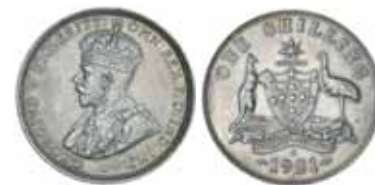
825* George V, 1921 star. Has been cleaned and lightly polished, otherwise good extremely fine and rare.