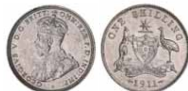
806* George V, 1911. Lightly toned, nearly uncirculated. $500