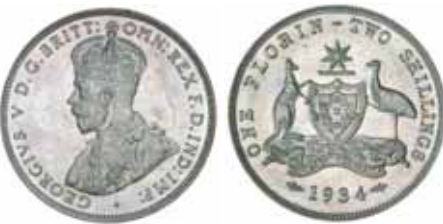
800* George V, 1934. Sharply struck like a specimen, contact mark under King's eye, otherwise uncirculated. $3,500