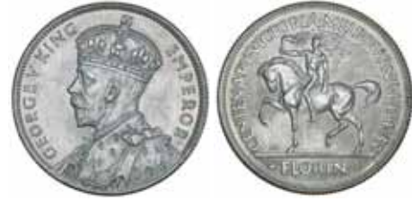
802* George V, 1934-35 Melbourne Centenary. Uncirculated. $400

Ex D.G.L. Worland Collection from Status International as near gem, with ticket.