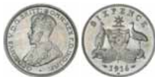
849* George V, 1916M. Full frosty mint bloom, uncirculated and rare in this condition.

Ex Noble Numismatics Sale 114A (lot 426).