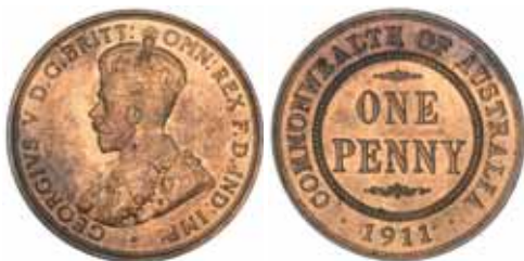
879* George V, 1911. Red and brown uncirculated.