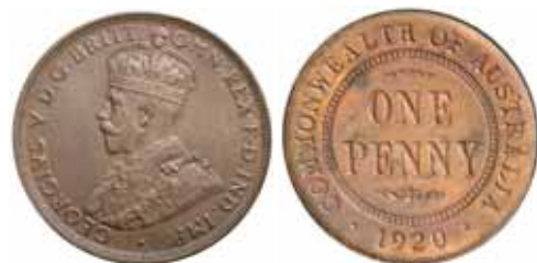
883* George V, 1920 dot below, Indian die. Brown/brown and red, uncirculated and rare in this condition.