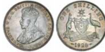
833* George V, 1928. Golden red brown mint bloom, nearly uncirculated.

Ex IAG Sale 2014 and Noble Numismatics Sale 114 (lot 1286).