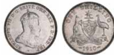
804* Edward VII, 1910. Uncirculated. $300