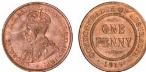
882* George V, 1919 dot below scroll. Brown and red, uncirculated.