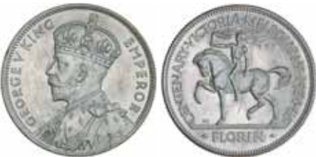
801* George V, 1934-35 Melbourne Centenary. Full original mint bloom, choice uncirculated. $1,000

Ex D.G.L. Worland Collection from Status International as near gem, with ticket.