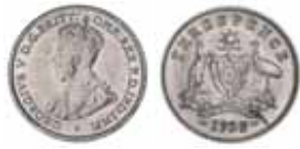
876* George V, 1925. Reverse die break at 4 o'clock, light grey frosty mint bloom, uncirculated.