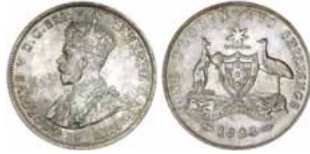
796* George V, 1928. Full mint bloom, weak strike on star; light toning, choice uncirculated.