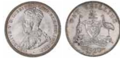
822* George V, 1920M. Full original subdued mint bloom with golden peripheral highlights, uncirculated and rare in this condition.