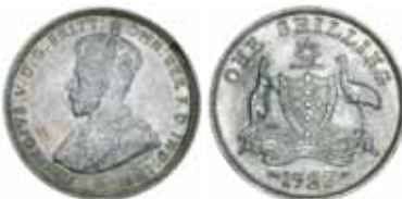
830* George V, 1927. Original mint bloom, some golden highlights, uncirculated.

Ex Noble Numismatics Sale 108 (lot 1516).