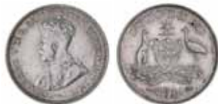
848* George V, 1914. Lightly toned, good extremely fine/nearly uncirculated.