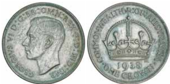
786* George VI, 1938. Toned, good extremely fine.