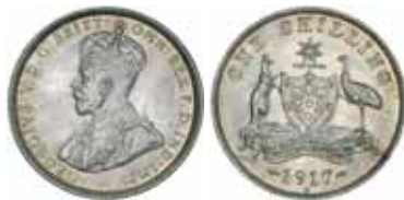
820* George V, 1917M. Considerable original mint bloom, uncirculated. $300

Ex Noble Numismatics Sale 114 (lot 1280).