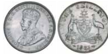
834* George V, 1931. Satin-like mint bloom, toning spots on the reverse, uncirculated.