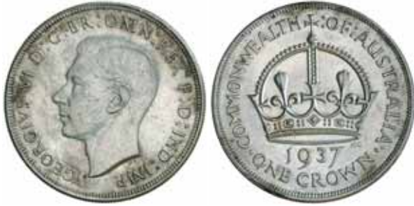
784* George VI, 1937. Uncirculated.