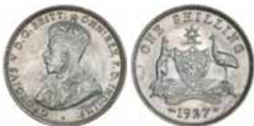
831* George V, 1927. Nearly uncirculated/uncirculated.

Ex Noble Numismatics Sale 114 (lot 1292).