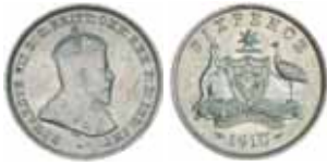
845* Edward VII, 1910. Nearly uncirculated.