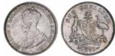
805* George V, 1911. Toned, uncirculated. $750