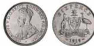
853* George V, 1919M. Full original mint bloom, choice uncirculated.

Ex Noble Numismatics Sale 114A (lot 1304).