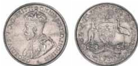
799* George V, 1933. Brown and gold tone, good very fine and rare thus.