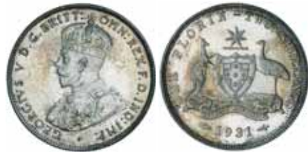
797* George V, 1931. Dark grey and gold edge and peripheral toning with fully proof-like reverse, probably a specimen or proof, virtually FDC and one of the finest known.