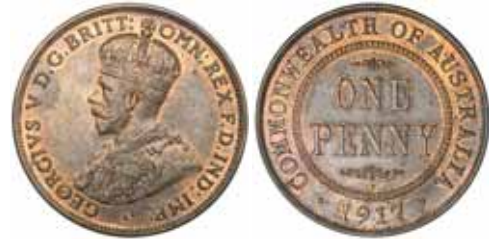
881* George V, 1917I. Brown and red, nearly uncirculated.