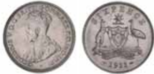
846* George V, 1911. Even light grey patina, uncirculated.