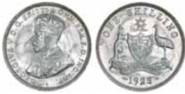
827* George V, 1925. Full mint bloom, uncirculated.