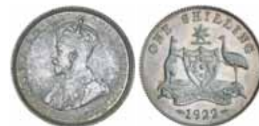
826* George V, 1922. Frosty matte mint bloom/brilliant mint bloom, one of the finest known, uncirculated.