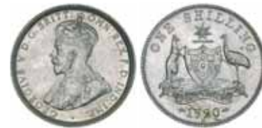
823* George V, 1920M. Frosty mint bloom, nearly uncirculated.