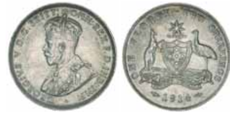
789* George V, 1914. Obverse field with contact marks, light red brown grey patinated surface, otherwise nearly uncirculated.