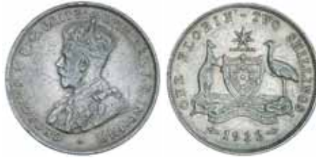
798* George V, 1932. Six pearls, nearly very fine/very fine and rare thus.