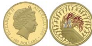
229* Elizabeth II , proof fine gold, one hundred dollars, 2000, Sydney Olympics. In case of issue, missing certificate, FDC.