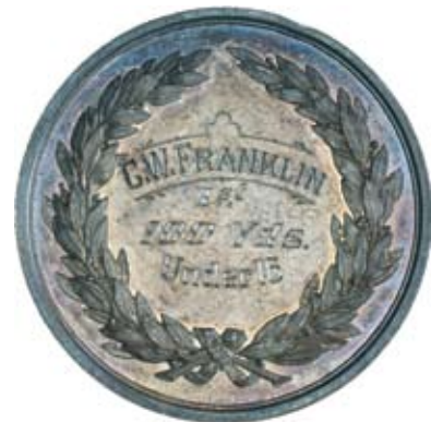
363* Church of England Grammar School, Melbourne, Jubilee Apl. 1908 , prize medal in silver (53mm) (C.1908/2), by S.&S. (Stokes & Sons), reverse inscribed, 'C.W.Franklin/1st/100 Yds./Under 16'. Some hairlines, otherwise beautifully toned and nearly uncirculated. $120