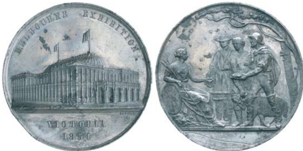
330* Melbourne Exhibition, Victoria, 1854, in white metal (64x8.5mm) (C.1854/2), by J.S.Wyon, unnamed, possibly a museum or VIP strike, 8.5mm thick instead of 5mm for normal striking. Some edge bumps and nicks, some tin pest spots, otherwise very fine and very rare.