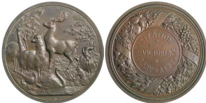
336* Acclimatisation Society of Victoria , 1868, in bronze (57mm) by J.S.& A.B.Wyon (C.1868/3). Some minor edge nicks, otherwise nearly uncirculated. $350