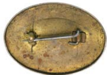
375* S.A.R. (South Australian Railways) , Islington, worker's badge, in gilt nickel (44x31mm), pin-back, 1919 in clear window; also Tasmanian Govt Railways, Hobart, parcels stamps for 3d, 4d, and 1/-, 1917 issues and all with cancelled stamping (Garratt type 3). The badge with most gilt worn off, otherwise very fine and rare, the stamps affixed to brown paper, used. (4)