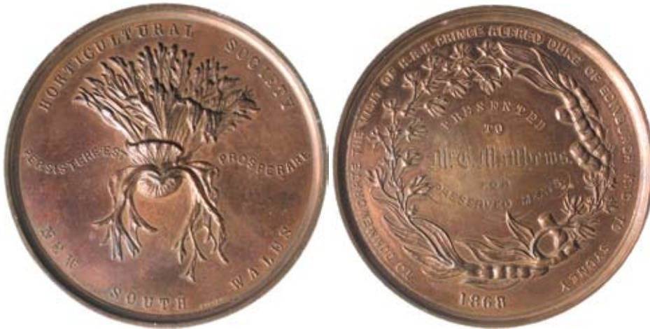
335* Horticultural Society of New South Wales , to commemorate the visit of HRH Prince Alfred Duke of Edinburgh K.C. to Sydney 1868, in bronze (60mm) (8mm thick), by Thornthwaite Sydney (c.1868/4) 'Mr. C.Matthews./for/Preserved Meats'. Lightly polished from rubbing and cleaning, otherwise good very fine and rare. $1,000