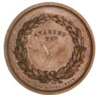
349* National Agricultural & Industrial Association of Queensland, 1883 in bronze (72mm) by R.Capner 'J Martin/1st Prize/Plumber's Work/Juvenile Exhibition/Brisbane/1883'. Good extremely fine.