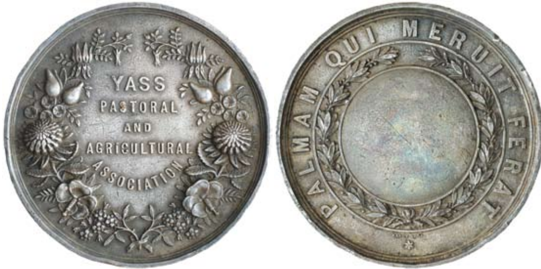
341* Yass Pastoral and Agricultural Association , in silver (70mm) for Hardy Bros., uninscribed. Surface marks from being mishandled, otherwise good fine.