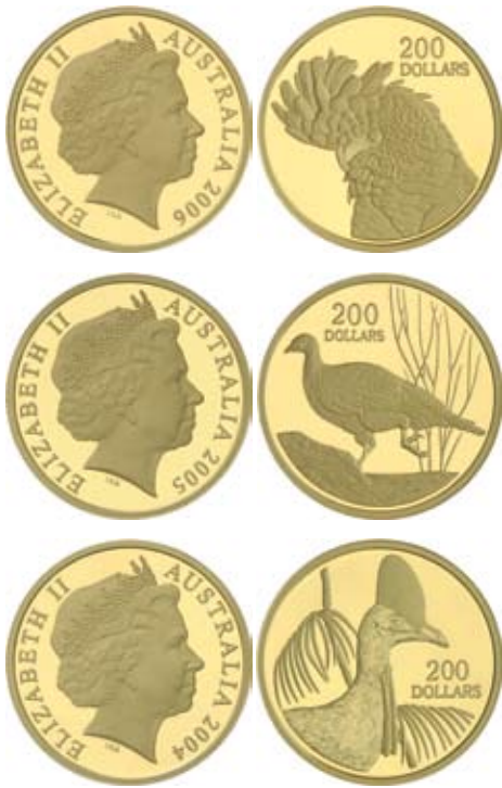
225* Elizabeth II , proof gold two hundred dollars, 2004, 2005, 2006, Rare Birds set of three. In case of issue, certificate with plaque 299, FDC. (3)