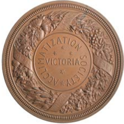
337* Acclimatization Society, Victoria, 1868, in bronze (57mm) (C.1868/3), by J.S. & A.B. Wyon. Toned uncirculated. $350