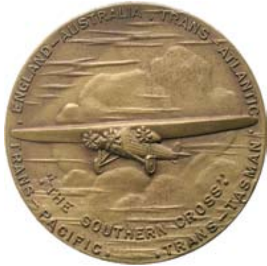
384* Sir Charles Kingsford Smith, 1935 , in bronze (51mm) by Stokes, Melbourne, NAV (c.1935/6). Extremely fine . $200