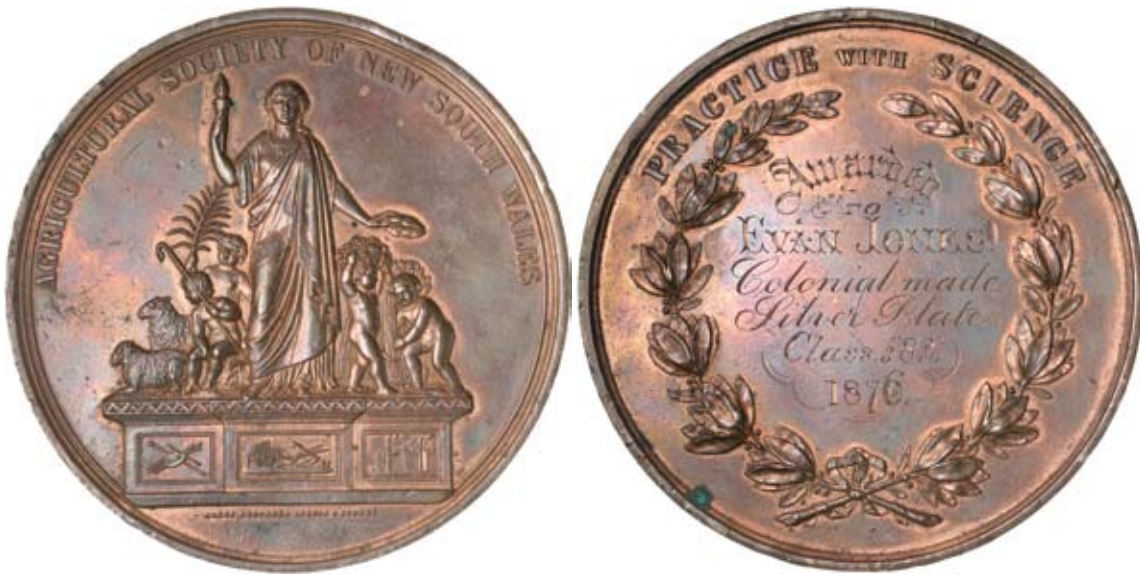
342* Agricultural Society Of New South Wales , 1876, prize medal in bronze (89mm), reverse inscribed, 'Awarded/To/Evan Jones./ Colonial made/Silver Plate/Class.582,/1876.'. Edge nicks, some oxidation spots, otherwise very fine.