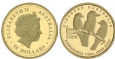
277* Elizabeth II , Perth Mint, proof half ounce gold kookaburra 'Discover Australia' nugget, 2008. In case of issue with certificate 0588, FDC. $1,250