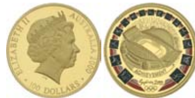
228* Elizabeth II , proof fine gold, one hundred dollars, 2000, Sydney Olympics. In case of issue, missing certificate, FDC.