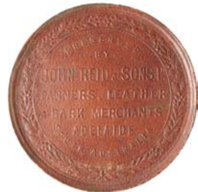
340* John Reid & Sons Ltd, Tannery, Est. 1873, in leather (50mm) (C.1873/5). Slightly off centre on obverse, otherwise very fine and very scarce. $150