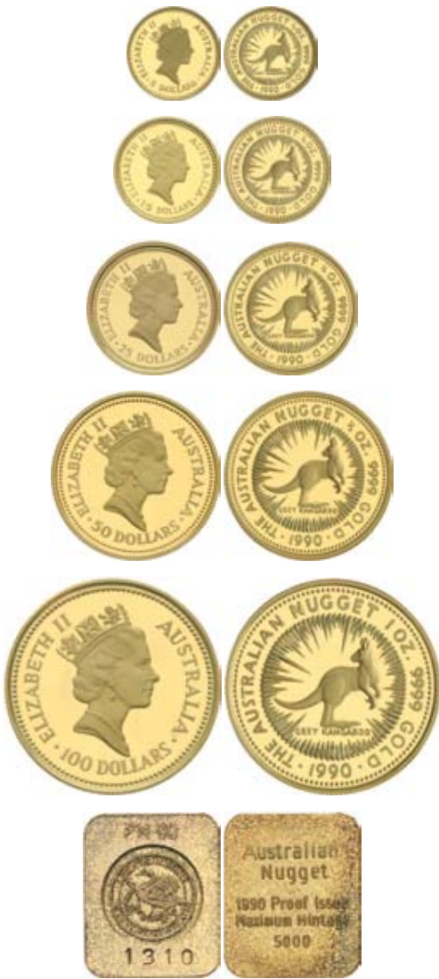
276* Elizabeth II , Perth Mint, proof gold five coin kangaroo nugget set, 1990. In case of issue, no 1310, FDC. (5) $4,000