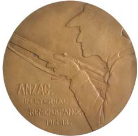
374* ANZAC In Eternal Remembrance , 1914-18, in bronze (60mm) (C.1914-18/1), by Dora Ohlfsen. Some light rubbing on a few high spots, otherwise uncirculated.