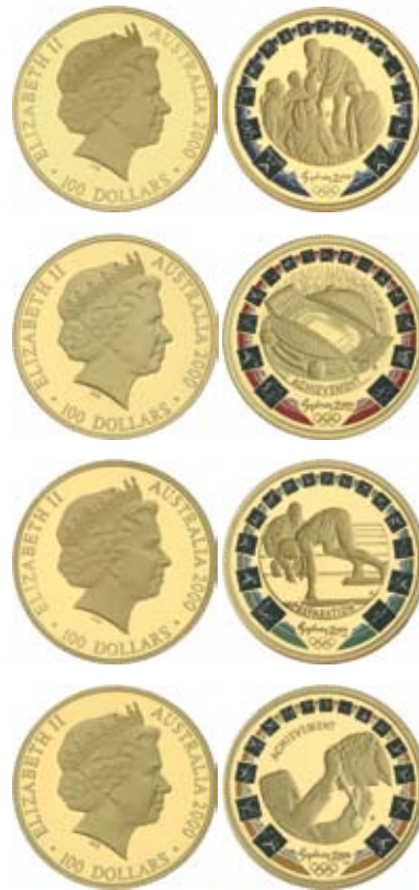
227* Elizabeth II , proof fine gold, one hundred dollars, four coin set, 2000 The Sydney 2000 Olympic Coin Collection Gold "Pictogram" set. In case of issue, missing certificate, FDC. (4)