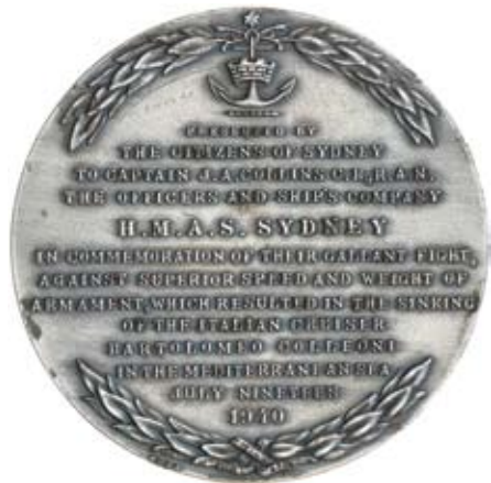
387* HMAS Sydney, Bartolomeo Colleoni Medal, 1940 , in oxidised silver (58mm) by Amor (C.1940/2), obverse, HMAS Sydney advancing at full speed with the smoking and disabled Italian cruiser, Bartolomeo Colleoni, in background, reverse, a representation of the plaque presented by the City of Sydney to HMAS Sydney. Unnamed. With two parallel scratches across medal rim, nearly extremely fine .