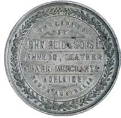
339* John Reid & Sons Ltd, Tannery, Est. 1873, in silver (50mm) (C.1873/5). Toned very fine and rare. $300