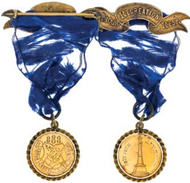
360* Eight Hour Day Fete, 1904 , fob in gold with rope surround (5.4g, 24mm) and gilt brooch bar 'Labour/Recreation/Rest', fob engraved on obverse '1904' within shield, '888' above, 'Labour Recreation Rest' in scroll around, reverse engraved with 8 Hour Day Monument in centre, '48th Fete J.Feldtman' around. With torn and frayed blue ribbon, extremely fine. $600