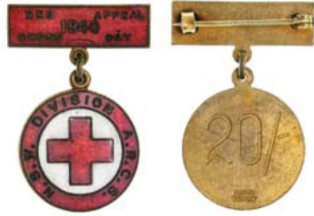
386* N.S.W. Division A(ustralian) R(ed) C(ross) S(ociety), Red Cross Appeal Day, 1940 , in gilt and enamel (23mm), by Amor, Sydney, with pin-back suspender bar, 20/- on reverse. Scarce high value appeal badge, very fine .