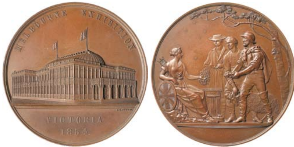
329* Melbourne Exhibition, Victoria, 1854, in bronze (64mm) (C.1854/2), by J.S.Wyon, unnamed. Toned, uncirculated and rare.