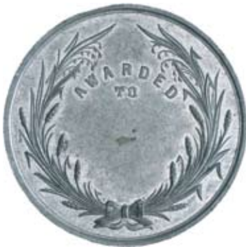
338* Commemorating the Opening of the Victorian Exhibition, 1872, prize medal in white metal (47.5mm) (see C.1872/3 reverse for this medal's obverse), by Stokes & Martin, unawarded. Toned, otherwise extremely fine and rare. $300