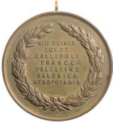
373* Australian Comforts Fund , c1915, in bronze (51mm) (C.ZN/1), by Stokes & Sons, with ring top suspension, edge impressed, 'Australian Comforts Fund S. A. Division'. Toned, otherwise nearly extremely fine.