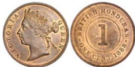
1755* British Honduras , Queen Victoria, one cent 1888 (KM.6). Red and brown uncirculated.