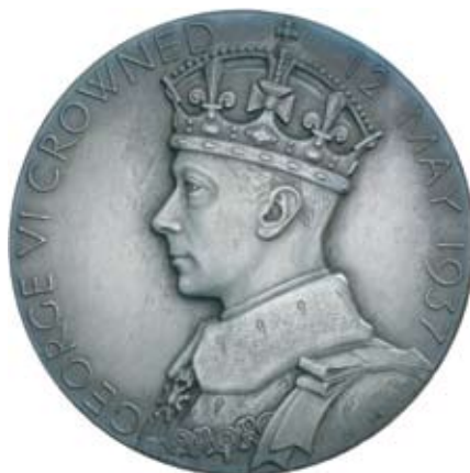
1732* Coronation of King George VI, 1937 , in silver (57mm) (BHM 4314; Eimer 2046), in Royal Mint case of issue. Some faint hairlines and a few small nicks, otherwise nicely toned uncirculated.