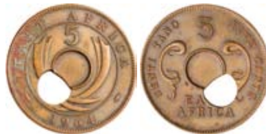
1879* East Africa, mint errors, George VI, five cents, 1942, central hole not punched; ten cents, 1942, hole punched off centre; Elizabeth II, five cents, 1964, hole punched off centre almost completely. Very fine - extremely fine. (3)