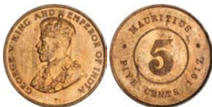
lot 1944 part