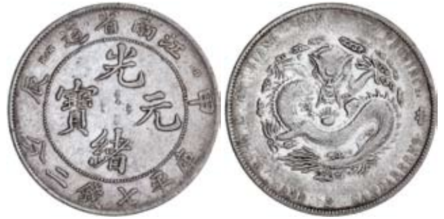
1830* China, Provincial, Kiang Nan, dollar (1904) with HAH and CH in legend, (KM.145a.12). Fine/very fine.