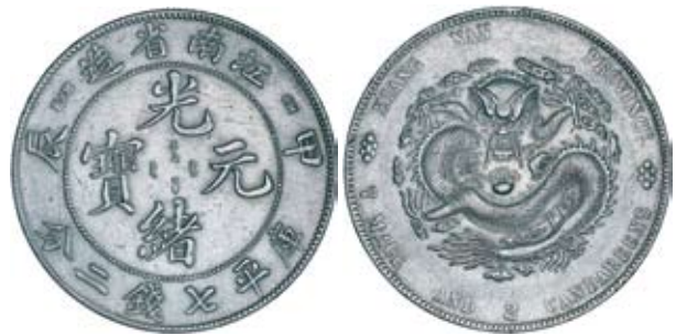
1831* China, Empire, Kiang Nan, silver dollar (1904) (KM. Y145a.13). Cleaned, good very fine.