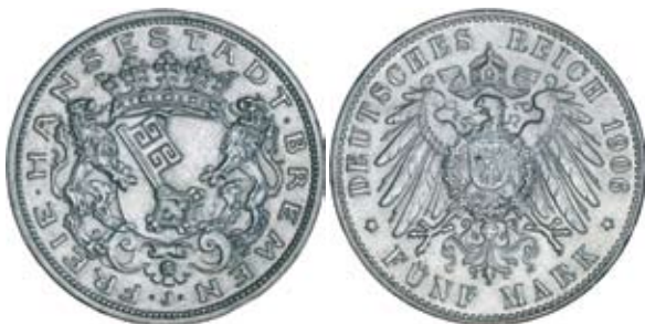
1892* Germany, Bremen, Free City, five mark, 1906J (KM.251). Rim knocks, otherwise good extremely fine.