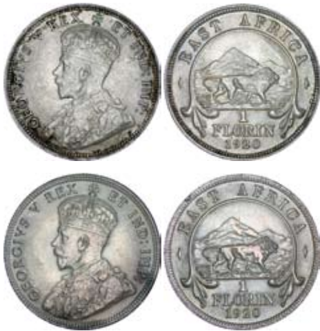
1874* East Africa, George V, florins, 1920H (KM.17). One with weak H softly struck, second with stronger H, better struck, nearly uncirculated. (2)