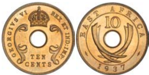
1876* East Africa, George VI, Royal Mint proof ten cents, 1937 (KM.26.1). Brilliant red FDC and rare.

Ex Mark E.Freehill Collection, from the W.H.Lampard Collection, Noble Numismatics Sale 78B (lot 3625).