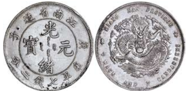
1832* China, Provincial, Kiang Nan, dollar (1900) (KM.145a.20). Nearly extremely fine, scarce.