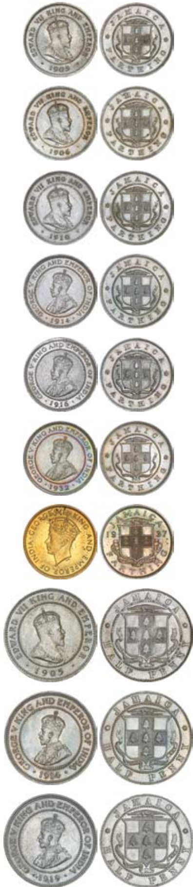
lot 1922 part