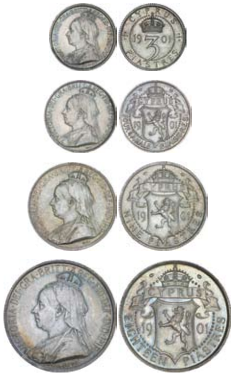
1851* Cyprus , Queen Victoria, silver three, four and a half, nine and eighteen piastres, 1901 (KM.4-7). A choice set with attractive blue grey mint bloom toning, uncirculated and rare as such. (4)