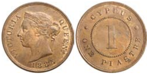
1850* Cyprus , Queen Victoria, one piastre, 1885 (KM.3.2). Traces of mint red, good extremely fine.