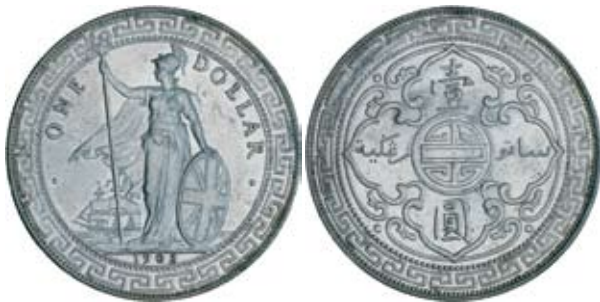
1784* British Trade Dollar, 1903 (KM.T5). Extremely fine/good extremely fine. $200