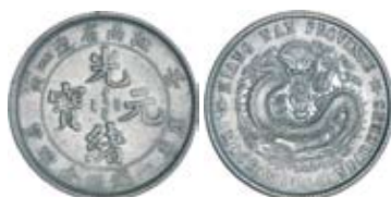
1829 China, Empire, Kiang Nan, silver twenty cents C.D. 1902 (KM.143a.8). Cleaned, good very fine.