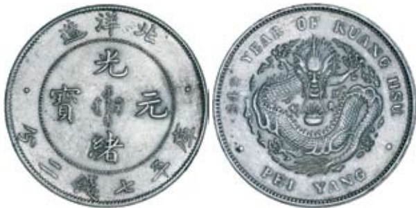
1827* China, Empire, Chihli, silver dollar 34th year (1908) (KM. Y73.3). Cleaned, nearly extremely fine.