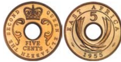
1878* East Africa, Elizabeth II, Royal Mint proof five cents, 1955 (KM.37). FDC and rare.

Ex Mark E.Freehill Collection, from Museum Victoria duplicates, Spink Australia Sale 25 (lot 1053).