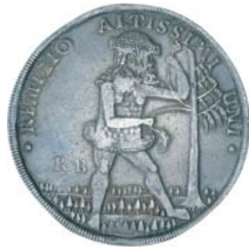
1893* Germany, Brunswick-Wolfenbittel, Rudolph Augustus, 'wildman' thaler, 1699 RB (Dav.6390; KM.628). Good fine.