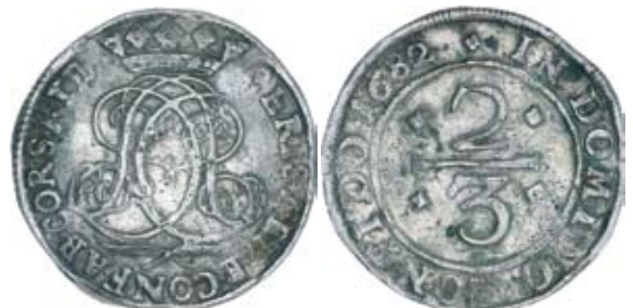
1894* Germany, Corvey, Christoph, two thirds thaler, 1682 (KM.82), Hoxter Mint. Uneven strike, very fine and rare.