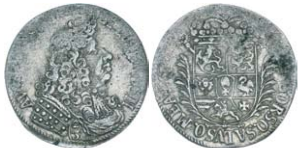
1895* Germany, Lubeck, August Friedrich, two third thaler, 1689 (KM.68). Striking weakness, otherwise good fine.