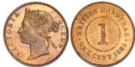
1754* British Honduras , Queen Victoria, one cent, 1885 (KM.6). Considerable original mint red, uncirculated.