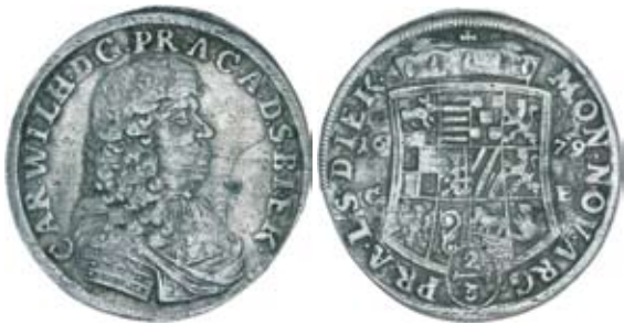
1889* Germany, Anhalt-Zerbst, Carl Wilhelm, two thirds thaler, 1679 CP (KM.19.6). Fine.