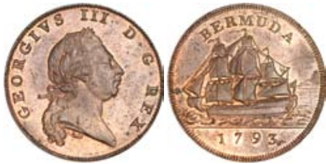
1750* Bermuda , George III, penny, 1793, by Droz (KM.5). Red and brown, nearly uncirculated.