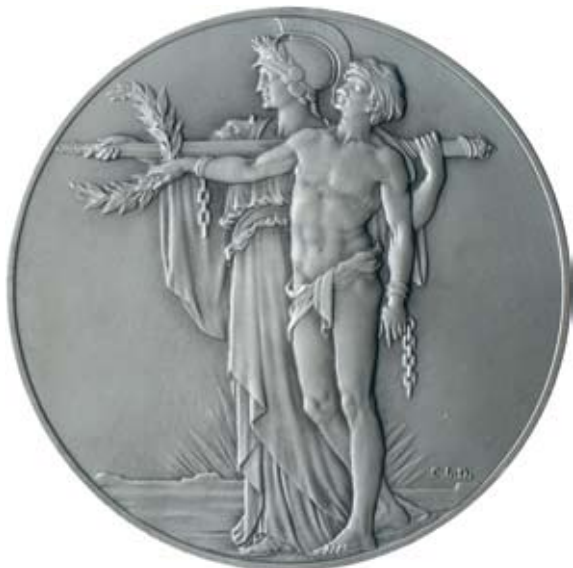
1730* Memorial, Signing of the Armistice, Tenth Anniversary, 1928 , struck by the Royal Mint, silver (76mm) by C.L.J. Doman (Eimer 2008). With case of issue, good extremely fine.