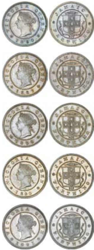
lot 1921 part