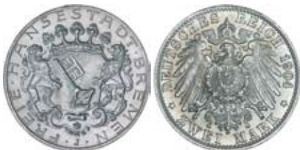
1891* Germany, Bremen, Free City, two mark, 1904J (KM.250). Nearly uncirculated.