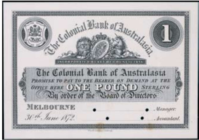
3444* The Colonial Bank of Australasia , black and white printer's proof on card, one pound, Melbourne, 30th June 1872, imprint W.K. & A.R. Johnston, Edinburgh (MVR3a), four punch hole cancellation. Virtually uncirculated and very rare.

Ex Dr.Alan Nicholson Collection (Sale 49B, lot 1555), Noble Numismatics Sale 79 (lot 2883) and Sale 106 (lot 2659).