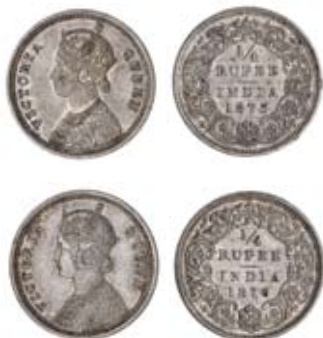
lot 3798 part