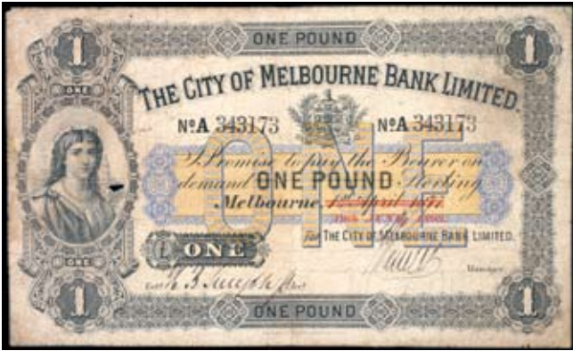
3442* The City of Melbourne Bank Limited , one pound, Melbourne 1st April 1877 overprinted in red 19th June 1893, no A343173 (MVR type 2, Pedigrees p.126). Small perforation at vignette, otherwise very fine and excessively rare.