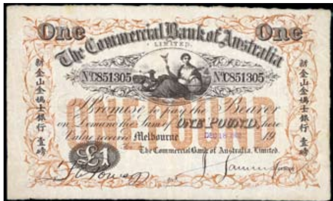
3445* The Commercial Bank of Australia , one pound, Melbourne Dec 18 1909 (ink rubber stamped date) No C851305 (MVR 1), signatures F.E.Power and J.Sammson (for Manager), Chinese script vertically on left and right, floral pattern border, imprint 'Sands and McDougall Stationers, Melbourne'. A full note, multiple creases, five pin-holes, otherwise very fine and extremely rare, only two others known.