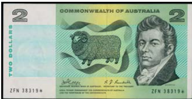
3523* Two dollars , Phillips/Randall (1968), ZFN 38319* (R.83s). Flat, extremely fine. $1,200