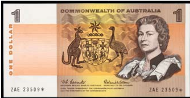
3521* One dollar , Coombs/Wilson (1966) ZAE 23509* (R.71s). Nearly uncirculated. $750