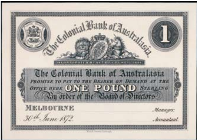
3443* The Colonial Bank of Australasia , printer's proof one pound, Melbourne, 30th June 1872, third issue, imprint W. & A.K. Johnson, Edinburgh (MVR 3a), on board. As issued uncirculated and very rare.