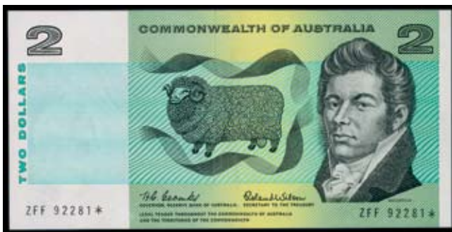
3522* Two dollars , Coombs/Wilson (1966), ZFF 92281* (R.81s). Flat, nearly uncirculated. $1,200