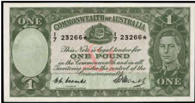
3520* One pound , Coombs/Watt (1949) 1/7 23266* (R.31s). Good extremely fine and rare, especially in this condition. $6,000