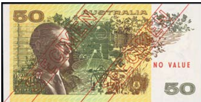
3513* Fifty dollars , Phillips/Wheeler (1973), type three specimen No 0517, serial YAA 000000 (R.SP27). Uncirculated and rare. $4,500