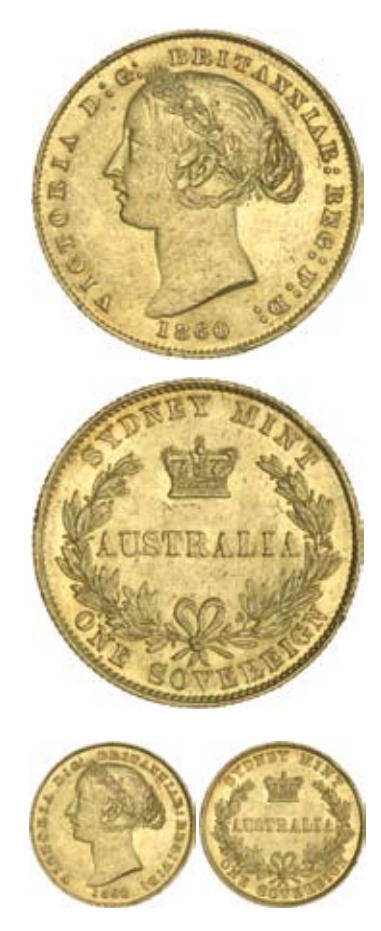
936* Queen Victoria, second type, 1860. Subdued underlying mint bloom/considerable bloom, nearly uncirculated and very rare in this condition, one of the finest known.