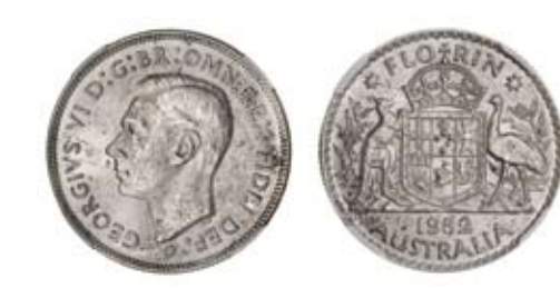
1066* George VI, 1952. Choice uncirculated.