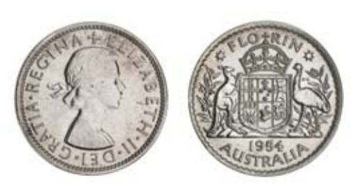
1069 * \\ \textbf{Elizabeth II, } 1954. \ \textit{Nearly uncirculated/uncirculated}.

In a slab by NGC as MS63. Ex Benchmark Collection (lot 367).