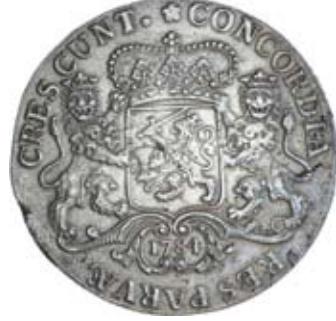
926* Netherlands, Holland, silver rider, 1784 (Delm.1014; Dav. 1827; KM.90.2). Good very fine .