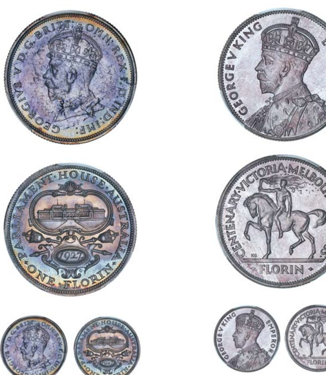
1026* George V, Melbourne Mint proof Canberra florin commemorative, 1927. Deep iridescent toning, obverse with barely visible tissue paper toning streaks, probably the most brilliant, beautifully coloured proof known, FDC and very rare.