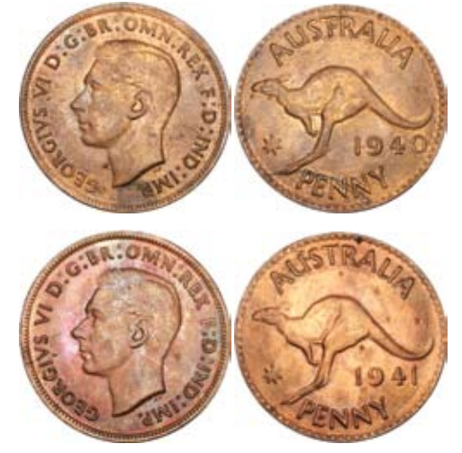
1137* George VI, 1940K.G., 1941K.G. Red and brown, uncirculated and rare thus. (2) $400