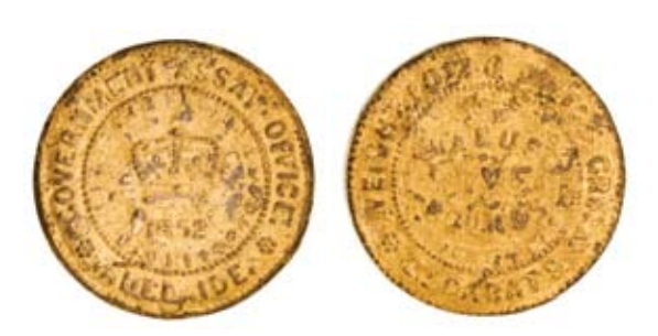
930* Adelaide five pounds, 1852, gilt lead copy. Patchy gilding, otherwise good and scarce. $250