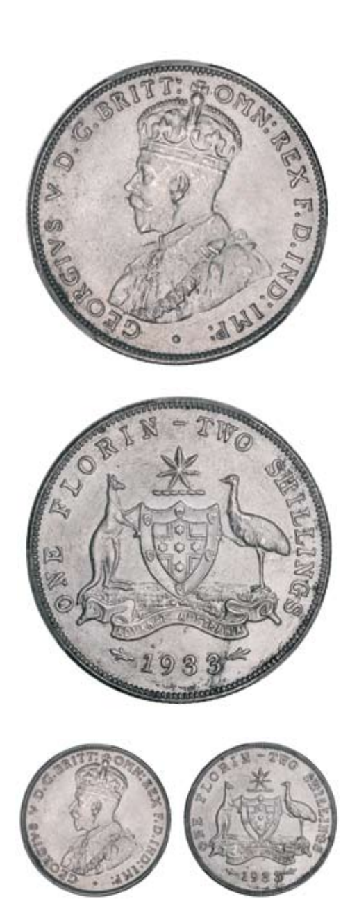
1060* George V, 1933. Well struck, light golden brown toning on highlights, carbon tone streak through last figure of date, uncirculated and very rare in this condition, one of the finest known.