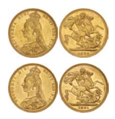
985* Queen Victoria, 1890 and 1891 Sydney (McD.180a, 182). Good extremely fine. (2)