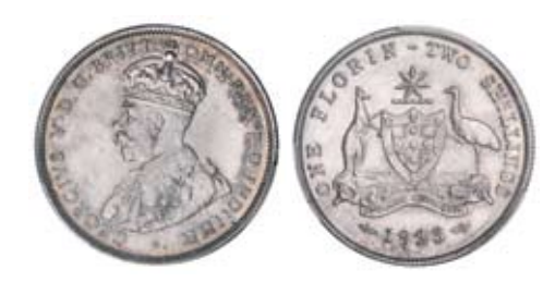
1054* George V, 1923. Attractive full iridescent mint bloom, nearly gem uncirculated and very rare in this condition, one of the finest known.