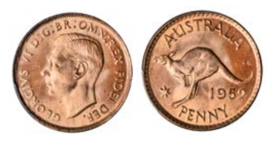
1142* George VI, 1952. Full original mint red, choice uncirculated.

In slabs by NGC as MS65RB, PCGS as MS65RB, MS64RD.