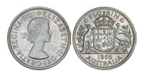
1071* Elizabeth II, 1956. Choice uncirculated.

In a slab by PCGS as MS65. Private purchase from Pacific Rim.