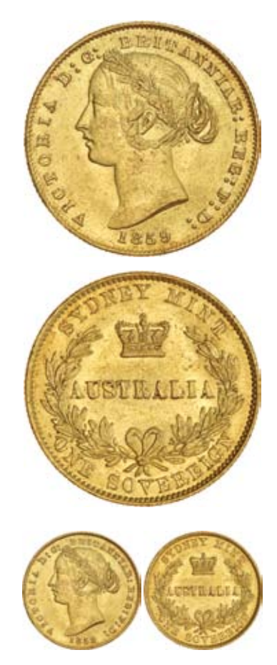
934* Queen Victoria, second type, 1859. Nearly uncirculated and very rare in this condition, one of the finest known. $8,000