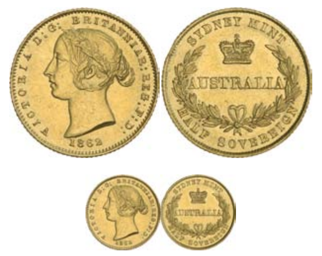
951* Queen Victoria, second type, 1862. Good extremely fine and one of the finest known.