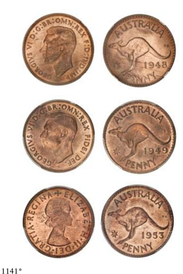
George VI, 1948, 1949; Elizabeth II, 1953. Full mint red, choice uncirculated. (3)

In slabs by NGC as MS65RB, PCGS as MS65RB, MS64RD.