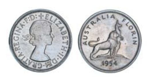
1037* Elizabeth II, Royal Mint proof Royal Visit florin, commemorative, 1954. Fully brilliant, FDC and excessively rare if not unique.