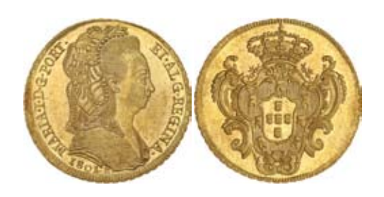
916* Brazil, Maria I, 6,400 reis or half Johanna, 1801R (Rio) (KM.226.1). Nearly uncirculated .

Ex RMS Douro Cargo with Monetarium Certificate 21/2/97.