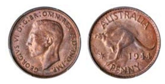
1139* George VI, 1944Y. Nearly full original red brown mint bloom, uncirculated and scarce.

Private purchase from Drake Sterling 24/11/2016.