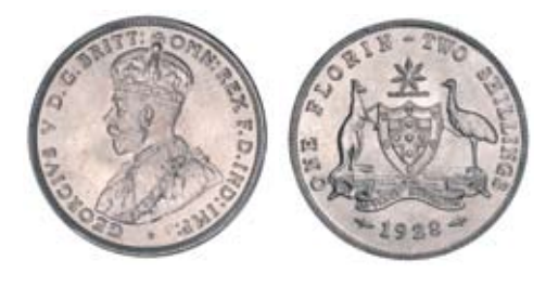
1058* George V, 1928. Well struck, full original satin-like mint bloom, gem uncirculated and rare in this condition, one of the finest known.