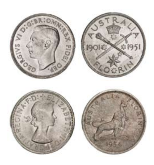
1065* George VI, 1951 Jubilee; Elizabeth II, 1954 Royal Visit. Full mint bloom, minor scuff on King's neck, uncirculated; choice uncirculated reverse toned. (2) $300