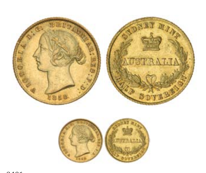
Queen Victoria, second type, 1858. Considerable mint bloom, uncirculated and rare in this condition, one of the finest known.