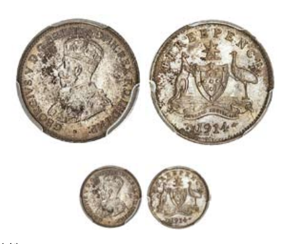
1114* George V, 1914. Full mint bloom, FDC and rare in this condition.

Ex Noble Numismatics Sale 114A (lot 1318).