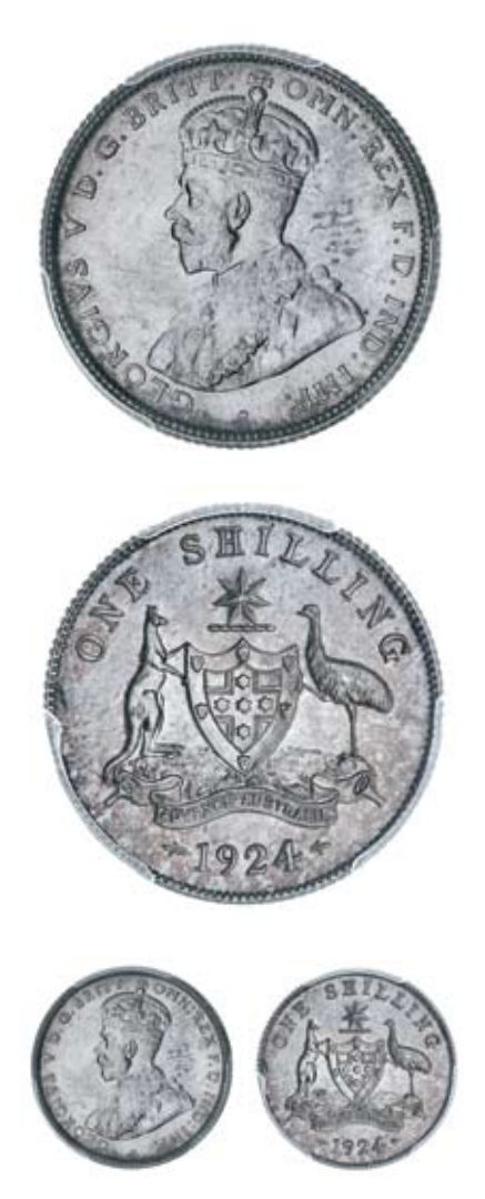
1078* George V, 1924. Full original frosty mint bloom, iridescent on the reverse, choice uncirculated and rare in this condition, one of the finest known.