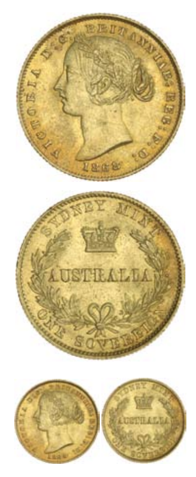
Queen Victoria, second type, 1868. Struck with copper alloy, subdued mint bloom, uncirculated and rare thus, one of the finest known.