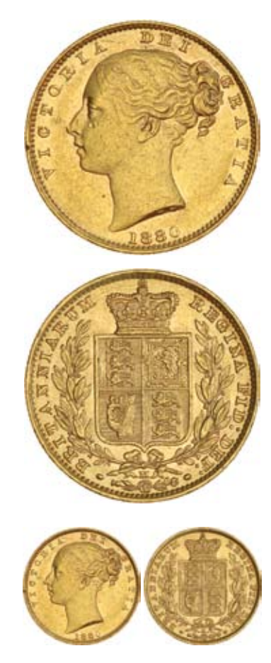
961* Queen Victoria, 1880 Melbourne. Dent on cheek under eye, otherwise nearly extremely fine/extremely fine and very rare.

Ex "The Douro Cargo" via Monetarium with their ticket.