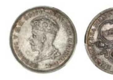
1057* George V, 1927 Canberra. Toned uncirculated.