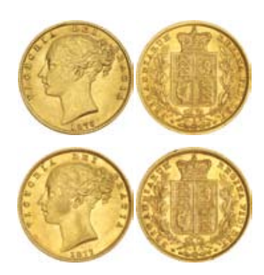
958* Queen Victoria, 1875 and 1877 Sydney. Nearly extremely fine/extremely fine. (2)

Ex RMS Douro Cargo, with Monetarium Certificate 21/2/97 and holder.