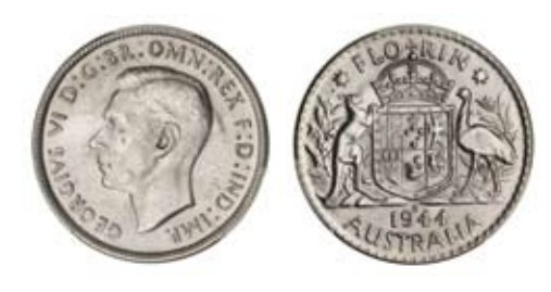
1064* George VI, 1944S. Uncirculated .