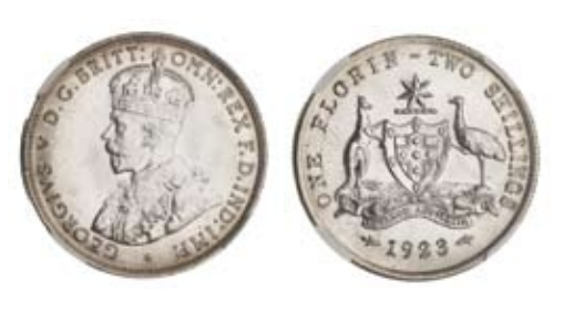
George V, 1923. Peripheral die breaks on the reverse, full brilliant mint bloom, choice uncirculated, nearly gem and rare in this condition.