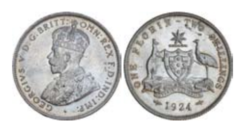
1055* George V, 1924, sans serif. Choice uncirculated.

Ex IAG Sale 83 (lot 559) and originally one of Baldwin's stock sent by the Melbourne Mint and then sold by Spink Australia in 1978.