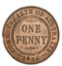
1134* George V, 1936. Full mint red, uncirculated.