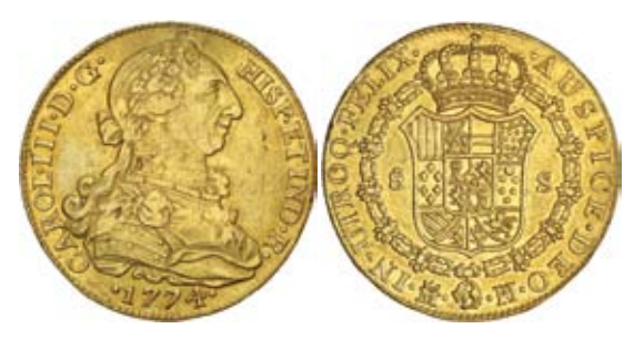
927* Spain, Charles III, eight escudos, 1774 P.J., Madrid Mint (F.282; KM.409.1). Nearly very fine . $1,500