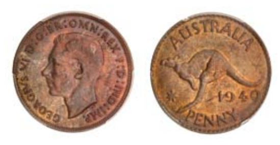
1136* George VI, 1940K.G. Nearly uncirculated with some mint red.