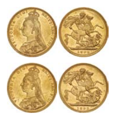
986* Queen Victoria, Jubilee head, 1892 and 1893 Melbourne (McD.185, 188a). Good extremely fine. (2) $1,200