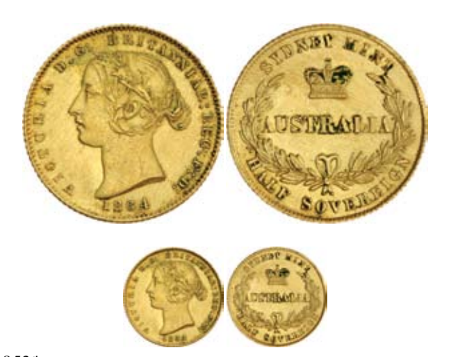
952* Queen Victoria, second type, 1864. Brushed to clean, otherwise sharp good extremely fine and rare in this condition.