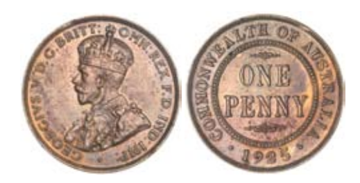
1130* George V, 1925 London die. Q die state, red and brown streaks, nearly extremely fine/extremely fine.