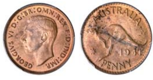
1138* George VI, 1941. Dusty reverse, mostly red uncirculated. $200