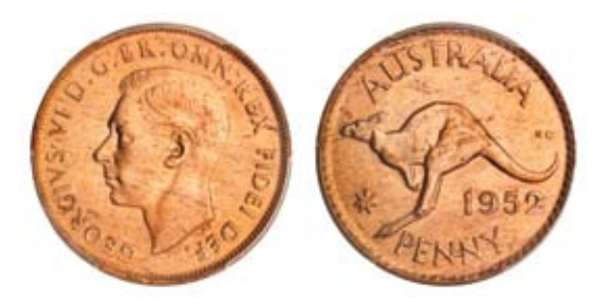
1143* George VI, 1952. Full original mint red, choice uncirculated.