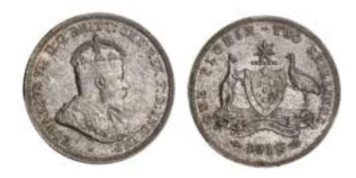
1050* Edward VII, 1910. Minor surface contact marks mentioned only for accuracy, attractive cartwheeling mint bloom, uncirculated.