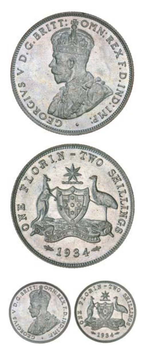
1061* George V, 1934. Sharply struck like a specimen, contact mark under King's eye, otherwise uncirculated. $2,000

In a slab by PCGS as MS65 (previously MS64), only one finer. Ex Fenton Collection (lot 3026).