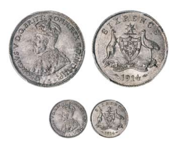
1091* George V, 1914. Subdued full original mint bloom, choice uncirculated and rare in this condition, one of the finest known.