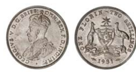
1059* George V, 1931. Full satin-like original mint bloom, choice uncirculated.

In a slab by PCGS as MS65+, only one finer graded MS66. Ex Universal Coin Company Sale, PCGS No 9 (lot 289).