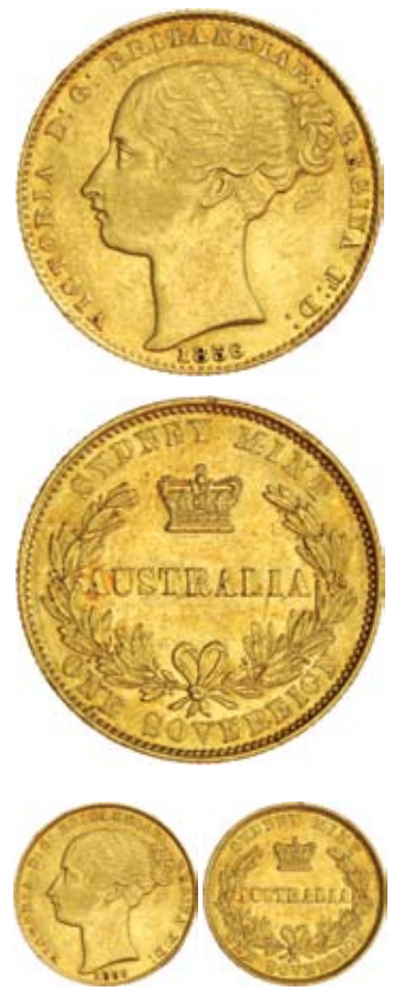
931* Queen Victoria, first type, 1856, with filleted head left by James Wyon. Very fine/good very fine and very scarce. $4,000