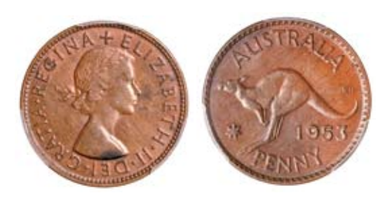
1144* Elizabeth II, 1953, long 5, different 3. Brown with hints of red, good extremely fine and rare. $300

In a slab by PCGS as MS62BN. Ex eBay sale 19/6/2017.