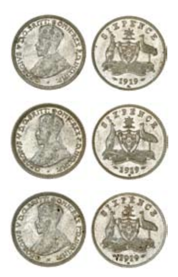
1095* George V, 1919M. Nearly uncirculated. (3)

In a slab by PCGS as MS66, only one finer at MS67. Ex P.Adler Collection, from IAG 24/11/17.