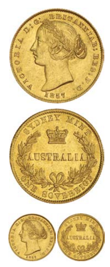
932* Queen Victoria, second type, 1857. Good extremely fine and rare in this condition.