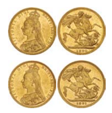
984* Queen Victoria, 1890 and 1891 Melbourne (McD.181, 183a). Nearly uncirculated. (2)