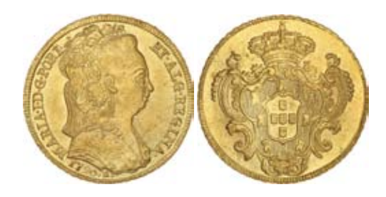
915* Brazil, Maria I, 6,400 reis, 1790 Rio (KM.226.1). Good extremely fine. $1,500

Ex RMS Douro Cargo with Monetarium Certificate 21/2/97.