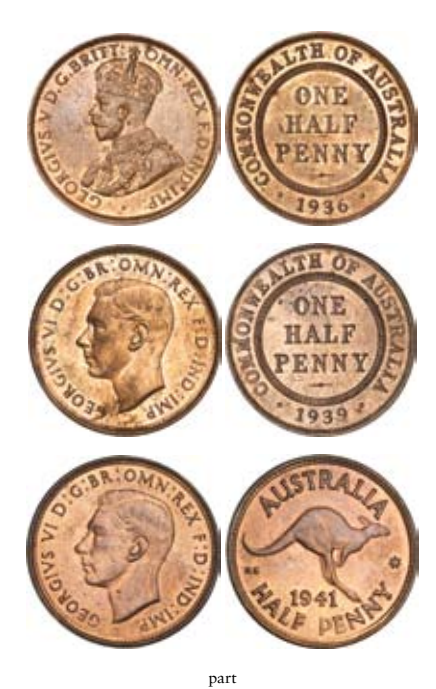
1153* George V - George VI, 1936, 1938, 1939, first reverse (2), 1941, 1942Y. Mostly with considerable mint red, nearly uncirculated. (6) $150