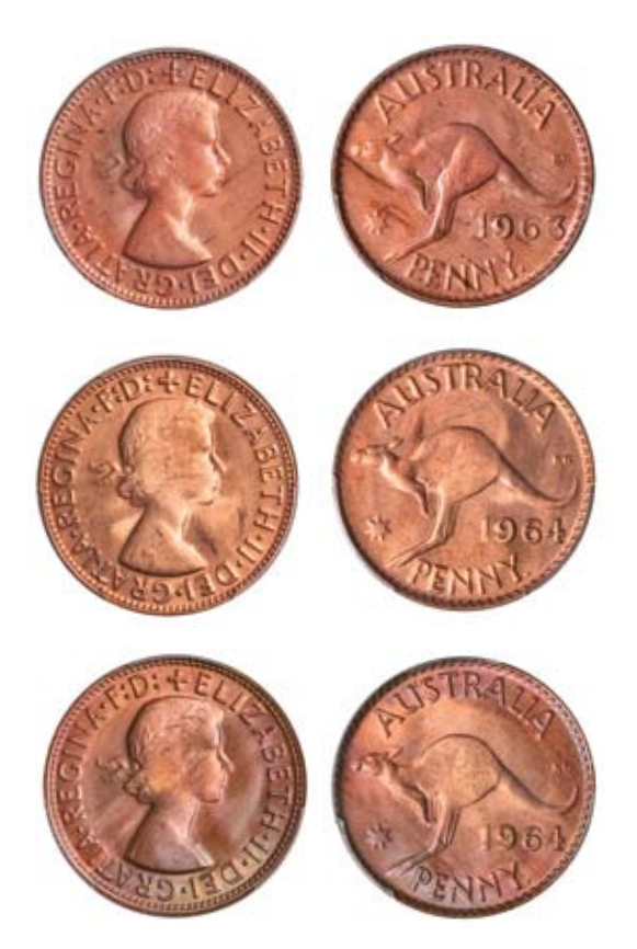
Elizabeth II, 1963Y., 1964Y. (2). Flat strikes in centres, otherwise choice uncirculated. (3)

In a slab by PCGS as MS62BN. Ex eBay sale 19/6/2017.