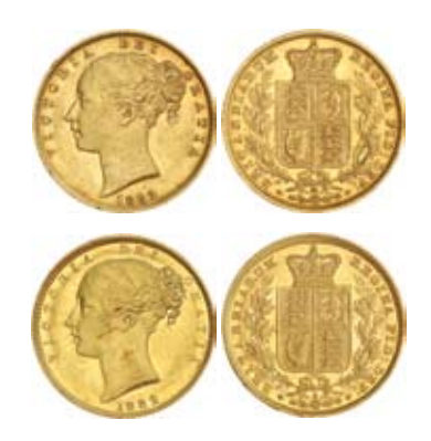
964* Queen Victoria, 1882 Melbourne and Sydney. Extremely fine ; good extremely fine. (2)