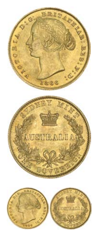
940* Queen Victoria, second type, 1866. Unmarked surfaces, subdued mint bloom, uncirculated.