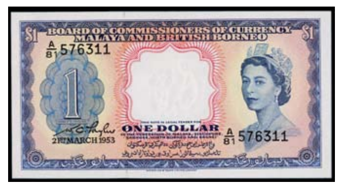
lot 2170 part