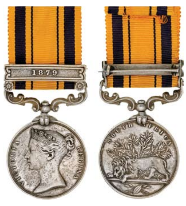
3234* South Africa Medal 1877-79, - clasp - 1879 with fitted pin-back. 484. Pte. J.McLauchlin, 2/4th Foot. Officially engraved. Surface pitting on obverse, small edge bump, otherwise very fine.