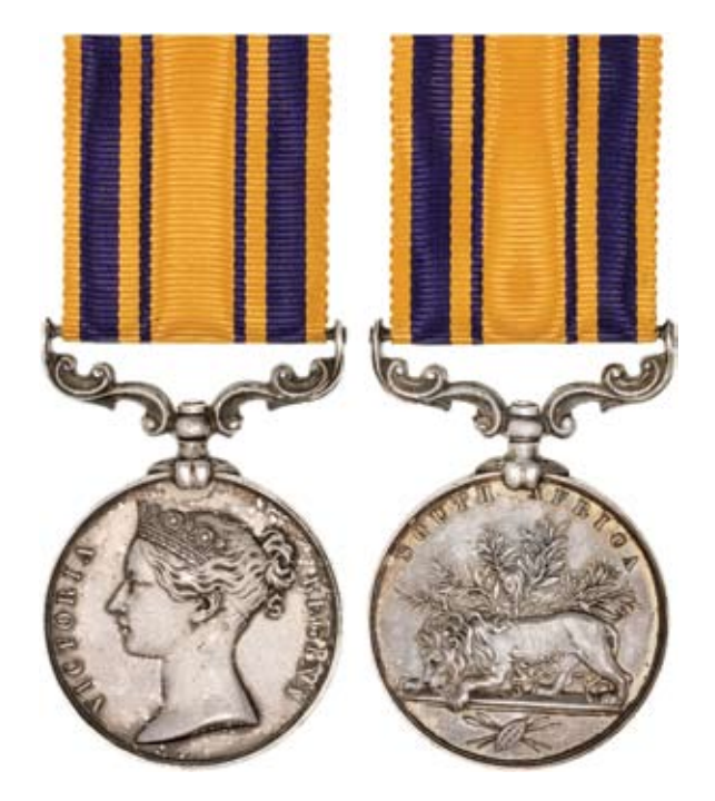
3241* South Africa Medal 1877-79. E.Meades, Ord:H.M.S "Boadicea". Officially engraved. A few minor edge nicks, nicely toned good very fine. $800

Ex Dix Noonan Webb auction sale 19 - 21 June 2013 (lot 436), realised 270GBP.