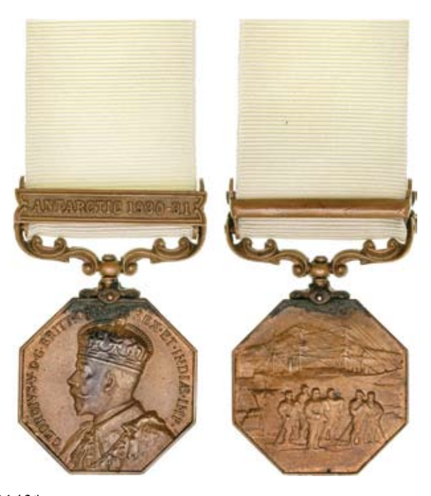
3143* Polar Medal, in bronze (GVR crowned bust), - clasp - Antarctic 1930-31. George J. Rhodes. Engraved. Oxidation at top edge near suspender and dark toning on King's head, otherwise good very fine and scarce.