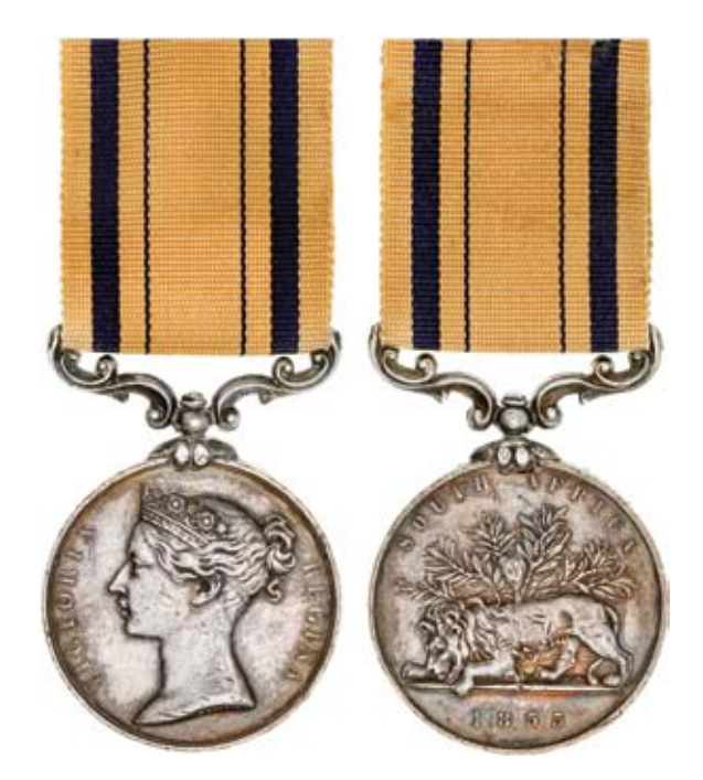
3214* South Africa Medal 1834-53. G. Paddock. 90th Regt. Impressed. Edge nicks and contact marks , otherwise nearly very fine .