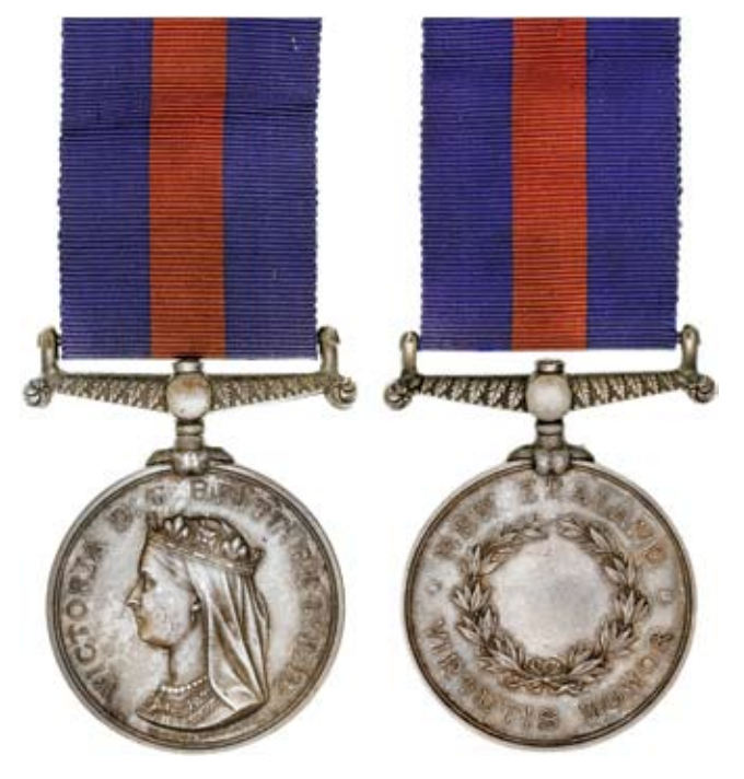
3222* New Zealand Medal 1869, undated reverse. 157. Pte W.Cook. 70th Rgt. Engraved. Dark toned, small contact marks on cheek, otherwise extremely fine. $450