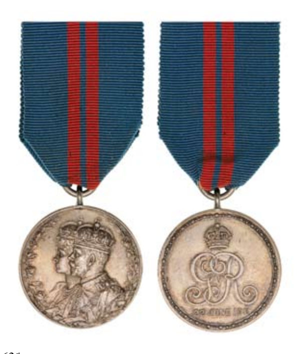
3262* Coronation Medal 1911. Unnamed as issued. Toned extremely fine .