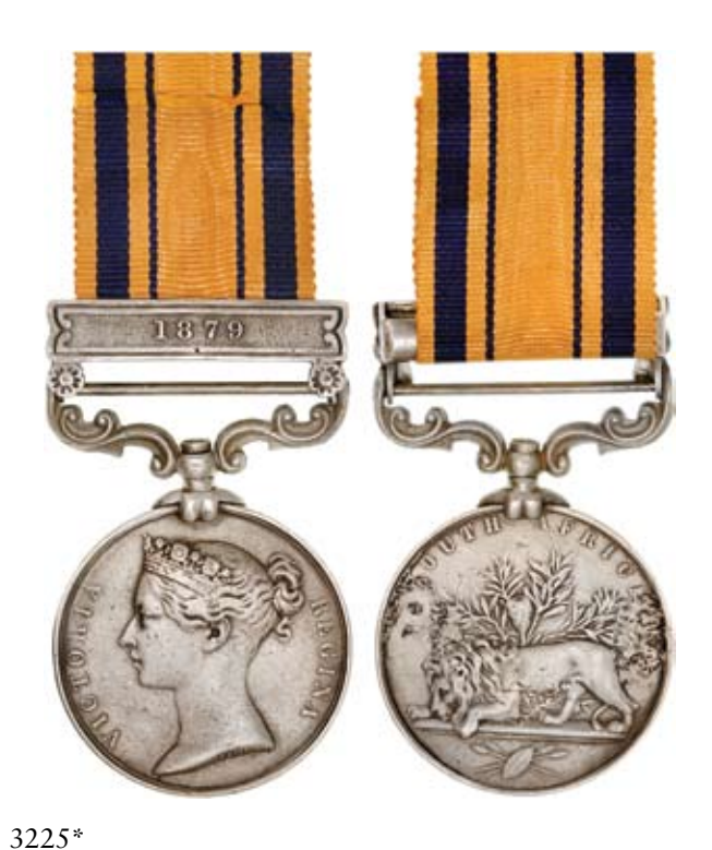
South Africa Medal 1877-79, - clasp - 1879. Tpr. J.Johnson. 2nd Cape Yeory. Officially engraved. Repair marks at sides of reverse where pin-brooch was previously fitted, contact marks and sweating, otherwise very good.

Ex Dix Noonan Webb auction 18 & 19 Sep 2014 (lot 1105), realised 310GBP.