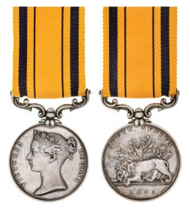
3216* South Africa Medal 1834-53. W.Winter. 1st Bn Rifle Bde. Impressed. Small edge nicks and contact marks, otherwise very fine.