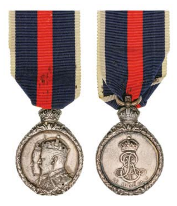
3261* Coronation Medal 1902, in silver. Unnamed as issued. Contact marks, otherwise good very fine. $150