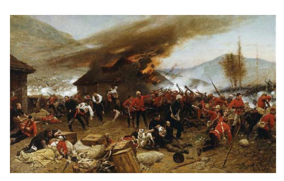
The defence of Rorke's Drift 1879 by Alphonse de Neuville in the collection of Art Gallery of New South Wales

Only one 1878 clasp issued to 1/24th Foot.