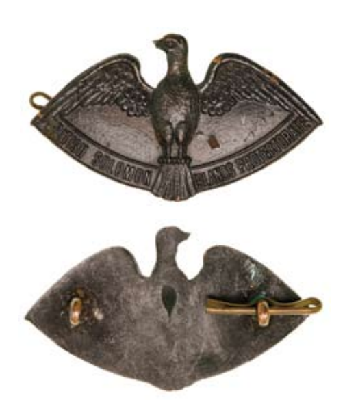
3293* British Solomon Islands Protectorate , hat badge, c1930s, in oxidised bronze, two lugs on reverse. Good very fine . $100

3294 Ceylon Mounted Infantry, belt buckle by Hobson & Sons / Lexington St / London W. Good very fine. $150