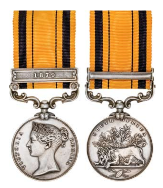
3238* South Africa Medal 1877-79, - clasp - 1879. 38 Pte. H.Southernwood. 57th Foot. Officially engraved. A few small edge nicks, otherwise extremely fine. $1,000