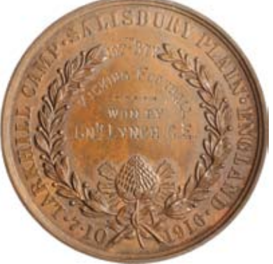
lot 3332 part