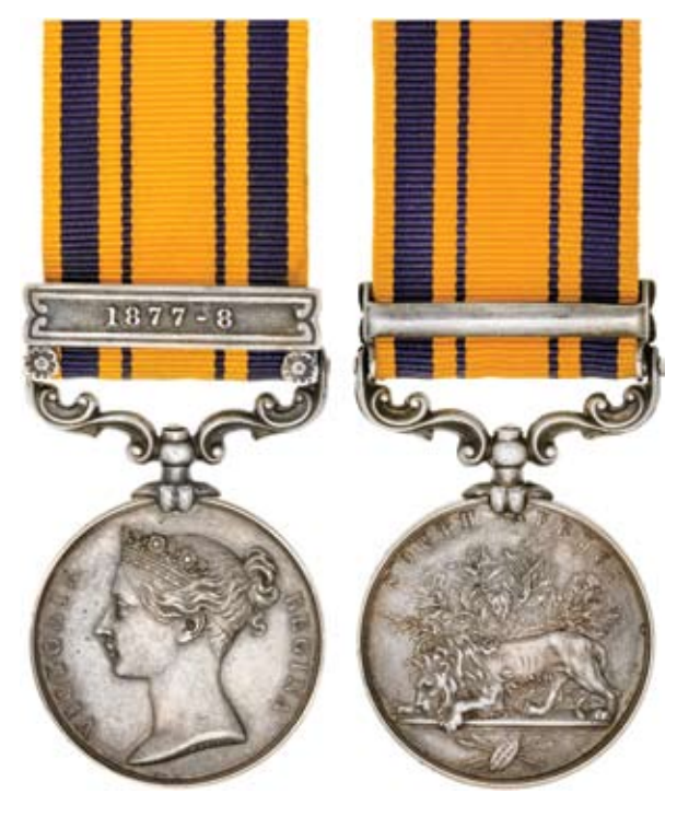
3224* South Africa Medal 1877-79, - clasp - 1877-8. Tpr H.Willmore. Albany. Rangers. Officially engraved. Light hairlines, toned extremely fine .