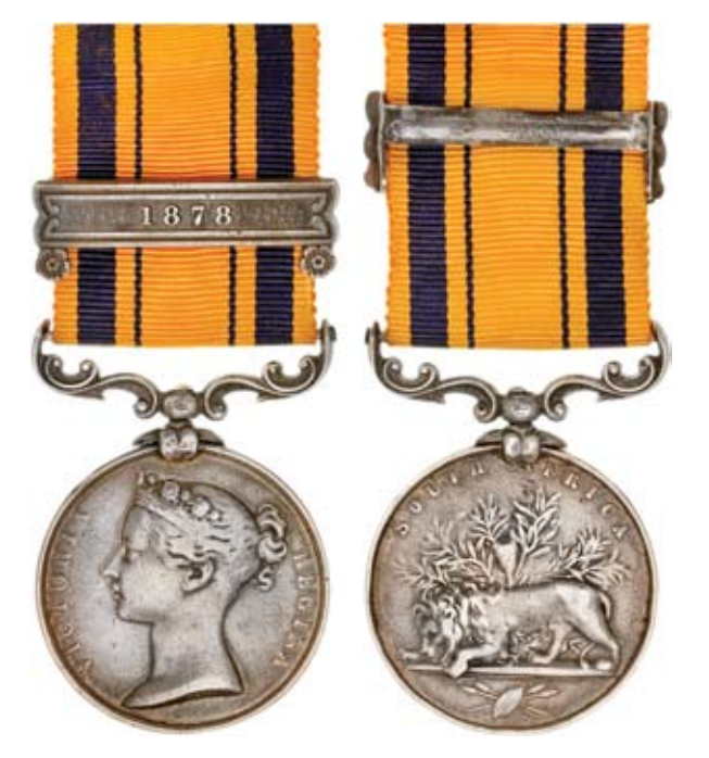
3226* South Africa Medal 1877-79, - clasp - 1878. Corpl. J.Lane. Riversdale Md. Rgrs. Officially engraved. The clasp not attached to suspender, medal with porous surface, very good. $700