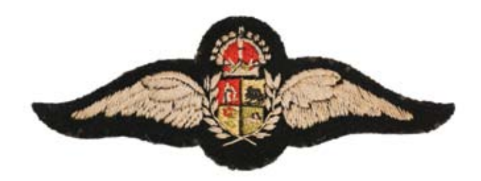
3297* South African Air Force, embroidered pilot's wings (KC). Nearly extremely fine. $70

3296 France, WWI helmet plate in brass (21.5x4.5cm), marked on front in relief, 'Soldat de La Grande Guerre/1914-1918'. A few dents, otherwise very fine.