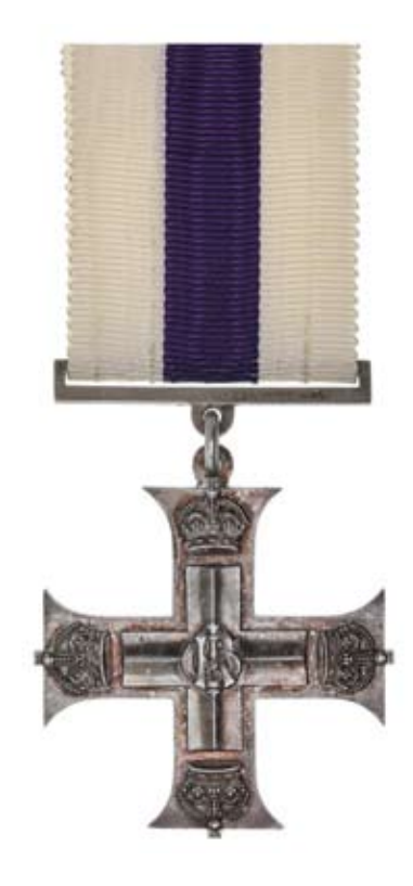
3213* Military Cross, (GRI), with pin-back ribbon suspender. Unnamed. Toned, nearly extremely fine . $500