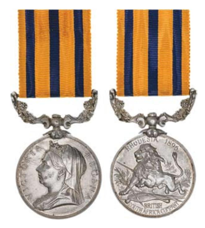
3244* British South Africa Company Medal 1890-07, Rhodesia 1896 reverse. Rev.Father E.Biehler.S.R. Engraved. Obverse with edge bruise at 5 o'clock, good very fine.