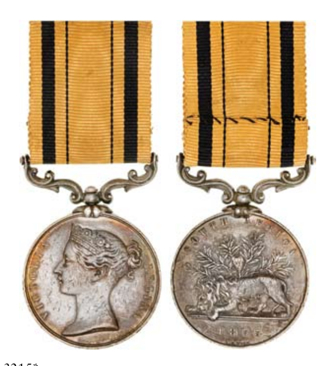
3215* South Africa Medal 1834-53. T.Payne. 1st Bn. Rifle Bde. Impressed. Edge nicks and contact marks, otherwise very fine.

Ex Dix Noonan Webb auction 13 & 14 Sep 2012 (lot 52), realised 410GBP.