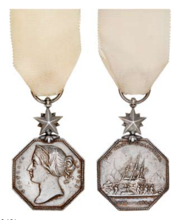
3265* Arctic Medal 1818-55. Unnamed as issued. Contact marks, otherwise toned nearly very fine.