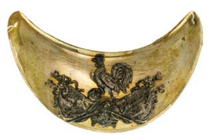
3295* France, officer's gorget in silvered (approx 14x5.4cm), decorated with a rooster and standards. Leather backing loose at top edge, easily fixed, otherwise very fine. $100

3296 France, WWI helmet plate in brass (21.5x4.5cm), marked on front in relief, 'Soldat de La Grande Guerre/1914-1918'. A few dents, otherwise very fine.