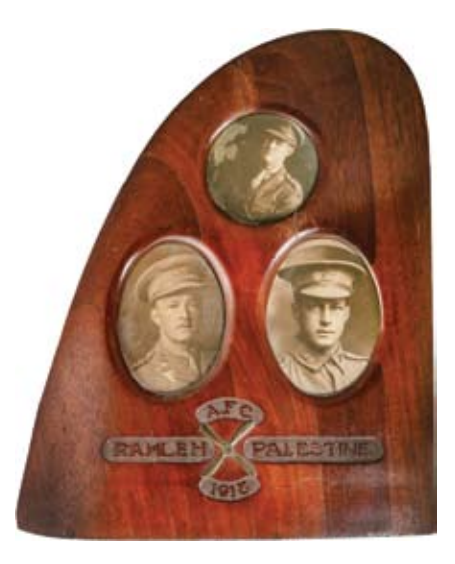
3176* Family Group to the Walker Brothers including AFC Pilot KIA.