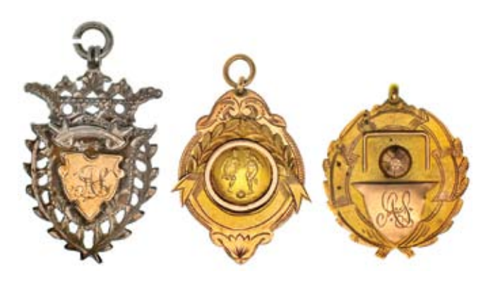
lot 3154 part

With copies of Gazette pages and other research.