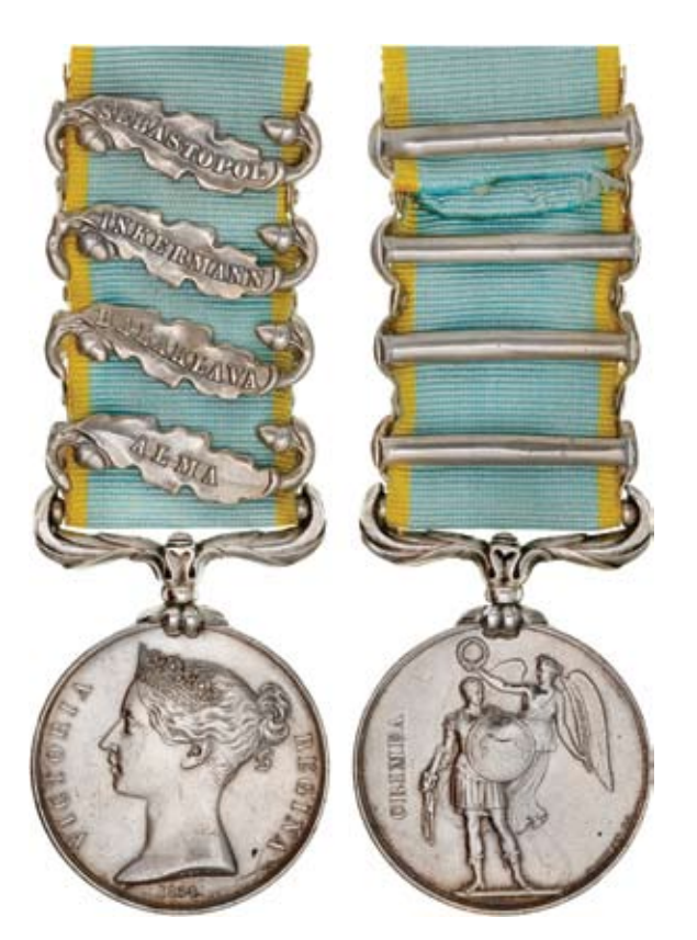
3218* Crimea Medal 1854-56, - four clasps - Alma, Balaklava, Inkermann, Sebastopol. Name erased. Good very fine .