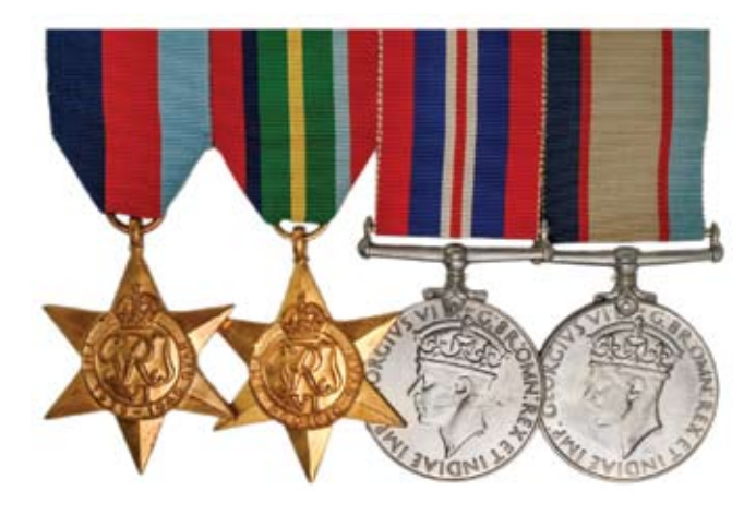
3205* Group of Four to POW died on 1st Sandakan Death March: 1939-45 Star; Pacific Star; War Medal 1939-45; Australia Service Medal 1939-45. VX60012 D.C.C.Wraight. All medals impressed. Swing mounted, nearly uncirculated.