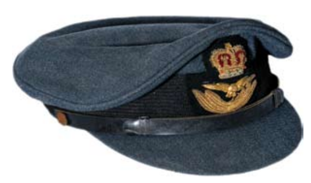
lot 3301 part