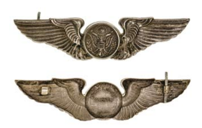
3299* USA, WWII Air Force pilot's wings badge in sterling silver, by Angus & Coote, Sydney, pin-back but pin missing. Very fine and scarce made in Sydney issue. $150