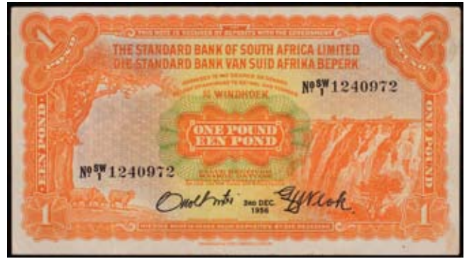
2259* South West Africa, The Standard Bank of South Africa Limited, one pound, 3rd December 1956, No SW/1 1240972 (P.11). Good very fine.