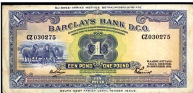
2257* South West Africa, Barclays Bank D.C.O. (Dominion, Colonial and Overseas), one pound, 29 November 1958, No CZ030275 (P.5b). Slight stains, otherwise good fine.