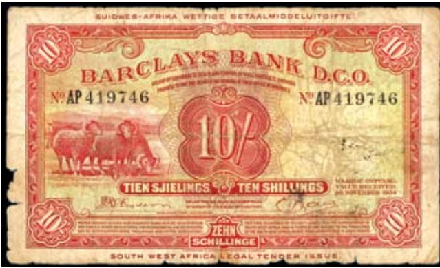
2256* South West Africa, Barclays Bank D.C.O. (Dominion, Colonial and Overseas), ten shillings, 30th November 1954 No AP419746 (P.4a). Fair.