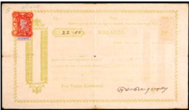
2263* Straits Settlements, Malacca, Promissory note for twenty two Spanish dollars, 189-, bearing interest at 24 per cent per annum from the date of note. Centre folds with small hole at centre otherwise good very fine.