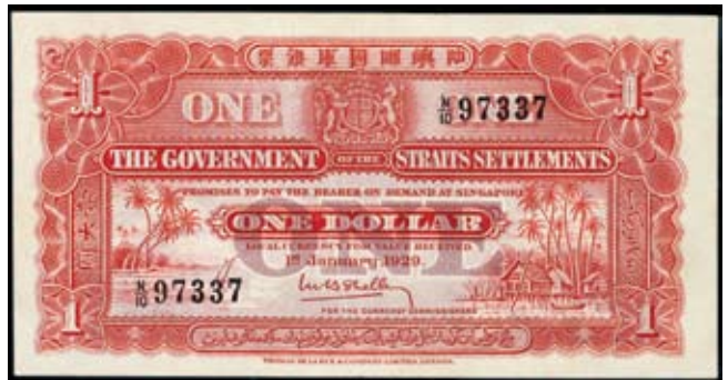
2267* Straits Settlements, The Government of the Straits Settlements, one dollar, 1st January 1929, N/10 97337 (P.9). Very fine.