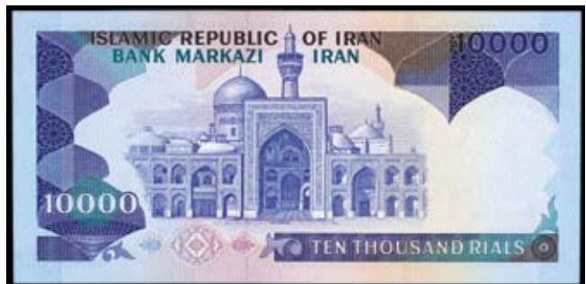
lot 2329 part