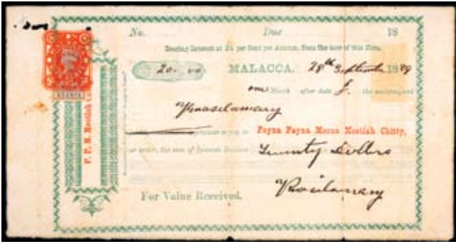
2262* Straits Settlements, Malacca, Promissory Note for twenty Spanish dollars, 28th September 1889, bearing interest at 24 per cent per annum from date of note. Centre fold and vertical quarter fold at right, four small holes at top left otherwise very fine.