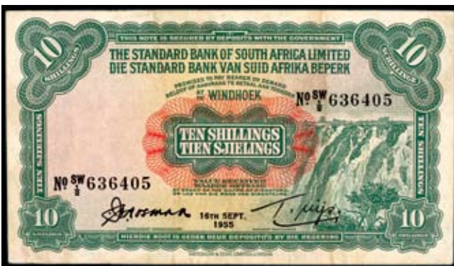
2258* South West Africa, The Standard Bank of South Africa Limited, ten shillings, 16th Sept. 1955, No SW 1/2 636405 (P.10). Good very fine.