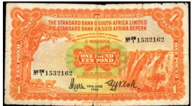
2260* South West Africa, The Standard Bank of South Africa Limited, one pound, 15th June 1959, No SW/1 1532162 (P.11). Tear in centre, frayed top and bottom edges, otherwise very good.