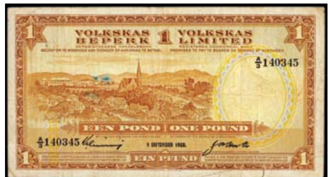
2261* South West Africa, Volkskas Limited, one pound, 1st September 1958, A/3 140345 (P.14b). Tear bottom right, otherwise good fine.