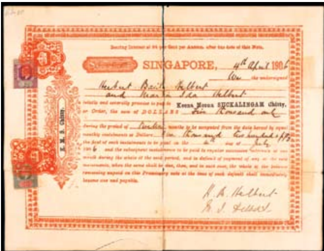
2264* Straits Settlements, Singapore, Promissory note for five thousand dollars, 4th April, 1906, to be paid during the period of twelve months to be computed from the date hereof by equal monthly instalments of dollars, one thousand two hundred and fifty. In half due to centre fold and with peripheral tears due to folds otherwise very fine.