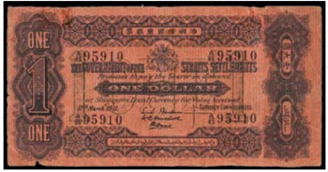
2265* Straits Settlements, The Government of the Straits Settlements, one dollar, 17th March 1911, A/85 95910 (P.1b). Very good.