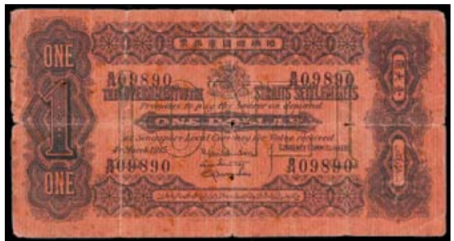
2266* Straits Settlements, The Government of the Straits Settlements, one dollar, 4th March 1915, B/34 09890, (P.1c). Heavy quarter folds with tears, scarce, good - very good.