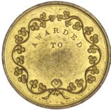
488* Hibernian Australasian Catholic Benefit Society , award medal in gilt (47mm), by Stokes & Martin, unnamed. Hairlines on reverse, otherwise good very fine and scarce. $100