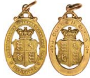
517* Commonwealth Celebrations, Victoria, May 1901 , fob in voided gold (15ct; 7.04g; oval 19x25.5mm), no maker, scroll and ring top suspension, reverse inscribed, 'J.Cullen. M.L.A'. Good fine and scarce.