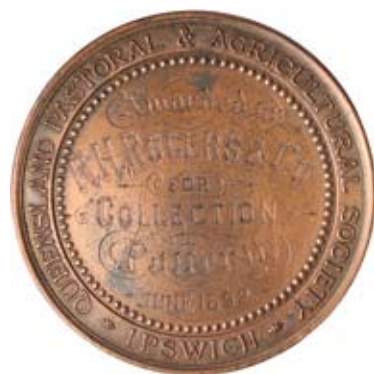
496* Queensland Pastoral & Agricultural Society, Ipswich , in bronze (49mm), by J.S. & A.B. Wyon, reverse inscribed, 'Awarded to/R.H.Rogers & Co/for/Collection/Pottery/June 1892.'. Cleaned, several tone spots, otherwise very fine.