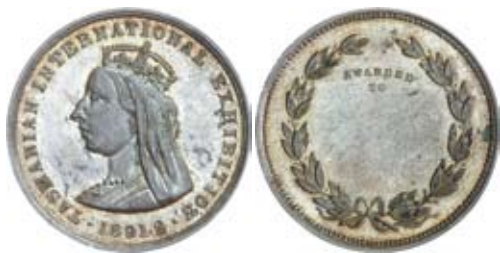
493* Tasmanian International Exhibition, 1891-2 , in silver (32mm) (C.1891-2/4) variety with 'Awarded/To' on reverse, unnamed. Toned good very fine.