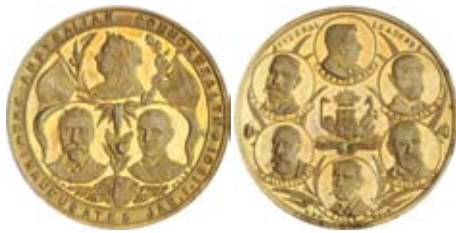
515* The Australian Commonwealth, Inaugurated Jan.1.1901 , in gilt silver (30mm) (C.1901/57), by A.H.W. (A.H.Wittenbach), Melb. Nearly uncirculated and scarce.