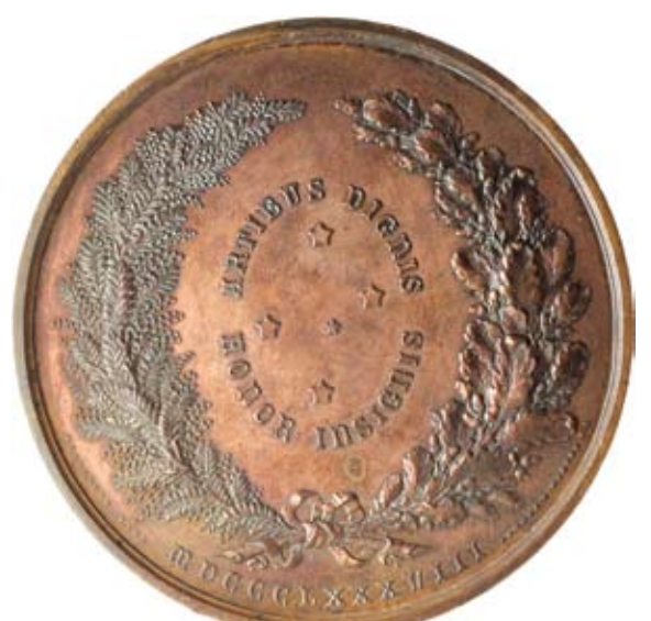
485* Centennial International Exhibition, Melbourne, 1888 , in bronze (76mm) by Melbourne Mint & Stokes & Martin, impressed around edge 'A.Galli and Co'. Obverse and reverse with cut marks, otherwise very good.