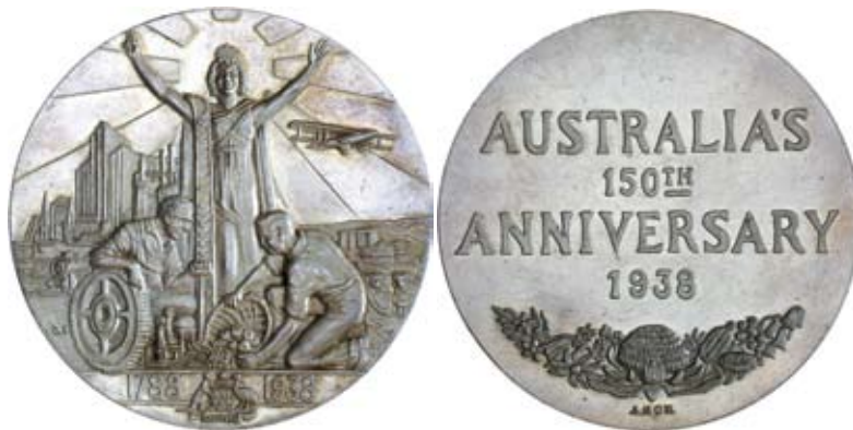
580* Australia's 150th Anniversary, 1938, in silver (51mm) (C.1938/17), by Amor. Hairlines, otherwise nearly uncirculated and scarce in silver.