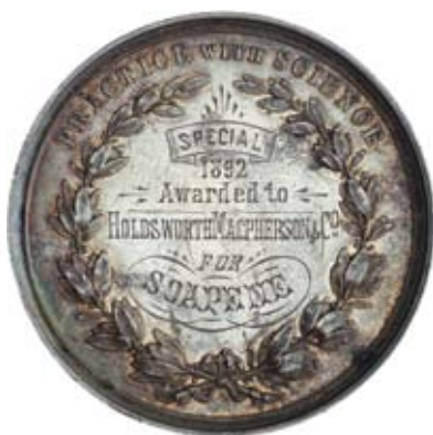
494* Agricultural Society Of New South Wales , in silver (51mm), by Hardy Brothers, Sydney, reverse inscribed, 'Special/1892/Awarded to/Holdsworth Macpherson & Co./For/Soapene'. Edge nicks, otherwise toned very fine.