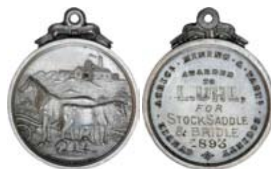
497* Gympie Agricl (Agricultural) Mining & Pastl (Pastoral) Society , in silver (25mm), by Wittenbach & Co, ribbon top suspension, reverse inscribed, 'L.Uhl,/For/Stock Saddle/& Bridle/1893'. Uncirculated.