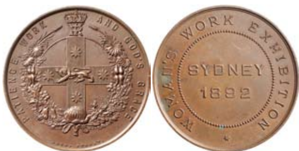
495* Woman's Work Exhibition, Sydney, 1892 , in bronze (39mm) (C.1892/3), by Amor, Sydney. A few oxidation spots on obverse, otherwise toned extremely fine and scarce.