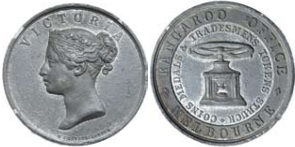
446* Kangaroo Office, Melbourne, in white metal (38mm) (C.V/2), by W.J.Taylor, London. Small edge nicks and dark toning, otherwise very fine and very rare.