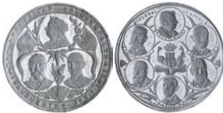
516* The Australian Commonwealth, Inaugurated Jan.1.1901 , in aluminium (30mm) (C.1901/57), by A.H.W. (A.H.Wittenbach), Melb. Some edge nicks, otherwise nearly uncirculated and scarce.