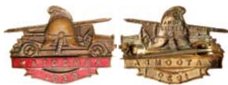
581* Katoomba Fireman's badge, 1939, in bronze and enamel (27x20mm), by Amor, Sydney, pin-back. Bend at left side and very small enamel chip, otherwise good very fine.