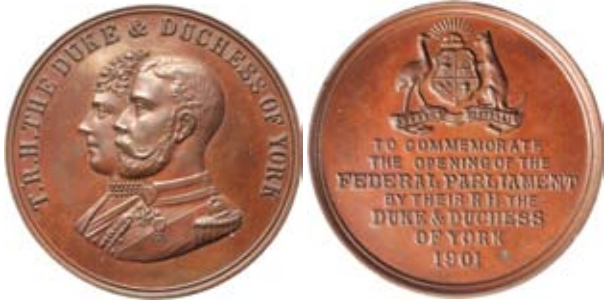
514* Opening of the Federal Parliament by Their R.H. The Duke & Duchess of York, 1901 , in bronze (39mm) (C.1901/43). Minor edge nick, proof-like appearance, nearly uncirculated and scarce.