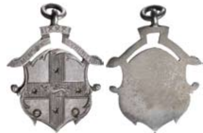
487* Womens Ind(ustria)l Exhibition, 1888 , uniface, handcrafted and engraved in silver (26x29mm) (C.1888/35), no maker, ring top suspension, unnamed. Toned, nearly extremely fine and very rare.