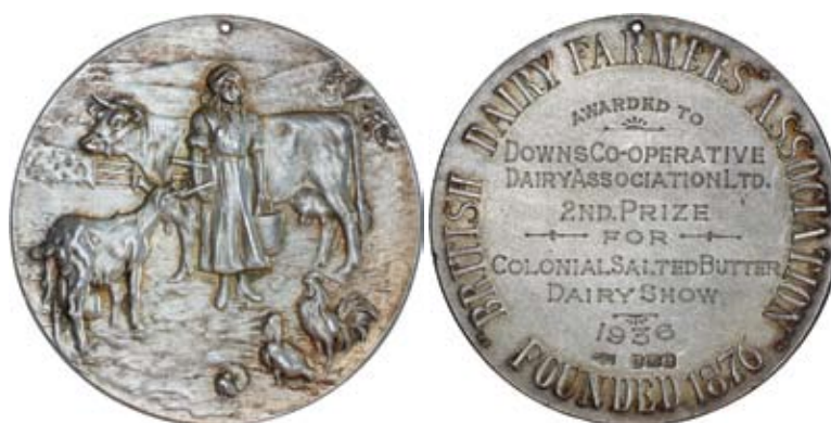
575* British Dairy Farmers' Association, Founded 1876 , award medal in silver (51mm), by MnWb (Mappin & Webb, London), reverse inscribed, 'Awarded To/Downs Co-operative/Dairy Association Ltd./2nd Prize/For/Colonial Salted Butter/Dairy Show/1936'. With small hole at top, extremely fine and scarce.