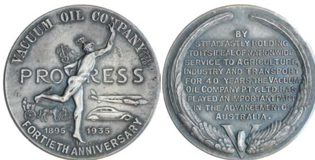
574* Vacuum Oil Company Fortieth Anniversary, 1935 , in silvered (69mm) (C.1935/7), by Stokes, Melb. A few very small edge nicks, some marks on obverse, otherwise toned good very fine.