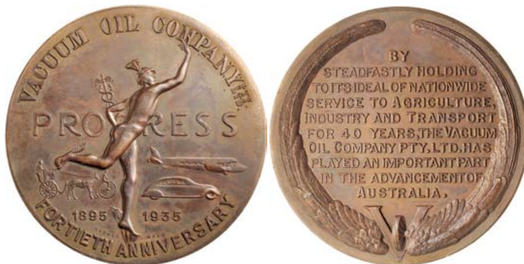
573* Vacuum Oil Company Fortieth Anniversary, 1935 , in bronze (69mm) (C.1935/7), by Stokes, Melb. Toned good extremely fine and rare as not listed in this metal by Carlisle.