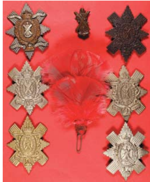
3466* Collection of Scottish badges , for Glengarry/hat/sporran, includes The Royal Highlanders Black Watch (KC) in gilt and nickel with maker's plate on reverse; another (KC) in nickel with broad leaves above lion; another (KC) in nickel with narrow leaves above lion; another (KC) in dark finish; Black Watch (QC) in white metal; Black Watch sporran badge in dark finish; Black Watch red feather hackle; Glasgow Highlanders 9th Battalion Highland Light Infantry. Displayed on sheet of thick paper, very fine - extremely fine, the first scarce. (8) $300