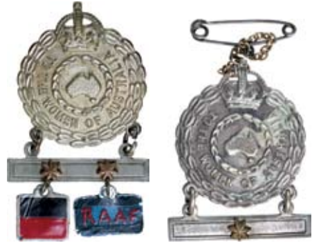
3416* Australia , Female Relative badge WWII, by G & E Rodd, 1940, pin-back, reverse numbered AF 180, with bar and two stars, suspended below this are two enamelled colour patches, one marked RAAF; another by G & E Rodd, 1940, pin-back with safety chain, reverse numbered A6437, with bar and one star. Very fine. (2) $80