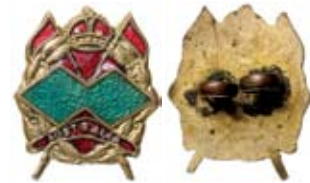
3417* Australia , WWII, Commando Independent Company lapel badge (KC), in gilt and enamel (19x22mm), no maker, lug back. Good very fine. $100

The green double diamond was the colour patch of 1st Independent Commando Company.