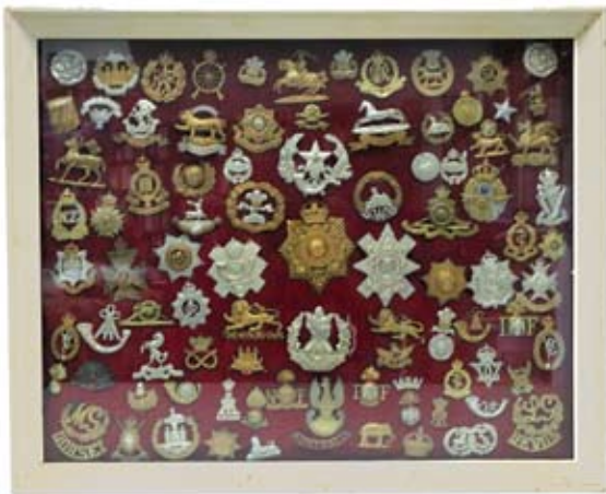
3465* Collection of badges , noted a few Australian and New Zealand, but mostly British, includes hat, collar and qualification badges in brass, bronze or white metal, mostly army but noticed a RAF badge and another unidentified flying badge, all displayed on red felt backing under glass in a white timber frame (49.5x40.0cm). Mostly very fine - extremely fine. (approx 90) $600