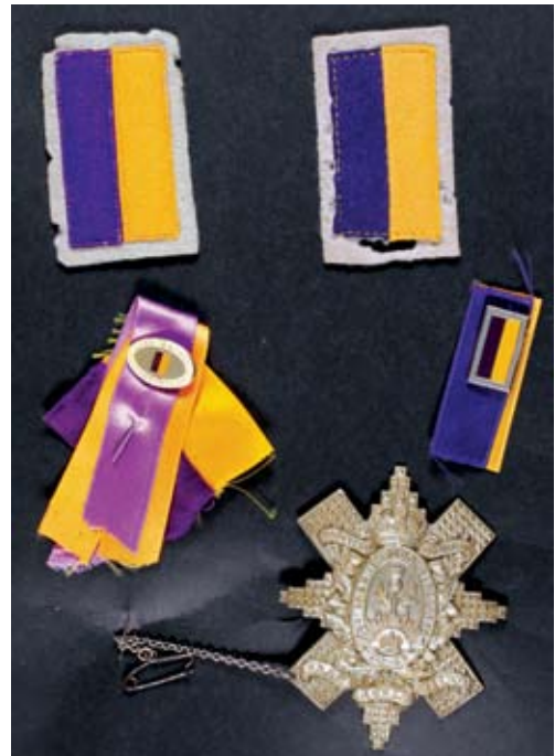
3430* 30th Infantry Battalion, (The NSW Scottish Regiment) hat badge, 1930-42, in white metal (74mm), pin-back with safety chain; a pair of shoulder flashes; a miniature metal shoulder flash on regimental colours silk ribbon; 2/30 Bn Association lapel badge on a regimental colours silk ribbon. The shoulder flashes with some moth holes on grey background, otherwise very fine - good very fine. (5)