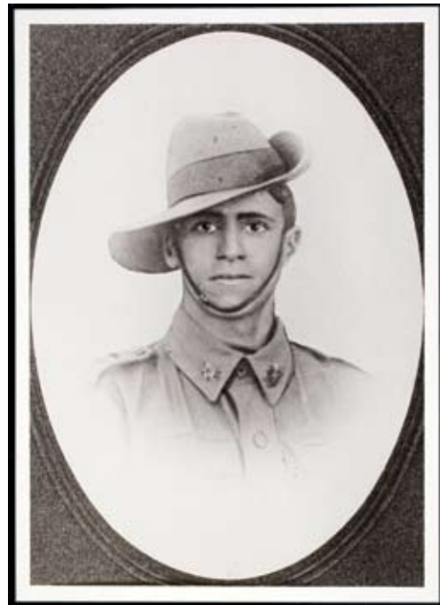
lot 3348 part