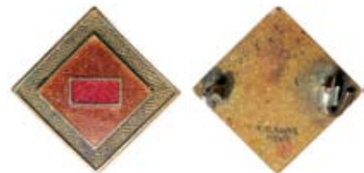
3418* Australia , Battalion Association badge, features unidentified unit colour patch, in gilt and enamel, by K.G.Luke, Melb, pin-back (pin missing). Nearly very fine. $50

The green double diamond was the colour patch of 1st Independent Commando Company.