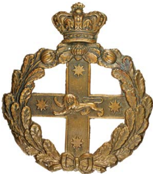
3427* NSW Military Forces, c1885, helmet plate in cast bronze (103mm) (Grebert p78), missing lugs. Fine.