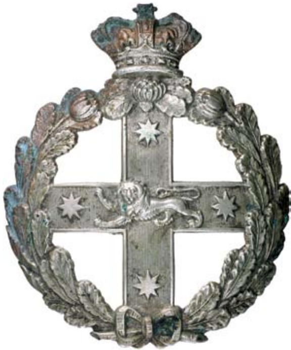
3426* NSW Military Forces, c1885, helmet plate in white metal (102mm) (Grebert p78). Some oxidation and a few bends on cross, otherwise good fine.