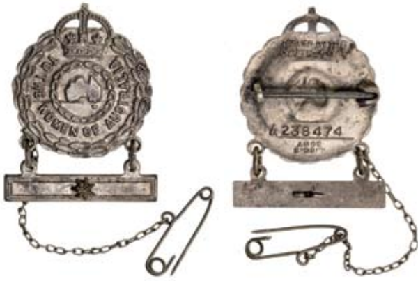
3414* Australia , Female Relative badge WWII, with one star, reverse numbered A238474, by Amor, Sydney, pin-back with safety chain. Extremely fine. $70