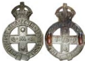
3442* Fifteenth Australian Light Horse (Q.M.I) , 1900-12, collar badge in white metal (27mm). Good very fine.