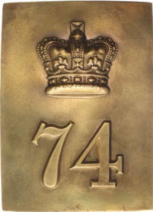
3463* 74th Highlanders , British Regiment of Foot, mid-1800s, cross belt plate in brass (67x92mm). Good very fine. $150