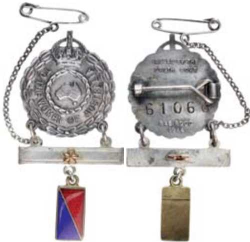
3415* Australia , Female Relative badge WWII, by G & E Rodd, 1940, pin-back, reverse numbered A8327, with bar and two stars; another by G & E Rodd, 1944, pin-back with safety chain, reverse numbered AF.61060, with bar and one star, suspended below this is an enamelled unit colour patch; another by Amor, Sydney, pin-back with safety chain, reverse numbered A265728, with bar and one star. Very fine. (3) $100