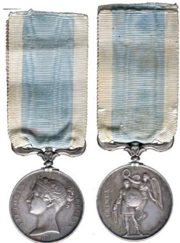
3293* Crimea Medal 1854. Unnamed. Ribbon faded, toned, nearly extremely fine.