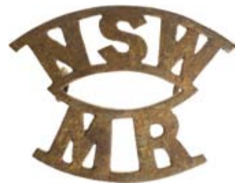
3429* NSWMR (NSW Mounted Rifles), shoulder title in brass. Very fine.