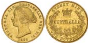
3634* Queen Victoria, second type, 1866. Good very fine. $750

Ex Stewart McLeod Collection, Noble Numismatics Sale 75 (lot 1408).