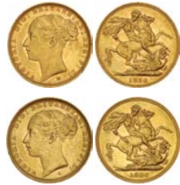
3669* Queen Victoria , 1886 Melbourne and 1886 Sydney. Extremely fine; nearly extremely fine . (2)