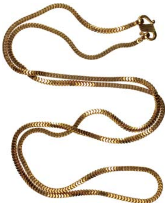
3794* Gold necklace , with decorative box chain links in 22ct gold (17.58g; approx 64cm). As new, uncirculated. $1,000