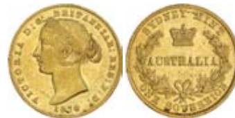
3641* Queen Victoria, second type, 1870. Very fine or better. $800