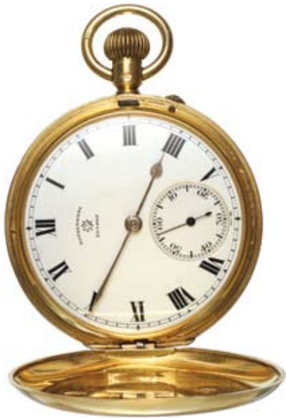
3833* Gentleman's Gold Full Hunter Pocket Watch , by Rotherhams London, in 18ct gold, (tot wt 96.30g), white dial with black Roman numerals and black hands, subsidiary sub dial with Arabic numerals, gold case hallmarked Birmingham, 1899, R&S, back elaborately engraved WHA. Extremely fine in case, not tested for accuracy.