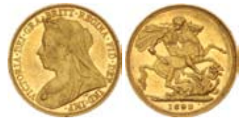
3689* Queen Victoria, 1899 Sydney. Extremely fine/good extremely fine.