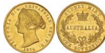
3642* Queen Victoria, second type, 1870. Good very fine. $650

Ex Spink Australia Sale 30 (lot 1936) and Noble Numismatics Sale 93 (lot 1715).