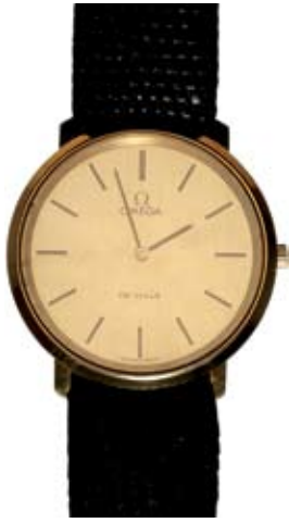
3837* Gentleman's Wrist Watch , Omega de ville Swiss made, gold, leather band. Very fine. $600