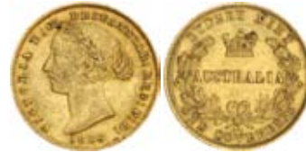
3638* Queen Victoria, second type, 1868. Very fine/good very fine. $750