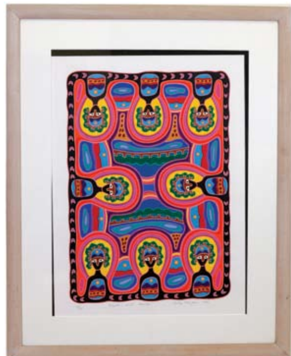
3881* Morgan , Sally, (1951-), colour lithograph, "Hearts and Minds", 1990, #21/95, depicting eight figures in an abstract landscape, framed, (94cm x 75cm). Very fine.