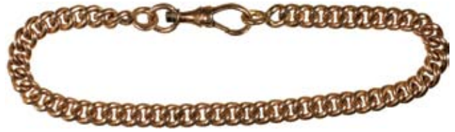
3791* Gold chain , Albert style, link stamped 56 (19.26g) (200mm long, 5mm wide). Fine.