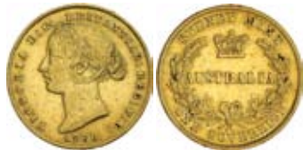
3635* Queen Victoria, second type, 1866. A little polished, otherwise nearly very fine. $600

Ex Noble Numismatics Sale 93 (lot 1691).