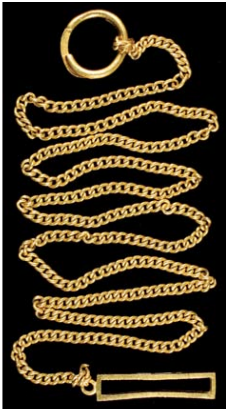
3793* China , long fine link gold chain with handcrafted ring set one end and large belt loop stamped in Chinese characters at the other (65g), probably 24 carat or nearly. Very fine. $3,500