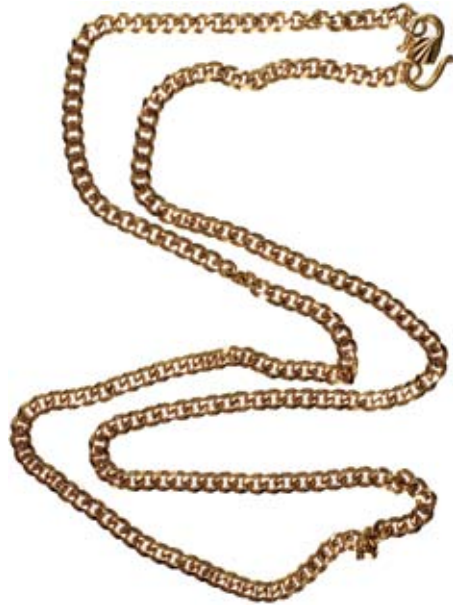
3792* Gold chain , fine chain, link stamped KS (440mm long, 2mm wide, 13.55g). Very fine.