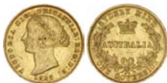
3637* Queen Victoria, second type, 1867. Very fine. $750