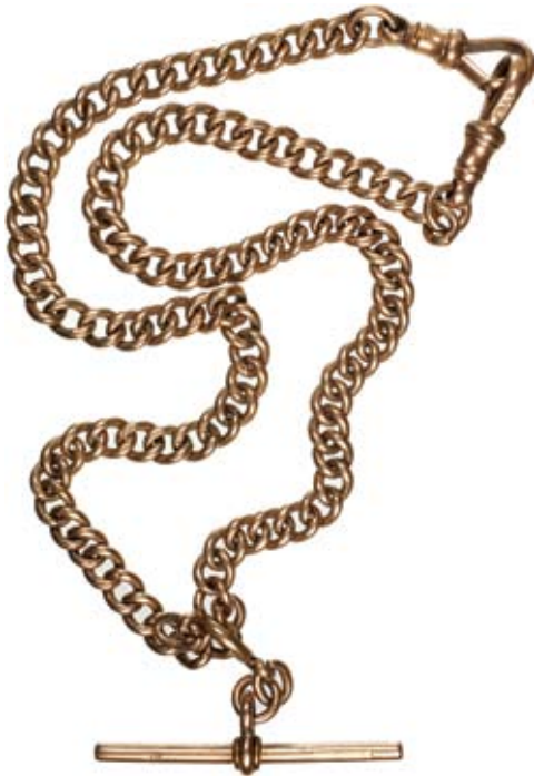
3790* Albert fob chain , in 9 carat gold by A.C. & Co. (Angus & Coote) c1910 (27.77g), all links and clips stamped 9ct. Nearly very fine.