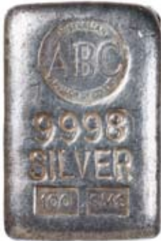
3789* Silver , cast bar, ABC, .999 fine, 100g. Very fine.