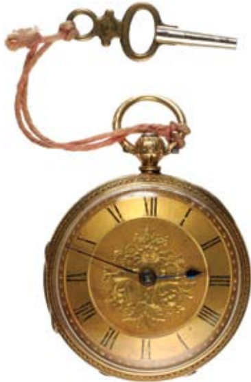
3834* Gold Open Face Pocket Watch , British manufacture in 18ct gold (total wt 53.33g), key wind, elaborately decorated machine turned case, gold dial with central floral design and with black Roman numerals and black hands, case hallmarked Chester, 1875, maker HB, possibly Henry Bamford, key attached. Good very fine.