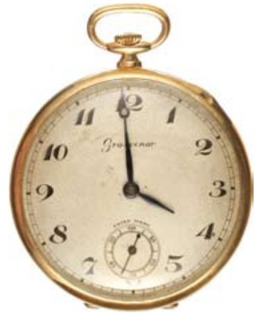
3835* Gentleman's Slim Pocket Watch , 1932, in gold (9ct; tot wt 49.18g), by Grosvenor, gold case by C&C Ld (Carley & Clemence Ltd), hallmarked Birmingham, 1932, white face, with black Arabic numerals, black hands and subsidiary seconds dial with Arabic numerals and black hand, manual wind. Very fine, not tested for accuracy.