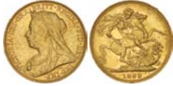
3687* Queen Victoria, 1899 Perth. Good very fine.