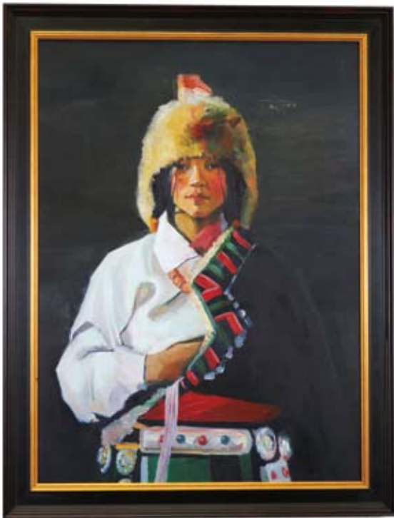
3879* Tibet , artist unknown, 21st century, oil on canvas, "Tibetan boy in festive outfit", framed, (71cm x 51cm) (81cm x 62cm in frame). Very fine.