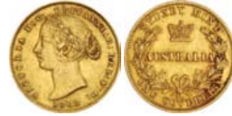
3639* Queen Victoria, second type, 1868. Very fine. $700