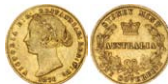
3643* Queen Victoria, second type, 1870. Nearly very fine/very fine. $650

Ex Spink Australia Sale 30 (lot 1936) and Noble Numismatics Sale 93 (lot 1715).