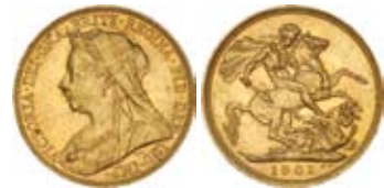
3690* Queen Victoria, 1900 and 1901 Perth. Good very fine; extremely fine/good extremely fine. (2)