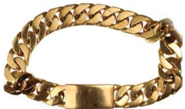
3796* Gold bracelet , not stamped, appears to be Asian make (180mm long, 10mm wide) (66.50g). Extremely fine.