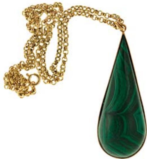
3795* Ladies necklace , Malachite crystal, teardrop shape (55x23mm) in a 9 carat surround mount with a chain stamped .417 Italy (10 carat), total weight 23.43g. Very fine.