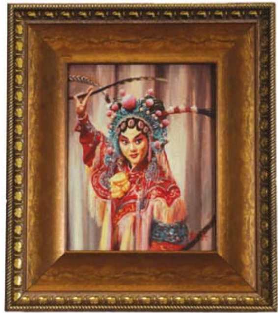
3880* Tibet , unknown artist, 21st century, oil on canvas, "The Dancer", depicting a Tibetan lady in traditional outfit performing a dance, framed, (24cm x 19cm) (39cm x 34cm in frame). Very fine.