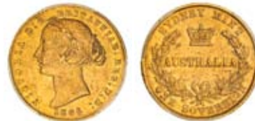
3640* Queen Victoria, second type, 1868. Surface marks, otherwise good very fine. $650