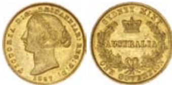
3636* Queen Victoria, second type, 1867. Good very fine. $850