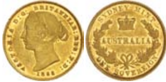
3633* Queen Victoria, second type, 1866. Good extremely fine. $1,200

Ex Stewart McLeod Collection, Noble Numismatics Sale 75 (lot 1408).