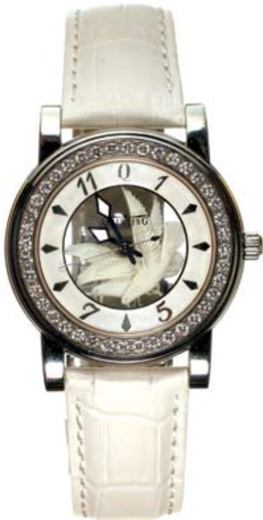
3839* Ladies Diamond Wrist Watch , by Quinting Switzerland, the "Lady Dove", circular stainless steel case with a border of 40 diamonds, (1.2ct total), transparent face with sapphire movement, two white doves that move with the hands, Arabic numerals and silver coloured hands, manual wind, Cyclone compensating movement with 9 parallel transparent sapphire discs, white leather strap, serial number 0640. Extremely fine, unused in original box and packaging. $6,000