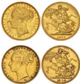
3667* Queen Victoria , 1883 and 1884 Melbourne (McD.163 and 197b). Nearly very fine . (2)