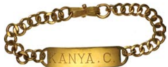
3797* Gold bracelet , with name tag 'KANYA.C.' joining link 23K (14.82g). Extremely fine.