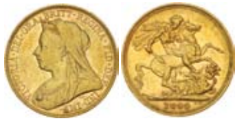
3686* Queen Victoria, 1899 Melbourne. Very fine.