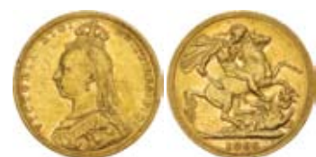
3674* Queen Victoria , 1890 Melbourne. Very fine .