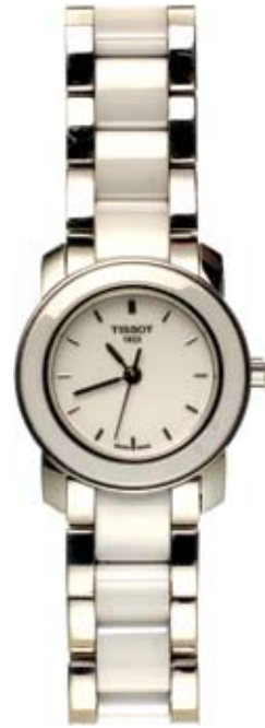
3840* Ladies wrist watch , Tissot, "Cera" white and silver tone ceramic watch, round face, stainless steel case and hands, quartz movement, reflective sapphire dial, serial number T064210 A. Extremely fine in original box. $200