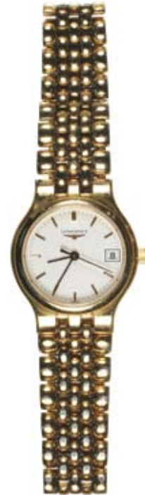
3841* Ladies wristwatch , Longines Les Grandes Classiques quartz model (22mm), in gold plate and stainless steel, white dial with gold indicator bars and hands and a seconds hand, day indicator, with original gold plated and stainless steel bracelet, serial number 27379114. In working order, extremely fine. $200

Together with a spare dial cover and winder.