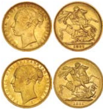
3665* Queen Victoria , 1881 Melbourne (McD.159) and Sydney (McD.160). Good fine . (2)