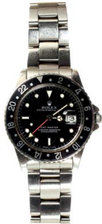
3836* Gentleman's Wristwatch , Rolex GMT Master II, Superlative Chronometer, Officially Certified, c.2007, model 16710, stainless steel case with signed Rolex bracelet, black turning bezel, black dial with sweep seconds hand, date at 3 o'clock. In working order but not checked for accuracy, the crown and bezel are both operational, very fine and rare.