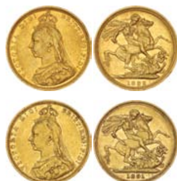
3673* Queen Victoria , 1889 and 1891 Sydney (McD.178a and 182). Very fine . (2)