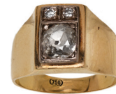
243* Man's dress ring , features round cut diamond, approx. 2ct, with two 6pt diamonds set in 18k yellow gold. Very fine. $1,000