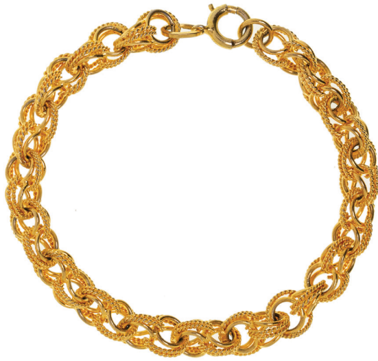
188* Gold bracelet , in 14ct gold, bright links of intertwined circles, (16.08 g weight, 200mm long). Extremely fine .