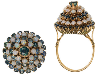
238* Opal and blue stone dress ring , featuring circular layered rings of small blue cut stones and alternating seed size white opals, crowned with a slightly larger blue stone set in galleries of yellow gold (18k, tot wt 6.09g). With case, extremely fine. $300