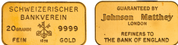
181* Switzerland, Swiss Bank Corporation, 999.9 fine gold ingot, 20g. Uncirculated.