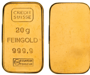
180* Switzerland, Credit Swiss, 999.9 fine gold ingot, 20g. Uncirculated.