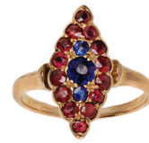
241* Sapphire and ruby dress ring , featuring a central larger sapphire with another smaller sapphire on either side, surrounded by fourteen rubies in a diamond shaped pattern set in rose gold (15k, tot wt 3.65g). Very fine. $120