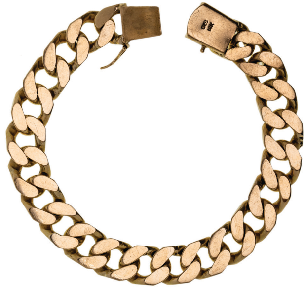
184* Gentleman's gold bracelet chain, 14ct gold, heavy links with secure clasp, (86.31 g weight, 235mm long). Very fine.