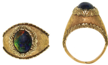
237* Opal and gold dress ring , featuring oval black opal set in two-tone gold setting (18k, tot wt 9.27g). With case very fine. $450