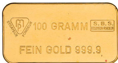
183* Switzerland, Swiss Bank Corporation 999.9 fine gold ingot, 100g. Uncirculated.