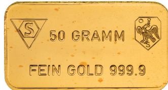
182* Switzerland, Swiss Bank Corporation, 999.9 fine gold ingot, 50g. Uncirculated.