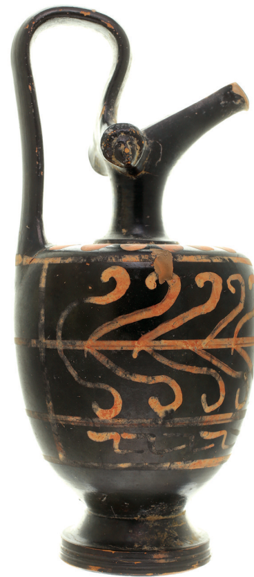
308* Greek South East Italy , Apulia, c.4th century B.C., Xenon ware Prochous, the vessel with long beak, loop handle and slim neck, small female heads moulded at base of spout, the body decorated with olive leaves and tendrils in pale red, (160mm high). Very fine and attractive.