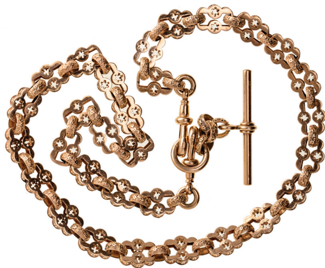
186* Gold fob watch chain, 9ct rose gold, unusual star link chain, fob attached, (54.55 g weight). Extremely fine.