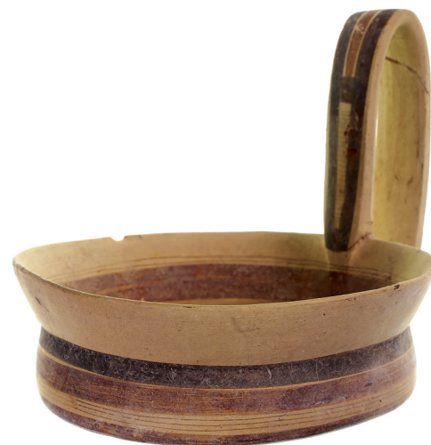
309* Greek Southern Italy , Daunian, c.4th century B.C., pottery kyathos or wine ladle, the wide based bowl decorated with linear black and brown pattern, high handle with similar decoration, the inner bowl decorated with a rake-like pattern in compass form, (130mm high). Very fine and scarce.