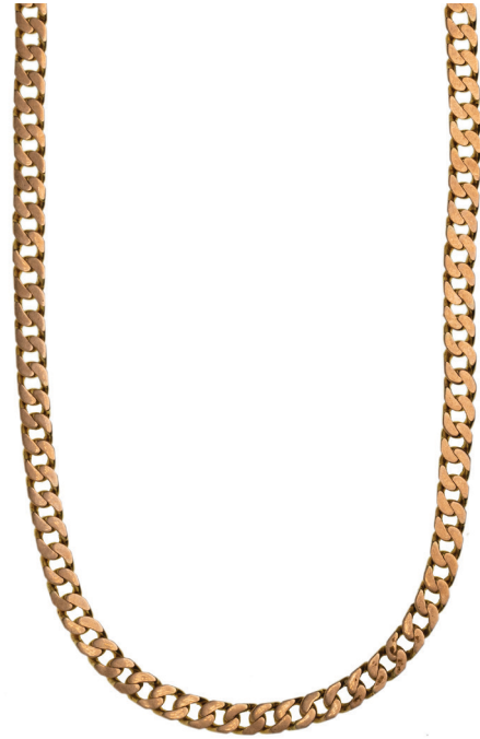
190* Ladies Gold Necklace , in 14ct gold, small S shaped links, (21.92 g weight, 500mm long). Very fine .