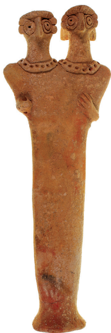
307* Ancient Near East , Syro-Hittite, 2nd millennium B.C., double headed terracotta figure, flat backed with eyes formed as domes with round recesses, the headdress and necklaces separately applied and both with a detailed shoulder and arm and combined into a single body extending to a flattened base, (230mm high). Very fine and complete.