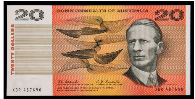
2136* Twenty dollars, Coombs/Randall (1967), XBR 487690 (R.402). Very fine or better. $750