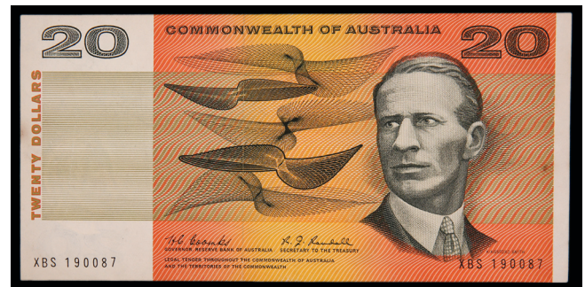
2137* Twenty dollars, Coombs/Randall (1967), XBS 190087 (R.402L), last serial prefix. Nearly very fine. $400