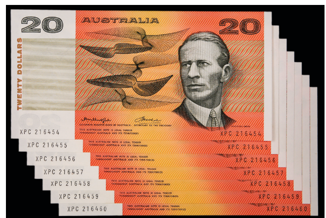
2140* Twenty dollars, Knight/Wheeler (1976), XPC 216454/60 (R.406a), a run of seven consecutive notes. Virtually uncirculated. (7) $500