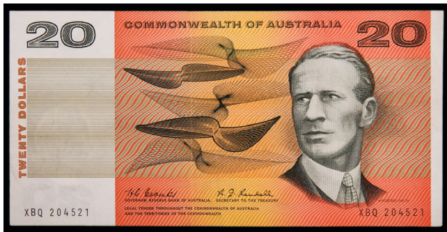
2133* Twenty dollars, Coombs/Randall (1967), XBQ 204521 (R.402F), first serial prefix. Very fine and scarce. $650