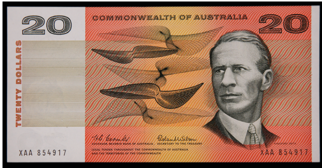
2131* Twenty dollars, Coombs/Wilson (1966), XAA 854917 (R.401F) first serial prefix note. Uncirculated. $300