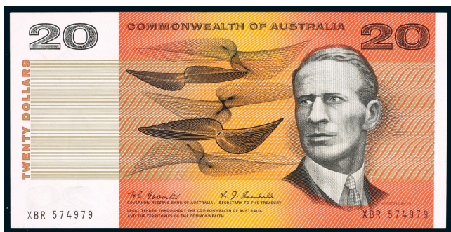
2135* Twenty dollars, Coombs/Randall (1967), XBR 574979 (R.402). Flat, nearly uncirculated and rare, especially in this condition. $2,400