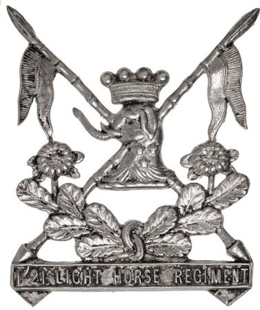
2686* 1/21st Light Horse Regiment (New South Wales Lancers), 1930-42, hat badge in white metal (56mm) (Cossum p5, a). Good very fine.