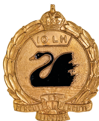
2696* 10th Light Horse Regiment (Western Australian Mounted Infantry), 1930-42, hat badge in gilt brass and enamel (52mm) (Cossum p8, a). Nearly uncirculated.