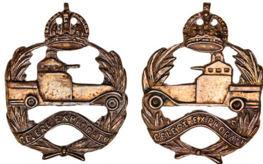
2711* 1st Armoured Car Regiment, 1930-42, first pattern pair of opposing collar badges in brass (30mm) (Cossum p12, b). Very fine. $300