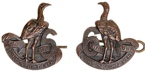
2680* 6th Light Horse AIF, 1912-18, pair of unofficial opposing collar badges in oxidised bronze (29mm) (Cossum 175), some text printed on reverse near lower edge but illegible. Good very fine. $200