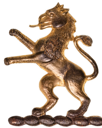
2683* 3rd Infantry Battalion (The Werriwa Regiment), 1921, hat badge in brass (52mm) (Cossum 192). Dark toned areas, otherwise very fine and rare. $500