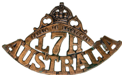
2681* 7th Light Horse A.I.F., 1912-18, unofficial hat badge in oxidised brass (33mm) (Cossum 176). Cleaned, otherwise fine. $100