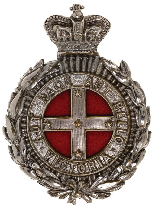
2629* Victorian Volunteer Rifles, 1875, shako plate (single wreath) in white metal (85mm) (Grebert p183), with red velvet backing cloth fitted. Very fine.