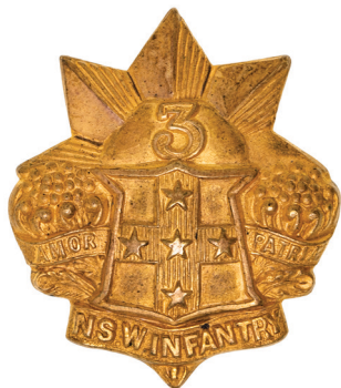
2618* 3rd Regiment NSW Volunteer Infantry, 1890s-1903, slouch hat/field service cap badge in gilt brass (44.5mm) (Grebert p27). Good very fine.