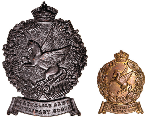
2735* Australia, Army Veterinary Corps, hat badge, 1930-42, in oxidised bronze (52mm) and a collar badge in brass (29mm) (Cossum p33, b). Extremely fine; very fine. (2)