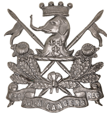
2651* 1st Australian Light Horse Regiment (NSW Lancers), 1900-12, hat badge in white metal (48.5mm) (Cossum 49). Nearly extremely fine. $200