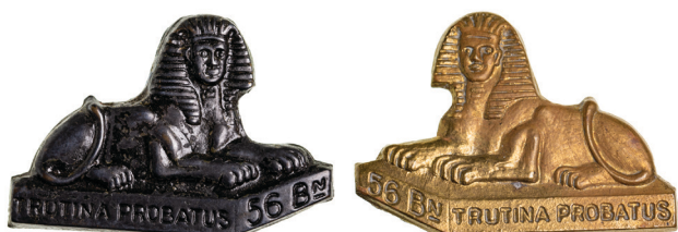
2730* 56th Infantry Battalion (The Riverina Regiment), 1930-42, opposing collar badges (2, one in brass and one oxidised bronze) (27mm) (Cossum p29, a). Good very fine - extremely fine. (2)