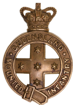
2635* Queensland Mounted Infantry, post 1860, type 2 hat badge in brass (55.5mm) (Grebert p214). Toned good very fine.