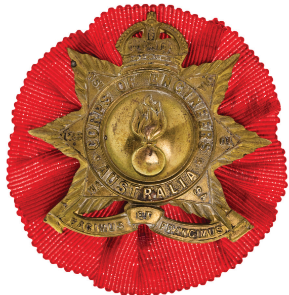
2665* Corps of Engineers , Australia, 1900-12, hat badge in brass (57mm) (Cossum 94). Fitted to a red rosette, good very fine.