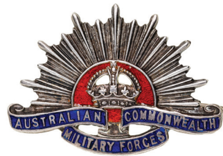
2671* Australia, Administrative and Instructional Corps Rising Sun collar badge, 1903-12, in silver and enamel (28.5mm) (Cossum RS8), by C.T&S, pin-back. Very fine.