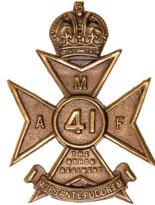
2727* 41st Infantry Battalion (The Byron Regiment), 1930-42, hat badge in brass (50mm) (Cossum p24, d). Good very fine.