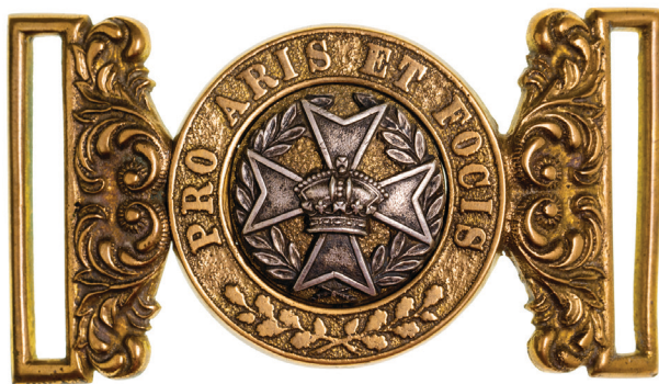
2640* Queensland Defence Force, c1880, officer's waist belt buckle in brass and white metal (not recorded in Grebert), believed to be about 10 known to exist. Very fine and rare.