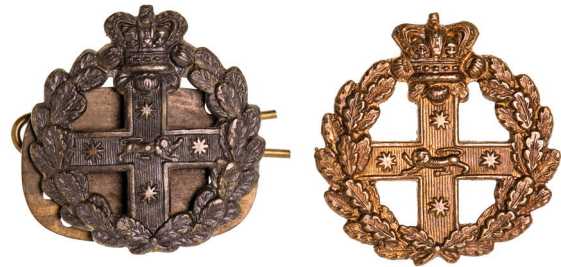
2627* Australia, pre-Federation, New South Wales Mounted Infantry , hat badge (QVC), in brass (32mm) (one lug repaired), and another identical in oxidised brass (32mm), with backing plate. Very fine. (2)