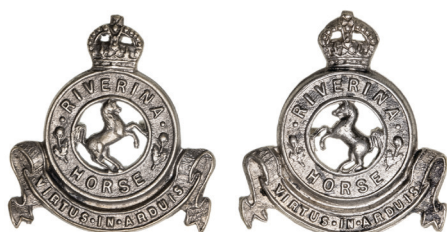
2705* 21st Light Horse Regiment (Riverina Horse), 1930-42, opposing collar badge pair in white metal (one 28.5mm, one 29.5mm) (Cossum p10, d). Very fine. (2)