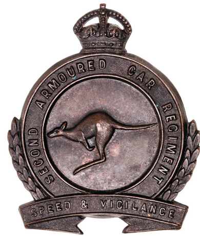
2713* 2nd Armoured Car Regiment, 1930-42, hat badge in oxidised bronze (58mm) (Cossum p12, d), maker's name unclear, appears to be K.G.Luke, Melb(ourne). Nearly extremely fine. $600