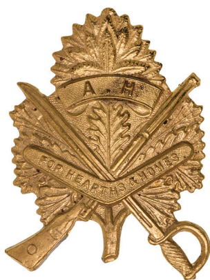
2693* 7th Light Horse Regiment (Australian Horse), 1930-42, hat badge in brass (50mm) (Cossum p7, b). Extremely fine.