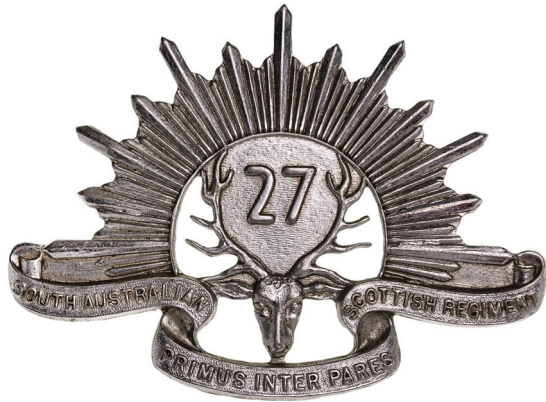
2723* 27th Infantry Battalion (The South Australian Scottish Regiment), 1930-42, hat badge in white metal (51mm) (Cossum p20, c). Nearly extremely fine.