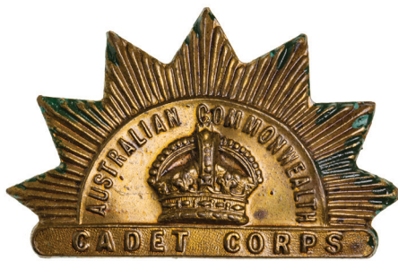
2667* Australian Commonwealth Cadet Corps, 1900-12, hat badge in brass (36mm) (Cossum 102). Some oxidation and lacquered on front, otherwise very fine and scarce.