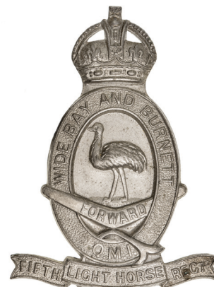
2691* 5th Light Horse Regiment (Wide Bay and Burnett Light Horse), 1930-42, hat badge in white metal (52mm) (Cossum p6, d). Good very fine.