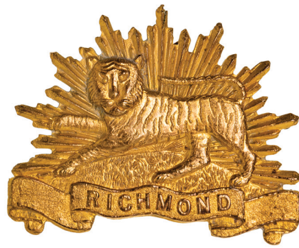
2720* 22nd Infantry Battalion (The Richmond Regiment), 1930-42, hat badge in brass (45mm) (Cossum p18, d). Very fine.