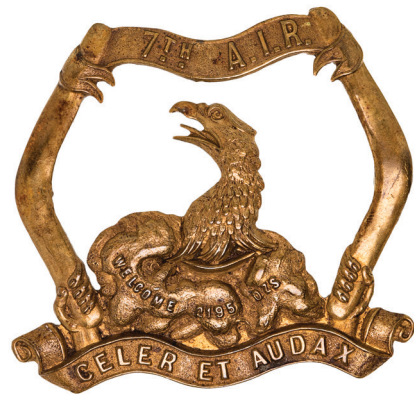
2663* 7th Australian Infantry Regiment , Victoria, 1900-12, hat badge in brass (47mm) (Cossum 80). Very fine.