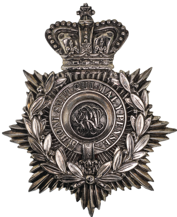
2643* Geraldton Rifle Volunteers , formed 1878, helmet plate in white metal (132mm) (Grebert p267). Good very fine. $1,200

This badge also worn by Bunbury Rifle Volunteers (formed 1892) and Guildford Rifle Volunteers (formed 1874).