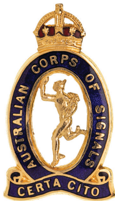
2736* Australian Corps of Signals, 1930-42, officer's hat badge in brass and enamel (53mm) (Cossum p35, c). Nearly uncirculated.