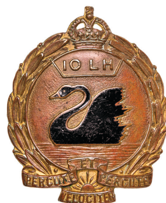
2697* 10th Light Horse Regiment (Western Australian Mounted Infantry), 1930-42, hat badge in gilt brass and enamel (52mm) (Cossum p8, a), by S.S.&Co.Ltd, Adelaide. Most gilt missing on front, otherwise good fine.