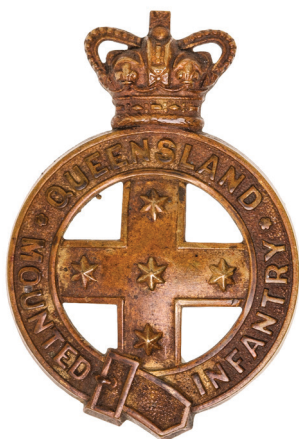
2634* Queensland Mounted Infantry, post 1860, type 2 hat badge in brass (55.5mm) (Grebert p214). Very fine.