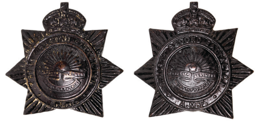
2726* Australia, 32nd Infantry Battalion (The Footscray Regiment), pair of collar badges, 1930-42, in oxidised bronze (30mm) (Cossum p22, a). Very fine. (2)