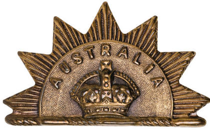
2647* Australian Commonwealth Horse, 1900-12, first pattern hat badge in brass (32mm) (Cossum 1). Very fine. $1,200