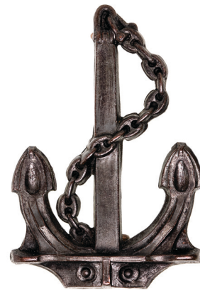
2677* Naval Bridging Train , 1912-18, hat badge in oxidised bronze (52mm) (Cossum 161), with maker's name but difficult to read. Nearly extremely fine and very scarce.