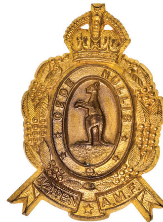
2741* Australia, 42nd Infantry Battalion (The Capricornia Regiment), hat badge, 1948-53, in brass (56mm) (Cossum 316). Good very fine.