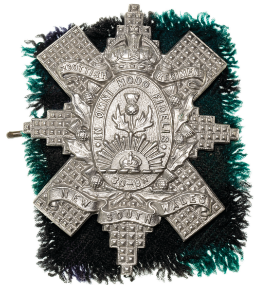
2740* New South Wales Scottish Regiment, 30th Infantry Battalion, 1948-53, hat badge in white metal (74mm) (Cossum 313). Mounted on a piece of Black Watch tartan, extremely fine.