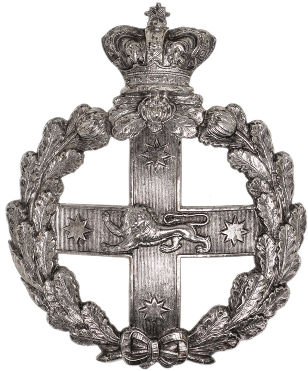
2626* NSW Military Forces, c1885 , helmet plate in white metal (103mm) (Grebert p78). Toned extremely fine.