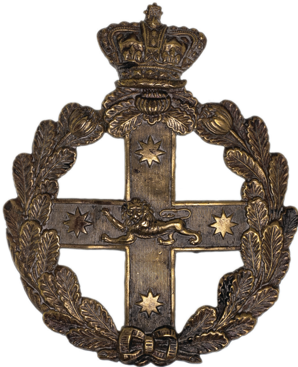
2625* NSW Military Forces, c1885 , helmet plate in brass (103mm) (Grebert p78). Cleaned, nearly very fine.