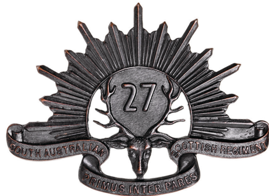
2722* 27th Infantry Battalion (The South Australian Scottish Regiment), 1930-42, hat badge in oxidised bronze (51mm) (Cossum p20, c). Extremely fine.