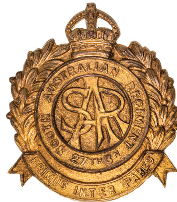
2721* 27th Infantry Battalion (The South Australian Regiment), 1930-42, hat badge in brass (51mm) (Cossum p20, b). Very fine.