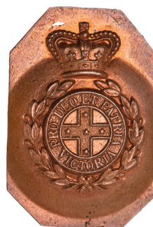
2632* Australia, sample strike on small copper sheet (28x41mm and the badge strike is 22x32mm) of the design used for the Victorian Military Forces hat badge (QVC) (Grebert p188-9), the same design also used for Bendigo and Castlemaine Infantry Regiment (Grebert p176). Extremely fine.