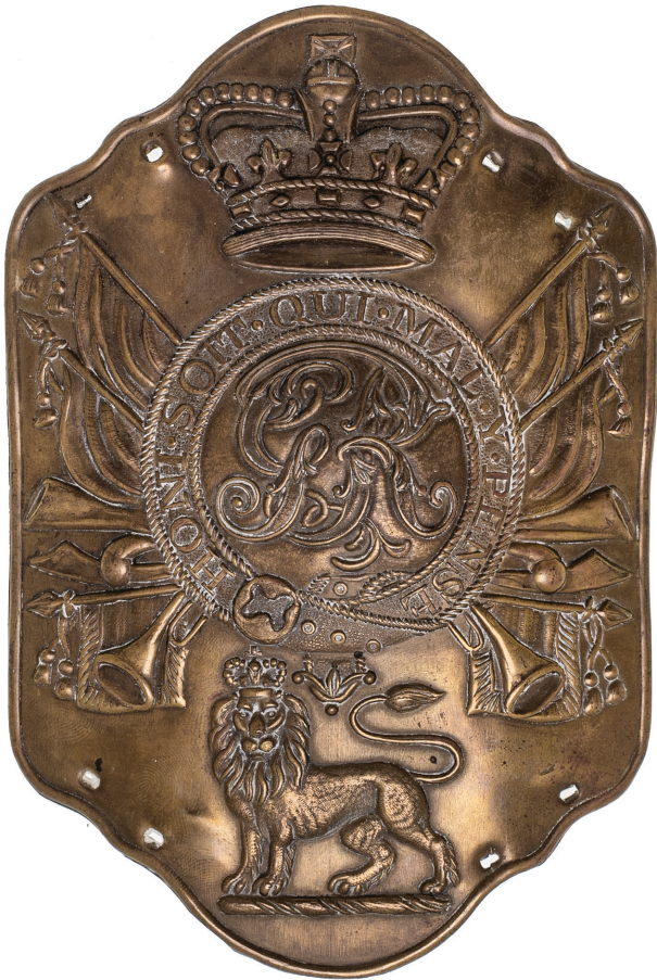
2613* New South Wales, British Universal Pattern Shako Plate in brass (153mm) as worn by Loyal Associate Corps, 1800-01, and Loyal Associations, 1802-10, also worn by NSW Corps (Grebert p3). Two holes at each corner for wearing, otherwise very fine.