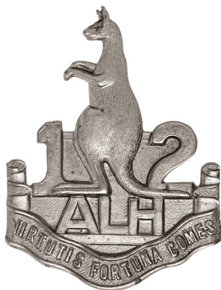
2700* 12th Light Horse Regiment (New England Light Horse), 1930-42, hat badge in white metal (51mm) (Cossum p8, c). Extremely fine.