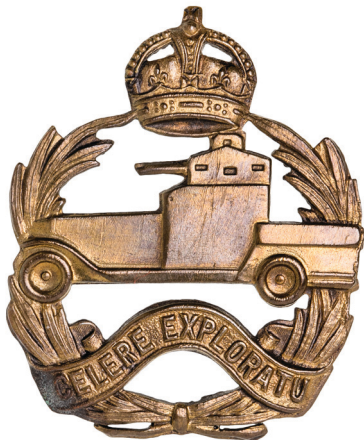
2712* 1st Armoured Car Regiment, 1930-42, second pattern hat badge in brass (56mm) (Cossum p12, c). Good very fine and rare. $750