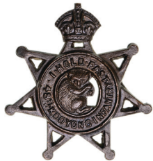
2674* 48th (Kooyong) Infantry , Victoria, 1912-18, collar badge in bronze (29mm) (Cossum 129). Extremely fine.