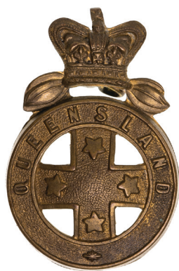
2633* Queensland Mounted Infantry, c1860-90, type 1 hat badge in brass (53mm) (Grebert p212). Good very fine.