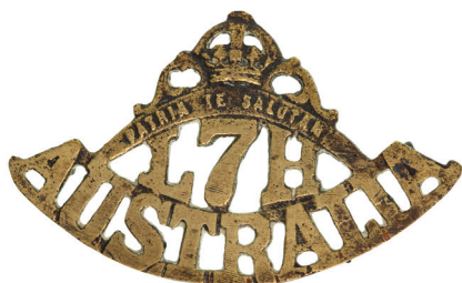
2682* 7th Light Horse A.I.F., 1912-18, unofficial hat badge in cast oxidised brass (32mm) (Cossum 176). Fine. $130