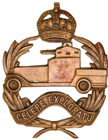
2710* 1st Armoured Car Regiment, 1930-42, first pattern hat badge in brass (59mm) (Cossum p12, b). Very fine and rare. $750