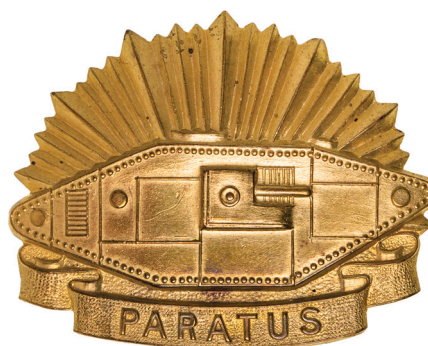
2734* Australian Tank Corps, 1930-42, hat badge in brass (44mm) (Cossum p32, a). Extremely fine and rare.