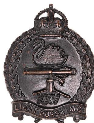
2709* 25th Light Horse Regiment (Light Horse Machine Gun Regiment), 1930-42, hat badge in oxidised bronze (50mm) (Cossum p11, d), by K.G.Luke, Melb(ourne). Extremely fine.