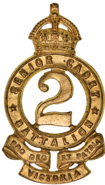
2668* 2nd Senior Cadet Battalion, Victoria, 1907, hat badge in brass (48mm) (Cossum 105). Extremely fine.