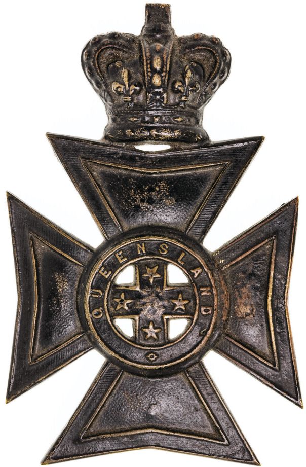
2641* Queensland Military Forces, pre-Federation, horse pack plate or martingale cast in darkened brass (115mm) (not recorded in Grebert but on Digger History website). Good fine.