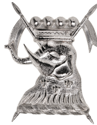
2702* 16th Light Horse Regiment (Hunter River Lancers), 1930- 42, hat badge in white metal (51mm) (Cossum p9, c). Uncirculated.