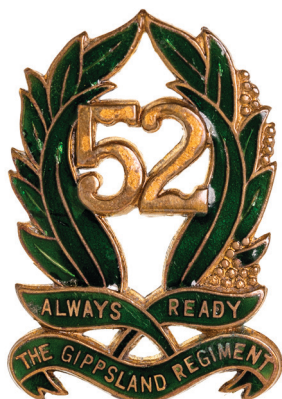
2729* 52nd Infantry Battalion (The Gippsland Regiment), 1930-42, hat badge in brass and enamel (51mm) (Cossum p27, d). Good very fine and rare.