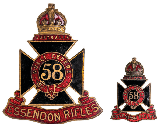
2731* Australia, 58th Infantry Battalion (The Essendon Rifles), hat badge, 1930-42, in brass and enamel (52mm), and a collar badge in brass and enamel (27.5mm) (Cossum p29, c). Very fine. (2)