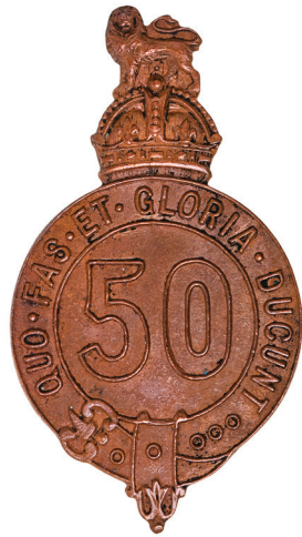
2675* 50th (St. Kilda) Infantry , Victoria, 1912-18, hat badge in copper (61mm) (Cossum 131), by P.J.King, Melb(ourne). Good very fine.