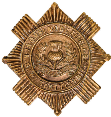
2724* 30th Infantry Battalion (The NSW Scottish Rifles), 1930-42, hat badge in brass (50mm) (Cossum p21, b). Good very fine and rare.