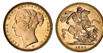
1985* Queen Victoria, 1885 Melbourne. Nearly uncirculated. $750