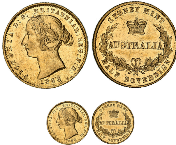
1922* Queen Victoria, second type, 1863. Nearly uncirculated and rare in this condition.