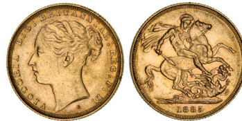
1986* Queen Victoria, 1885 Sydney. Good very fine. $650