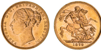
1973* Queen Victoria, 1879 Melbourne (McD.157). Uncirculated. $640