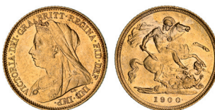
2077* Queen Victoria, 1900 Sydney. Extremely fine.