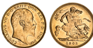
2078* Edward VII, 1902 Sydney. Uncirculated.