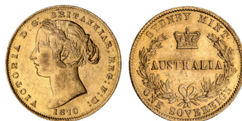
1911* Queen Victoria, second type, 1870. Nearly uncirculated.