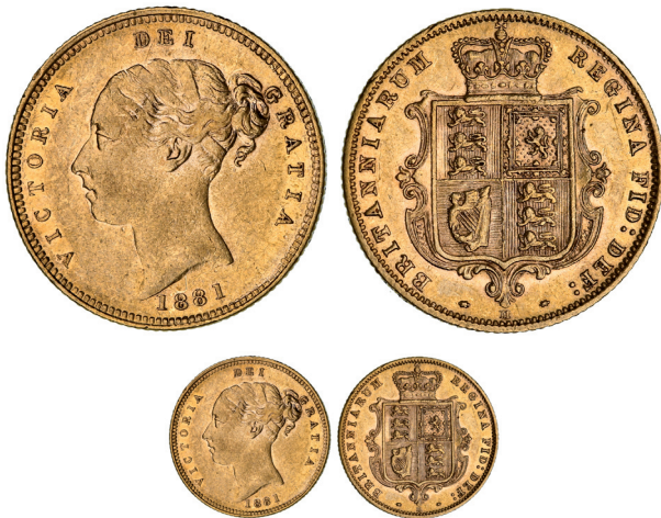
2048* Queen Victoria, 1881 Melbourne. Extremely fine/good extremely fine and rare. $6,000