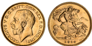
2093* George V, 1911, 1912, 1914, 1915 and 1916 Sydney. Nearly uncirculated - uncirculated. (5)

Ex David Ross Collection, from Spink Australia Sale 18 (lot 1210).