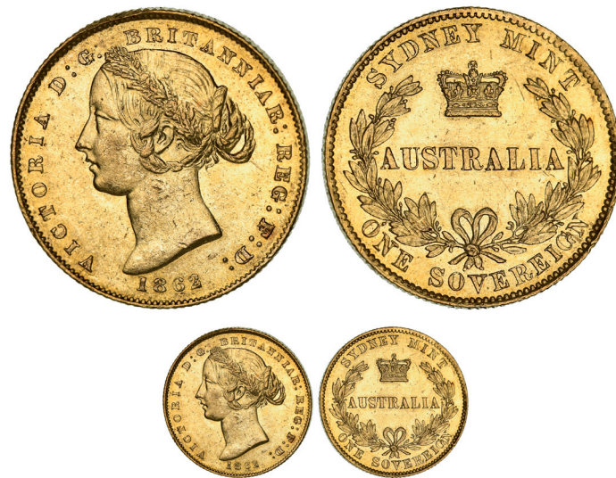
1899* Queen Victoria, second type, 1862. Nearly uncirculated.

Ex David Ross Collection from Spink Australia Sale 27 (lot 1443).