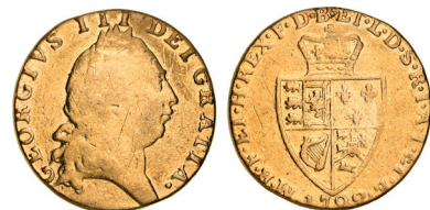
1866* Great Britain, George III, guinea, fifth bust or spade type, 1792 (S.3729). Very good/fine.