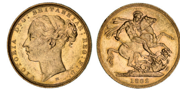
1979* Queen Victoria, 1882 Melbourne (McD.163). Extremely fine. $650