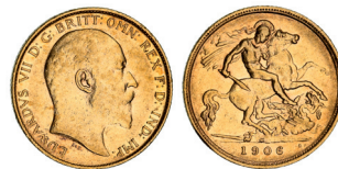
2082* Edward VII, 1906 Melbourne. Good very fine and scarce thus.