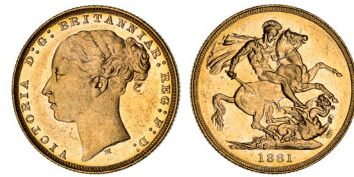
1977* Queen Victoria, 1881 Melbourne (McD.161a). Nearly uncirculated. $650

Ex Noble Numismatics Sale 77 (lot 1342).