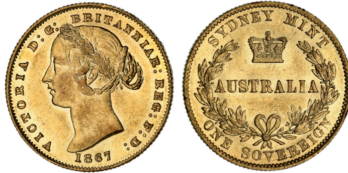
1907* Queen Victoria, second type, 1867. Virtually uncirculated.