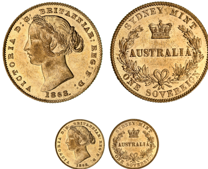
1908* Queen Victoria, second type, 1868. Considerable original mint bloom, uncirculated.

Ex David Ross Collection from Spink Australia Sale 19 (lot 2490).