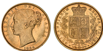
1947* Queen Victoria, 1884 Melbourne. Good extremely fine.