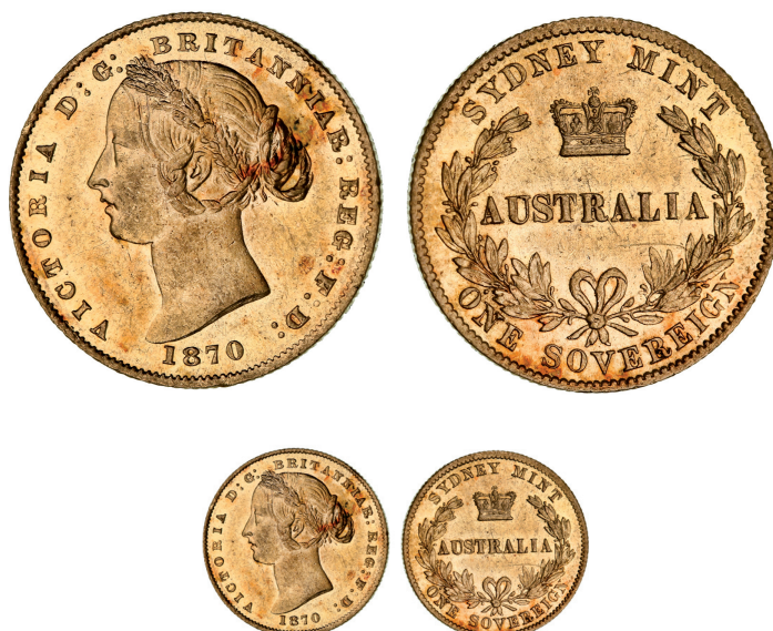
1910* Queen Victoria, second type, 1870. Considerable mirror-like mint bloom, well struck uncirculated and rare thus.