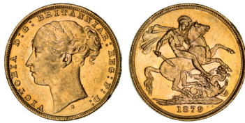
1974* Queen Victoria, 1879 Sydney. Nearly extremely fine and scarce. $800