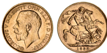
2033* George V, 1928 Melbourne. Nearly uncirculated and rare. $3,500