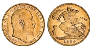
2081* Edward VII, 1904 Perth. Good very fine and scarce in this condition.