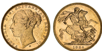
1983* Queen Victoria, 1884 Melbourne (McD.167a). Good extremely fine.