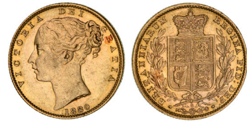
1939* Queen Victoria, 1880 Sydney. Extremely fine.

Ex Noble Numismatics Sale 77 (lot 1327).