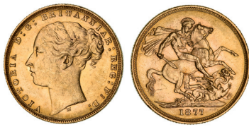
1970* Queen Victoria, 1877 Melbourne. Good extremely fine. $650