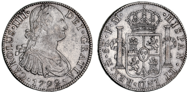
1875* Mexico , Charles III, silver eight reales, 1792 FM, Mexico City Mint (KM.109). Good very fine.