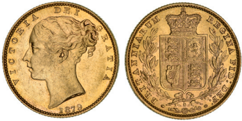
1937* Queen Victoria, 1879 Sydney. Extremely fine.