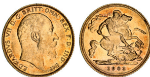
2079* Edward VII, 1903 Sydney. Nearly uncirculated.

Ex David Ross Collection from Spink Australia Sale 28 (lot 1184).