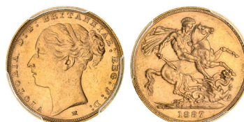
1989* Queen Victoria, young head, 1887 Melbourne. Subdued bloom, nearly uncirculated. $700