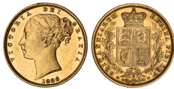
1952* Queen Victoria, 1886 Sydney. Good extremely fine. $900