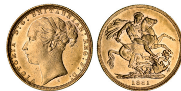
1978* Queen Victoria, 1881 Sydney (McD.160a). Good extremely fine. $650