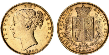
1946* Queen Victoria, 1884 Melbourne. Nearly uncirculated.