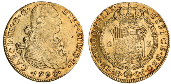
1878* Peru , Charles III, gold eight escudos, 1796I.J. (Lima Mint) (KM.101). Very fine/good very fine.