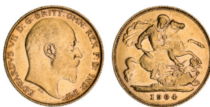
2080* Edward VII, 1904 Perth. Nearly extremely fine and scarce.