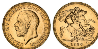
2037* George V, small head, 1930 Melbourne. Uncirculated and scarce. $900