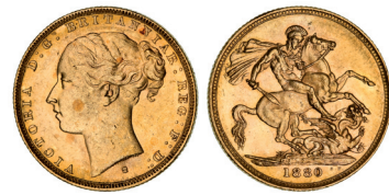
1976* Queen Victoria, 1880 Sydney. Extremely fine. $650