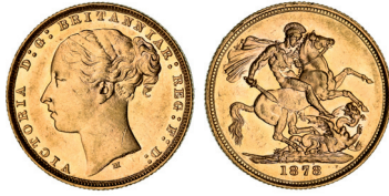
1971* Queen Victoria, 1878 Melbourne. Nearly uncirculated. $700