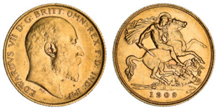
2090* Edward VII, 1909 Perth. Good extremely fine and scarce thus.