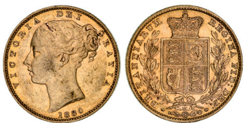
1938* Queen Victoria, 1880 Melbourne. Light tone, extremely fine and rare.