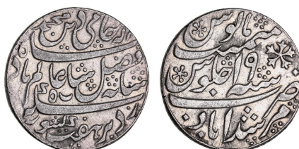
1873* India, British, Bengal Presidency, EIC, Murshidabad type rupee (1793), oblique milled edge (KM.99.4). Good very fine.