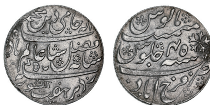
1872* India, Bengal Presidency, EIC, silver rupee (1793) (KM.99). Nearly extremely fine.

Ex Noble Numismatics Sale 77 (lot 1264).