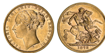
1957* Queen Victoria, 1872 Melbourne. Very fine and scarce. $650