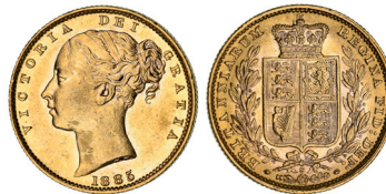
1950* Queen Victoria, 1885 Sydney. Nearly uncirculated.