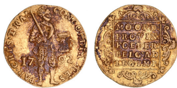
1877* Netherlands , Utrecht, gold ducat, 1792 (KM.7.4). Some adhesions, otherwise good very fine.