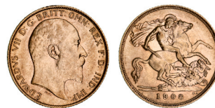
2087* Edward VII, 1908 Perth. Nearly extremely fine and scarce in this condition.