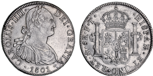
1876* Mexico , Charles III, silver eight reales, 1801F.T. Mexico City Mint (KM.109). Good very fine.