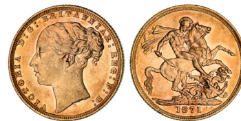
1956* Queen Victoria, 1871 Sydney, small BP (McD.143a). Good very fine/ extremely fine.