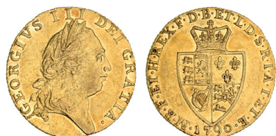
1865* Great Britain, George III, guinea, fifth bust or spade type, 1790 (S.3729). Nearly very fine.