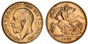
2092* George V, 1911 Perth. Nearly extremely fine.