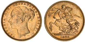
1961* Queen Victoria, 1874 Melbourne. Good extremely fine.

Ex David Ross Collection, from Noble Numismatics Sale 27 (lot 46).