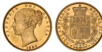
1949* Queen Victoria, 1885 Melbourne. Good extremely fine.

Ex David Ross Collection, from Spink Australia Sale 18 (lot 1128).