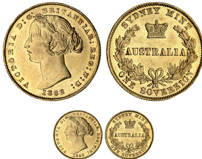
1900* Queen Victoria, second type, 1862. Edge filed in two places, otherwise nearly uncirculated and rare.