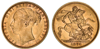
1963* Queen Victoria, 1874 Sydney. Nearly extremely fine.