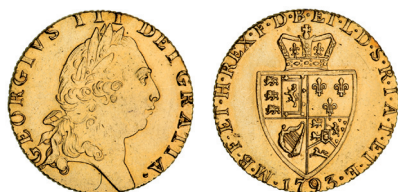
1864* Great Britain, George III, guinea, fifth bust or spade type, 1793 (S.3729). Extremely fine.