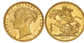
1955* Queen Victoria, 1871 Sydney, small BP (McD.143a). Rubbed and cleaned, otherwise nearly extremely fine/good extremely fine.