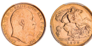
2086* Edward VII, 1908 Melbourne. Nearly uncirculated.