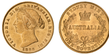
1906* Queen Victoria, second type, 1866. Nearly uncirculated.