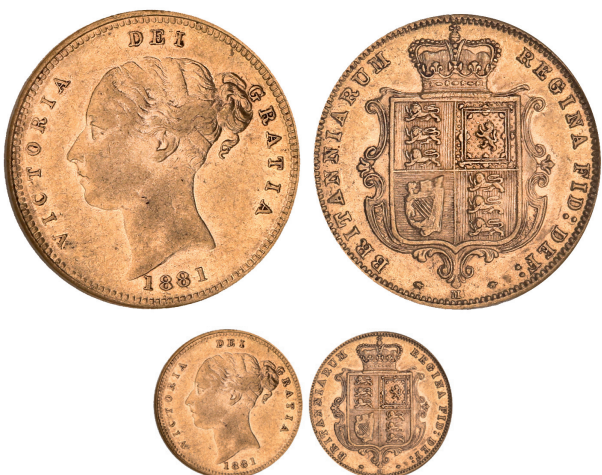
2049* Queen Victoria, 1881 Melbourne. Extremely fine/good extremely fine. $4,000

Ex David Ross Collection from Noble Numismatics Sale 31 (lot 1495), earlier from the 1978 Ballarat find.