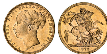
1958* Queen Victoria, 1872 Sydney. Good extremely fine. $700