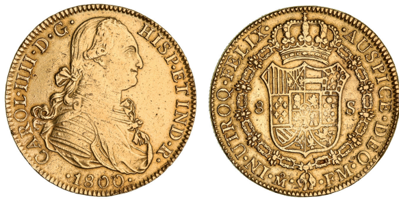
1874* Mexico , Charles IV, eight escudos, 1800FM, Mexico City Mint (KM.159). Good very fine.