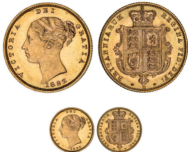
2051* Queen Victoria, 1882 Melbourne (McD.24). Choice uncirculated and rare in this condition. $5,000

Ex David Ross Collection from Noble Numismatics Sale 31 (lot 1495), earlier from the 1978 Ballarat find.