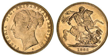
1980* Queen Victoria, 1882 Sydney (McD.162a). Extremely fine.