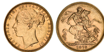
1959* Queen Victoria, 1873 Melbourne. Extremely fine. $700