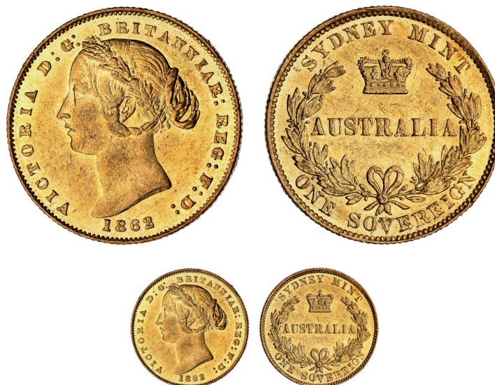
1901* Queen Victoria, second type, 1862. Original frosty mint bloom, good extremely fine and rare.