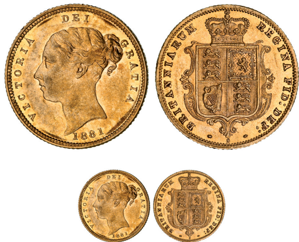
2050* Queen Victoria, 1881 Sydney. Good extremely fine. $3,500