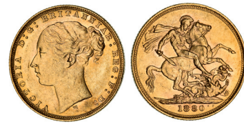
1975* Queen Victoria, 1880 Melbourne (McD.159a). Extremely fine. $700