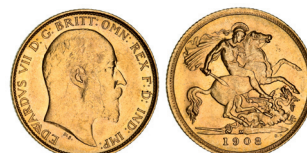
2085* Edward VII, 1908 Melbourne. Uncirculated.