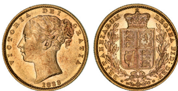
1945* Queen Victoria, 1883 Sydney. Good extremely fine.