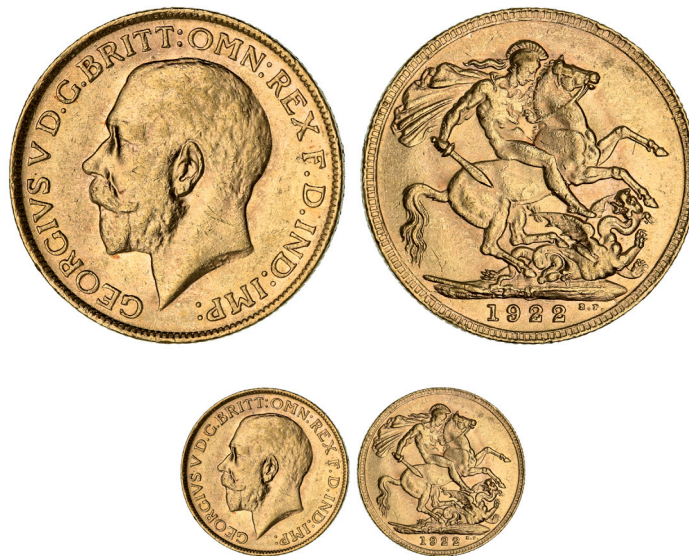
2017* George V, 1922 Melbourne. Nearly uncirculated and extremely rare, one of the finest known.