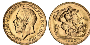
2036* George V, small head, 1929, 1930 and 1931 Perth. Nearly uncirculated. (3)