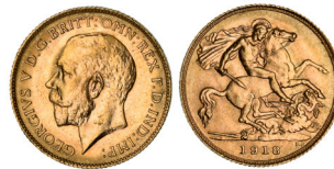
2097* George V, 1918 Perth. Scuff marks on neck, otherwise well struck for this, uncirculated and very rare.