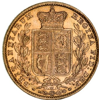
1942* Queen Victoria, 1882 Melbourne. Good extremely fine.