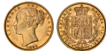
1943* Queen Victoria, 1882 Sydney. Extremely fine.