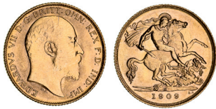
2088 Edward VII, 1909 Melbourne. Uncirculated.