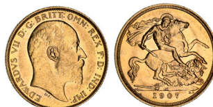
2084* Edward VII, 1907 Melbourne. Obverse vertical die break, nearly uncirculated.