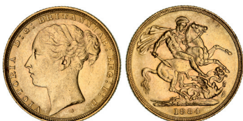
1984* Queen Victoria, 1884 Sydney. Nearly extremely fine/ extremely fine.