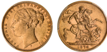
1962* Queen Victoria, 1874 Sydney. Surface marks, otherwise extremely fine.