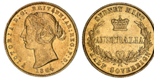
1923* Queen Victoria, second type, 1864. Die break rim through 4 to neck, nearly extremely fine.