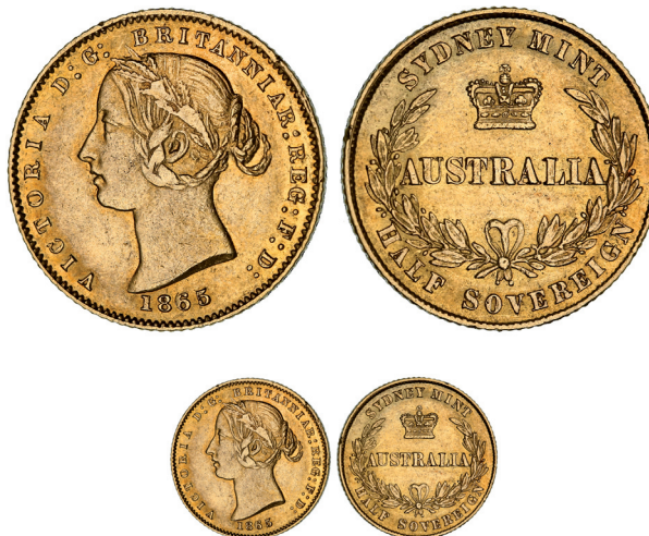
1924* Queen Victoria, second type, 1865. Extremely fine and rare in this condition.