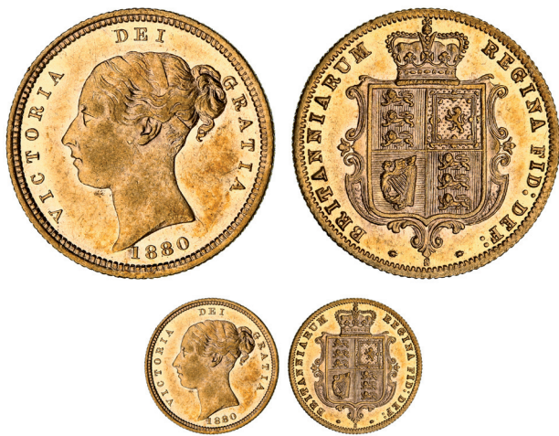
2047* Queen Victoria, 1880 Sydney. Mirror-like fields, nearly uncirculated and rare thus. $2,500

Ex David Ross Collection from KJC March 2000.