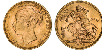
1966* Queen Victoria, 1875 Sydney. Good extremely fine.