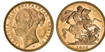
1987* Queen Victoria, 1886 Melbourne. Extremely fine. $650

Ex David Ross Collection, from KJC September 2004.