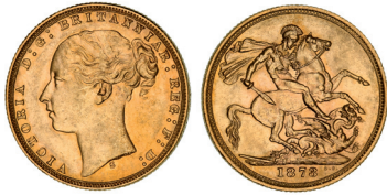
1960* Queen Victoria, 1873 Sydney. Lightly toned extremely fine.