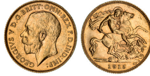
2095* George V, 1915 Perth. Good extremely fine.