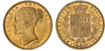
1940* Queen Victoria, 1881 Melbourne. Toned good extremely fine and scarce.

Ex David Ross Collection, from Spink Australia Sale 20 (lot 794).