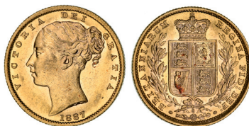
1954* Queen Victoria, 1887 Sydney. Good extremely fine. $900