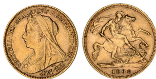
2076* Queen Victoria, 1900 Perth. Very fine.