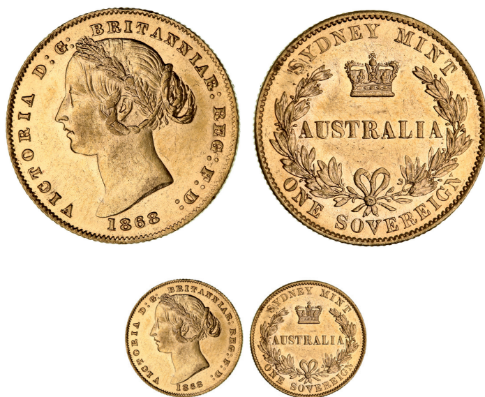
1909* Queen Victoria, second type, 1868. Semi-mirror-like fields, uncirculated.