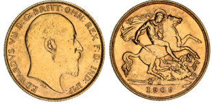
2089* Edward VII, 1909 Melbourne. Good extremely fine.