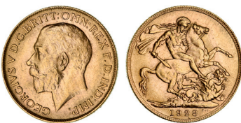
2034* George V, 1928 Perth. Nearly uncirculated. $600

Ex David Ross Collection, from Noble Numismatics Jan 1996, Spink Australia April 1986 and November 1985.