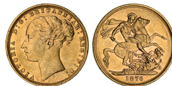
1969* Queen Victoria, 1876 Sydney. Nearly extremely fine/ extremely fine.

Ex Noble Numismatics Sale 77 (lot 1337).