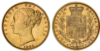
1944* Queen Victoria, 1883 Melbourne. Nearly uncirculated and very scarce.