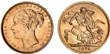
1964* Queen Victoria, 1875 Melbourne (McD.151a). Uncirculated and scarce in this condition.