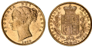
1936* Queen Victoria, 1879 Sydney. Nearly uncirculated.