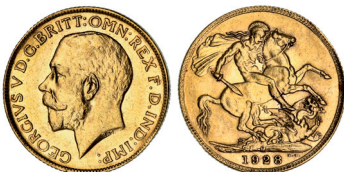
2032* George V, 1928 Melbourne. Nearly uncirculated and rare. $4,000