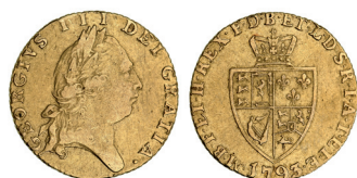
1867* Great Britain, George III, fifth bust or spade type, 1793 (S.3735). Good fine.