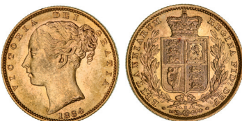
1948* Queen Victoria, 1884 Sydney. Extremely fine.