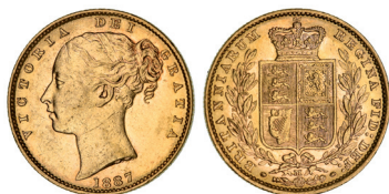
1953* Queen Victoria, 1887 Melbourne. Nearly extremely fine/ extremely fine and rare. $3,500