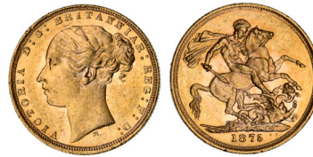
1965* Queen Victoria, 1875 Melbourne. Nearly uncirculated.