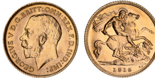
2096* George V, 1915 Sydney. Choice uncirculated.