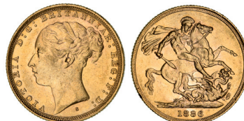
1988* Queen Victoria, 1886 Sydney. Nearly uncirculated. $700