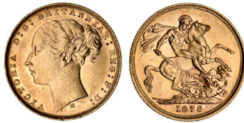
1972* Queen Victoria, 1878 Melbourne. Nearly uncirculated. $800