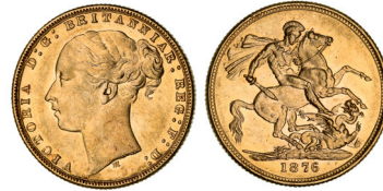
1967* Queen Victoria, 1876 Melbourne. Good extremely fine.