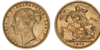
1968* Queen Victoria, 1876 Sydney. Nearly extremely fine.