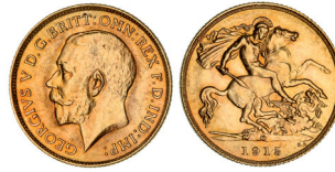
2094* George V, 1915 Melbourne. Nearly uncirculated.