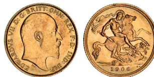
2083* Edward VII, 1906 Sydney. Uncirculated.