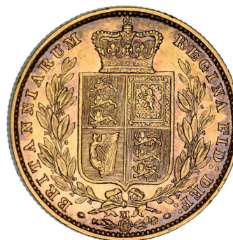
1951* Queen Victoria, 1886 Melbourne. Attractive tone, extremely fine or better and very rare.