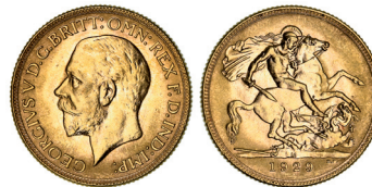
2035* George V, small head, 1929 Melbourne. Uncirculated and rare, especially in this condition. $4,000