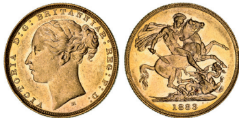
1981* Queen Victoria, 1883 Melbourne (McD.165a). Uncirculated.