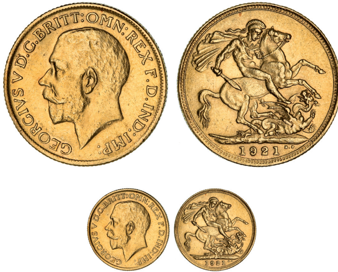
2016* George V, 1921 Sydney. Extremely fine or better and rare.