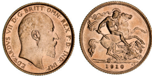
2091* Edward VII, 1910 Sydney. Nearly uncirculated.