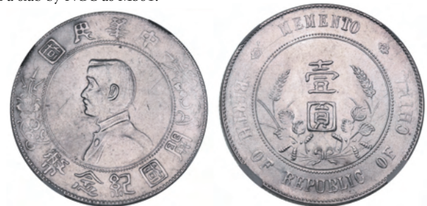
2191* China, Republic, Sun Yat Sen dollar, (1927) memento, six pointed star (L&M 49; KM.Y318a.1). Nearly uncirculated.