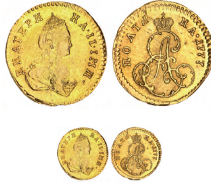
2026* Russia, Catherine II, fifty kopek, 1777 (KM.C.75). Extremely fine.