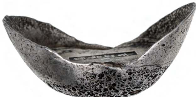
2156* China, Qing Dynasty (1644-1912), silver boat shaped sycee ingot (815 g) (c1880-1911); another, (210 g). Nearly very fine. (2)