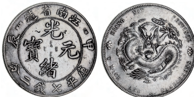
2167* China, Provincial, Kiang Nan, dollar (1904) with HAH and CH in legend, (KM.145a.12). Fine/very fine, with chopmarks.

In a slab by PCGS as graffiti very fine detail.