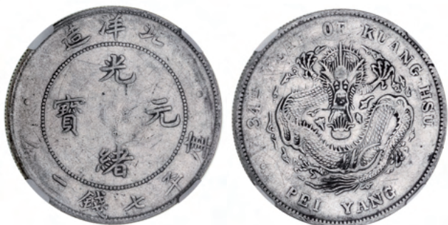
2164* China, Empire, Chihli, silver dollar, Yr 34 (KM.Y.73.2, L&M465). Very fine.