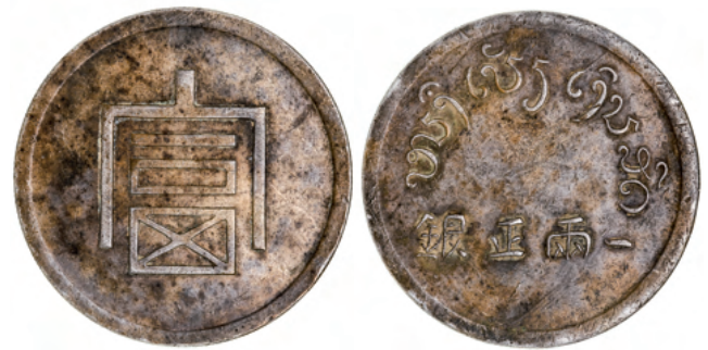
2205* China, Republic, Yunnan Province, silver tael (36.85g), obv Fu in Hanzi characters, new legends Burmese and Hanzi characters, straight grained (or milled) edge (Kann 940). Grey brown tone, very fine.