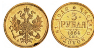
2035* Russia, Alexander III, three roubles, 1884 (KM.Y.26). Good extremely fine.