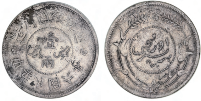
2200* China, Republic, Sinkiang, silver dollar (1917) (KM.Y45) with rosette. Adhesions, nearly extremely fine.