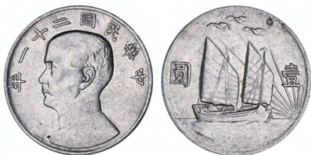
2194* China, Republic, Sun Yat Sen, silver dollar, year 21 (1932), Shanghai mint, 'Birds over junk' (KM Y.344). Some subdued original mint bloom, minimal circulation resulting in hardly noticeable contact marks on shoulder, nearly uncirculated and rare in this condition.