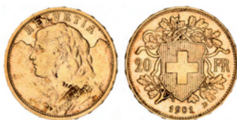
2069* Switzerland, twenty francs, 1901B (KM.35.1). Some red rouge adhesion, otherwise extremely fine.