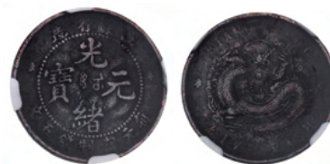
2169* China, Empire, Kiangsoo Province, bronze five cents (1901)(KM.Y.158). Fine.