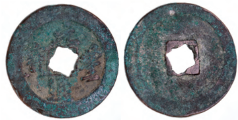
2138* China , Northern Song Dynasty, Shen Zong, (issued 1078-1085), (7.66 g), round three cash, obv, 'Yuan Feng tong bao' with four characters, rev. blank, diameter 30 mm, (Sch.556, cf.TFP 971, Hartill 16. 248), Toning, casting flaw with off centre hole, good very fine and rare. $100