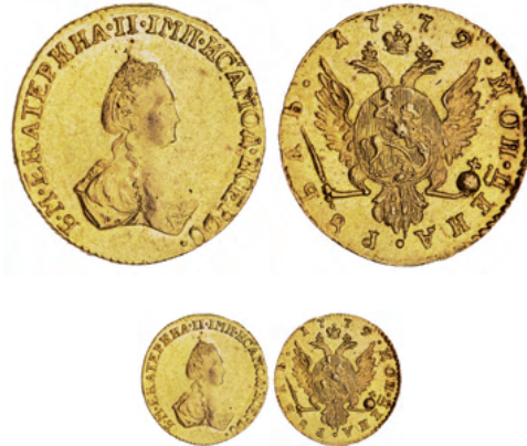
2027* Russia, Catherine II, one rouble, 1779 (KM.C.76). Nearly uncirculated.