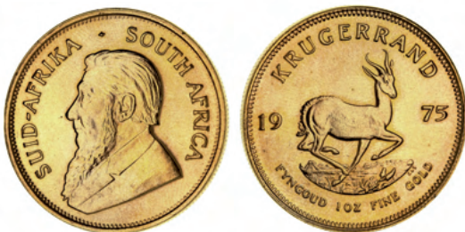
2060* South Africa, Republic, krugerrand, 1975 (KM.73). Uncirculated. (2)