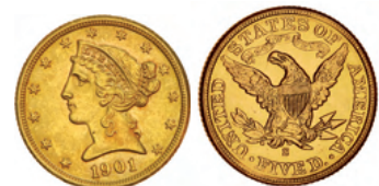
2074* USA, five dollars or half eagle, 1901S, Liberty head. Good extremely fine.