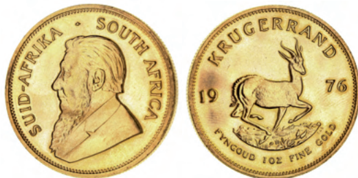
2061* South Africa, Republic, krugerrand, 1976 (KM.73). Uncirculated.