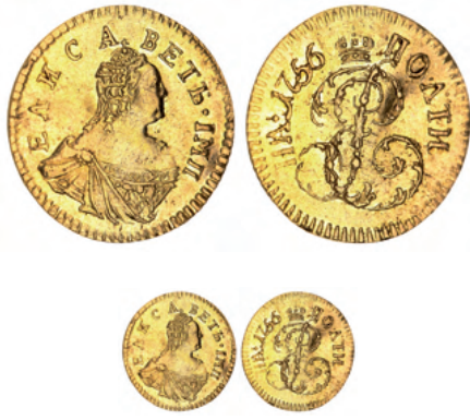
2023* Russia, Elizabeth, fifty kopek, 1756 (KM.C.21). Slight crinkling otherwise extremely fine.