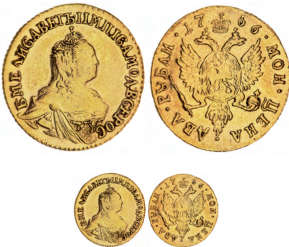
2025* Russia, Elizabeth, two roubles, 1756 (KM.C.23.1). Nearly extremely fine.