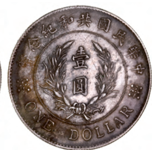
2184* China, Republic, silver dollar, Yuan Shih-Kai, (1914), (26.71 g), founding of Republic (KM.Y322). Toned, probably a modern copy, extremely fine.