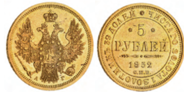
2032* Russia, Nicholas I, five roubles, 1852 (KM.C.175.3). Good very fine.