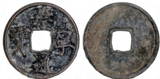
2140* China , Northern Song Dynasty, Zhe Zong, (issued 1101-1125), (9.64 g), round ten cash, obv, 'Chong Ning tong bao' with four characters, rev. blank, diameter 35 mm, (Sch.621, TFP 1040, Hartill 16. 401). Toning, very fine and scarce. $100