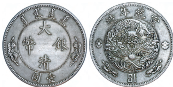
2160* China, Empire, Central Mint of Tientsin, silver dollar, undated (1910) (KM.219). Good very fine and very scarce thus.