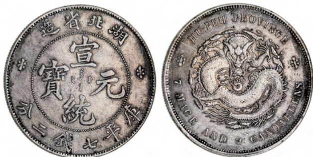
2165* China, Hu Peh Province, silver dollar (1895-1907) (KM. Y127.1) (26.47g). Very fine.