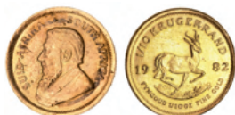
2068* South Africa, Republic, one tenth krugerrand, 1982 (KM.105). Extremely fine or better.