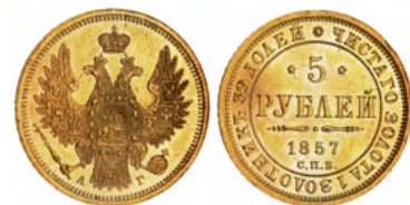
2034* Russia, Alexander II, five roubles, 1857 (KM.Y.A26). Nearly uncirculated.