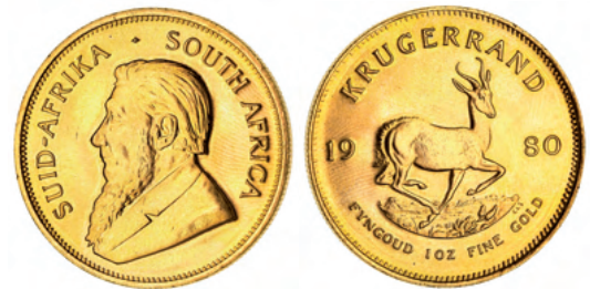
2063* South Africa, Republic, krugerrand, 1980 (KM.73). Uncirculated.