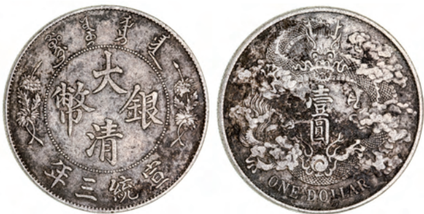
2162* China, Empire, general issue silver dollar Yr3 (1911)(KM. Y31) Republic, Yuan Shih-kai counterfeit silver dollar Yr8 (1919)(KM.Y329.6). Fine-very fine. (3)