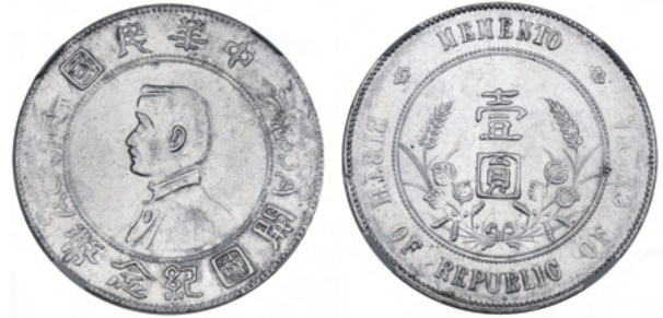
2190* China, Republic, Sun Yat Sen, memento dollar (1927) six pointed star (LIM.49)(KM.Y318a.1). Good extremely fine.