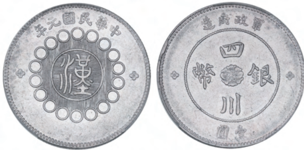
2201* China, Republic, Provincial, Szechuan silver dollar (1912) (KM.Y.456; LM.366). Cleaned otherwise nearly extremely fine.