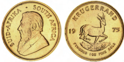
2059* South Africa, Republic, krugerrand, 1975 (KM.73). Uncirculated.