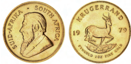
2062* South Africa, Republic, krugerrand, 1979 (KM.73). Uncirculated.