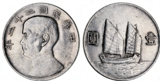
2195* China, Republic, Sun Yat Sen, 'Junk' silver dollar, Yr 22 (1933) (KM.Y345). Extremely fine.