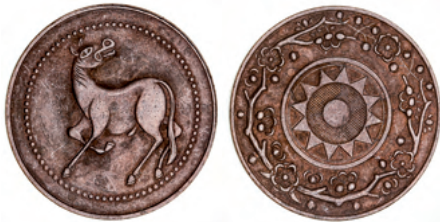
2202* China, Republic, Szechuan Province, 'horse' gaming token in bronze (1912 or later) (cf KM XM125). Good very fine.