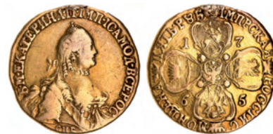
2028* Russia, Catherine II, five roubles, 1765 (KM.C.78.2a). Good fine.