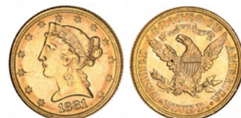
2073* USA, five dollars or half eagle, 1881, Liberty head. Good extremely fine.