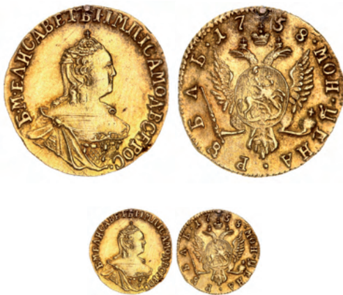
2024* Russia, Elizabeth, one rouble, 1758 (KM.C.22). Adjustment marks on obverse otherwise nearly extremely fine.