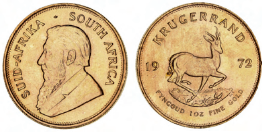
2058* South Africa, Republic, krugerrand, 1972 (KM.73). Light toning in reverse, nearly uncirculated.