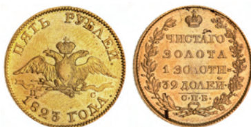
2030* Russia, Alexander I, five roubles, 1823 (KM.C.132). Good very fine.