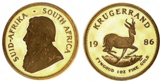
2066* South Africa, Republic, proof krugerrand, 1986 (KM.73). Nearly FDC.