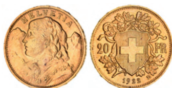
2070* Switzerland, twenty francs, 1922B (KM.35.1). Nearly uncirculated.