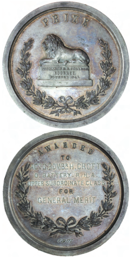
2090* India , prize medal in silver, (56mm) Roorkee, 1907 Tr Acting Bomber H.Croft (P.948.38.9). Beautifully toned, uncirculated.