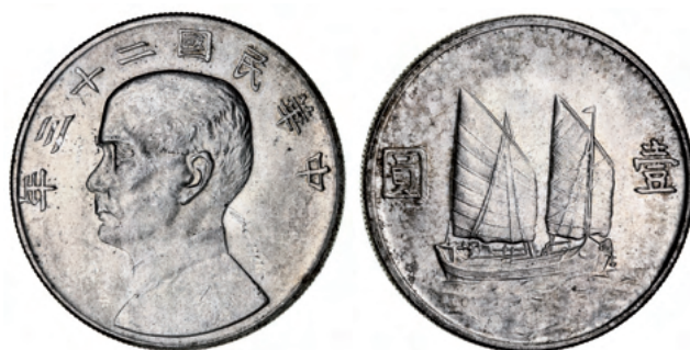
2196* China, Republic, Sun Yat Sen, 'Junk' silver dollar, yr 23 (1934) (KM.Y345). Good very fine/ extremely fine.