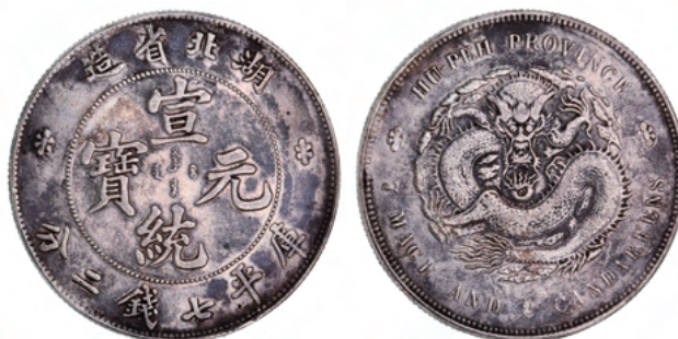
2166* China, Empire, Hu Peh Province, silver dollar (1885-1907) (KM.Y127.1). Toned, good fine.