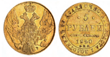
2031* Russia, Nicholas I, five roubles, 1840 (KM.C.175.1). Good very fine.