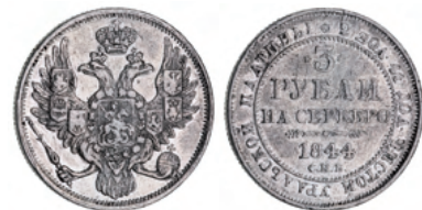
2033* Russia, Nicholas I, platinum three roubles, 1844 (KM.C.177). Very fine/good very fine.