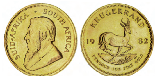
2065* South Africa, Republic, krugerrand, 1982 (KM.73). Uncirculated.