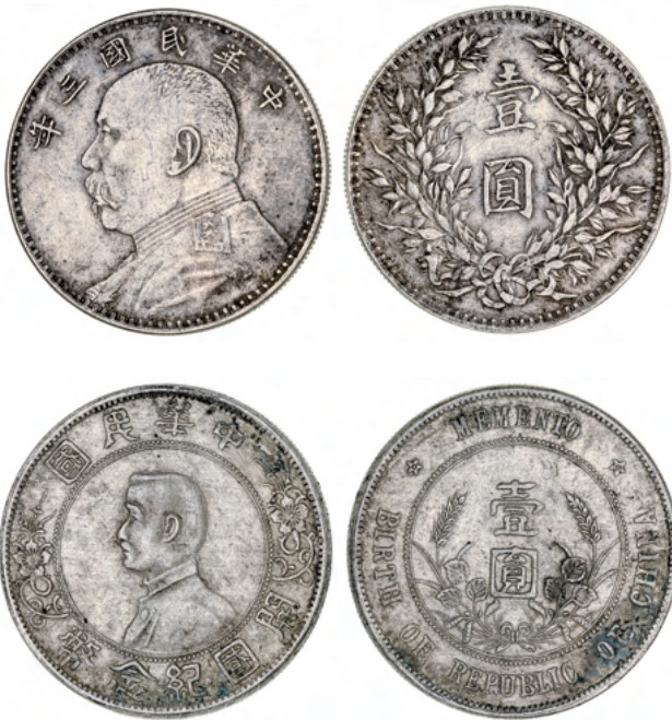
2188* China, Republic, Yuan Shih-Kai silver dollar, Yr3 (1914)(KM.Y329); Sun Yat Sun memento silver dollar (1929)(KM.Y318a.2). Second dusty otherwise both very fine. (2)