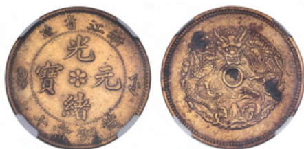
2157* China, Empire, brass ten cash (1903-6)(KM.Y.49a). Cleaned good very fine.