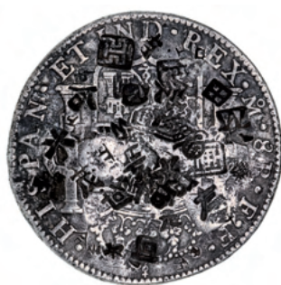
2182* China, and S.E. Asia Chinese chopmark Spanish American dollar or eight reales, Charles III Mexico City mint 1782 F.F. (KM.106.2). Heavily chopped with repeated marking, fine.