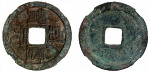
2136* China , Tang Dynasty, Su Zong, (issued 756-762), (4.0 g), round ten cash, obv, 'Qian Yuan zhong bao' with four characters, rev. blank, diameter 30 mm, (Sch.352, cf.TFP 691, Hartill 14.101). Green toning, very fine and rare. $100