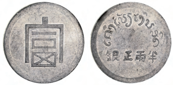
2204* China, Republic, Yunnan province silver half tael (35mm, 18.59g, die axis at 11) straight grained or milled edge, Hanoi mint struck 1943 (KM XI; L&M 434) (cf CNG Sale 124, lot 835). Some mint bloom, good extremely fine, possibly later striking.

In a slab by PCGS as All detail cleaned.