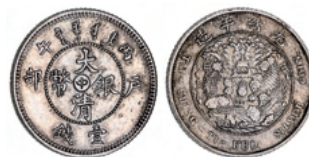
2159* China, Empire, general issue silver ten cents (1906)(2.79g)(cf Kann 937). Nearly extremely fine and rare.