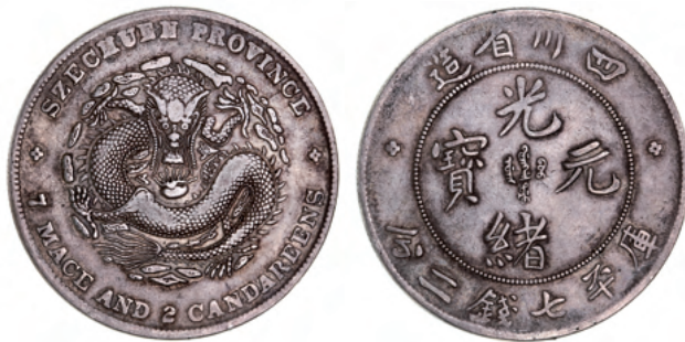
2187* China, various silver dollars, Yuan Shih Kai, year 3 (1914), 10 (1921), (KM.329, 329.6); Junk dollars (2) year 23 (1934) (KM.345); Empire, Szechuen Province, silver dollar, undated (1901-1908), 39.5mm, (26.39g), (KM.Y.238, Kann 145); another Republic, Szechuen Province, silver dollar, undated (1912), 39.5mm, (25.01 g), obv. Chinese characters, 'Chung Hua Min Kuo Nien' rev. flower in centre, (KM.Y.456, Kann 775). Fine - extremely fine. (6)