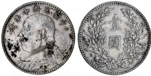
2186* China, Republic, Yuan Shi-Kai, silver dollar, yr 10 (1921) (KM.Y329.6). Very fine.