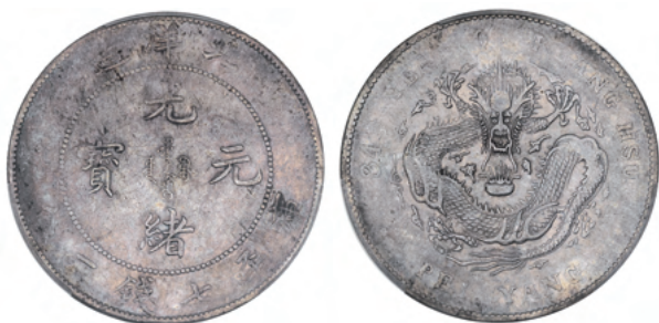
2163* China, Empire, Chihli Province silver dollar (1908)(KM. Y.73.2; LM.465). Cleaned very fine or better.