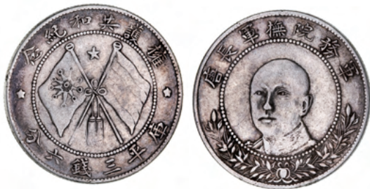
2203* China, Republic, Yunnan Province, silver fifty cents (1917), General T'ang Chi-yao (KM.Y.479). Toned, good very fine.