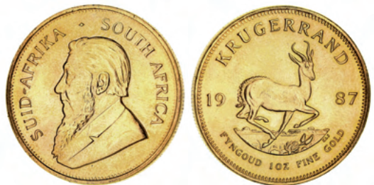
2067* South Africa, Republic, krugerrand, 1987 (KM.73). Uncirculated.