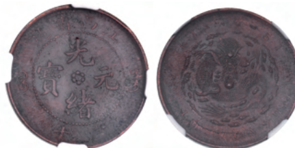
2168* China, Empire, Kiangsi Province, bronze ten cash, (1902) single star, another two stars (KM.Y.152). Good very fine. (2)