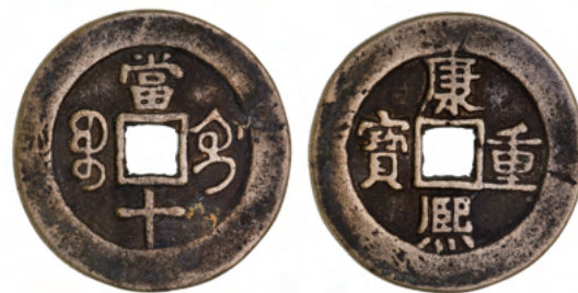
2154* part China , various bronze cash mostly 10 cash from various rulers (8), some as charms (2). Fine - very fine. (11) $150