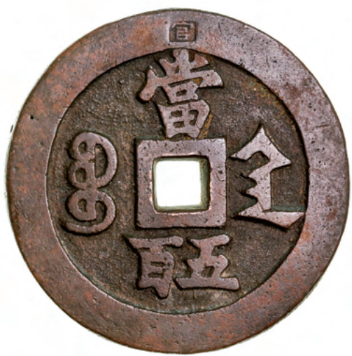
2155* China , Qing Dynasty, Wen Zong (1851-61), 500 cash (1854), Xi'an, Shaanxi (Hartill 22.952, Fisher'Ding 2501). Very fine and rare. $250