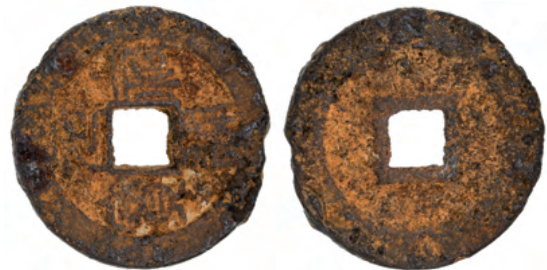
2139* China , Northern Song Dynasty, Zhe Zong, (issued 1086-1100), (13.38 g), round iron ten cash, obv, 'Yuan You tung bao' with four characters, rev. small bao, diameter 34 mm, (Sch.580, TFP 988, Hartill 16.271). Toned with some encrustation, very fine and rare. $100