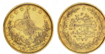
2071* Turkey, Abdul Aziz, one hundred kurush AH 1277, yr 5 (1870)(KM.696). Very fine.