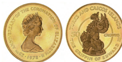
2072* Turks & Caicos Islands, Elizabeth II, proof fifty crowns, 1978, Falcon of Plantagenets (KM.42), White Lion of Mortimer (KM.43). FDC. (2)