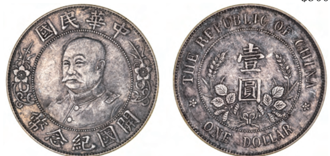
2193* China, Republic, Li Yuan-hung, founding of the Republic, silver dollar (1912) (KM.321.1). Toned, good very fine.