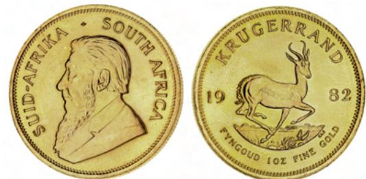
2064* South Africa, Republic, krugerrand, 1982 (KM.73). Choice uncirculated.