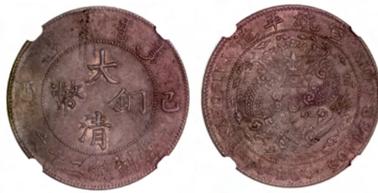
2158* China, Empire, bronze, twenty cash (1909) (KM. ). Brown uncirculated.