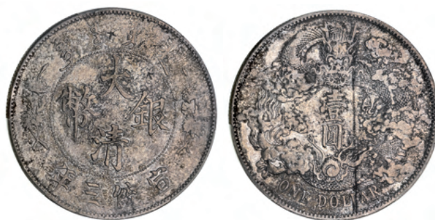
2161* China, Empire, silver dollar, (1911)(KM.Y.31; LM-37) extra flame. Small chopmark on obverse, good fine/very fine.