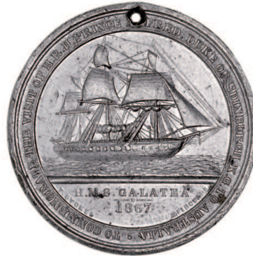
1422* Visit of the Duke Of Edinburgh, H.M.S Galatea, 1867, in white metal (47mm) by T.Stokes, Melbourne (C.1867/2), holed for suspension, obverse with scrolled border. Good very fine.