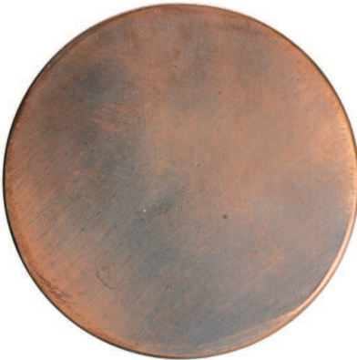
1466* Sydney Harbour Bridge, Opened 19th March 1932 Inaugural Celebrations, uniface of obverse and reverse in copper (51mm) by Amor, made by Christies c1988 (C.1932/5). Good extremely fine. (2)