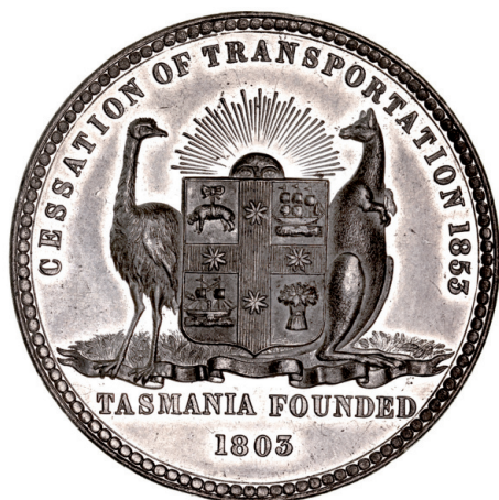
1413* Cessation of Transportation, 1853, in white metal (58mm) (C.1853/2). Good extremely fine.