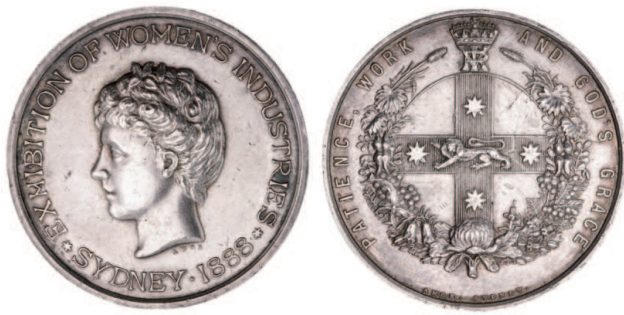
1445* Exhibition of Women's Industries, Sydney, 1888, in silver (39mm) (C.1888/14), by Amor, Sydney. Some edge nicks and surface marks, otherwise very fine.