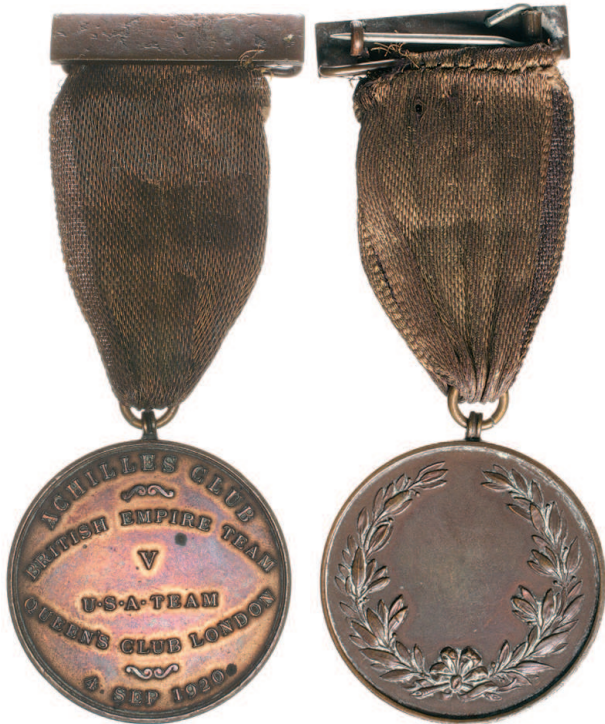
Lot 1469 part