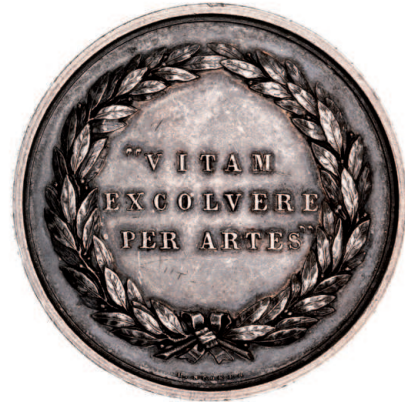
1433* Melbourne International Exhibition MDCCCLXXX (1880) , in silver (51mm) by H. Stokes, inscribed around edge 'W. Simons & Co. Renfrew - Model of Hopper Dredge'. Toned, nearly extremely fine.