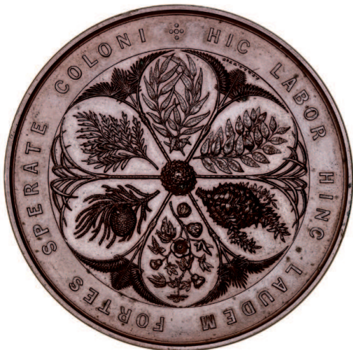
1421* Queensland Exhibition of Colonial Products, 1866, in bronze (63mm) by J.S. & A. B. Wyon. Light spotting on obverse, otherwise nearly uncirculated and rare.