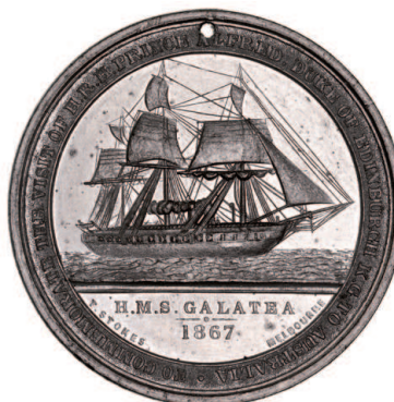
1423* Visit of the Duke Of Edinburgh, H.M.S Galatea, 1867, in white metal (47mm) by T.Stokes, Melbourne (C.1867/2), holed for suspension, obverse with scrolled border. Good very fine.