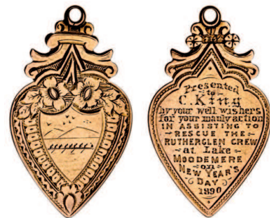
1448* Victoria, handcrafted fob in gold (15ct, 40x23mm, 4.8g) with loop mount, obverse with engraving of rowing team, mountains in background, birds in the sky, inscribed on reverse 'Presented/to/C.King/by your well wishers/for your manly action/in assisting to/rescue the/Rutherghlen Crew/at Lake/Moodemere/on/New Year's/Day/1890'. Good extremely fine.