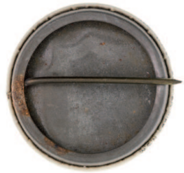
1467* Centenary Air Race, C.W.A.Scott Speed Winner, England to Melbourne, 1934, tinnie badge. Nearly extremely fine and scarce.