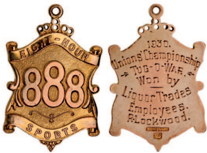
1528* Eight Hour Sports, 1930, in 9 carat gold (16.69g) by Dempster, Tug-O-War won by Liquor Trades Employees/ R. Lockwood. Extremely fine and rare.