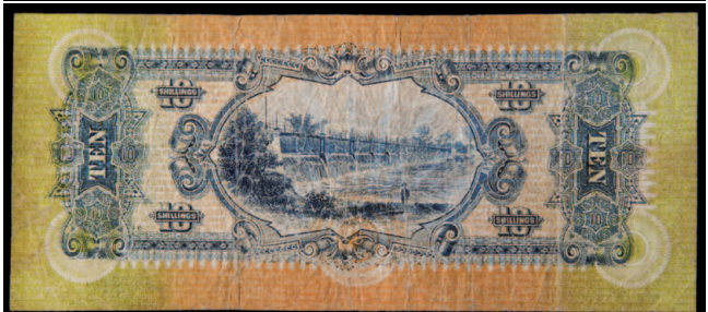
3456* Ten shillings, Collins/Allen (1915) blue serials, N773867 (R.2a). Very good and rare.