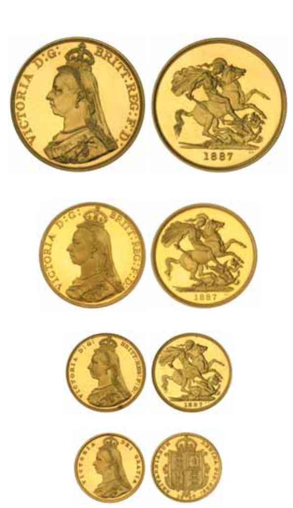
Lot 666 (part)