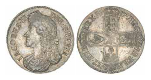
805* James II , silver crown, 1687 (S.3407). Flat spots in strike otherwise grey toned extremely fine. $1,000