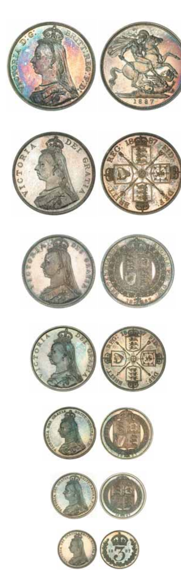
Queen Victoria, Jubilee head, proof set, in gold and silver, from five pounds to threepence, 1887 (S.PS5). Cased set with Imperial arms on cover, silver with delightful steel blue tone, FDC and very rare as a proof set. (11)