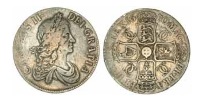
Ex A.J. Morley Collection and Noble Numismatics Sale 77, lot 801.