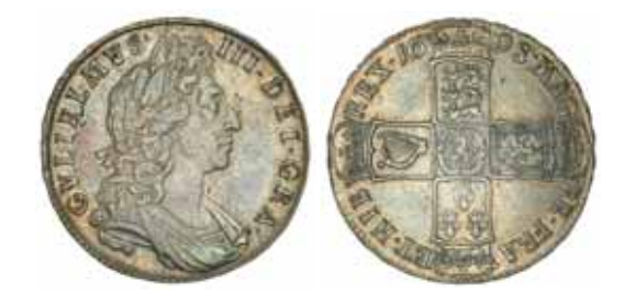
811* William III, first bust, silver halfcrown, 1698 decimo, large shields, (S.3494, ESC 554). Lightly toned, very fine. $350

Ex Glendining's London, May 3, 1978 (lot 131 part).