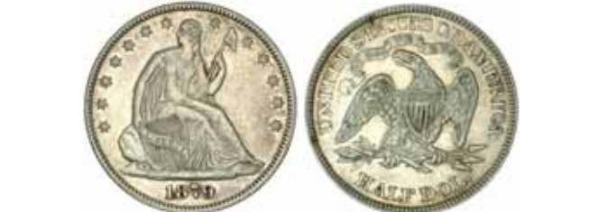
4012* U.S.A. , silver half dollar, Liberty seated type, 1879. Extremely fine and rare. $400