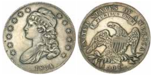
4004* U.S.A. , silver half dollar, capped bust type, 1832 small letters, 1833. Good very fine. (2) $200