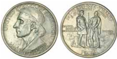
4067* U.S.A. , Daniel Boone Bicentennial, commemorative half dollar, 1935 S. Brilliant, uncirculated and scarce.