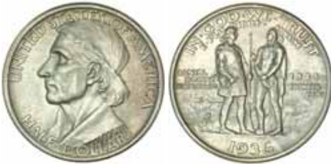
4069* U.S.A. , Daniel Boone Bicentennial, commemorative half dollar, 1936 S. Brilliant, uncirculated and scarce.