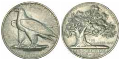
4071* U.S.A. , Connecticut Tercentenary, commemorative half dollar, 1935. Brilliant, nearly uncirculated and very scarce.