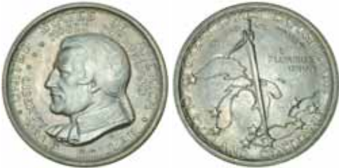
4078* U.S.A. , Cleveland Great Lakes Exposition, commemorative half dollar, 1936. Brilliant, uncirculated and scarce. $200