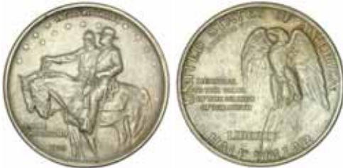
4059* U.S.A. , Stone Mountain Memorial, commemorative half dollar, 1925. Brilliant, uncirculated and scarce. $100