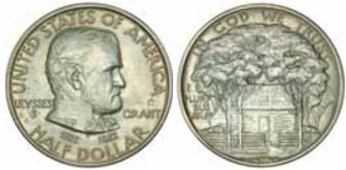
4053* U.S.A., Grant Memorial, commemorative half dollar, 1922, star in obverse field. Brilliant, uncirculated and rare.