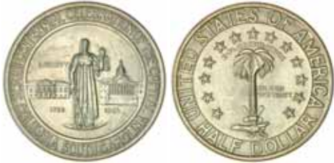
4079* U.S.A. , Columbia, South Carolina Sesquicentennial, commemorative half dollar, 1936. Brilliant, uncirculated and scarce. $200