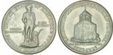
4058* U.S.A. , Lexington-Concord sesquicentennial, commemorative half dollar, 1925. Brilliant, uncirculated and scarce. $120