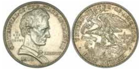
4045* U.S.A., Illinois Centennial, commemorative half dollar, (Lincoln), 1918. Light tone, nearly uncirculated and scarce.