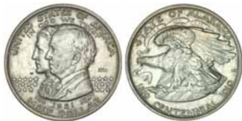
4046* U.S.A., Alabama Centennial, commemorative half dollar, 1920, with 2x2 in obverse field. Brilliant, uncirculated and scarce.