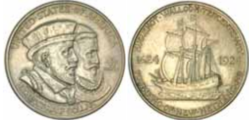
4055* U.S.A., Huguenot-Walloon Tercentenary, commemorative half dollar, 1924. Lightly toned, nearly uncirculated and scarce.