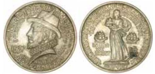
4095* U.S.A., Roanoke Island, North Carolina, commemorative half dollar, 1937. Toned, nearly uncirculated and very scarce.