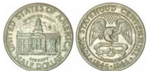
4097* U.S.A., Iowa Centennial, commemorative half dollar, 1946. Brilliant, nearly uncirculated and scarce.