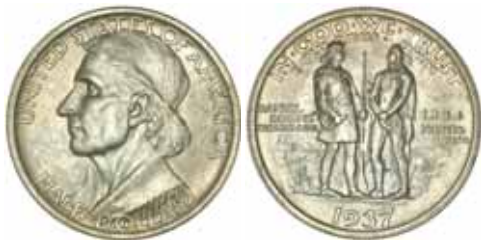
4070* U.S.A. , Daniel Boone Bicentennial, commemorative half dollar, 1937. Brilliant, uncirculated and scarce.