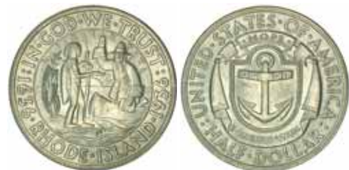
4087* U.S.A. , Providence, Rhode Island Tercentenary, commemorative half dollar, 1936. Brilliant, uncirculated and very scarce. $140