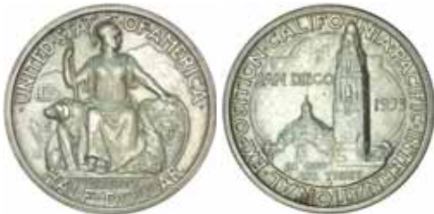
4090* U.S.A., San Diego-California-Pacific Exposition, commemorative half dollar, 1936 S. Brilliant, uncirculated and scarce.