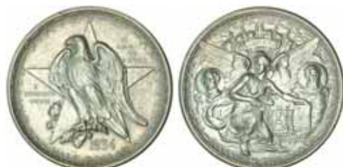
4065* U.S.A. , Texas Centennial, commemorative half dollar, 1934. Brilliant, nearly uncirculated and scarce. $120