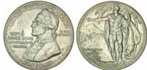
4063* U.S.A. , Hawaiian Sesquicentennial, commemorative half dollar, 1928. Brilliant, uncirculated and very rare. $1,800