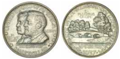
4093* U.S.A., Battle of Antietam, commemorative half dollar, 1937. Brilliant, uncirculated and rare.