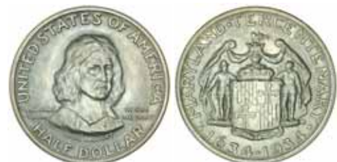
4064* U.S.A. , Maryland Tercentenary, commemorative half dollar, 1934. Brilliant, uncirculated and scarce. $200