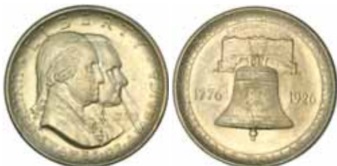
4061* U.S.A. , Sesquicentennial of American Independence, commemorative half dollar, 1926. Brilliant, uncirculated and scarce. $140