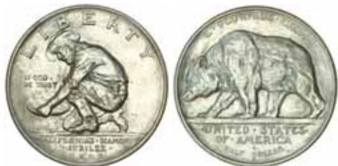
4056* U.S.A., California Diamond Jubilee, commemorative half dollar, 1925 S. Brilliant, uncirculated and very scarce.