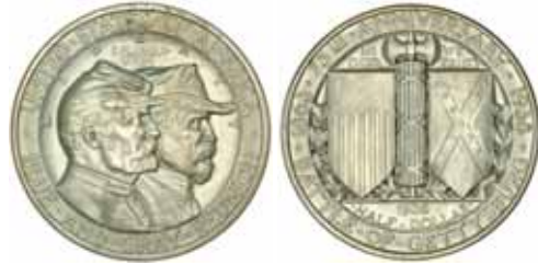
4083* U.S.A. , Battle of Gettysburg, commemorative half dollar, 1936. Brilliant, uncirculated and scarce. $300