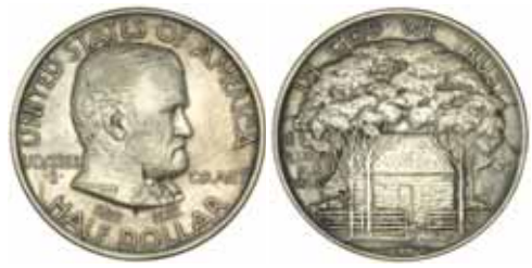
4052* U.S.A., Grant Memorial, commemorative half dollar, 1922, without star in obverse field. Lightly toned, extremely fine and scarce.