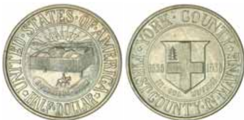
4092* U.S.A., York County, Maine, Tercentenary, commemorative half dollar, 1936. Brilliant, nearly uncirculated and very scarce.