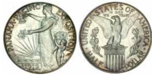
4044* U.S.A., Panama-Pacific Exposition, commemorative half dollar, 1915 S. Light peripheral tone, otherwise brilliant, nearly uncirculated and rare.