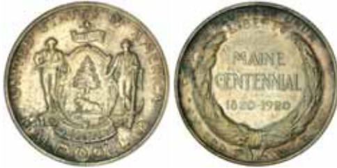
4048* U.S.A., Maine Centennial, commemorative half dollar, 1920. Light peripheral tone, nearly uncirculated and scarce.