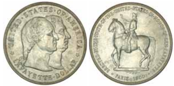
4043* U.S.A., Lafayette, commemorative dollar, 1900. Brilliant, good extremely fine and rare.