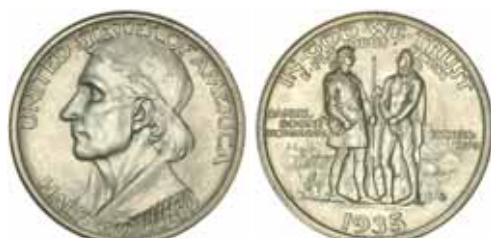
4066* U.S.A. , Daniel Boone Bicentennial, commemorative half dollar, 1935 D. Brilliant, uncirculated and scarce. $150