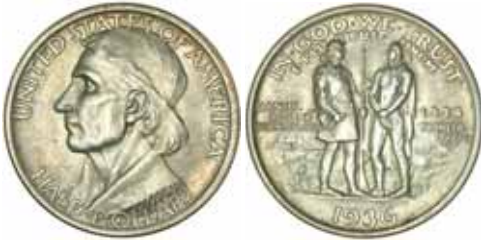
4068* U.S.A. , Daniel Boone Bicentennial, commemorative half dollar, 1936. Brilliant, uncirculated and scarce.