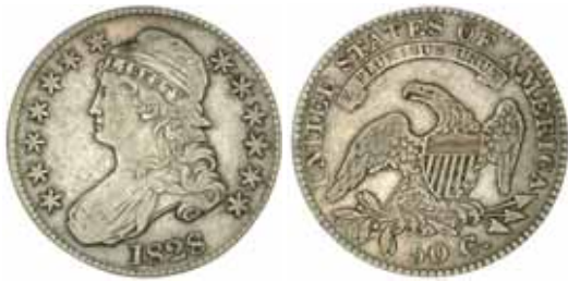
4003* U.S.A. , silver half dollar, capped bust type, 1828 square base 2, small 8, 1831. Very fine; good very fine. (2) $140