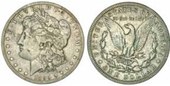
4037* U.S.A., silver dollar, Liberty head or Morgan type, 1895 O. Good fine.