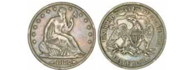
4010* U.S.A. , silver half dollar, Liberty seated type, with arrows 1873. Very fine. $100