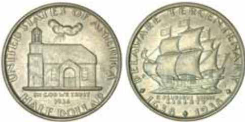
4080* U.S.A. , Delaware, Tercentenary, commemorative half dollar, 1936. Brilliant, uncirculated and scarce. $200