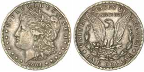
4038* U.S.A., silver dollars, Liberty head or Morgan type, 1896 O (Fair), 1897, 1899 O, 1900 (2), 1903, 1904 S (very fine and scarce), 1921 (2), 1921 D, 1921 S. Unless noted above very fine - uncirculated. (11)