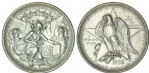
4091* U.S.A., Texas Centennial, commemorative half dollar, 1936 D. Brilliant, uncirculated and scarce.