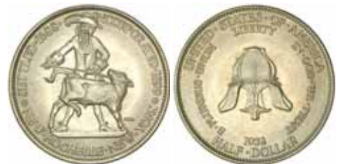
4096* U.S.A., New Rochelle, New York, commemorative half dollar, 1938. Brilliant, uncirculated and very scarce.