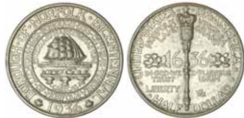
4086* U.S.A. , Norfolk, Virginia bicentennial, commemorative half dollar, 1936. Brilliant, uncirculated and very scarce in this condition. $400