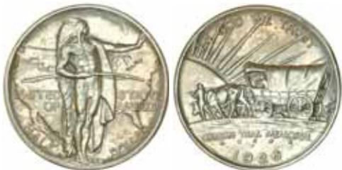
4060* U.S.A. , Oregon Trail Memorial, commemorative half dollar, 1926 S. Brilliant, uncirculated and scarce. $140