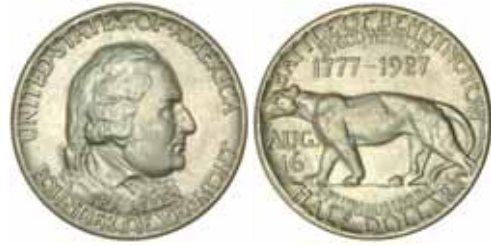
4062* U.S.A. , Vermont Sesquicentennial, commemorative half dollar, 1927. Brilliant, uncirculated and scarce. $250