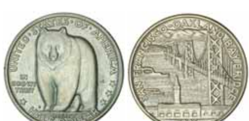
4076* U.S.A. , Bay Bridge San Francisco-Oakland, commemorative half dollar, 1936. Brilliant, nearly uncirculated and scarce.