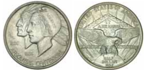
4074* U.S.A. , Arkansas Centennial, commemorative half dollar, 1936 D. Brilliant, uncirculated and scarce.