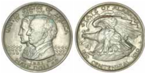
4047* U.S.A., Alabama Centennial, commemorative half dollar, 1920, without 2x2 in obverse field. Brilliant, uncirculated and scarce.