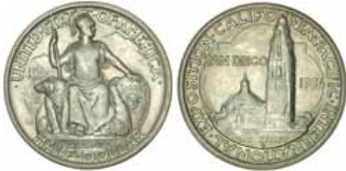
4089* U.S.A., San Diego-California-Pacific Exposition, commemorative half dollar, 1936 D. Brilliant, nearly uncirculated and scarce.