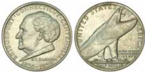
4077* U.S.A. , Bridgeport, Connecticut Centennial, commemorative half dollar, 1936. Brilliant, nearly uncirculated and scarce. $120