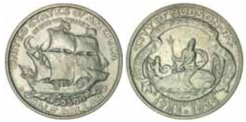
4072* U.S.A. , Hudson, New York Sesquicentennial, commemorative half dollar, 1935. Brilliant, uncirculated and scarce.