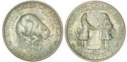
4073* U.S.A. , Albany, New York Charter, commemorative half dollar, 1936. Brilliant, nearly uncirculated and scarce.