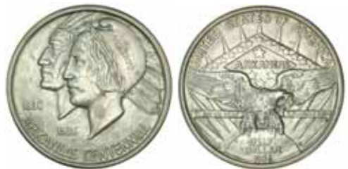
4075* U.S.A. , Arkansas Centennial, commemorative half dollar, 1936 S. Brilliant, uncirculated and scarce.