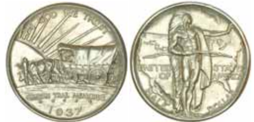
4094* U.S.A., Oregon Trail, Memorial, commemorative half dollar, 1937 D. Brilliant, uncirculated and very scarce.