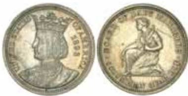
4041* U.S.A., Columbian commemorative quarter dollar, 1893 (Isabella). Lightly toned, good extremely fine and rare thus.