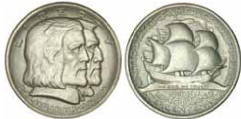
4084* U.S.A. , Long Island Tercentenary, commemorative half dollar, 1936. Brilliant, uncirculated and scarce in this condition. $200