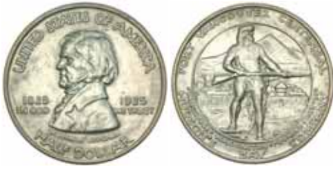
4057* U.S.A. , Fort Vancouver Centennial, commemorative half dollar, 1925. Brilliant, uncirculated and rare. $400