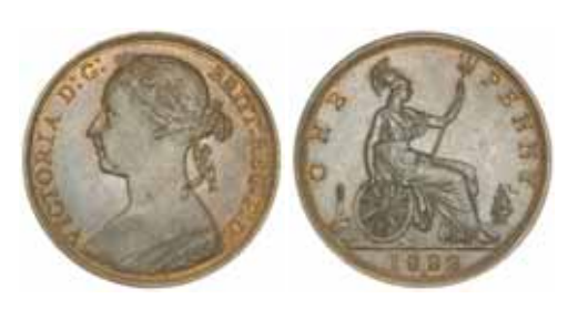
Queen Victoria , bronze pennies, 1879, 1886 (S.3954). Nearly full mint red, good extremely fine - uncirculated. (2) $250