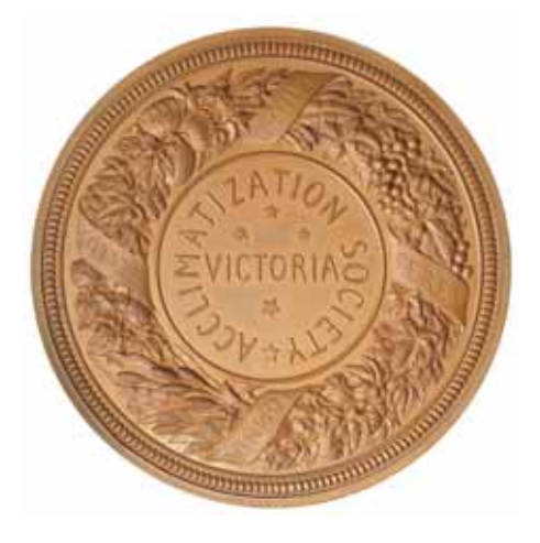
Lot 1217 reverse