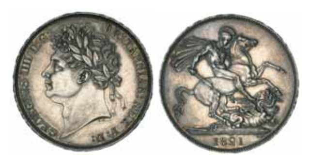
George IV , laureate head, crown 1821, Secundo (S.3805, ESC 246). Light steel-blue tone, good extremely fine. $2,000