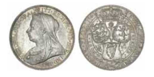
Queen Victoria , old head, florin, 1897, (S.3939). Good extremely fine or better .