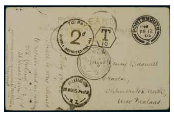
Lot 3710 part