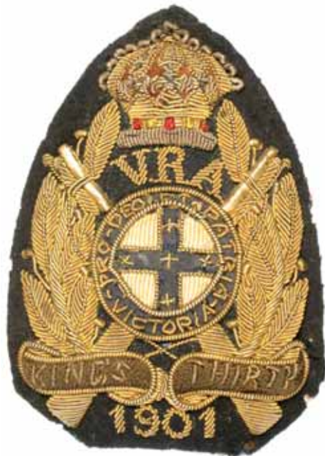
Lot 3524 part