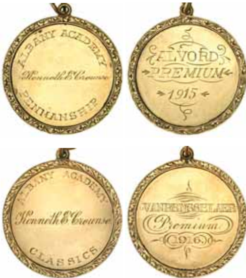
Lot 3423 part