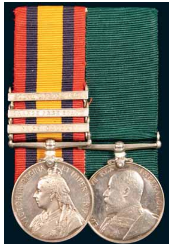
Lot 3627 following page

With large volume of research, including handwritten biography by A.Rudd (22pp), contemporary and modern photographs (many), copies of rolls, family correspondence, geneological research, copies of contemporary newspapers, contingent research, copy of service record (part), marriage certificate, police records.