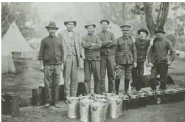
Lot 3471 part