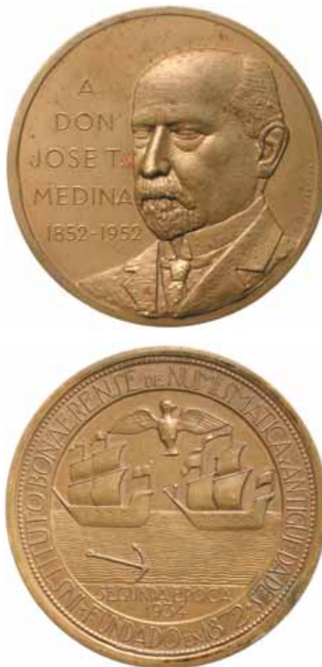
Lot 3412 part