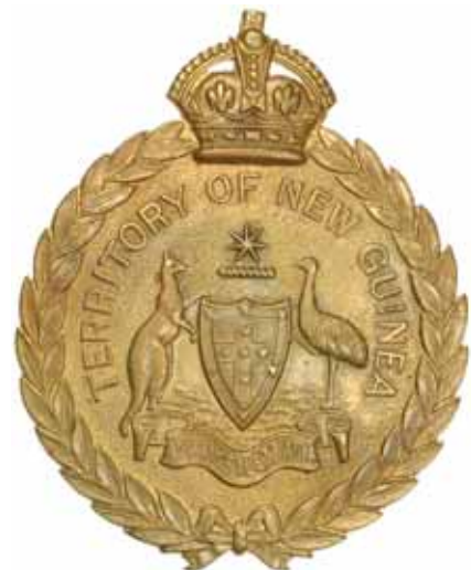
4198* Territory of New Guinea Police Force , Officer's hat badge, King's Crown in brass (62mm x 54mm). Very fine.