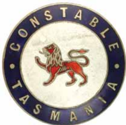
4195* Tasmania , World War II, Constable Tasmania Auxiliary Police, hat badge in silvered brass and enamel (52mm) with No.157 impressed on reverse, by Stokes & Sons Melbourne. Very fine and rare.