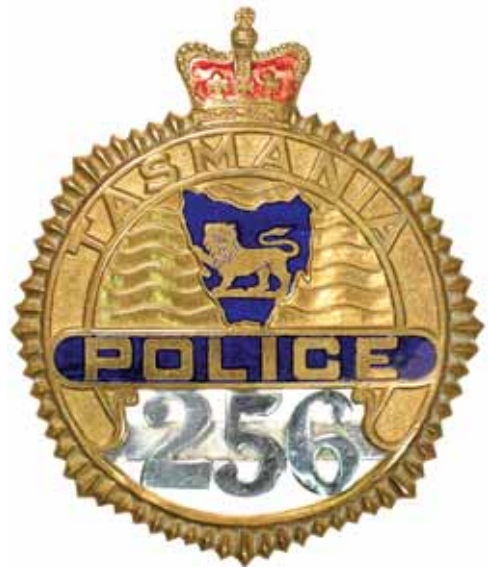
4197* Tasmania Police , 1956 pattern breast badge in gilt and enamel (75mm x 63mm) with numerals 256. Very fine.