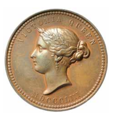
Lot 559 obverse