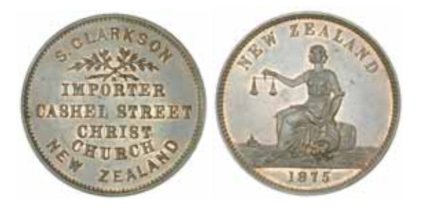
Clarkson , S., Christchurch penny, 1875 (A.68). Choice dark glossy brown with mint red, minor reverse field mark otherwise choice uncirculated and rare in this condition. $700

Comparable to the Lampard specimen in Sale 78b (lot 2639).