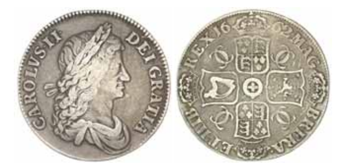
776* Charles II, first bust crown, 1662, edge dated (S.3352). Toned good fine.