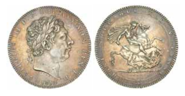
George III , new coinage, crown, 1818, LVIII (S.3787). Nearly extremely fine.