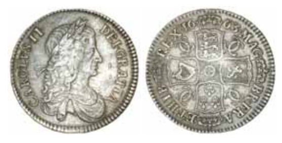
Charles II , first bust halfcrown 1663, A/T in GRATIA (S.3361). Nearly very fine and rare.