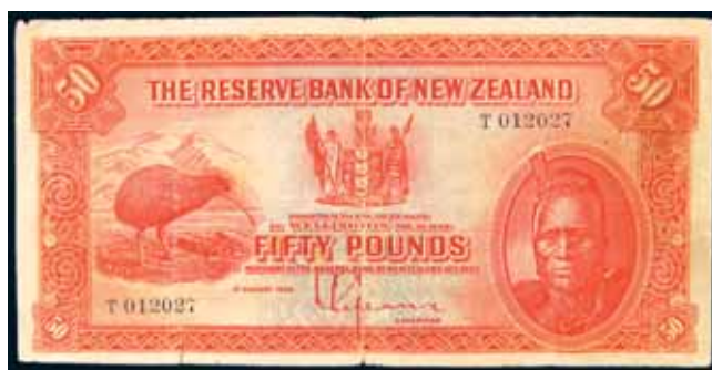
3760* Fifty pounds , 1st August 1934, letter only, T 012027 (L.607; P.157). 12mm tear bottom left, tatty edges and heavy centre fold resulting in small splits in margins, otherwise nearly fine and rare. $3,000