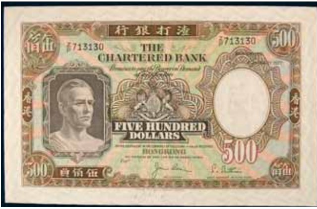
3681* The Chartered Bank , five hundred dollars, 1st January 1977, Z/P 713130 (P.72d; Ma.S42a). Extremely fine. $700