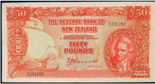
3911* Fifty pounds , number over letter, O/U 231293 (L.616; P.162a). Flattened, nearly very fine and rare. $2,200