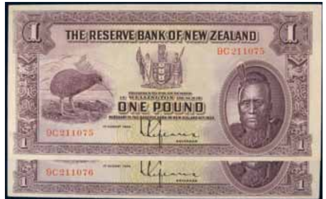
3896* One pound , 1st August 1934, number letter, 9C 21105/6, consecutive pair (L.604; P.155). Three vertical folds, good original body, extremely fine and rare as a pair. (2) $2,500