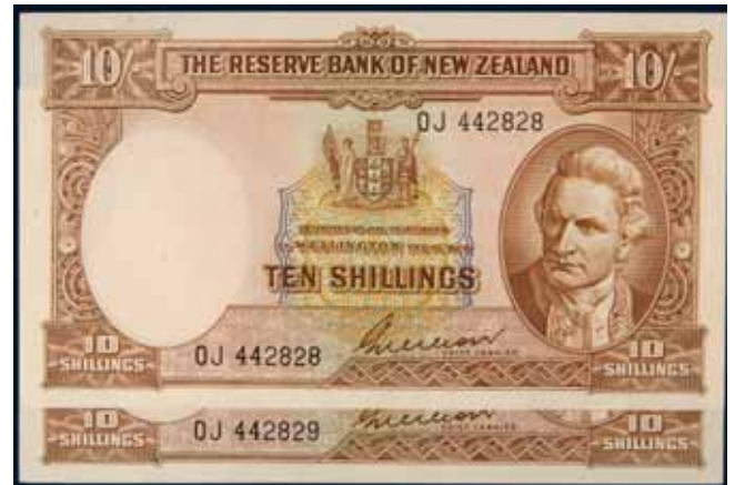
3916* Ten shillings , number letter, OJ 442828/9, consecutive pair (L.618; P.158b). Uncirculated and rare. (2) $800