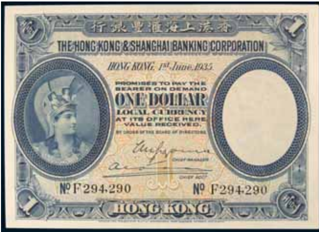
3689* The Hong Kong & Shanghai Banking Corporation , one dollar, 1st June 1935, No. F294,290 (P.172c; Ma.H4). Nearly uncirculated.