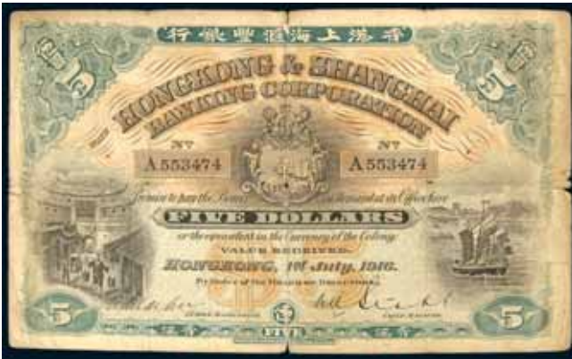
3690* The Hong Kong & Shanghai Banking Corporation , five dollars, 1st July 1916, No. A 553474 (P.166; Ma.H8). Holes and tears at quarter folds, fair and rare.