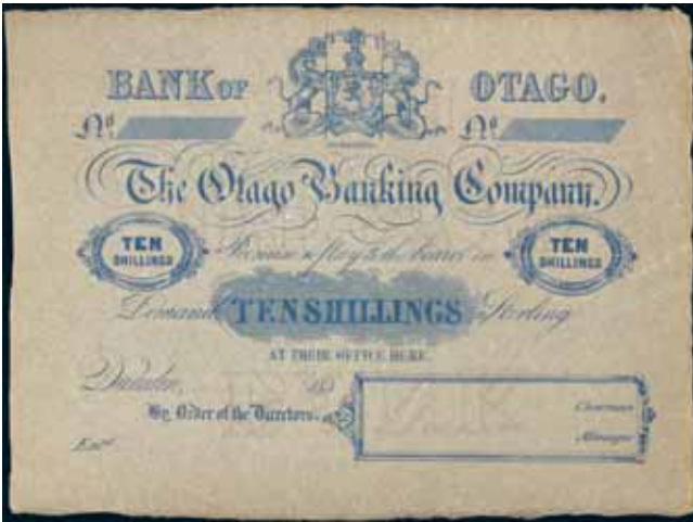
3863* The Otago Banking Company , only issue, ten shillings, Dunedin, undated 185-, not numbered, no imprint, watermark inverted Bank of Otago (Robb.P.T.U.14a; P.S336, Sutherland pp.185 and other pages; Hargreaves pp.65-75). Extremely fine and scarce.