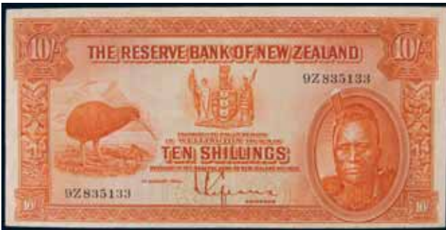
3890* Ten shillings , 1st August 1934, number letter, 9Z 835133 (L.602; P.154). Very fine. $600