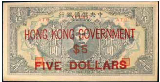
3731* Hong Kong Government , emergency issue, five dollars on one thousand yuan, undated (1945 - old date 1944), overprinted on Central Reserve Bank of China [P.J32] ATQ (P.319; Ma.G17). Light handling marks, otherwise extremely fine or better and rare. $1,000