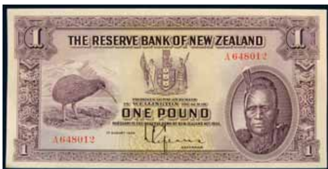
3757* One pound , 1st August 1934, letter only, A 648012 (L.603; P.155). Virtually uncirculated. $1,500