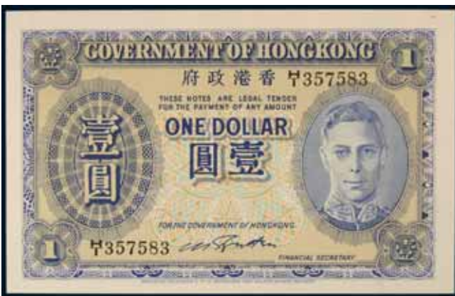
3729* Government of Hong Kong , George VI, one dollar, undated (1940-41) H/1 357583 (P.316; Ma.G12). Uncirculated. $150