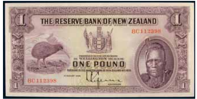
3894* One pound , 1st August 1934, number letter, 8C 112398 (L.604; P.155). Flattened of three folds, extremely fine and scarce. $800