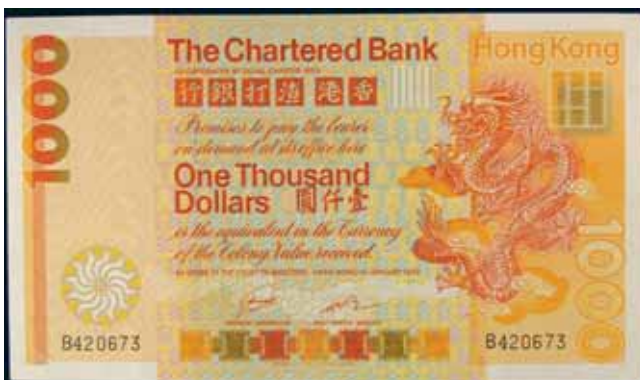
3683* The Chartered Bank , one thousand dollars, 1st January 1982, B420673 (P.81b; Ma.S46). Nearly uncirculated. $400