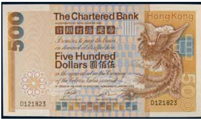
3682* The Chartered Bank , five hundred dollars, 1st January 1982, D121823 (P.80b; Ma.S43). Nearly uncirculated. $200