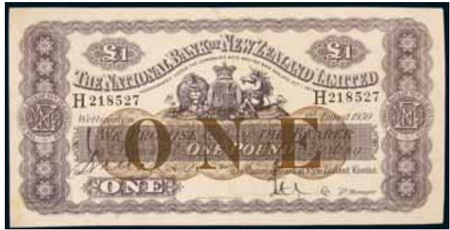
3860* National Bank of New Zealand , uniform issue, one pound, Wellington, 1 August 1930, H 218527, imprint of Perkins, Bacon & Co. Ld. London (Robb.J.82; L.512; P.S317). Light creases, nearly extremely fine.