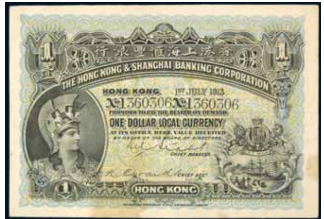
3685* The Hong Kong & Shanghai Banking Corporation , one dollar, 1st July 1913, No. 1360306 (P.155b; Ma.H3). Folds and minor staining, otherwise very fine rare. $600