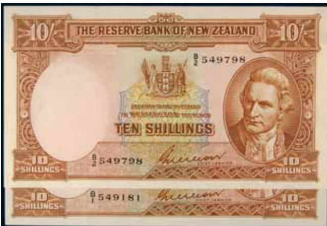
3913* Ten shillings , letter over number, B/1 549181, B/2 549798 (L.618; P.158b). Nearly uncirculated; uncirculated. (2) $500

Two very distinct prefix types, large and small.