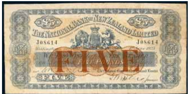
3861* National Bank of New Zealand , uniform issue, five pounds, Wellington, 1st June 1925, J08614, imprint of Perkins Bacon & Co.Ld, London (Robb.J.84; L.513; P.S318). Some discolouration, otherwise good fine and very rare.

Ex Auckland Coin & Bullion Exchange and Noble Numismatics sale 78 (lot 3158).