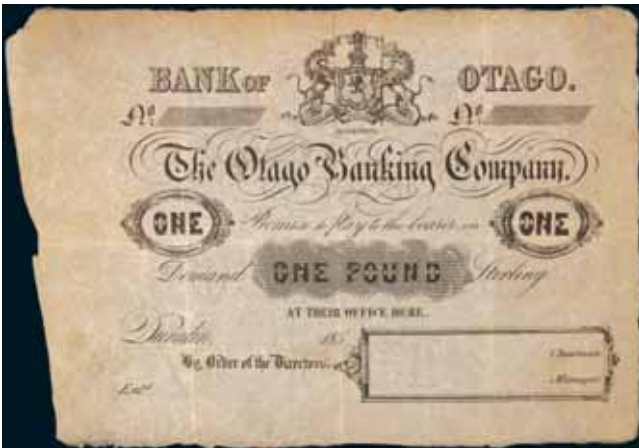
3864* The Otago Banking Company , one pound, Dunedin, 185-, un-numbered and unissued (Robb.P.T.U.14a; P.S337). A full note with left margin at an angle, good fine and rare in this condition.