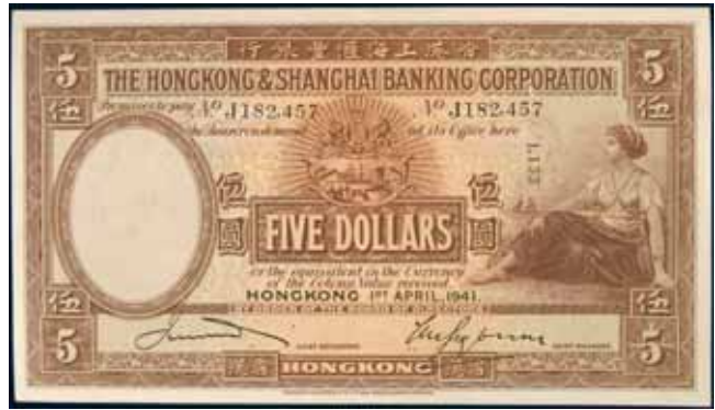
3692* The Hong Kong & Shanghai Banking Corporation , five dollars, 1st April 1941, No. J182,457 (1,133)(P.173c; Ma.H9a). Uncirculated.