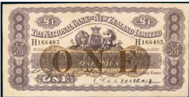
3859* National Bank of New Zealand , uniform issue, one pound, Wellington, 1st August 1930, H 166405, imprint of Perkins, Bacon & Co Ltd., London (Robb.J.82; L.512; P.S317). Good fine.