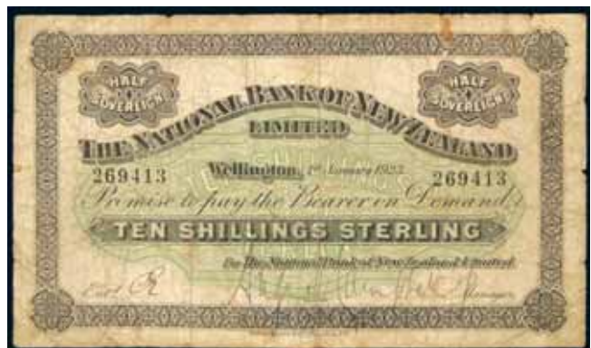
3747* National Bank of New Zealand , third issue, ten shillings, Wellington, 1st January 1923, 269413, imprint of Perkins, Bacon & Co. Ld. London, S.E. (Robb.J.31; L.505; P.S306). Many creases and folds, uneven margins, otherwise very good and rare.