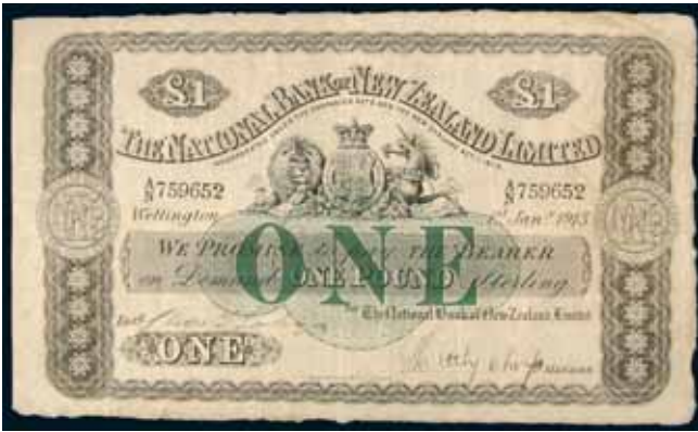
3856* National Bank of New Zealand , fourth issue, one pound, Wellington, 1st Jany. 1913, A/N 759652, imprint of Perkins Bacon & Co Ld London (Robb.J.32; L.506; P.S307). Folded in quarters, otherwise good fine and scarce.