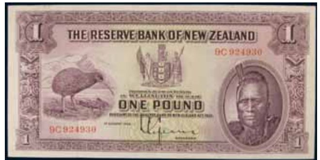
3895* One pound , 1st August 1934, number letter, 9C 924930 (L.604; P.155). Three vertical folds and minor creases, otherwise crisp extremely fine. $1,000