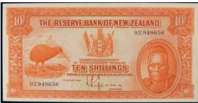
3891* Ten shillings , 1st August 1934, number letter, 9Z 948656 (L.602; P.154). Extremely fine. $1,000