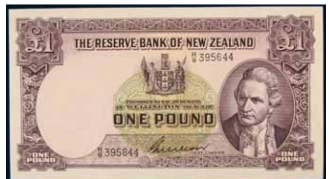
3918* One pound , letter over number, H/9 395644 (L.619; P.159b). Uncirculated and scarce. $350