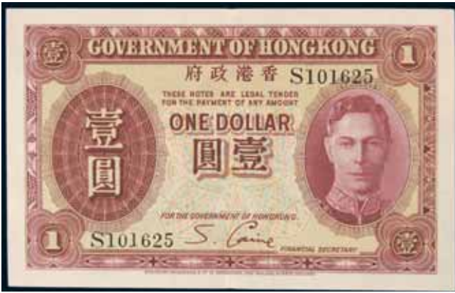
3728* Government of Hong Kong , George VI, one dollar, undated (1936) S101625 (P.312; Ma.G11). Nearly uncirculated. $100