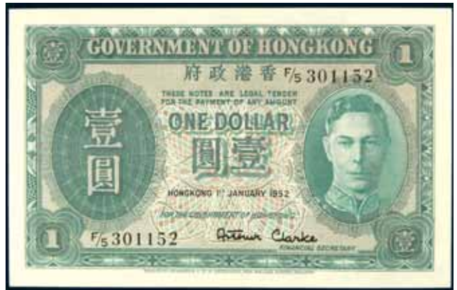
3733* Government of Hong Kong , George VI, one dollar, 1st January 1952, F/5 301152 (P.324b; Ma.G13). Uncirculated. $100