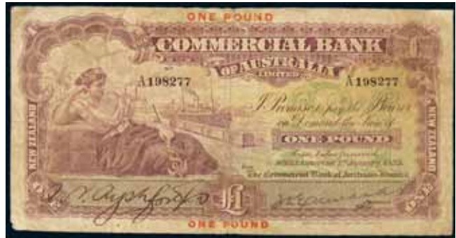
3746* Commercial Bank of Australia , uniform issue, one pound, Wellington, 1st January 1923, A198277 (Robb.H.82; L.485; P.S282). Nearly fine and rare.