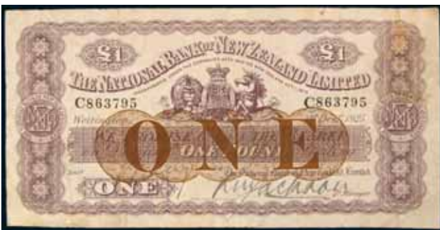
3857* National Bank of New Zealand , uniform issue, one pound, Wellington, 1 Decr.1925, C863795, imprint of Perkins, Bacon & Co. Ld. London (Robb.J.82; L.512; P.S317). Some light toning, nearly very fine and scarce.