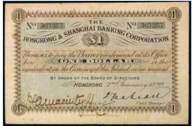
3684* The Hong Kong & Shanghai Banking Corporation , one dollar, 2nd January 1899, No. 367357 (P.136c; Ma.H2). Chinese characters in ink on back, otherwise fine and rare. $1,300