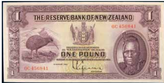
3758* One pound , 1st August 1934, number letter, 6C 456841 (L.604; P.155). Handling crease top right corner, otherwise nearly uncirculated and rare in this condition. $1,200