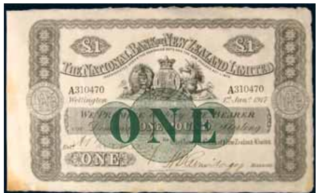
3748* National Bank of New Zealand , third issue, one pound, Wellington, 1st Jan.y 1917, A310470, imprint of Perkins, Bacon & Co. Ld. London (Robb.J.32; L.506; P.S307). Very light creases and folds, slight edge foxing, otherwise nearly extremely fine and scarce.

This is only the second note of this type known to be in private hands. The other example having been sold by us in 1977 (Spink Australia sale 1 [lot 270] and V.B. Short Collection).