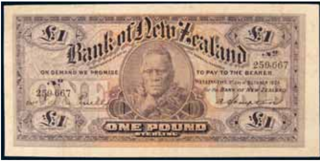
3743* Bank of New Zealand , uniform issue, one pound, Wellington, 1st October 1924, No. 259,667, arched bank name, black serial numbers (Robb.D.821; L.467; P.S233). Flattened of folds, very fine and scarce.