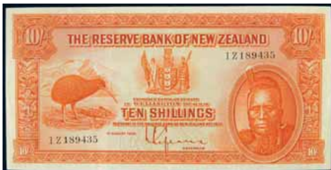
3755* Ten shillings , 1st August 1934, number letter, 1Z 189435 (L.602; P.154). Extremely fine. $1,000