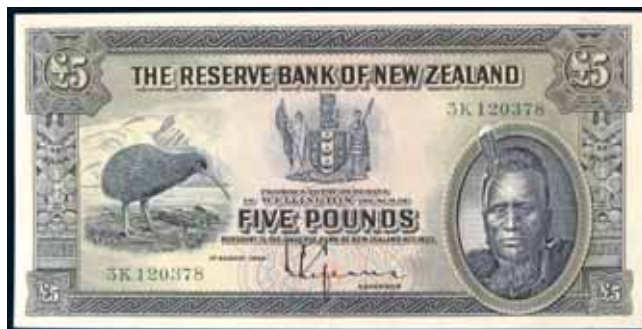
3759* Five pounds , 1st August 1934, number letter, 3K 120378 (L.606; P.156). Uncirculated and very rare in this condition. $2,000