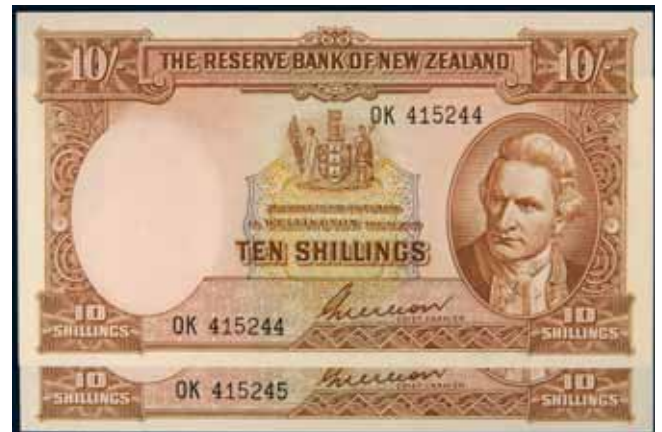
3917* Ten shillings , number letter, OK 415244/5, consecutive pair (L.618; P.158b). Uncirculated and rare. (2) $800