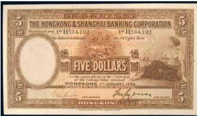
3691* The Hong Kong & Shanghai Banking Corporation , five dollars, 1st January 1938, No. H534,192 (P.173b; Ma.H9). Folded in quarters, nearly extremely fine.