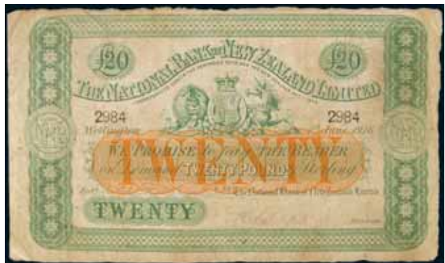
3862* National Bank of New Zealand , third issue, twenty pounds, Wellington, 1 June 1916, 2984, imprint of Perkins, Bacon & Co. Ld. London (Robb.J.36; L.509; P.S310). Creases and light folds, otherwise fine and very rare.