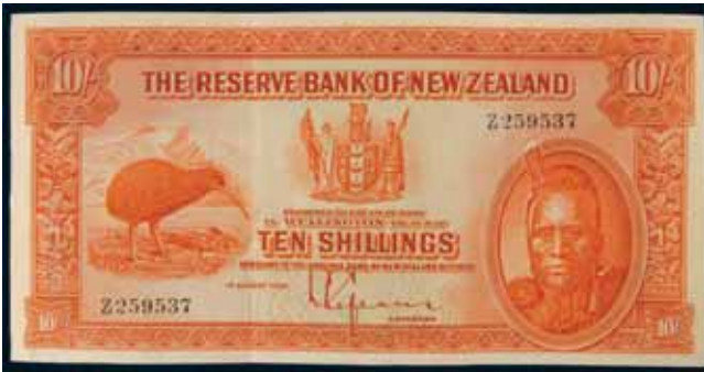
3889* Ten shillings , 1st August 1934, letter only, Z 259537 (L.601; P.154). Nearly extremely fine and the rare first prefix. $1,200