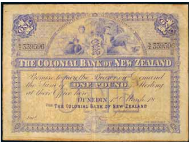
3745* The Colonial Bank of New Zealand , second issue, one pound, Dunedin, 1st March 1891, S/Z 339596, imprint of Bradbury Wilkinson & Co, engravers, London (Robb.G.22; L.558; P.S267e). Folds, some foxing bottom edge, otherwise fine and very rare.