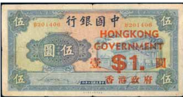
3730* Hong Kong Government , emergency issue, one dollar on five yuan, undated (1941), overprinted on Bank of China [P.93], B201406 (P.317; Ma.G15). Holes and margin splits in quarter folds, otherwise nearly fine and scarce. $100