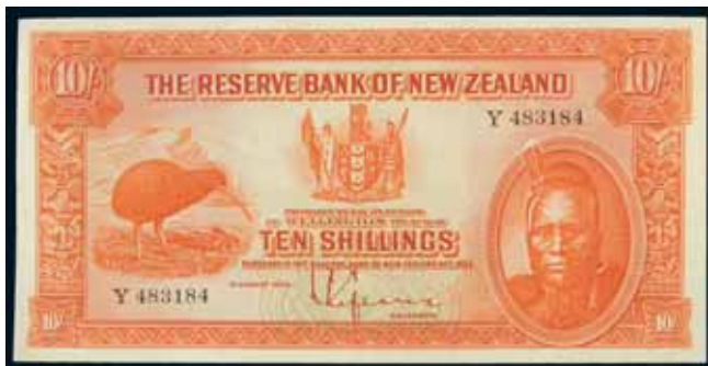
3754* Ten shillings , 1st August 1934, letter only, Y 483184 (L.601; P.154). Uncirculated and very rare in this condition. $2,500