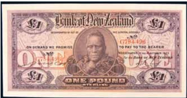
3744* Bank of New Zealand , uniform issue, one pound, Wellington, 1st October 1929, No. G784,496, straight bank name, red serial numbers (Robb.D.821; L.468; P.S234). Good extremely fine and rare in this condition.

An unusually early date. Both Robb and Lampard list the issue as starting in 1924.