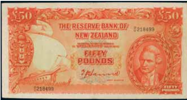
3912* Fifty pounds , number over letter, O/U 218499 (L.616; P.162a). Flattened of folds, three pinholes, good fine. $3,500