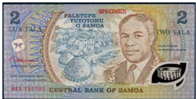
4137* Western Samoa , Central Bank, two tala, specimen note, AAA 000000, overprinted in red on front of note 'SPECIMEN' and on back of note 'SPECIMEN No.0317'. Uncirculated. $250