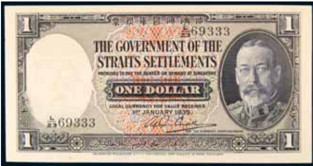
4129* Straits Settlements , The Government of Straits Settlements, one dollar, 1st January 1935 (R.16b). Nearly uncirculated. $120