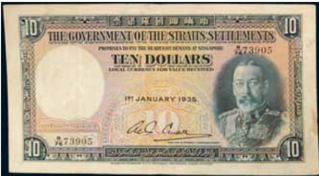
4130* Straits Settlements , ten dollars, 1.1.35, B/76 73905 (P.18b). Slight stain in right margin, very fine. $850