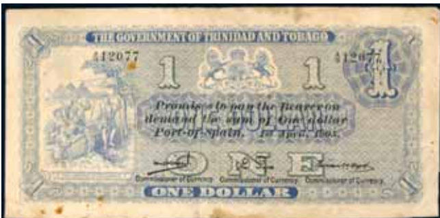
4131* Trinidad and Tobago , British administration, Government of Trinidad and Tobago, one dollar, 1st April 1905, A/18 12077, blue vignette (P.1b). Some tone spots and two tiny tears in bottom margin, otherwise good fine and rare. $400