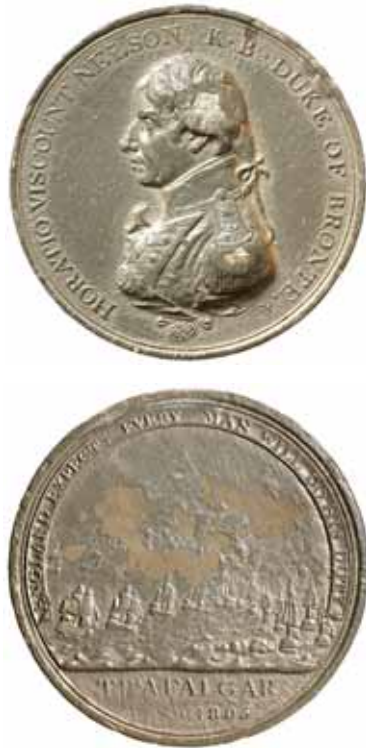
4889* Boulton's Trafalgar Medal 1805. White metal, edge inscription 'To The Heroes Of Trafalgar From M:Boulton'. Very fine.