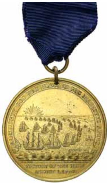
4887* Davison's Nile Medal 1798. Gilt-bronze as issued to Petty Officers. Very fine.