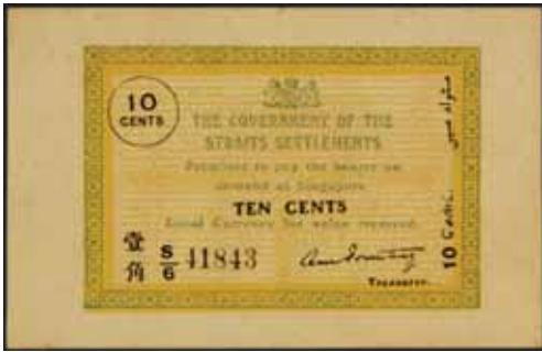
2895* Straits Settlements , ten cents 2.2.1920 (P.6c) Treasurer number S/6 41843. Fresh original note, good extremely fine.