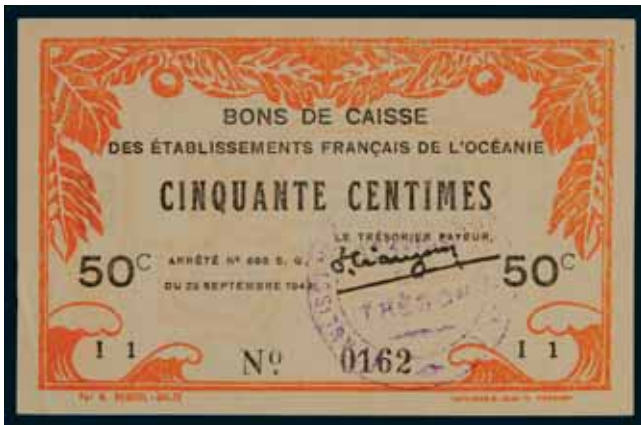
2746* French Oceania , Bons de Caisse, emergency issue, fifty centimes, 25 September 1943, I1 No. 0162, circular violet hand stamp (P.10a). Crease bottom left corner, otherwise extremely fine and rare.