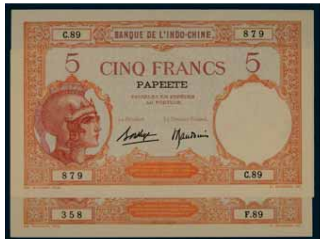
2901* Tahiti , Banque de L'Indo-Chine, Papeete, five francs, undated (1927), C.89 879, F.89 358 (P.11c). Slight handling, good extremely fine. (2)