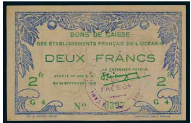
2749* French Oceania , Bons de Caisse, emergency issue, two francs, 25 September 1943, G4 No. 0397, circular violet hand stamp (P.12a). Nearly extremely fine and rare.