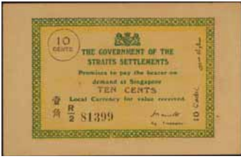
2894* Straits Settlements , ten cents 1.2.1918 (P.6b) Ag Treasurer number R/2 81399. Fresh original note, uncirculated and rare.