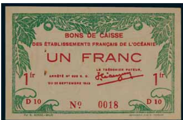
2748* French Oceania , Bons de Caisse, emergency issue, one franc, 25 September 1943, D10 No. 0018, with no circular violet hand stamp or embossed seal (P.11). Two rusty pinholes at left, very fine and very rare.