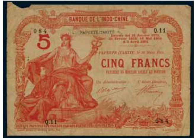
2900* Tahiti , Banque de L'Indo-Chine, five francs, Papeete, 16 March 1914, overprint PAPEETE(TAHITI) in black, Q11 084 (P.1b). Many pinholes, piece out of top margin, good and rare.