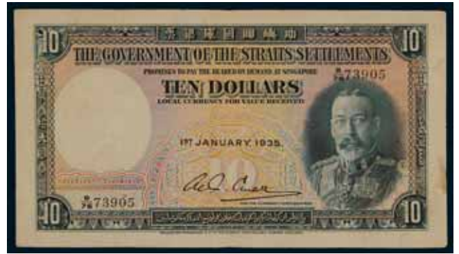
2899* Straits Settlements , ten dollars, 1st January 1935 (P.18b), number B/76 73905. Small edge stain spot, otherwise very fine.