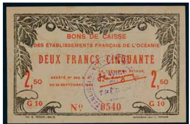
2751* French Oceania , Bons de Caisse, emergency issue, 2.5 francs, 25 September 1943, G10 No. 0540, circular violet hand stamp (P.13a). Good very fine and rare.