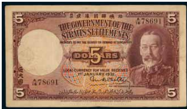
2898* Straits Settlements , five dollars 1st January 1931 (P.17a) number A/16 78691. Fresh and original, very fine and rare.