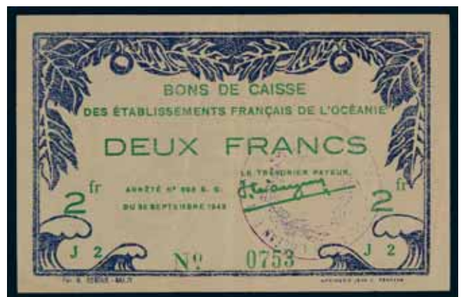
2750* French Oceania , Bons de Caisse, emergency issue, two francs, 25 September 1943, J2 No. 0753, wreath in circular violet hand stamp (P.12b). Extremely fine and rare.