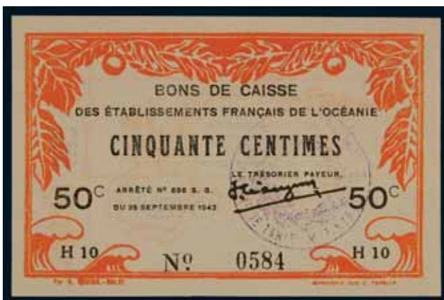
2747* French Oceania , Bons de Caisse, emergency issue, fifty centimes, 25 September 1943, H10 No. 0584, wreath in circular violet hand stamp (P.10b). Nearly uncirculated and rare.