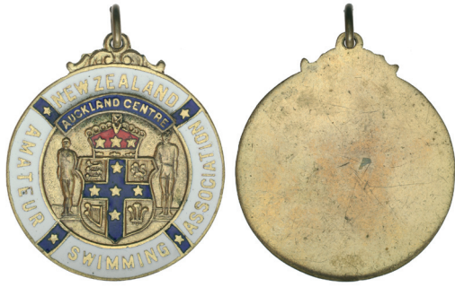
3685* New Zealand Amateur Swimming Association, Auckland Centre, c1920s, fob medal, uniface, struck in gilt and enamel (35x32mm), no maker, ring top suspension. Extremely fine.