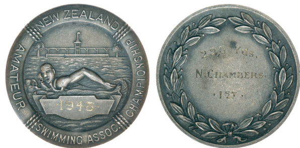
lot 3715 part