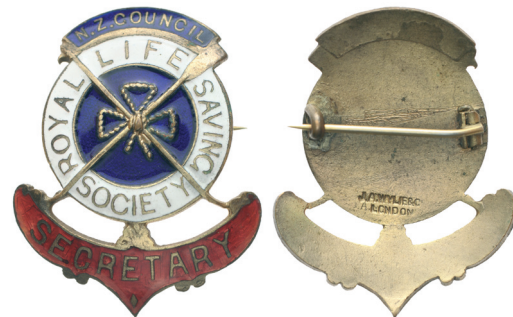
3687* Royal Life Saving Society, N.Z.Council, c1920s, Secretary's badge in gilt and enamel (42x32mm), by J.A.Wylie & Co, London, pin-back. Extremely fine.