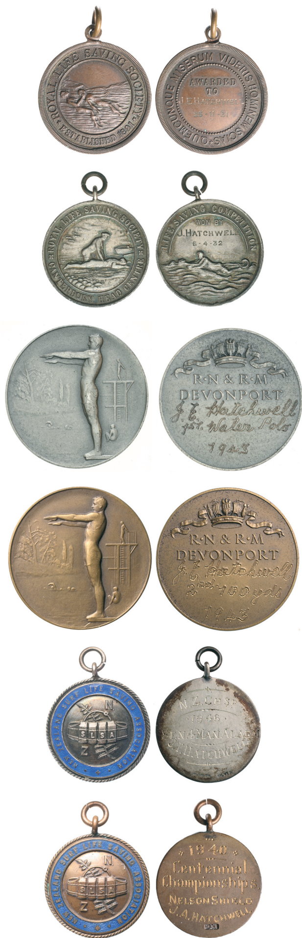
lot 3701 part