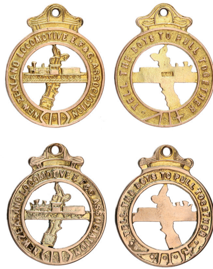
3769* New Zealand Locomotive E.F. & C. (Engineers, Firemen & Cleaners') Association, c1915, membership fob medal, struck in voided gold (9ct, 6.0g, 32x26mm), no maker, ring top suspension, unnamed; another as last, a cruder strike from different dies, struck in gold (probably 9ct, 7.4g, 32x25mm), no maker, unnamed. Extremely fine; nearly very fine. (2) $700