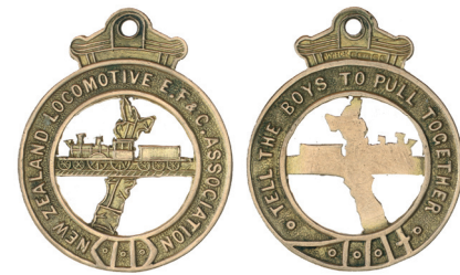
3770* New Zealand Locomotive E.F. & C. (Engineers, Firemen & Cleaners') Association, membership fob medal, struck in voided gold (9ct, 6.2g, 26mm), by WHH, hallmark for Birmingham 1915, ring top suspension, unnamed. Extremely fine. $450