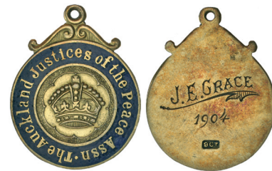
3741* The Auckland Justices of the Peace Assn., fob medal struck in gold (9ct, 6.2g, 25mm) and blue enamel, no maker, ring top suspension, reverse inscribed 'J.E.Grace/1904'. Good very fine.