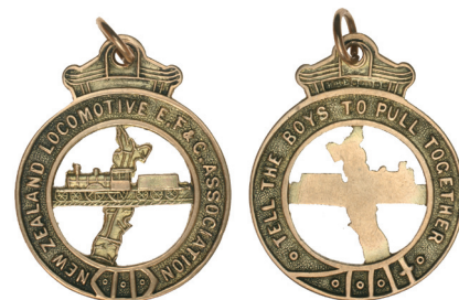
3771* New Zealand Locomotive E.F. & C. (Engineers, Firemen & Cleaners') Association, membership fob medal, struck in voided gold (9ct, 6.2g, 26mm), by WHH, hallmark for Birmingham 1915, ring top suspension, unnamed. Extremely fine. $450