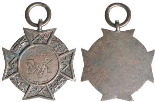
3738* New Zealand Empire Veterans Association, Cross, c1900, uniface, struck in bronze (31mm), by A.Kohn, Auck., ring top suspension, uninscribed on reverse (O&D.129). Fine.