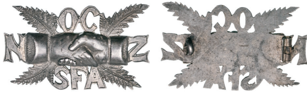
3737* N.Z.O.C.S.F.A., c1890, handcrafted badge in silver (37x20mm), no maker, pin-back (pin missing). Toned, very fine.