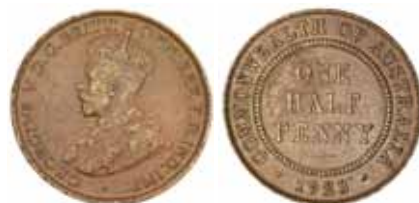
494* George V, 1923. Porous, edge nicks, fine. $1,000