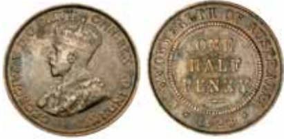
488* George V, 1923. Blue grey brown toned with diagnostic die breaks, good fine. $1,250