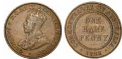
492* George V, 1923. Small cut or scratch through cheek, cleaned and retoned otherwise fine. $1,000