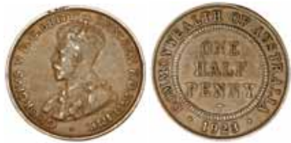
489* George V, 1923. Dull red brown toned good fine with peripheral die-break on reverse only. $1,250