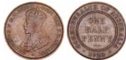
493* George V, 1923. Porous surface (acid cleaned), otherwise nearly very fine. $1,000