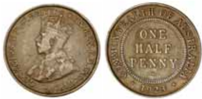
487* George V, 1923. Scratch behind neck, good fine. $1,500