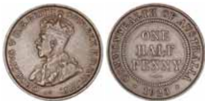
490* George V, 1923. Glossy brown patina, good fine. $1,250