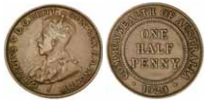
491* George V, 1923. Even brown patina, fine. $1,250