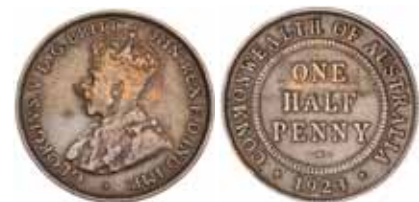
496* George V, 1923. Diagnostic die breaks on both obverse and reverse, otherwise fine. $750