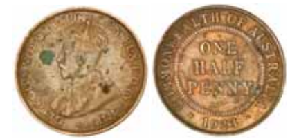
495* George V, 1923. Spotted on obverse, cleaned, otherwise fine. $900